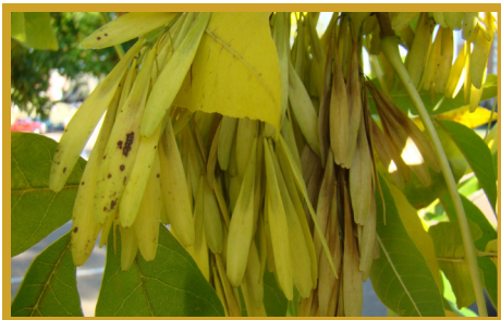
Figure 13. Seeds on ash trees are paddle-shaped.