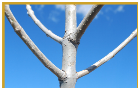
Figure 15. Branches and buds on ash trees grow in pairs, directly opposite from each other.