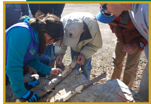
Figure 23. A CSFS forester and CSU Extension specialist assess the branch of an ash tree to determine the presence of EAB.

The decision to chemically treat individual ash trees is a personal preference, and consumers should educate themselves and use caution when purchasing products that claim to protect trees against the pest. Homeowners may opt to periodically apply insecticide treatments to help protect high-value trees; however, the early presence of EAB in Colorado may not warrant immediate preventive treatments in communities where EAB has not been detected. The closer ash trees are to an area of known infestation, the higher the risk that they will become infested by EAB through natural spread. Also, trees within or near the EAB Quarantine area are at a higher risk of infestation through human-assisted spread of the pest, because infested