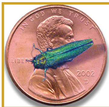
Figure 8. Adult beetles can fly approximately a half-mile to infest a new tree.