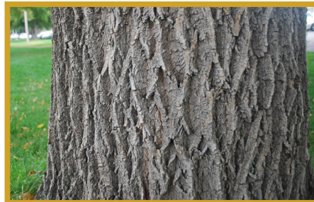
Figure 12. The bark on mature ash trees has diamond-shaped ridges.