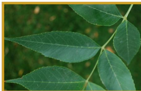
Figure 14. Ash leaves can either have smooth or finely toothed edges.