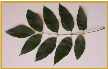
Figure 11. Ash trees have five to nine leaflets on each stalk.