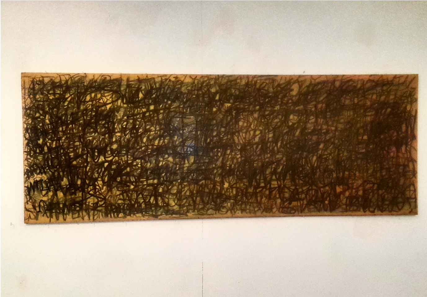
Figure 8: The Long-Ass Day: ACT II