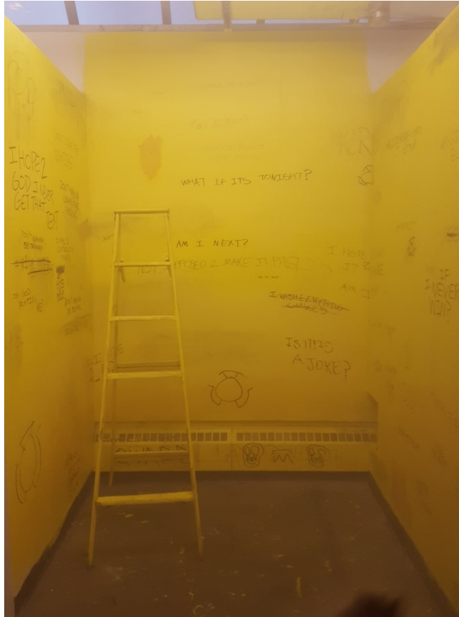
Figure 6: SINESTRO