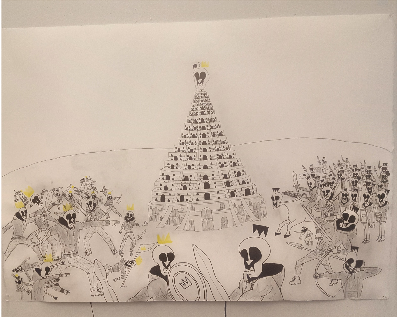
Figure 3: The Big- Ass Epilogue