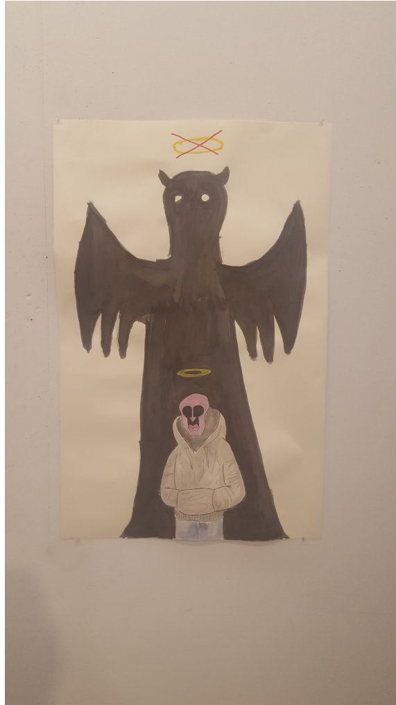
Figure 2: The Big-Ass Debacle