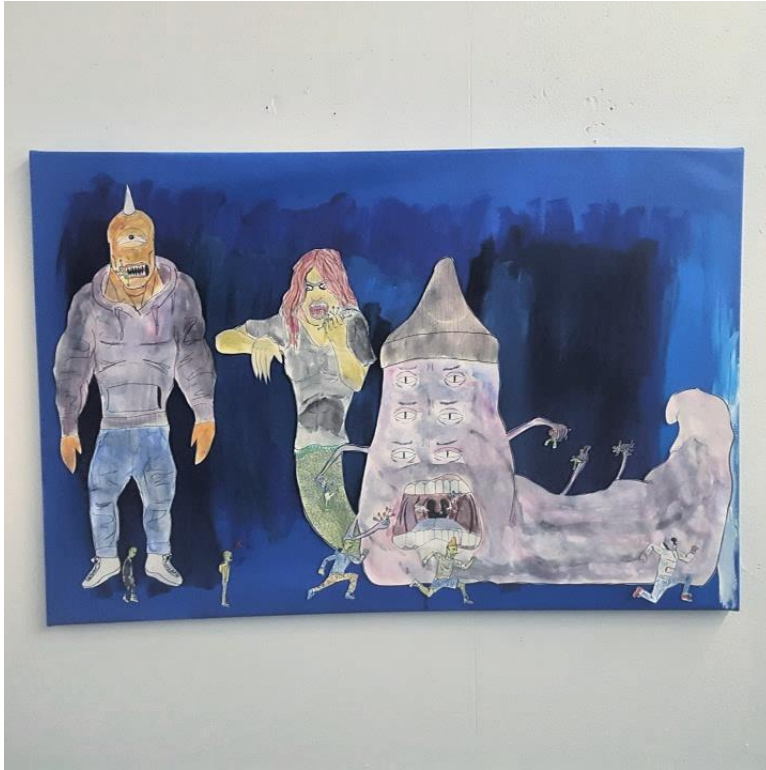
Figure 1: The Big-Ass Prelude