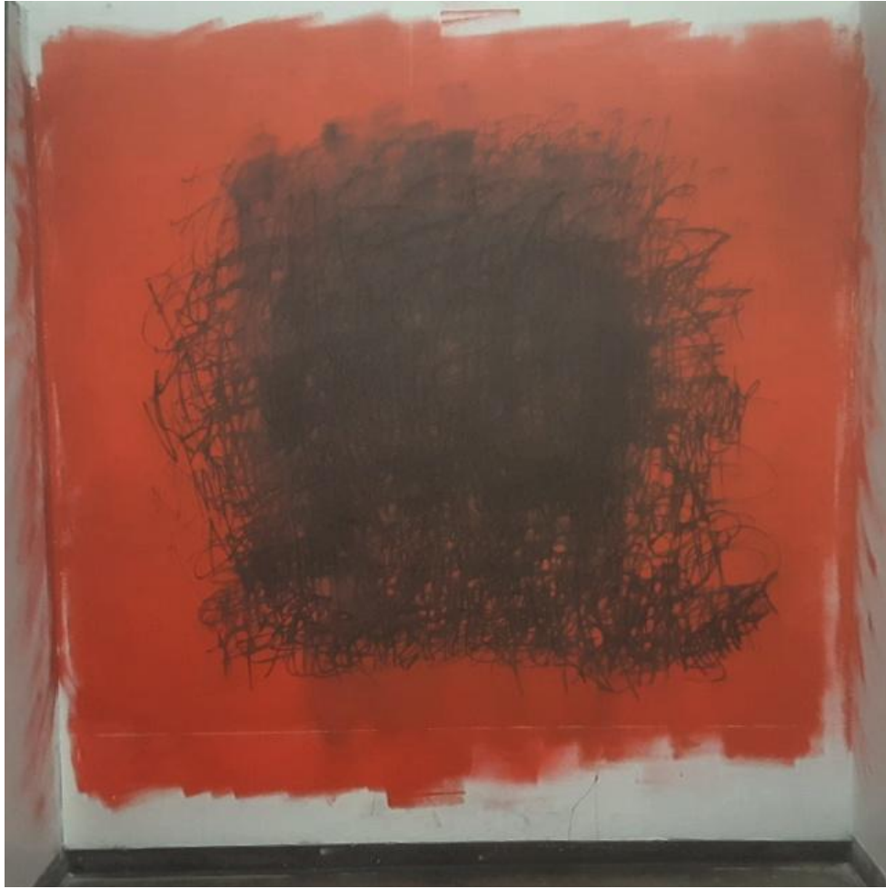
Figure 4: RAGE