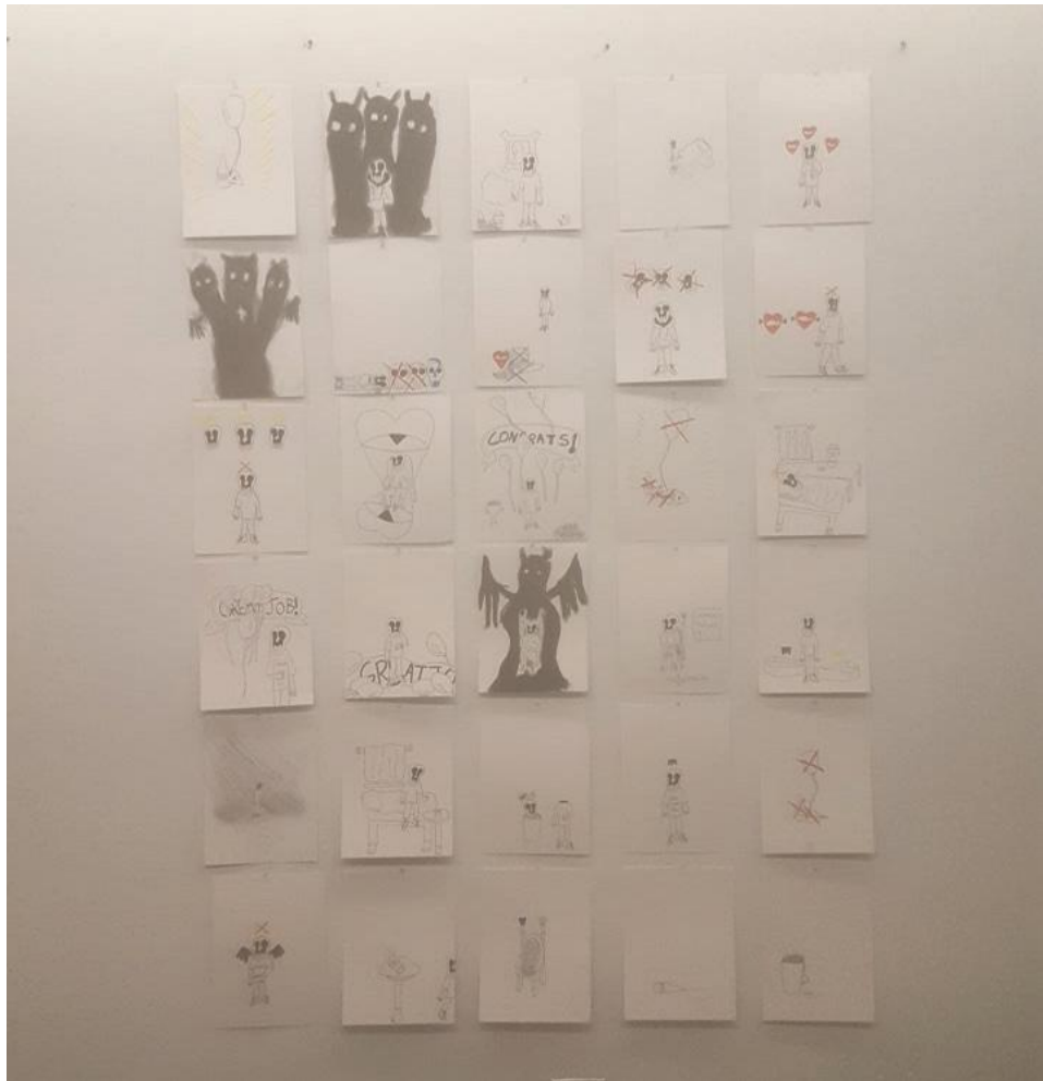
Figure 5: LONELY