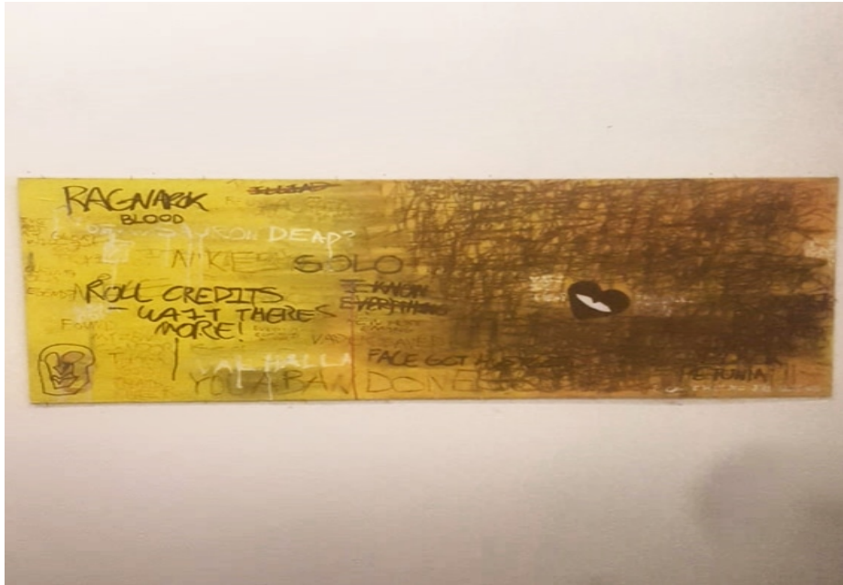
Figure 7: The Long-Ass Day: ACT I