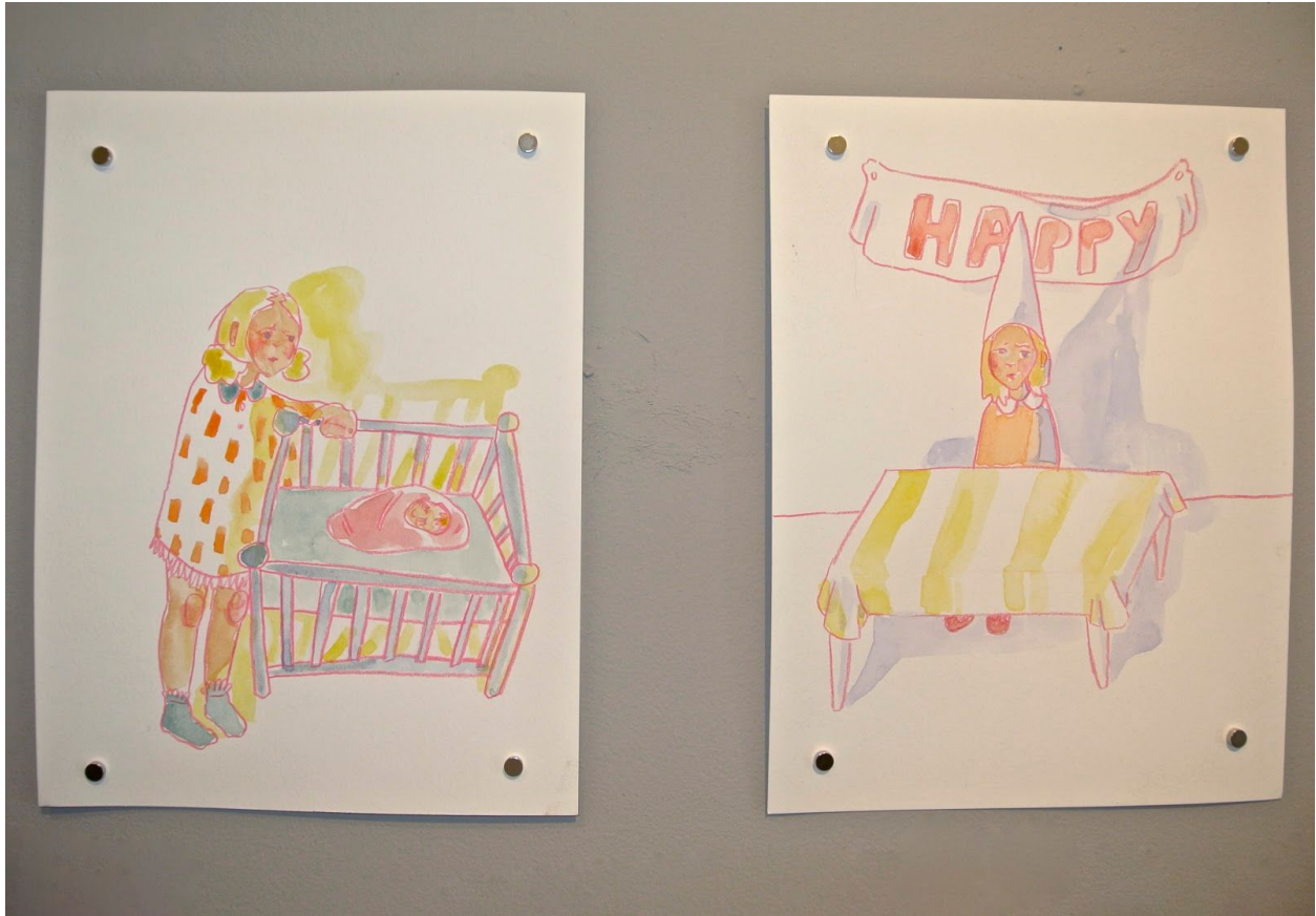
Figure 10: Empty Rituals (detail)