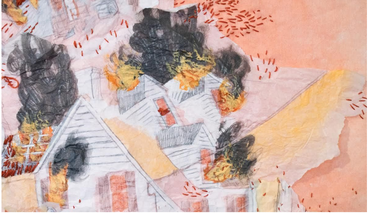
Figure 6: Fireside (detail)