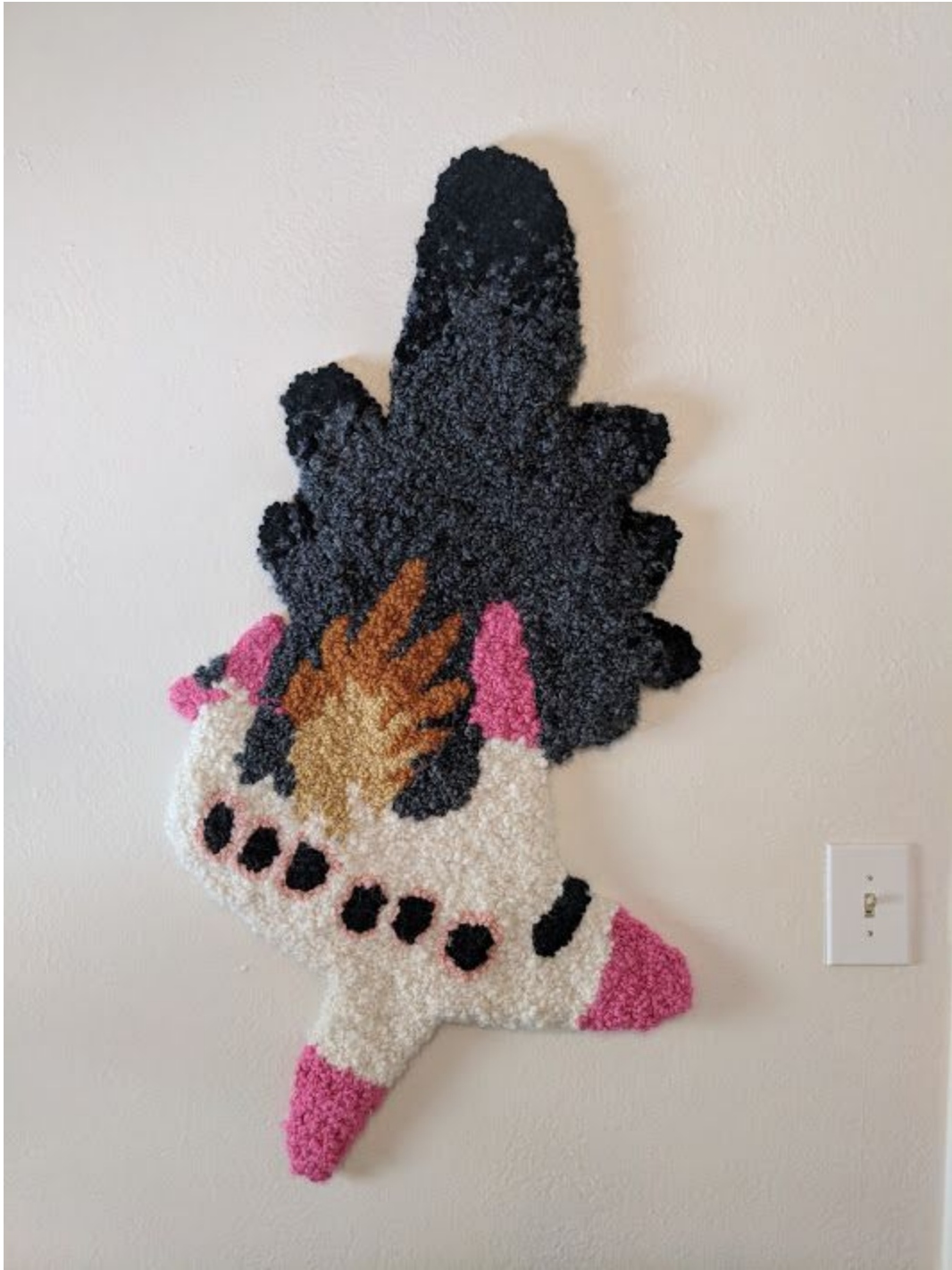
Figure 3: Airplane