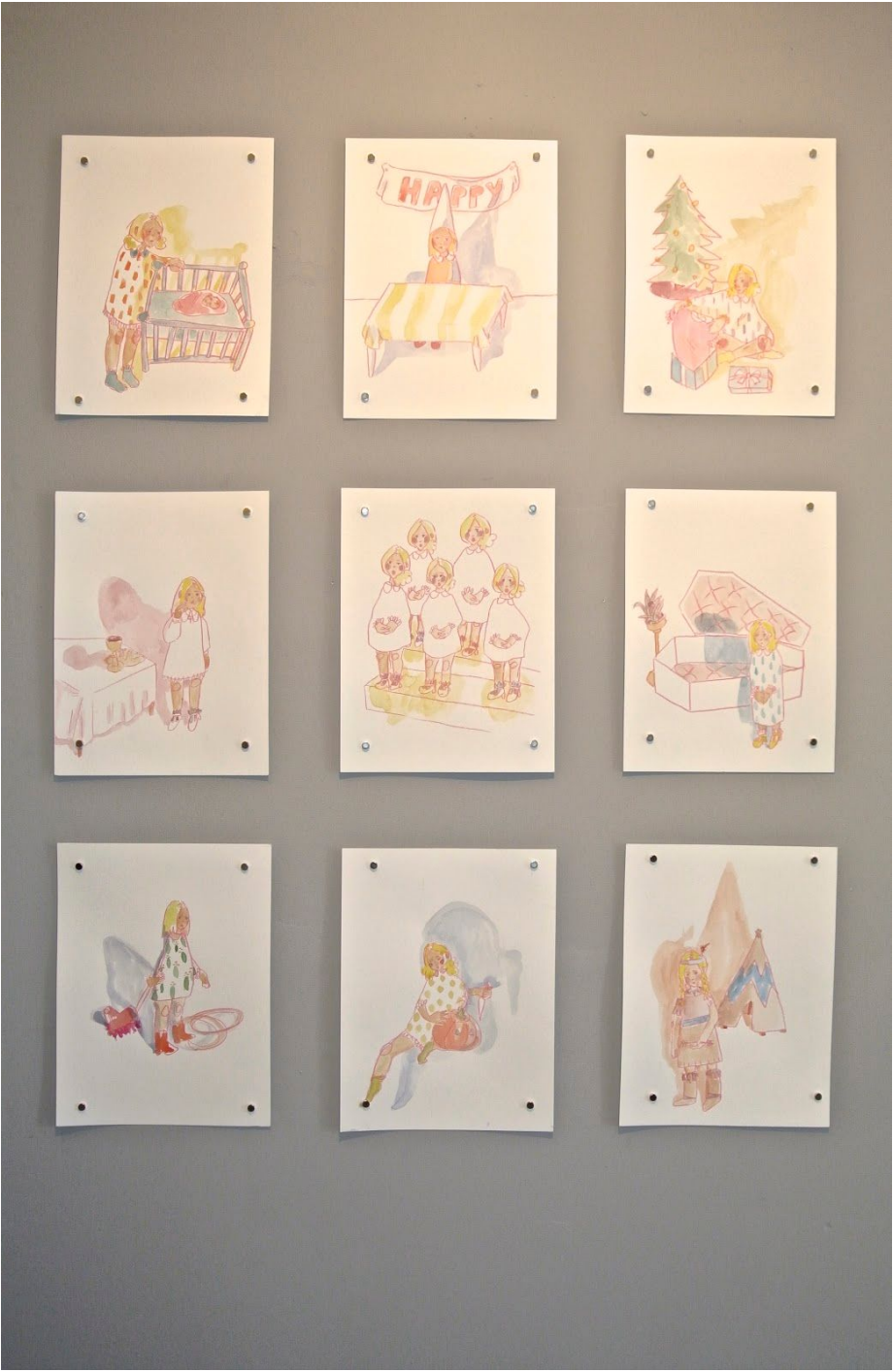
Figure 9: Empty Rituals