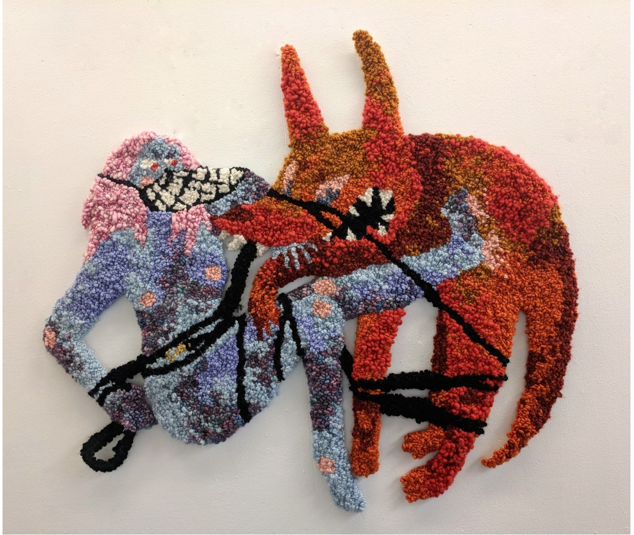
Figure 1: Bitch !