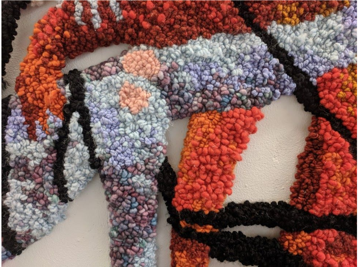
Figure 2: Bitch ! (detail)