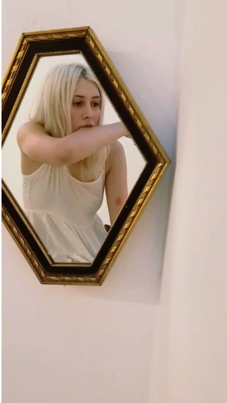
Figure 4: Best Looking