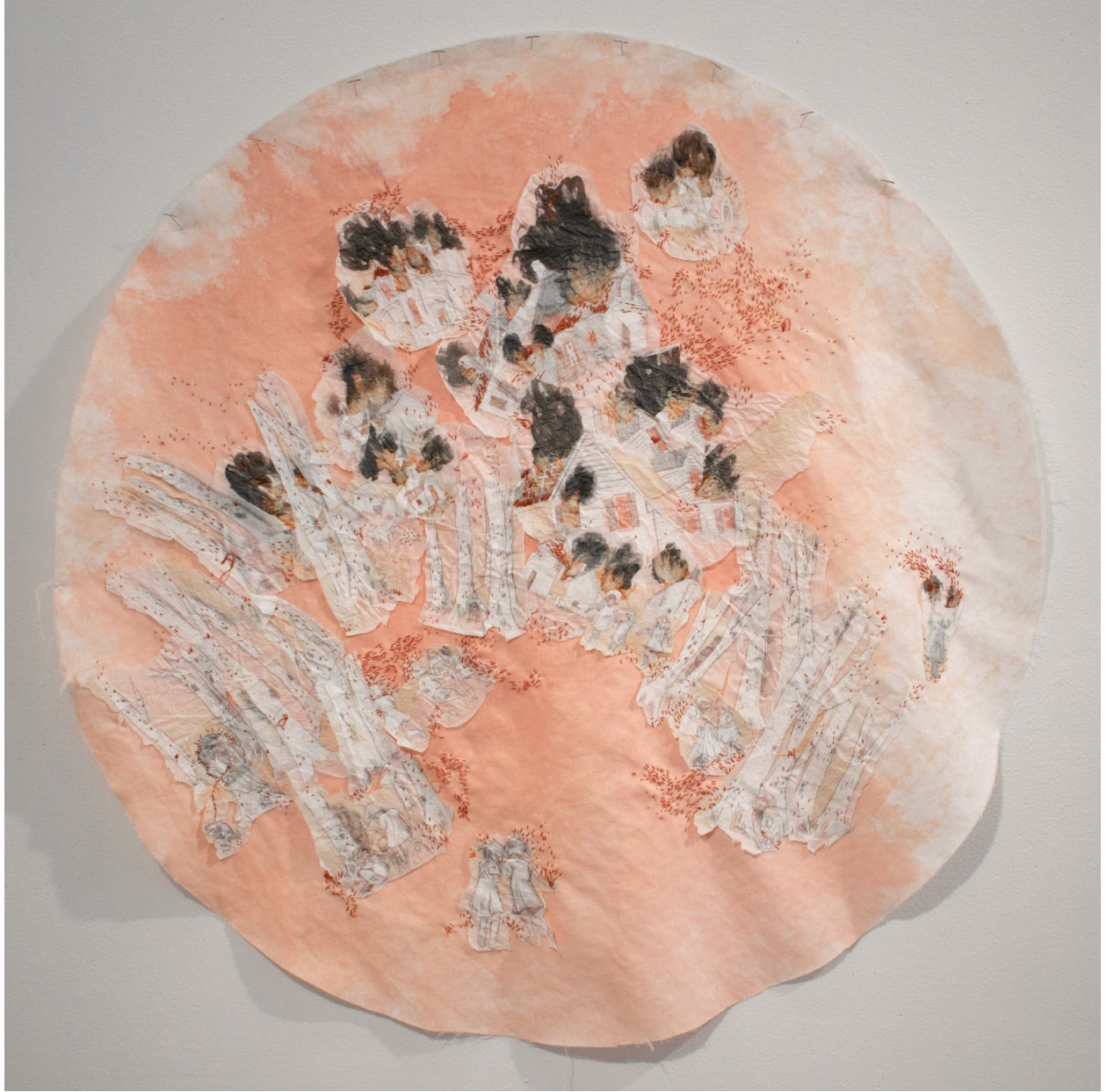
Figure 5: Fireside