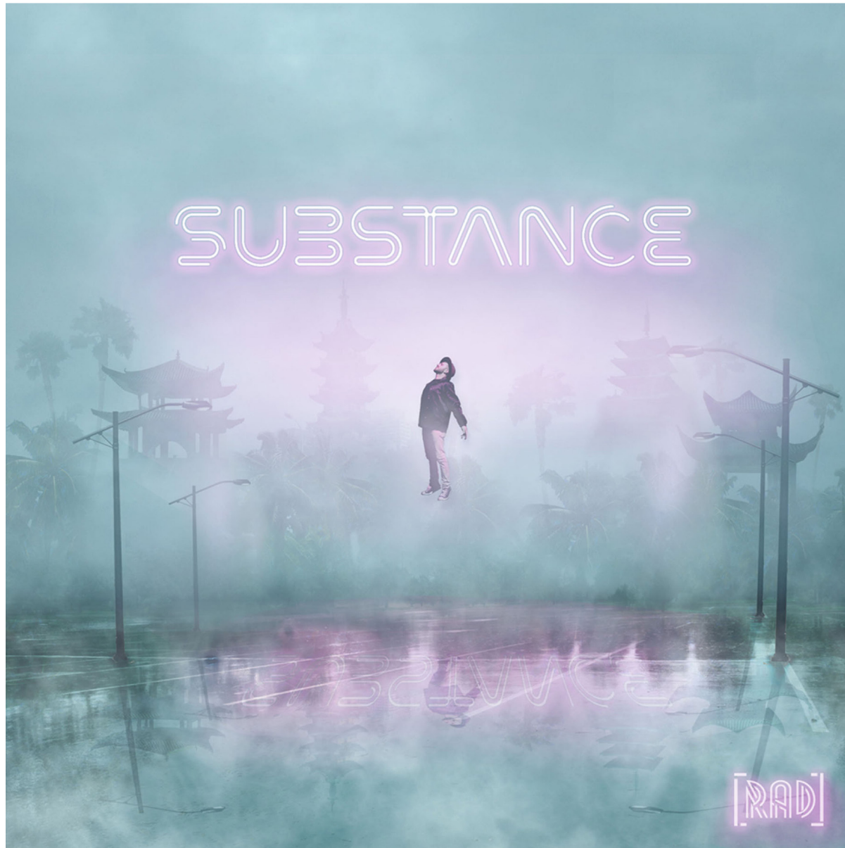
Figure 1: Substance EP