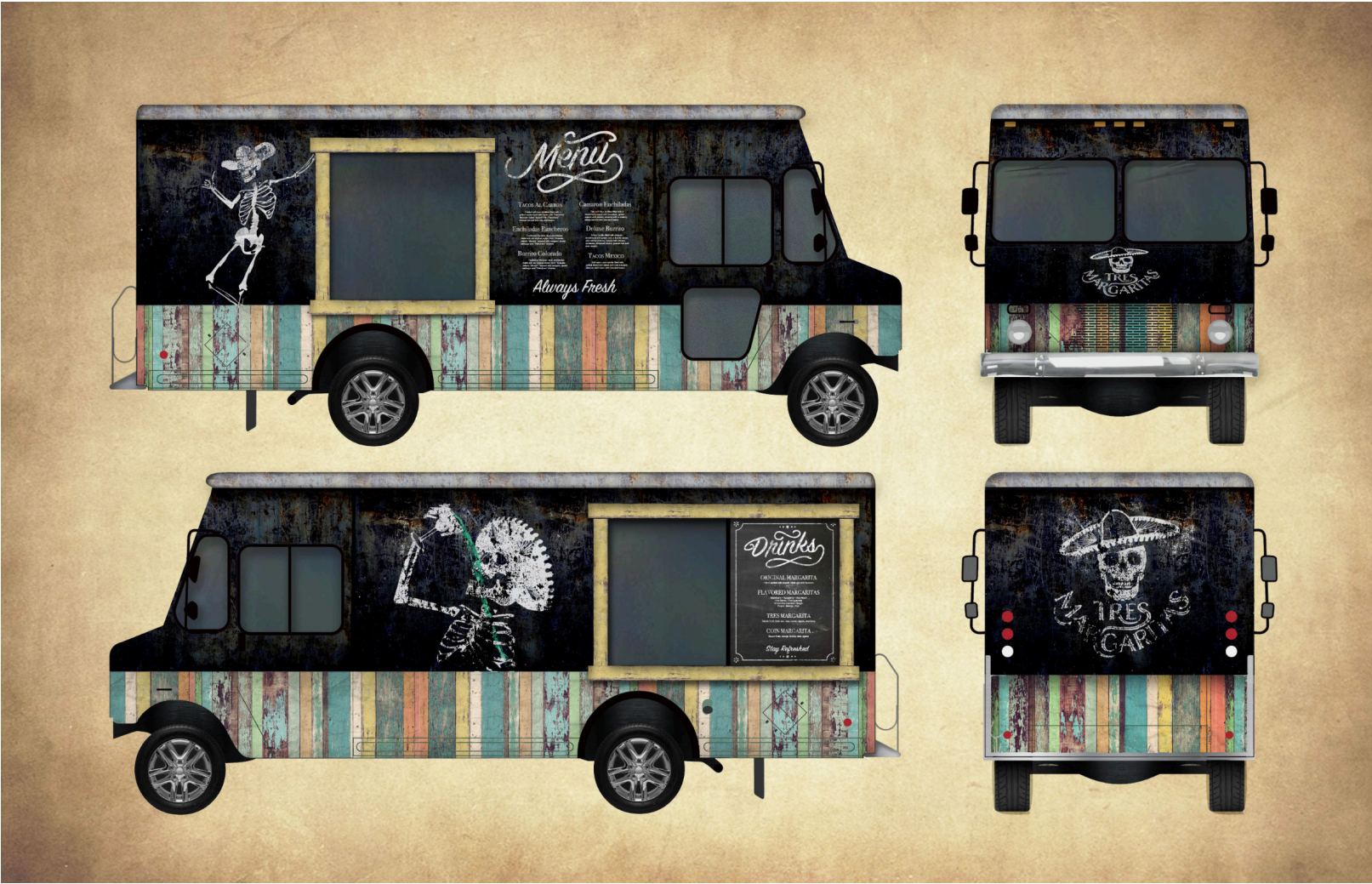
Figure 6: Tres Margaritas, food truck design