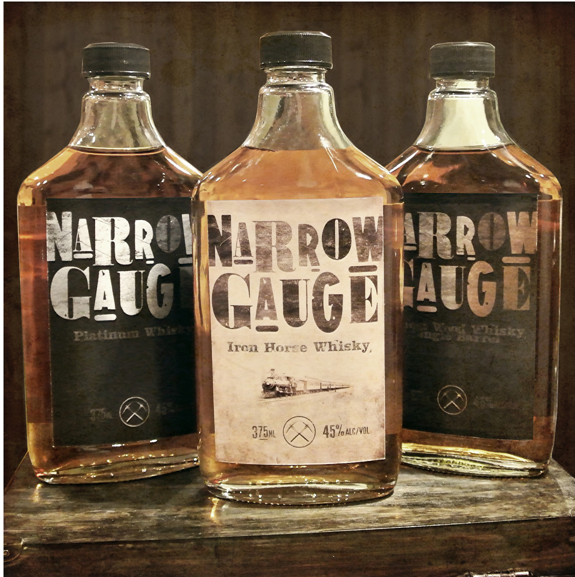
Figure 4: Narrow Gauge packaging