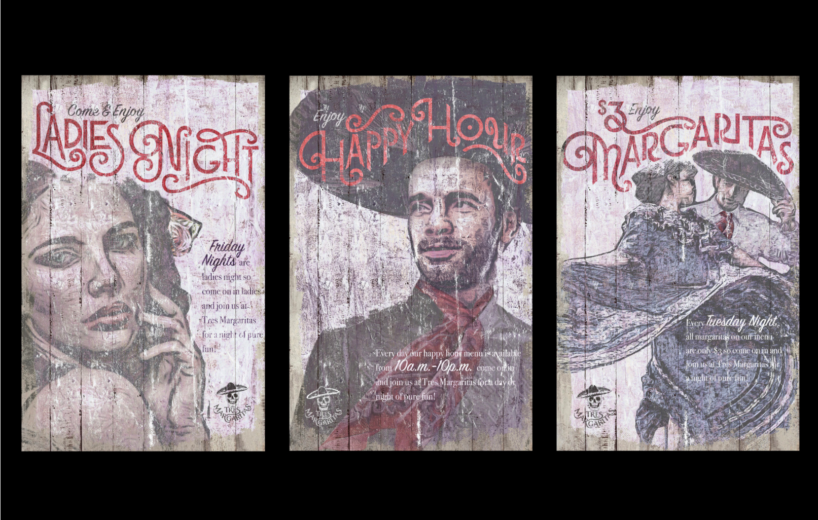
Figure 7: Tres Margaritas, poster series