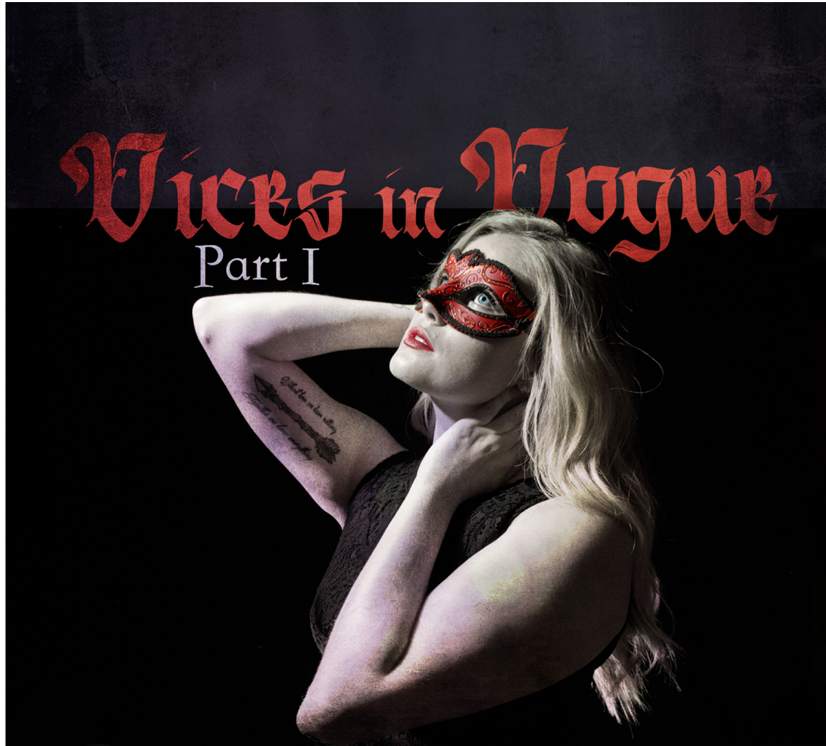
Figure 2: Vices in Vogue