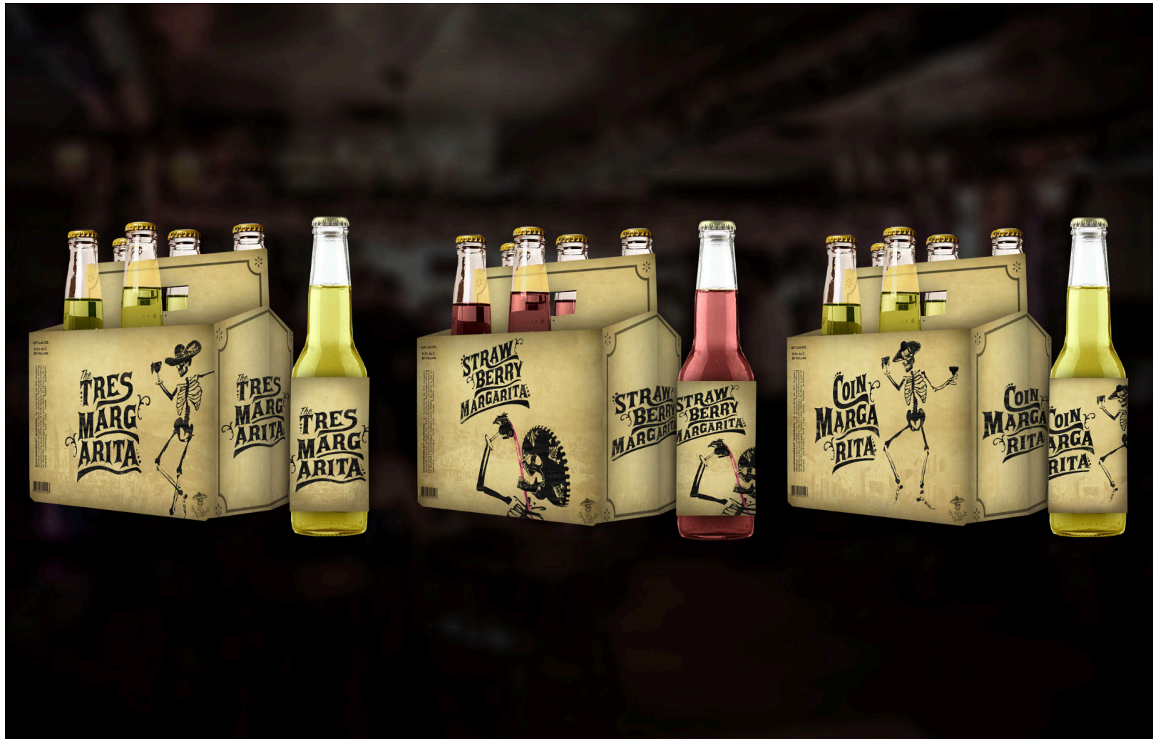
Figure 5: Tres Margaritas, margarita packaging