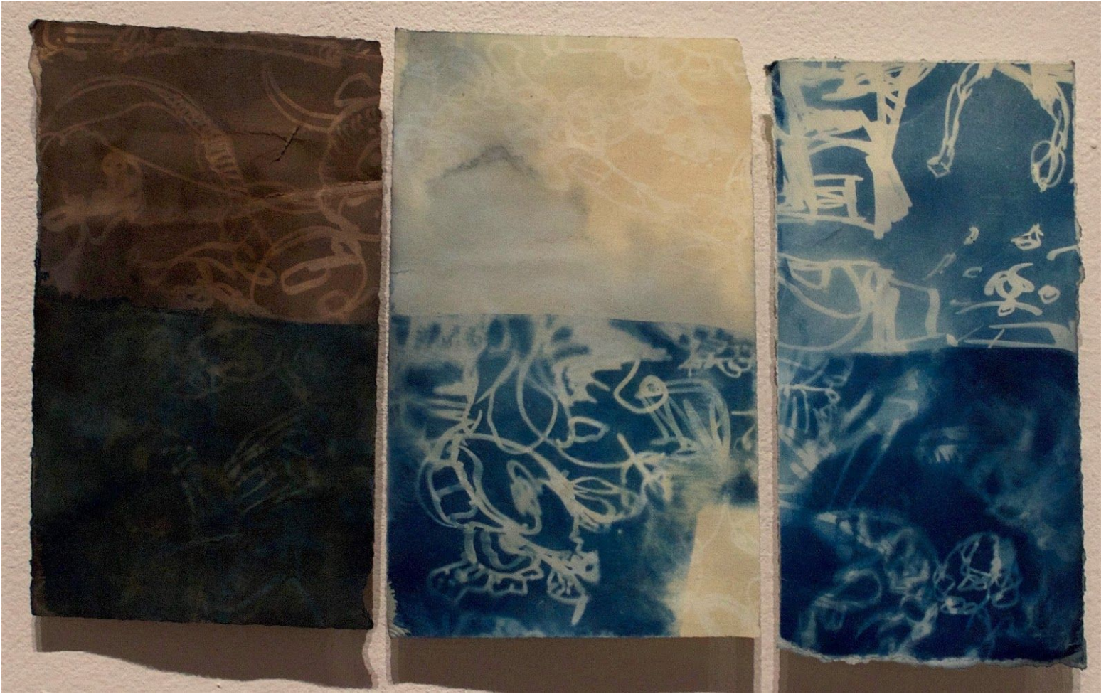
Figure 3: Tremuse