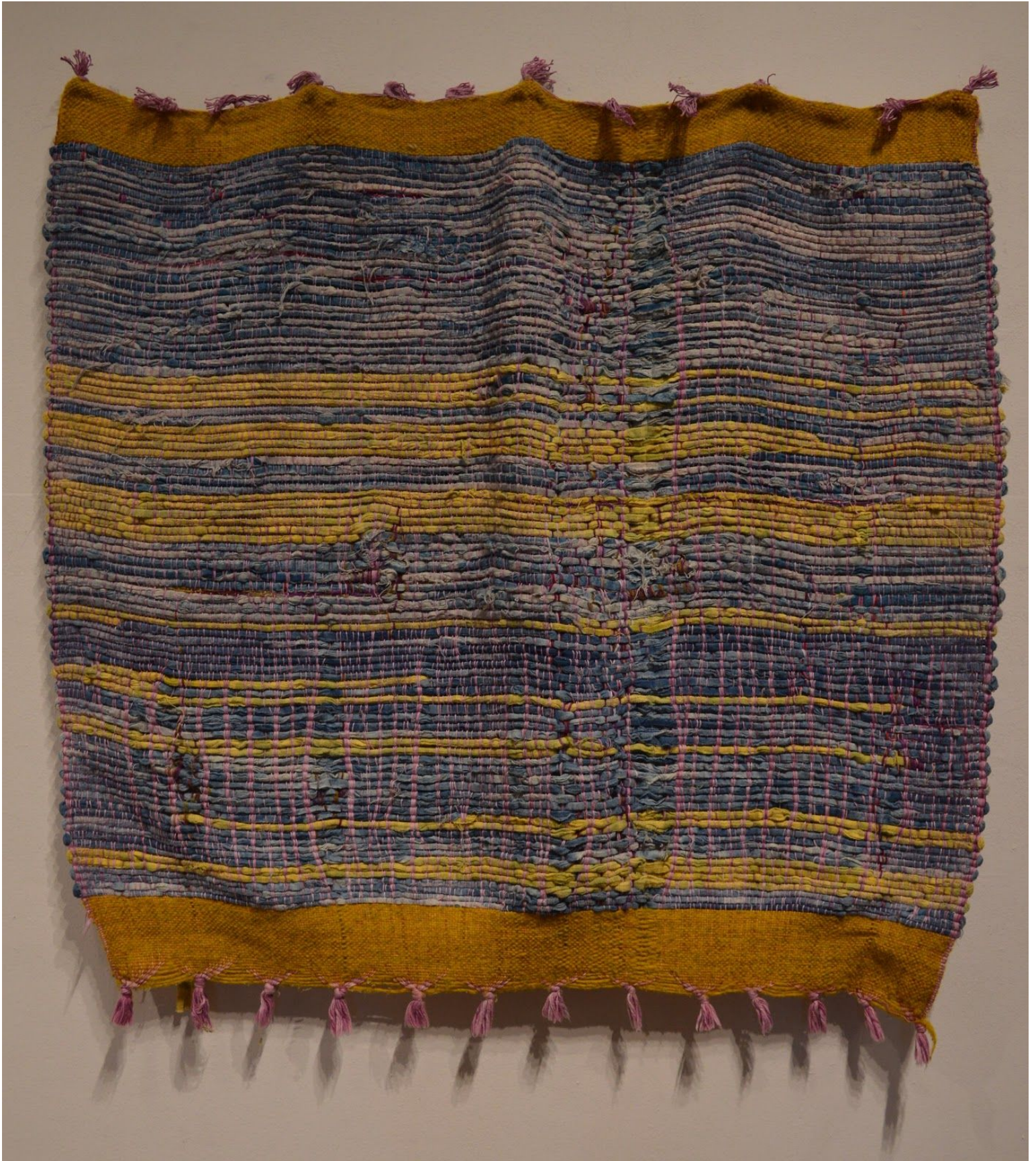
Figure 7: Miralook