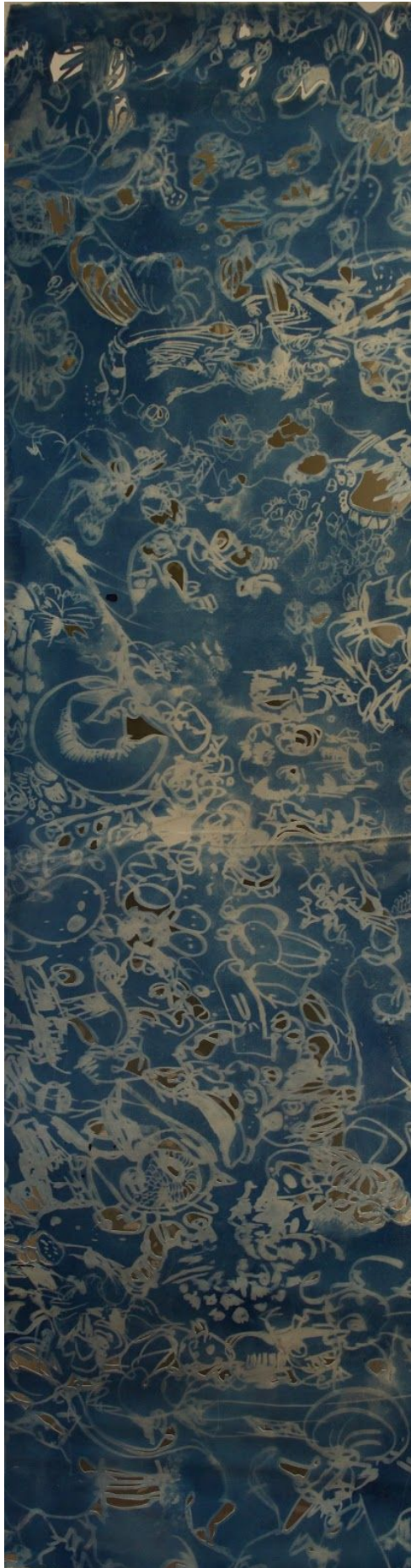
Figure 8: curvibo