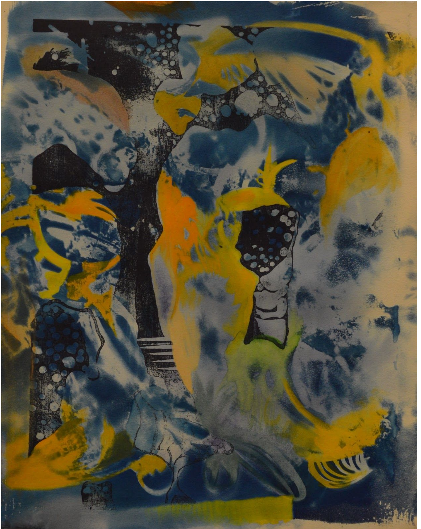
Figure 5: Shoestrings