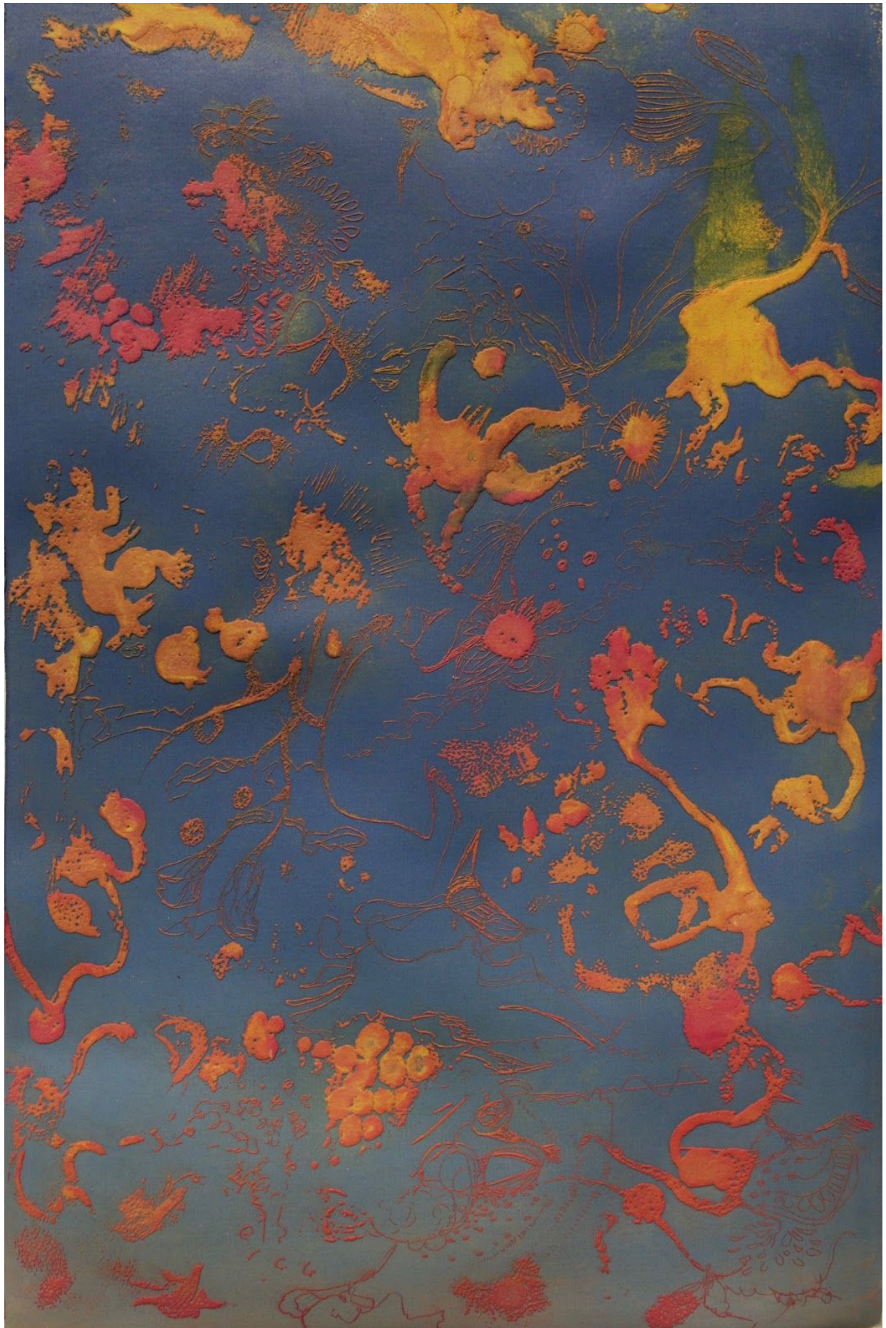
Figure 9: Screech