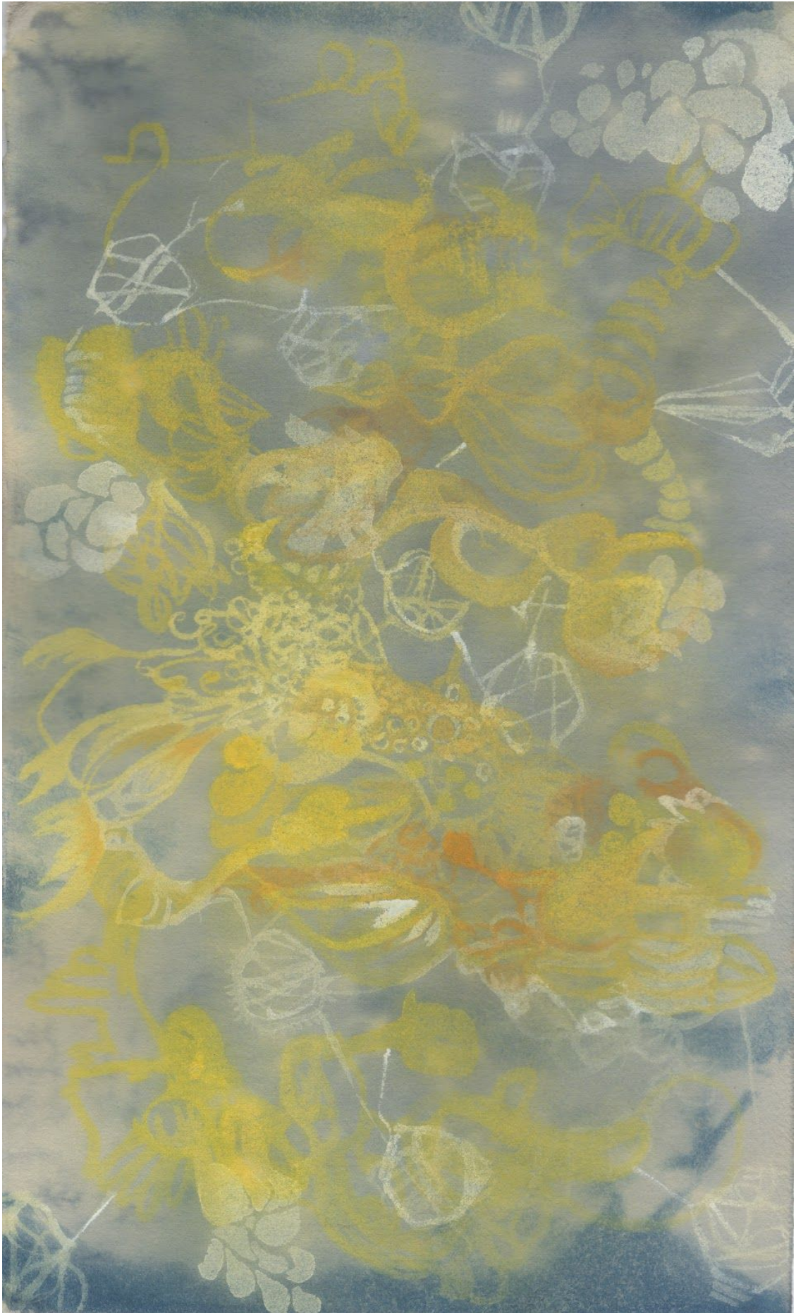
Figure 1: heatseeker