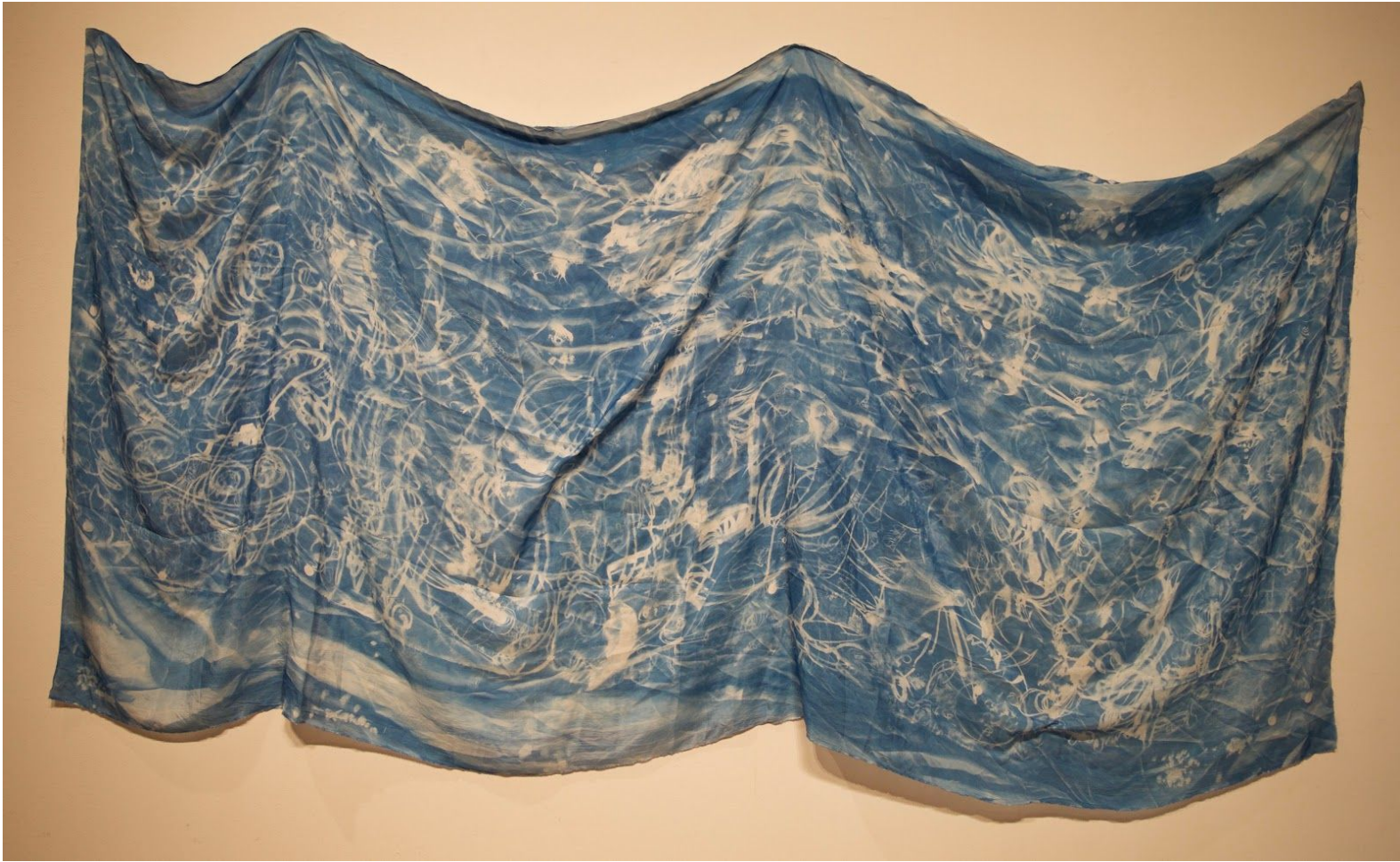
Figure 10: Untitled