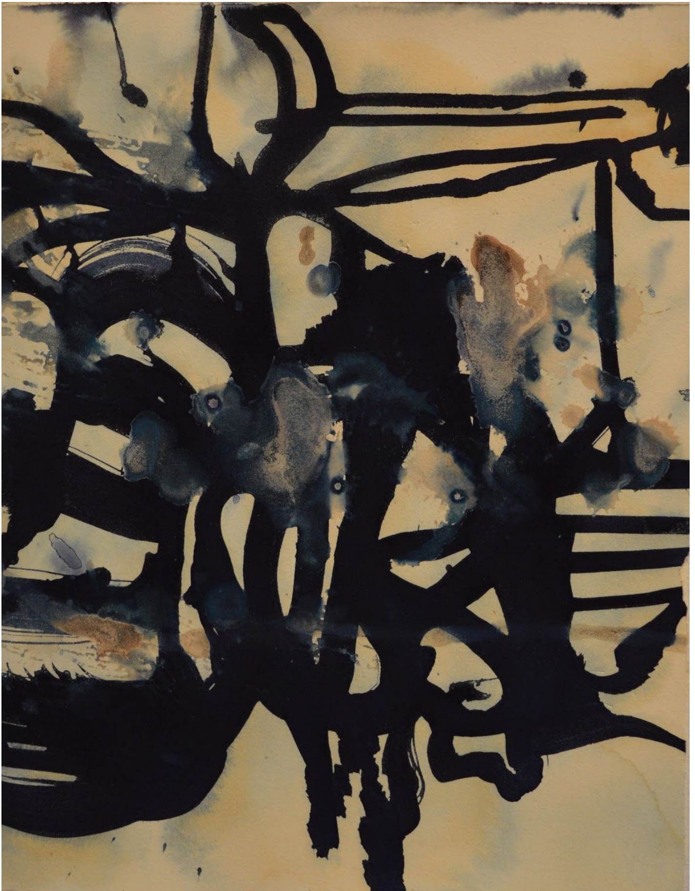
Figure 2: Be Steady