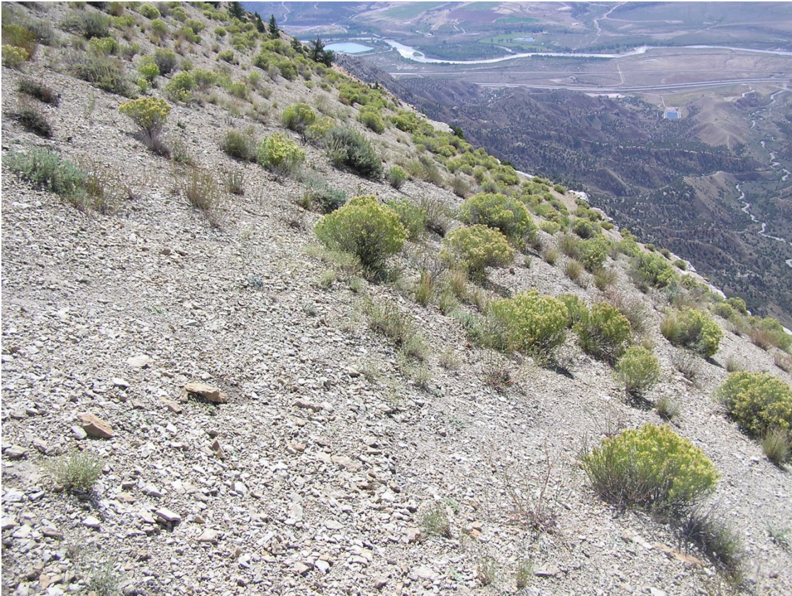
Habitat of Roan Cliffs blazing star ( Nuttalia chrysantha ) by Jill Handwerk

Habitat description: Known only from steep, shaley talus slopes derived from the Parachute Creek Member of the Green River Formation (Holmgren and Holmgren 2002, Reveal 2002). The plants are commonly associated with Gambel oak, western chokecherry, mountain mahogany and Utah juniper (Reveal 2002).