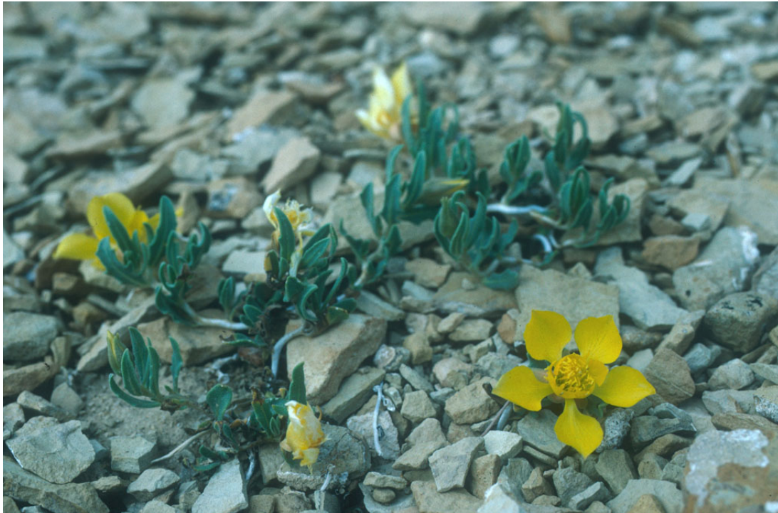
Close up of Nuttallia rhizomata by Susan Spackman Panjabi