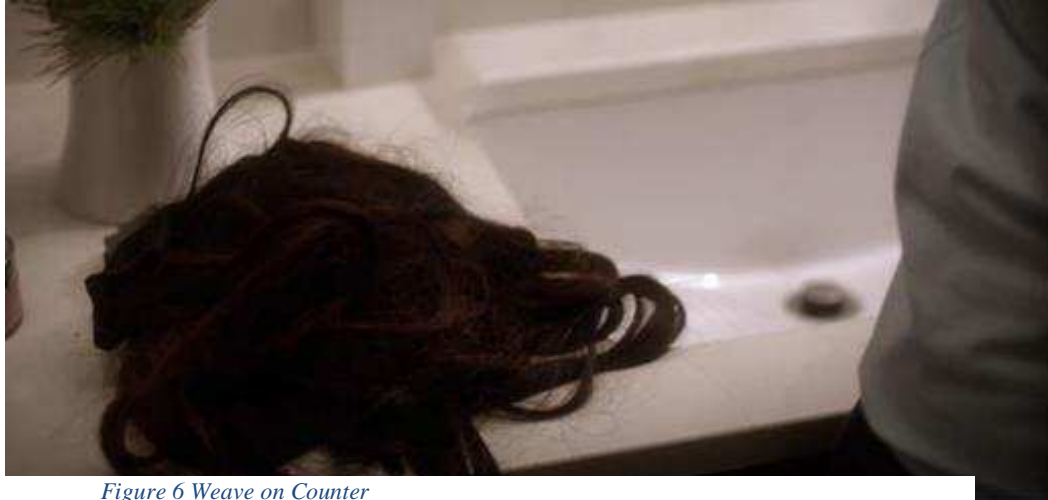
Figure 6 Weave on Counter