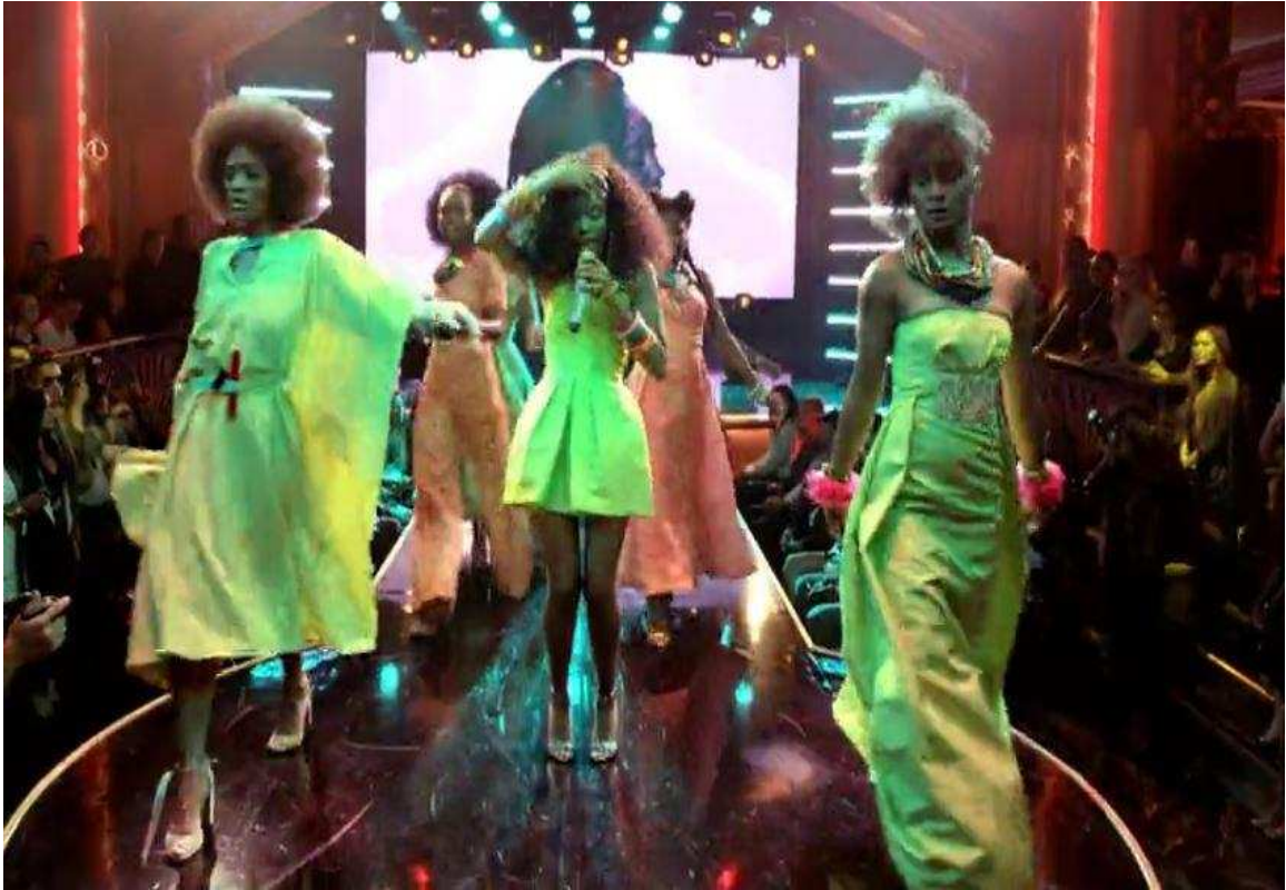
Figure 11 Nessa

The accepted reading of this episode invites audiences to acknowledge and celebrate Blackness and natural hair as Tiana is empowered enough to confront the issue head on and then Nessa successfully headlines the show, but the negotiated reading exposes the problems present. The problematic element in this representation is that Helen only agreed to showcase Blackness because A) public relations-wise she had to, B) Andre cut off all her daughter's long straight hair in the middle of the night as a threat, and C) natural remains the symbol for the Black savage up for consumption by White civilization. While the audience celebrates the accomplishments of Black women, they are invited to understand that White people are under cultural and personal threats to be inclusive. Helen did want successful Black imagery and had to be forced, yet she is rewarded for her prejudice as the show was successful, and Andre is the only character that knows the truth behind the casting choice. This episode invites the audience to associate