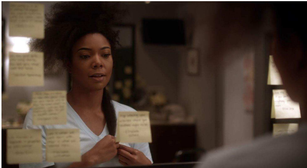
Figure 7 Mary Jane

or go to work tomorrow with natural hair seems to be very distressing for Mary Jane as she hangs up on her hair dresser. Mary Jane then calls her niece, whom she is fighting with at the moment, and begs her to come over and help. Begging is highly uncharacteristic for the strong willed and highly independent Mary Jane Paul, further adding to the desperation felt in this moment. Mary Jane even offers to reimburse Niecy for the movie she was at and to babysit for her: Mary Jane, as established when Niecy lived with her earlier in the show, does not