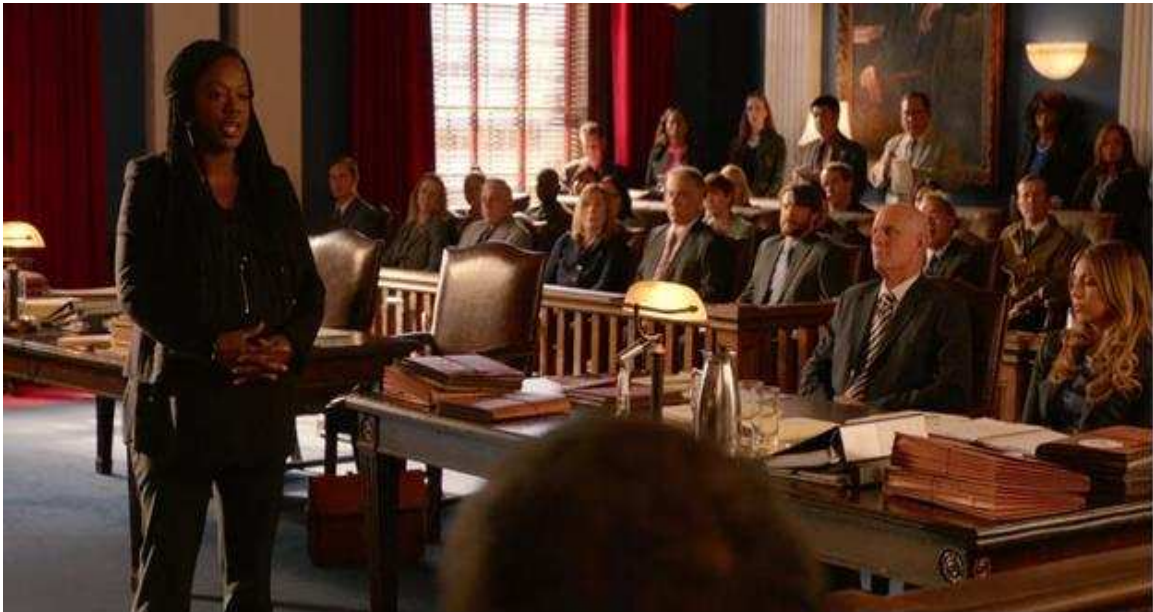
Figure 8 Annalise Keating

How to Get Away with Murder. Annalise Keating also utilizes natural hair to gain leverage and credibility in her professional sphere; season 2 of HTGAWM invites the audience to see Annalise at work with braids 10 years prior to the main narrative. The glimpses into Annalise's past professional experiences, defined by failure and heartache, shed light onto her use of wigs and weaves while in the courtroom and meeting with clients for the majority of the show. The flashback of Annalise span 2:9 through 2:14, but a particular exchange in 2:12 is of the most interest for this analysis. During 2:12, Annalise is in the courtroom, Figure 8, and reprimanded by a client in way that invites the audience to engage with her race, her condition, and her professional being.