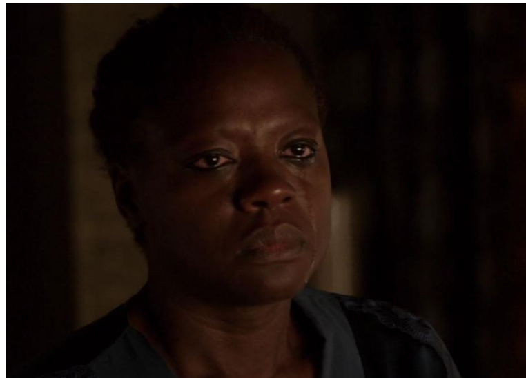
Figure 12 Annalise Crying

The scene continues in 1:5 as Annalise questions Sam about the affair. She is empowered as she has an advantage over Sam, but it is also problematic that the audience sees the natural Annalise being scorned as her husband cheated.