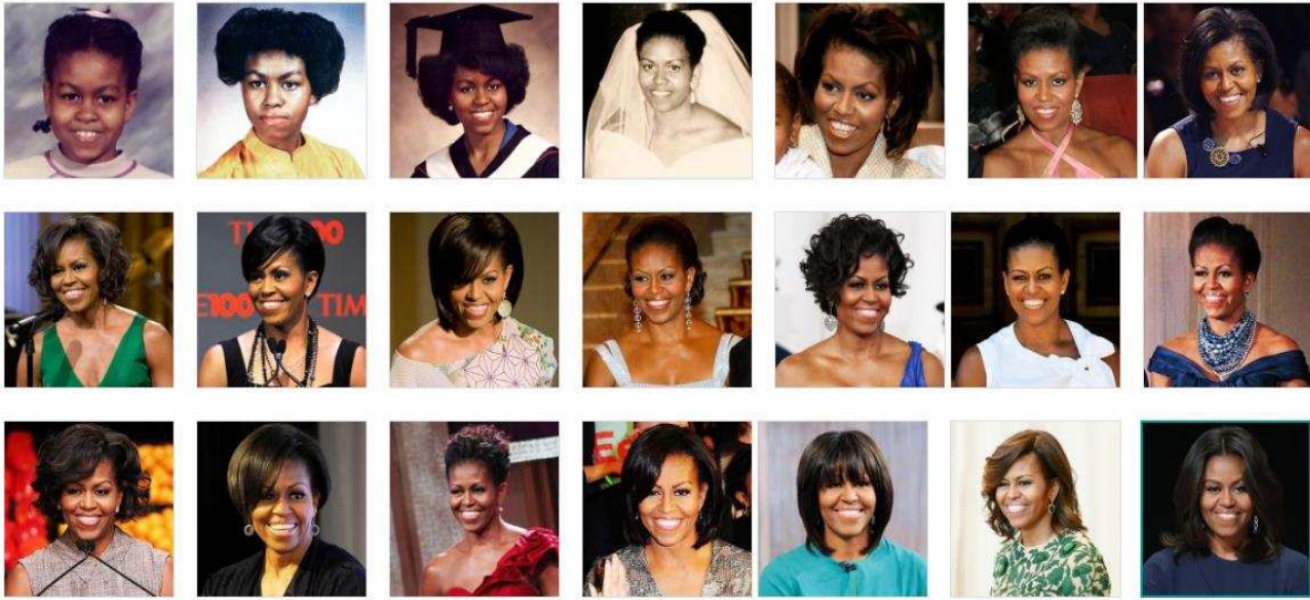
Figure 2 Michelle Obama's Look