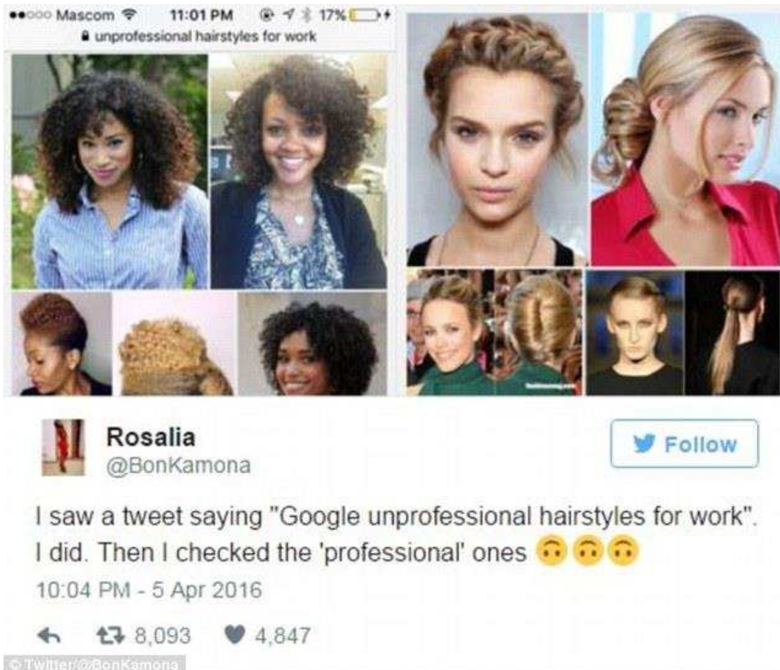
Figure 1 Google's Professional Hair

A tweet on April 5, 2016, shocked the Twittersphere and brought attention to the institutional disadvantaging of Black women in the workplace. @BonKamona screen grabbed and posted her results of a simple Google search: unprofessional hairstyles for work . The images returned were overwhelmingly of Black women with natural styles (see Figure 1). The image was retweeted over 8,000 times with other Twitter users finding similar results (Jackson-Edwards, 2016).