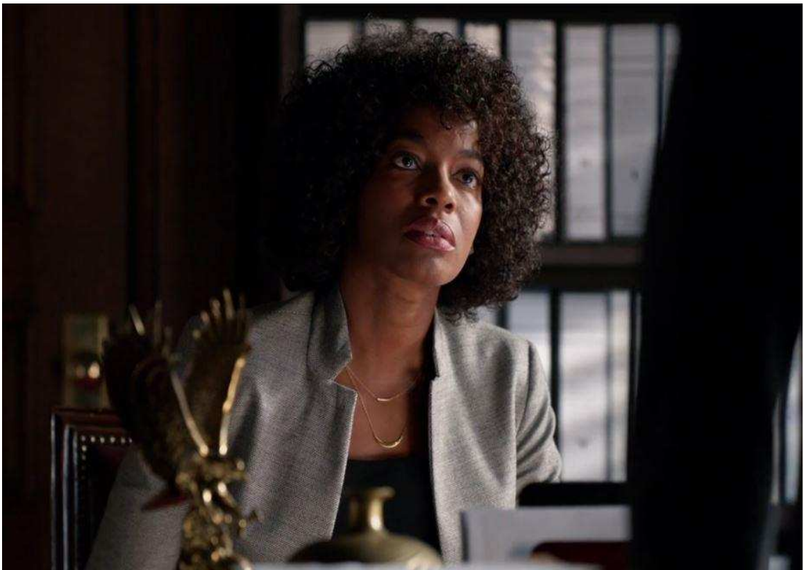
Figure 5 Renee Atwood

attorney, Renee Atwood, is viewed with an Afro style both in and out of the courtroom as in Figure 5. Annalise meets with her in a private/professional space of the DA office and the public/professional space of the courtroom several times in Season 2 and Season 3. The image of the natural haired DA is ultimately disciplined, however, by her termination from the District Attorney's office (3:13) due to her mishandling of evidence discovered by Annalise's team. The visibility of natural hair in the DA office is promising as the audience is invited to view Atwood as a successful and competent woman early on, but then remains problematic as the key message remains that women who draw attention to their race through natural hair will eventually lose their professional status and/or women who choose a natural style are more likely to commit crimes, an already problematic stereotype for the Black community.