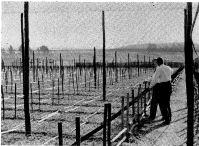
Fig. 1. Most carnations are grown under hail screen. The ground beds are spaced as they are in greenhouses.

age return to the grower last year was over 3 cents (US) per bloom during the export period. One grower shipped 1,750,000 flowers from 175,000 plants in 20 weeks, or about 12,500 blooms per day during the season. Taking it another way, he produced 8 blooms per sq. ft. of bed area per month for 5 months.