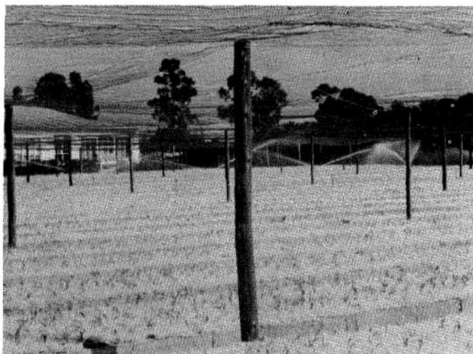
Fig. 3. Newly planted mother stock that has been mulched with wood wool (excelsior) and is being watered with overhead sprinklers.

This method of culture takes advantage of a mild climate that is relatively cool in summer. By growing carnations in the open ground in beds and under screen structures the cost of erecting the structure is low and watering is done mostly by flooding or overhead sprinklers. They may steam and treat the ground with Shell DD, or move the structure at about the same cost. Naturally they do not grow as high quality carnations as those grown in greenhouses in Colorado, but they are able to put a good flower in Central and Northern European markets in less than 24 hours at a cost that can be afforded by the man in the street. The people responsible for their marketing are thinking well ahead of their present produc-