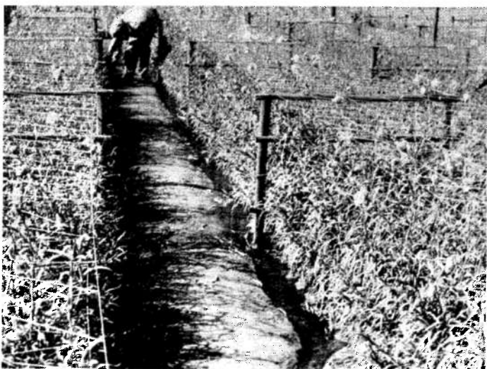
Fig. 2. Much of the watering is by flooding the individual beds.

If they return 10 flowers at 2.8 cents each, they would have 28 cents less the cost of 10.5, or a return per plant to capital and management of 17.5 cents. On a morgen, or hectare, basis they plant 264,000 cuttings in the 66,000 sq. ft. of bed area. With these