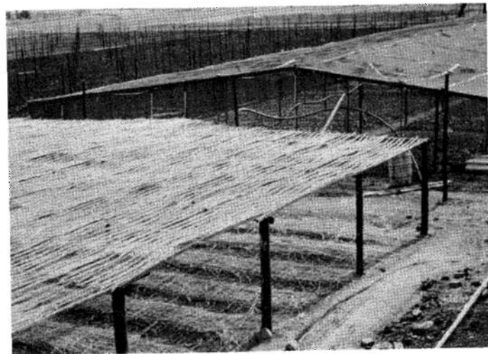
Fig. 7. Another shading structure for protecting certain bulb crops.

wood is cut directly from dormant rose bushes in the field. After the buds are well healed the top of the rootstock is broken over but not broken off. This bending, or breaking over, is done 4 to 5 weeks after budding. The buds normally start sprouting by the middle of August and will cut good crops of flowers the following summer. The variety Baccara is one of the most popular in South Africa for shipment to Europe. Tropicana (Super Star) is also being planted.