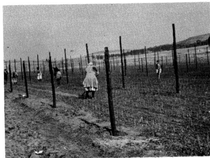
Fig. 8. A planting of roses that will be budded in place and covered with hail wire before the hail season. Buds just starting to sprout.