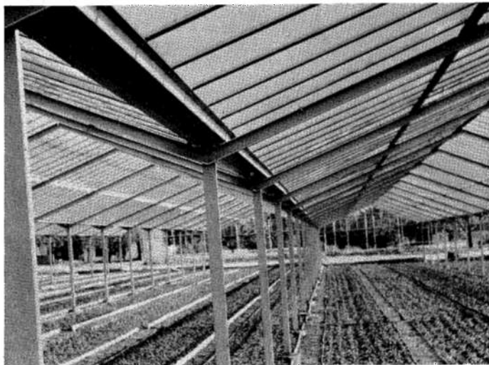
Fig. 5. The well-engineered glass houses presently being erected in South Africa.

tion because of their extensive mining industry. Their fans are very efficient and are engineered to move a maximum amount of air per unit of current. The greenhouse industry has had considerable help on greenhouse cooling from one of their government engineering research institutes.