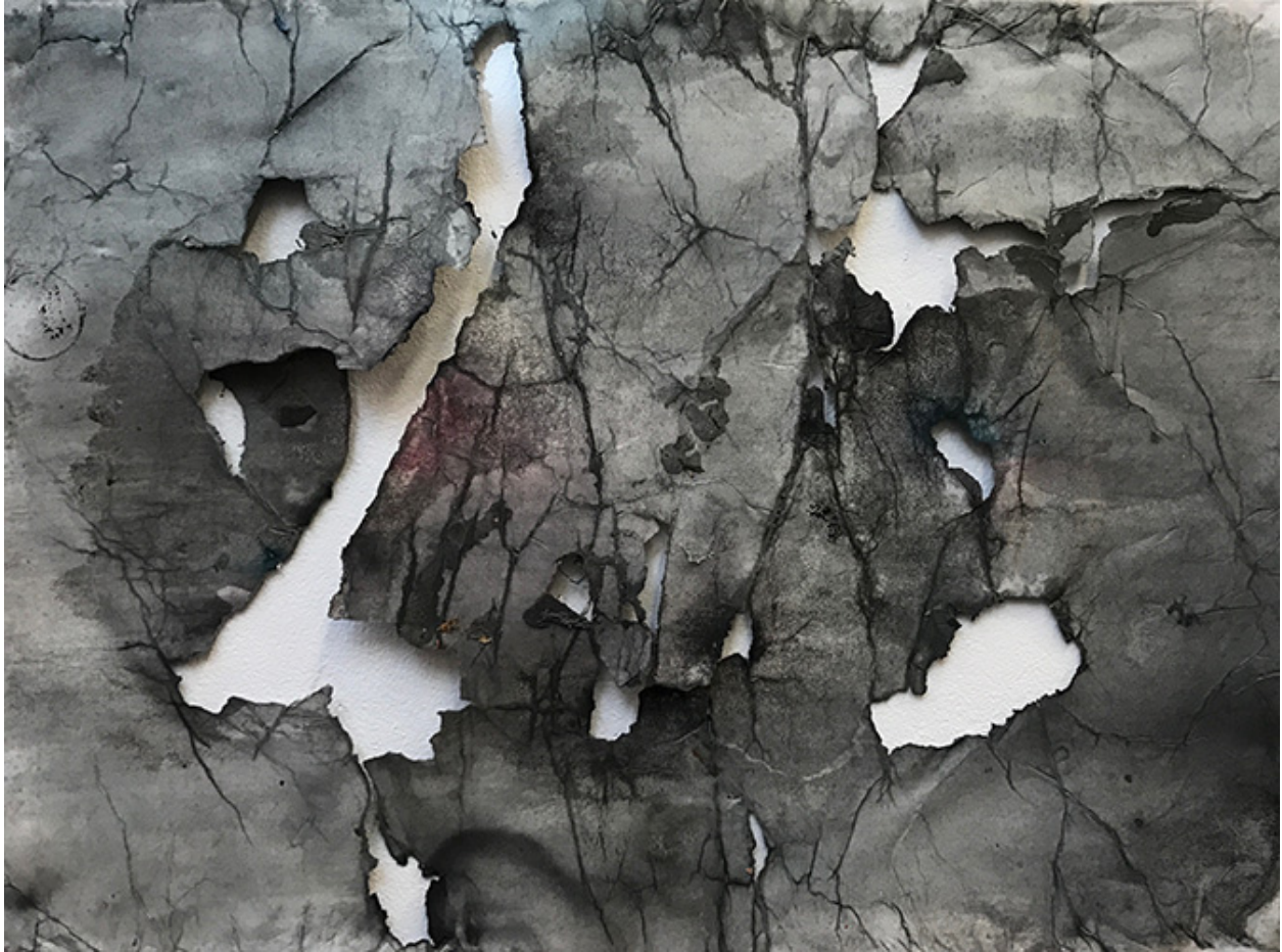
Figure 3: Degradation/Desolation 1