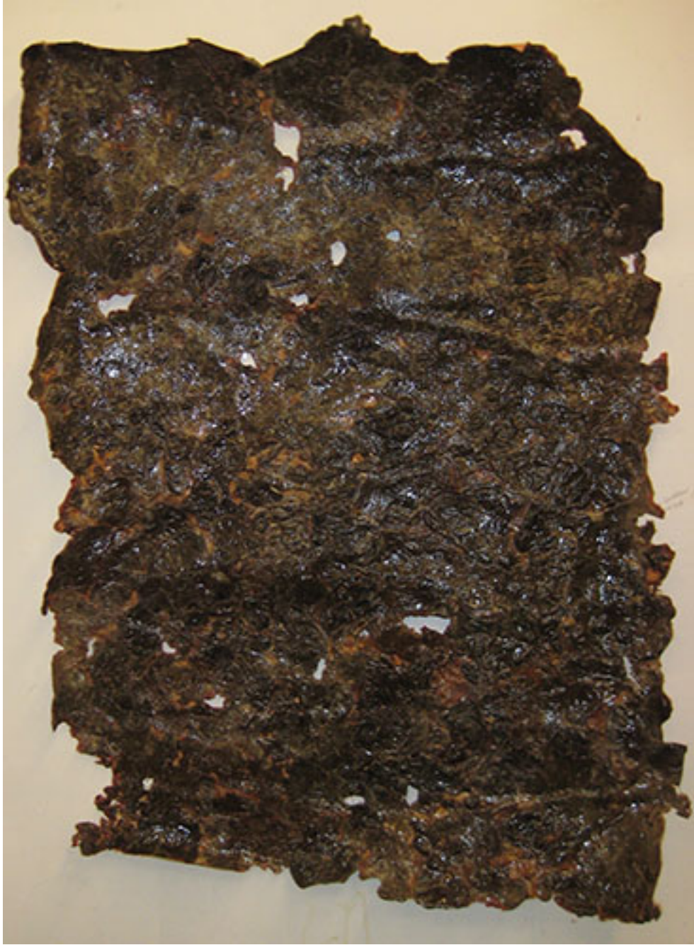
Figure 11: Scab