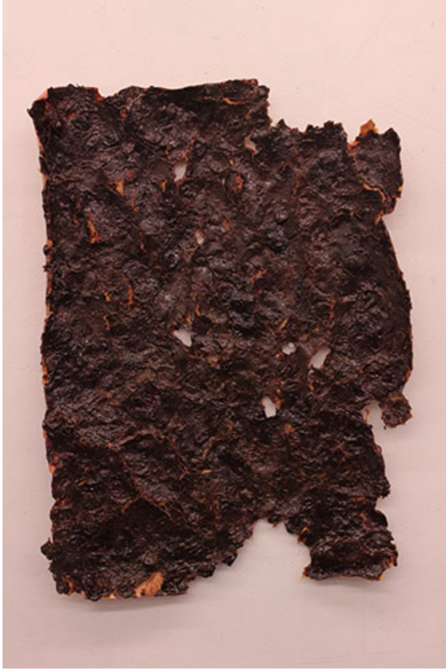
Figure 13: Scab 2