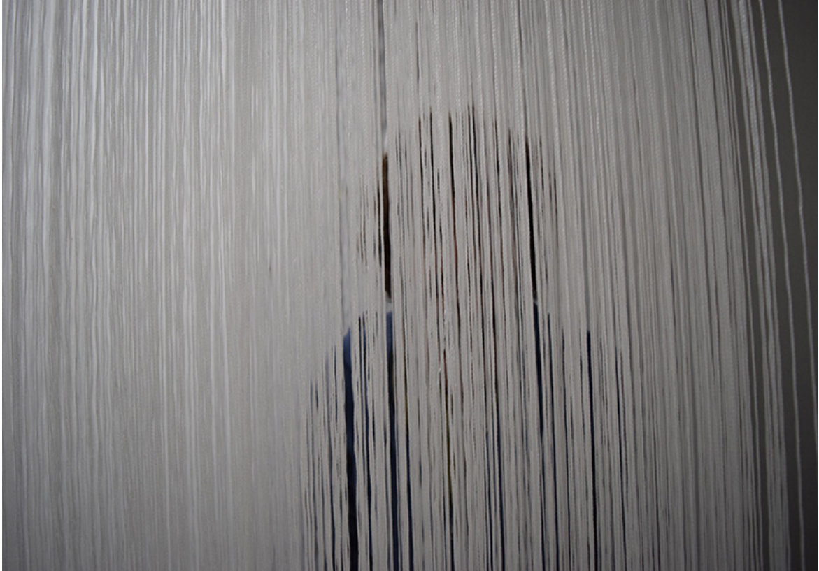
Figure 5: A Shell of Yourself (Detail)