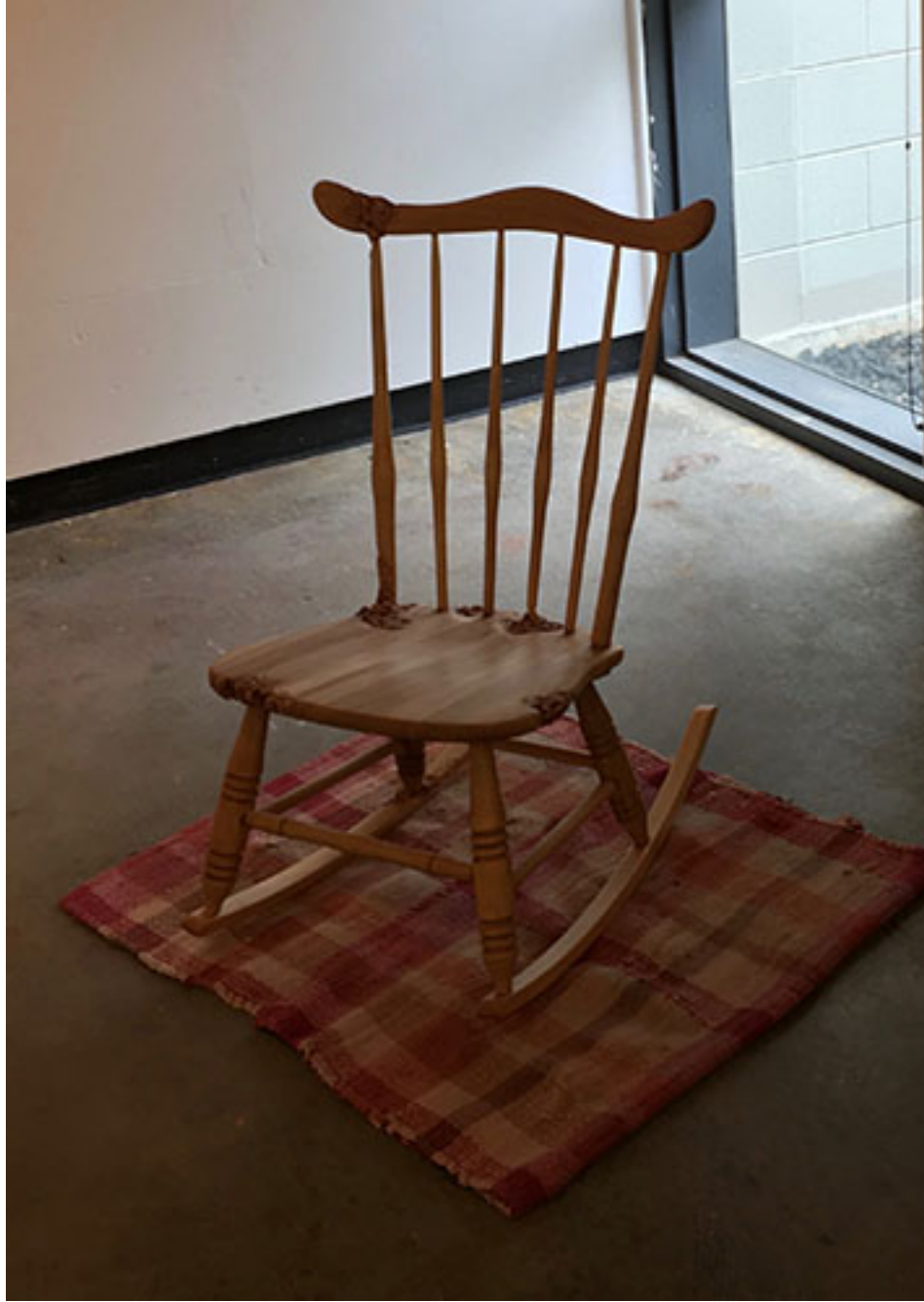
Figure 6: Living with Cancer