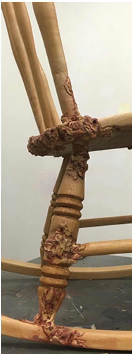
Figure 7: Living with Cancer (Detail)