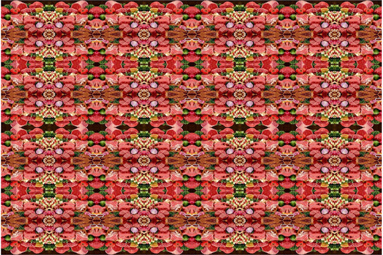
Figure 10: Muscle Memory (Detail)