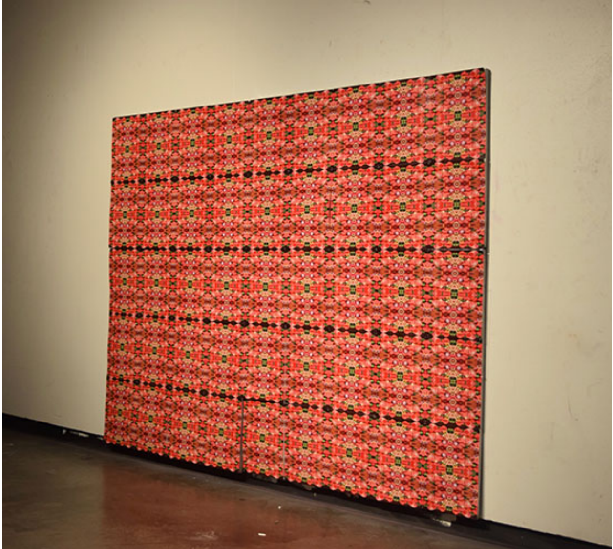
Figure 9: Muscle Memory