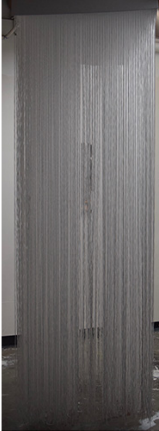
Figure 4: A Shell Of Yourself