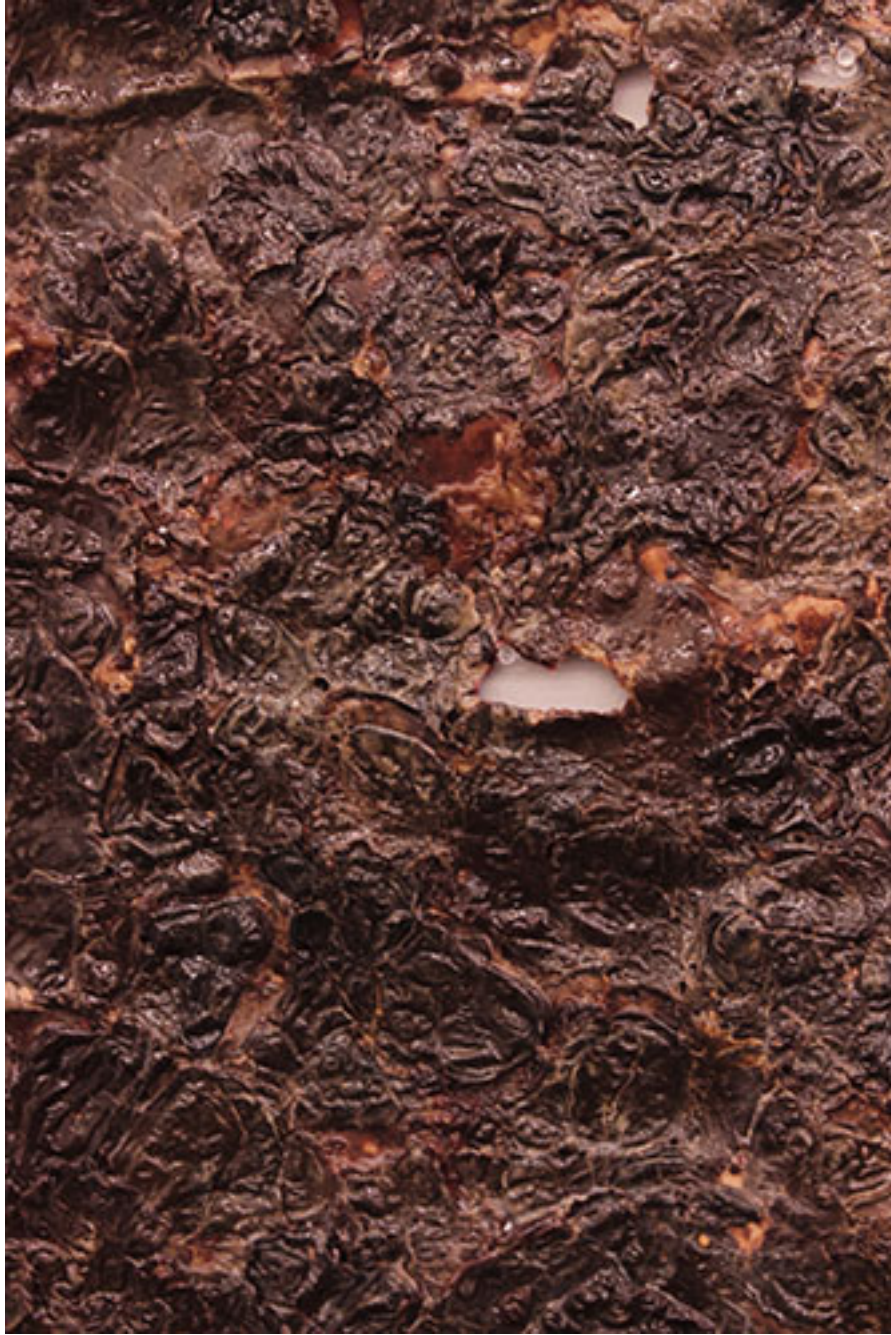
Figure 12: Scab (Detail)