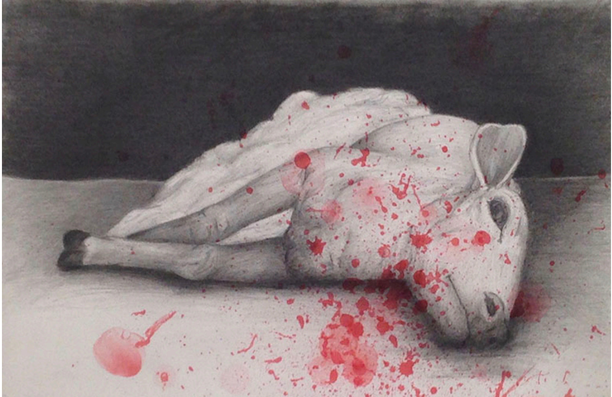
Figure 8: Woolite