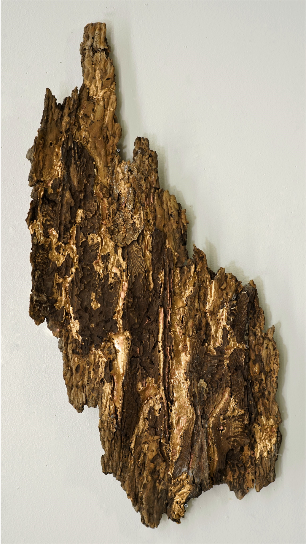
Figure 2: Repair 2