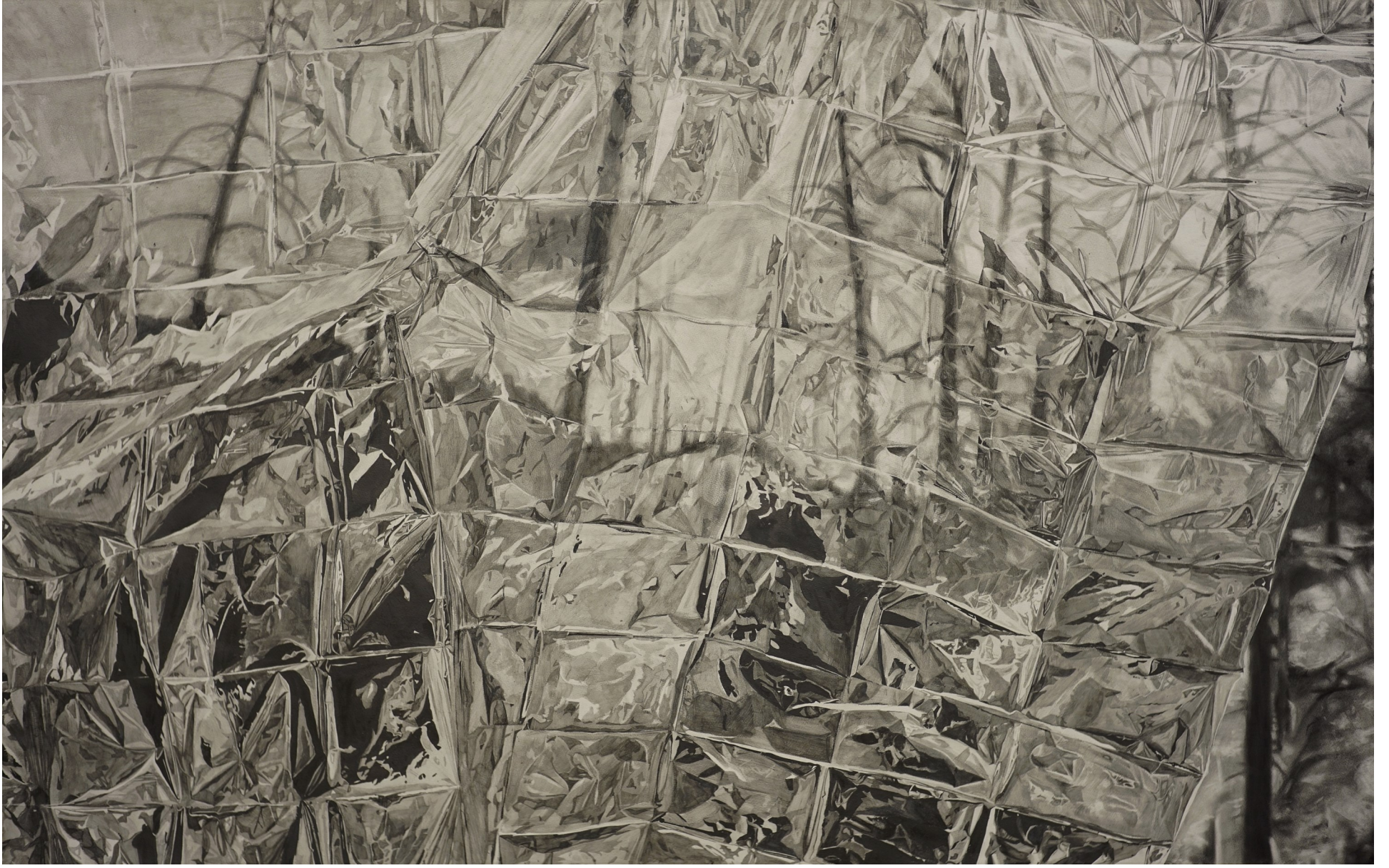
Figure 9: Mylar 1