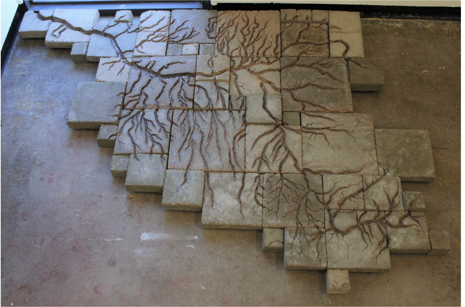
Figure 5: Fixed River