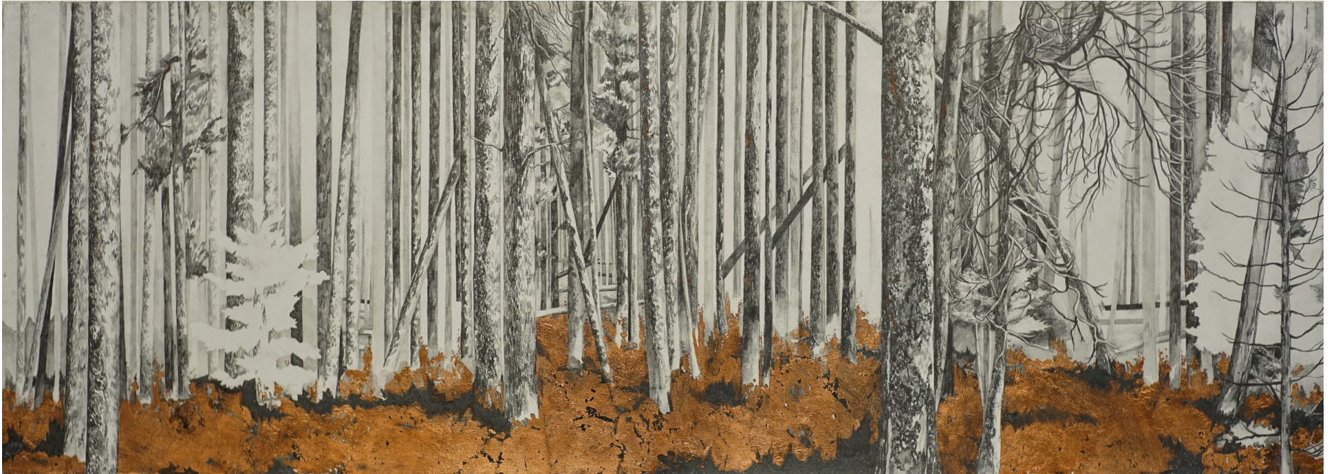
Figure 4: Roaring Creek