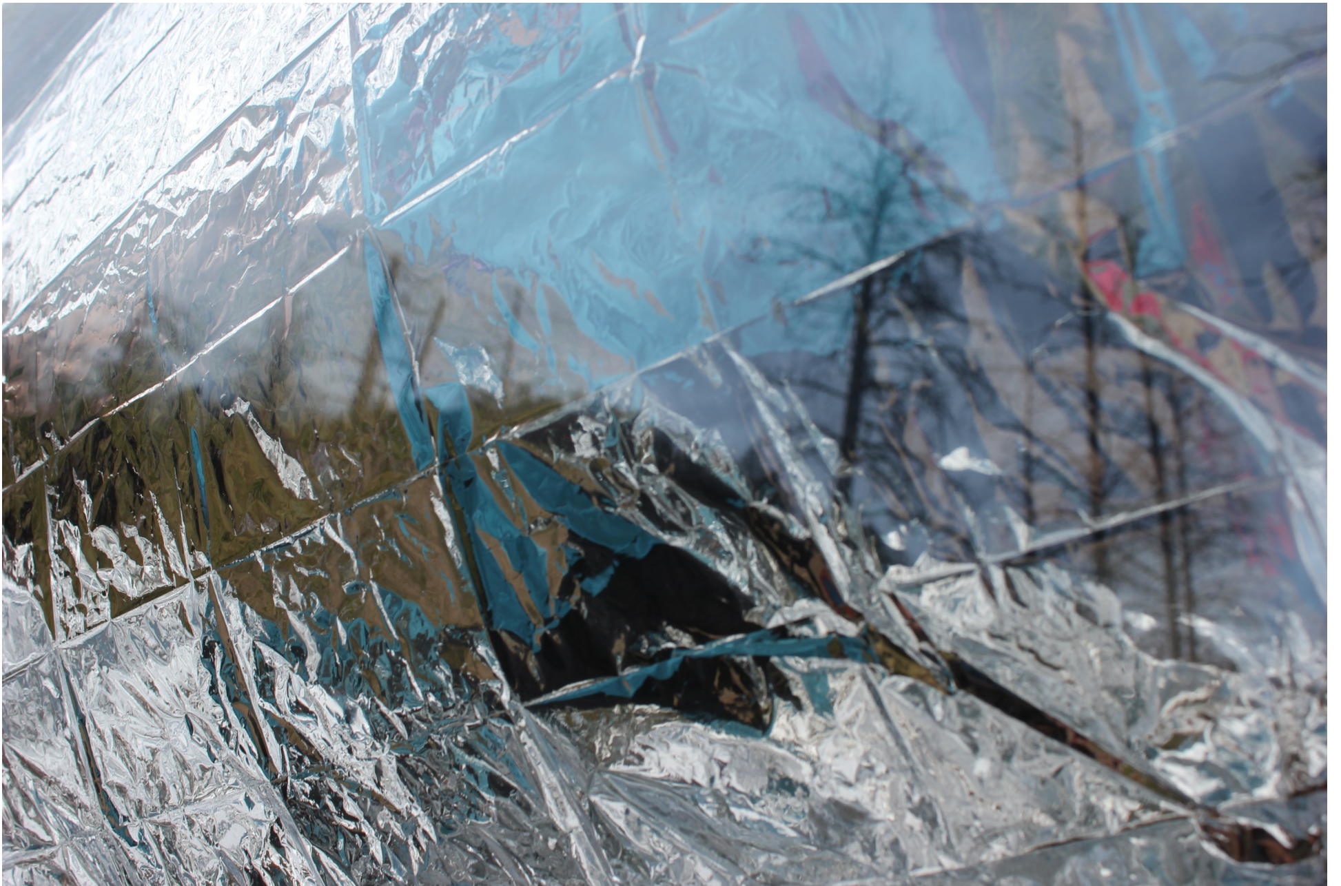
Figure 10: Mylar 2