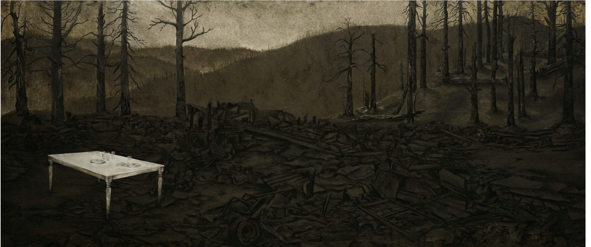
Figure 7: Pyriscence