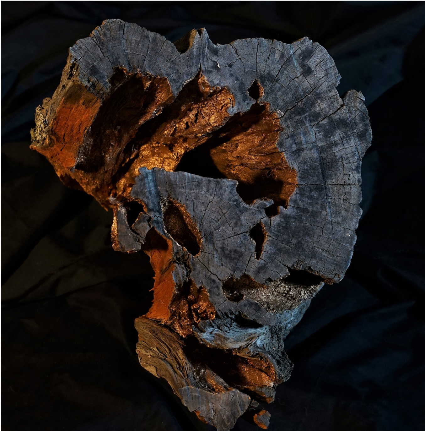
Figure 3: Repair 3