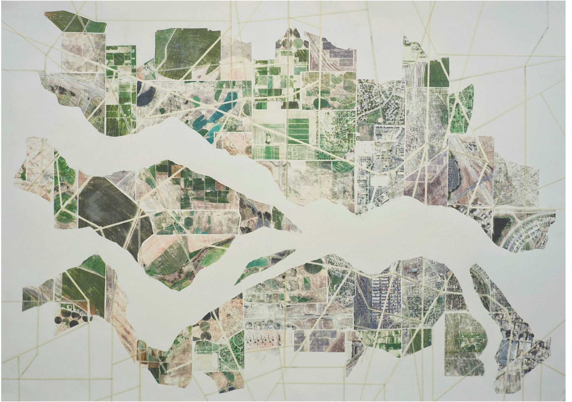
Figure 11: Corridor