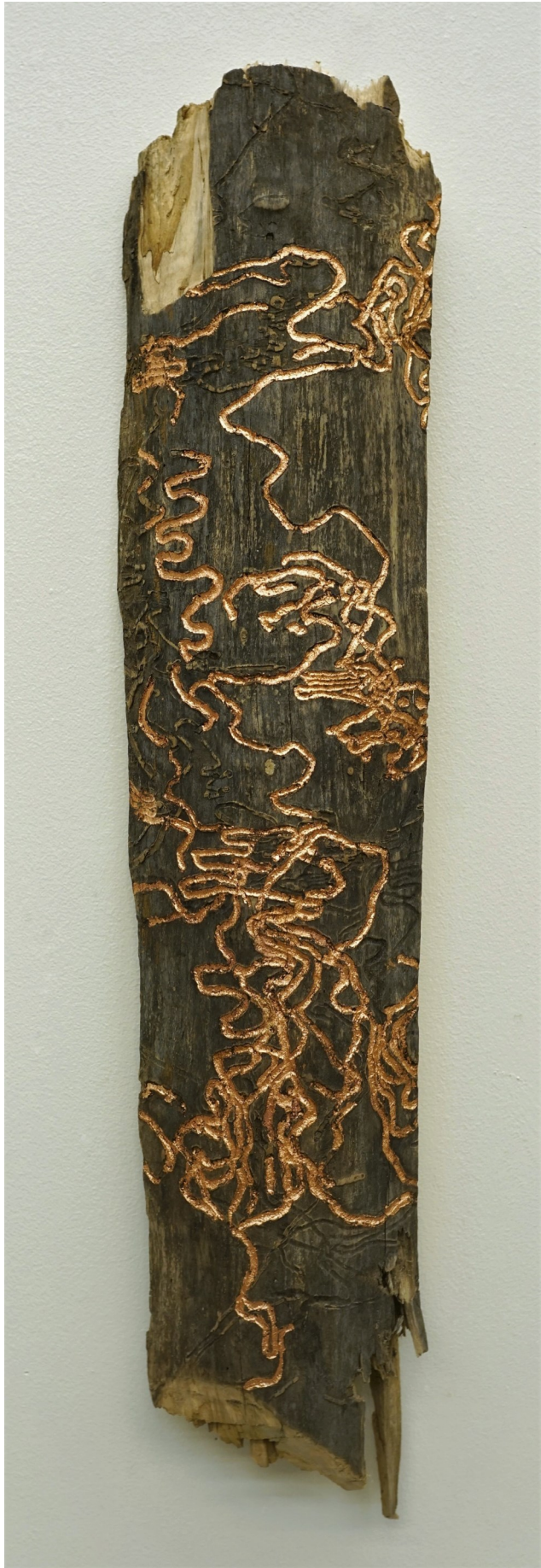
Figure 1: Repair 1