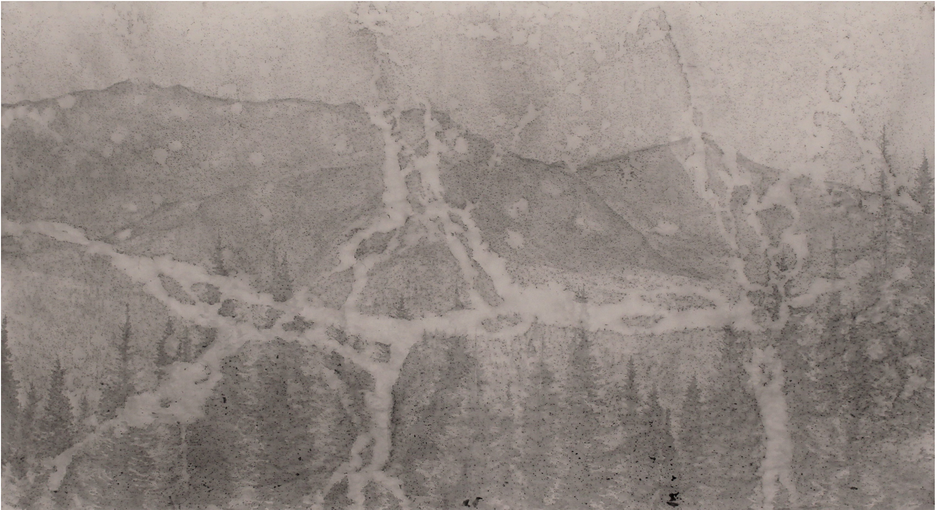
Figure 8: [Un]trammeled