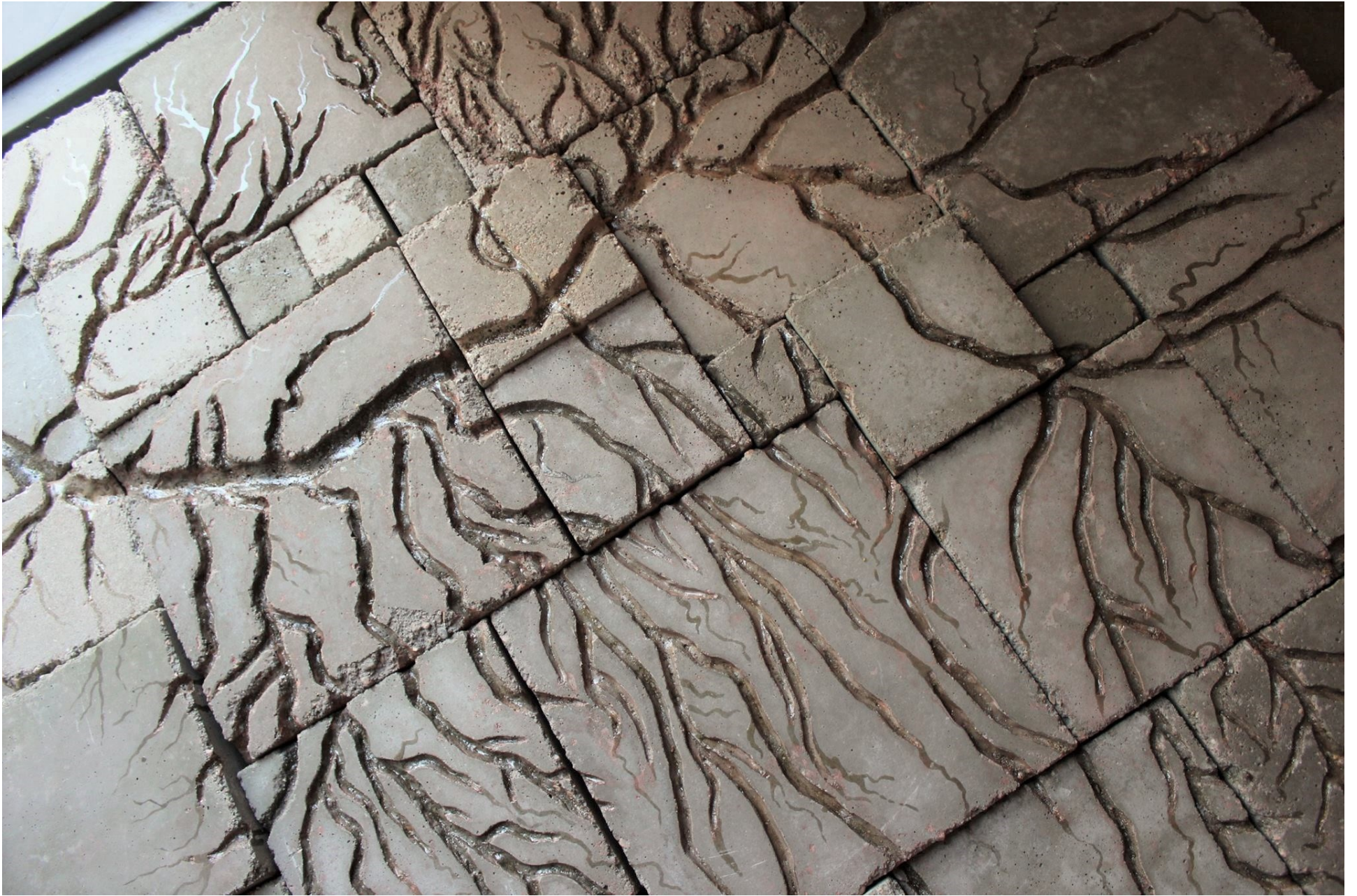
Figure 6: Fixed River [detail]