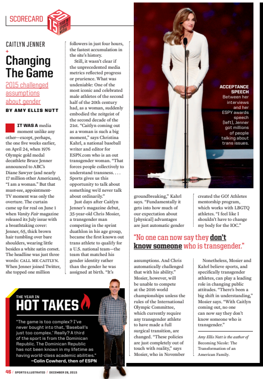
Figure 4: Caitlyn Jenner

A hyper-feminine image of Jenner in a stylish white dress standing at the microphone during a speech at the ESPY awards serves as the visual image of this package. It explicitly