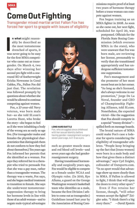
Figure 3: Fallon Fox