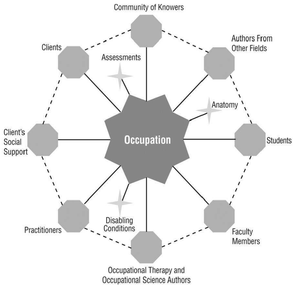
Figure 1. The model of Subject Centered Integrative Learning for Occupational Therapy (SCIL-OT). Hooper, 2015.