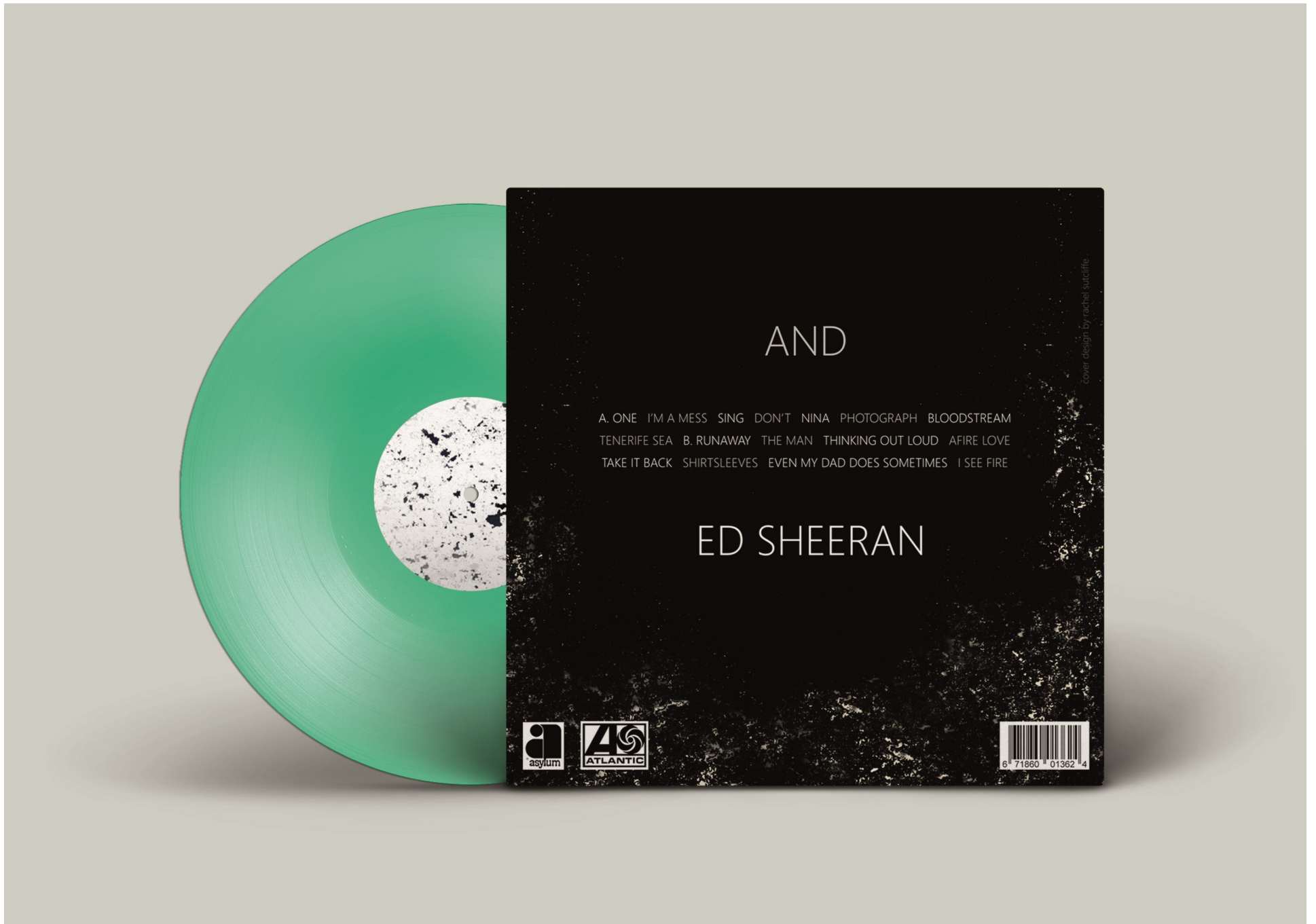
Figure 10: Vinyl Record Album and Jacket: Ed Sheeran (Back)