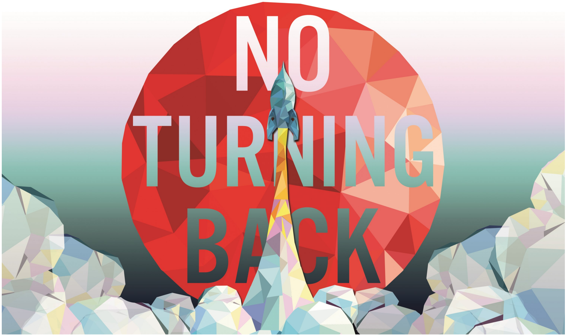
Figure 7: Living on Mars