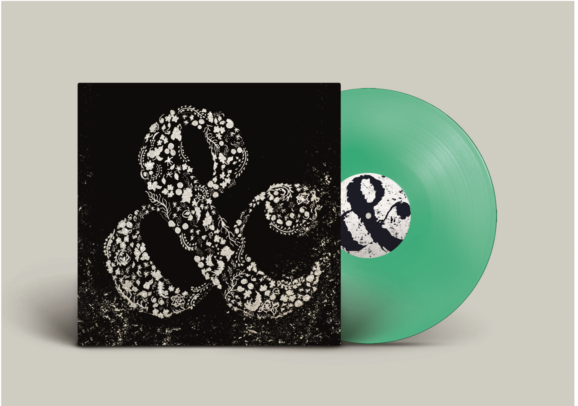
Figure 9: Vinyl Record Album and Jacket: Ed Sheeran (Front)