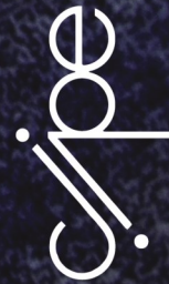
Figure 3: CIPE Poster for a Social Cause 2

19th Biennial CIPE September 18-October 28, 2015 Curfman Gallery, Lory Student Center Clara Hatton Gallery, Visual Arts Building Opening Reception on September 18 Judge's Lectures on September 16 Colorado State University