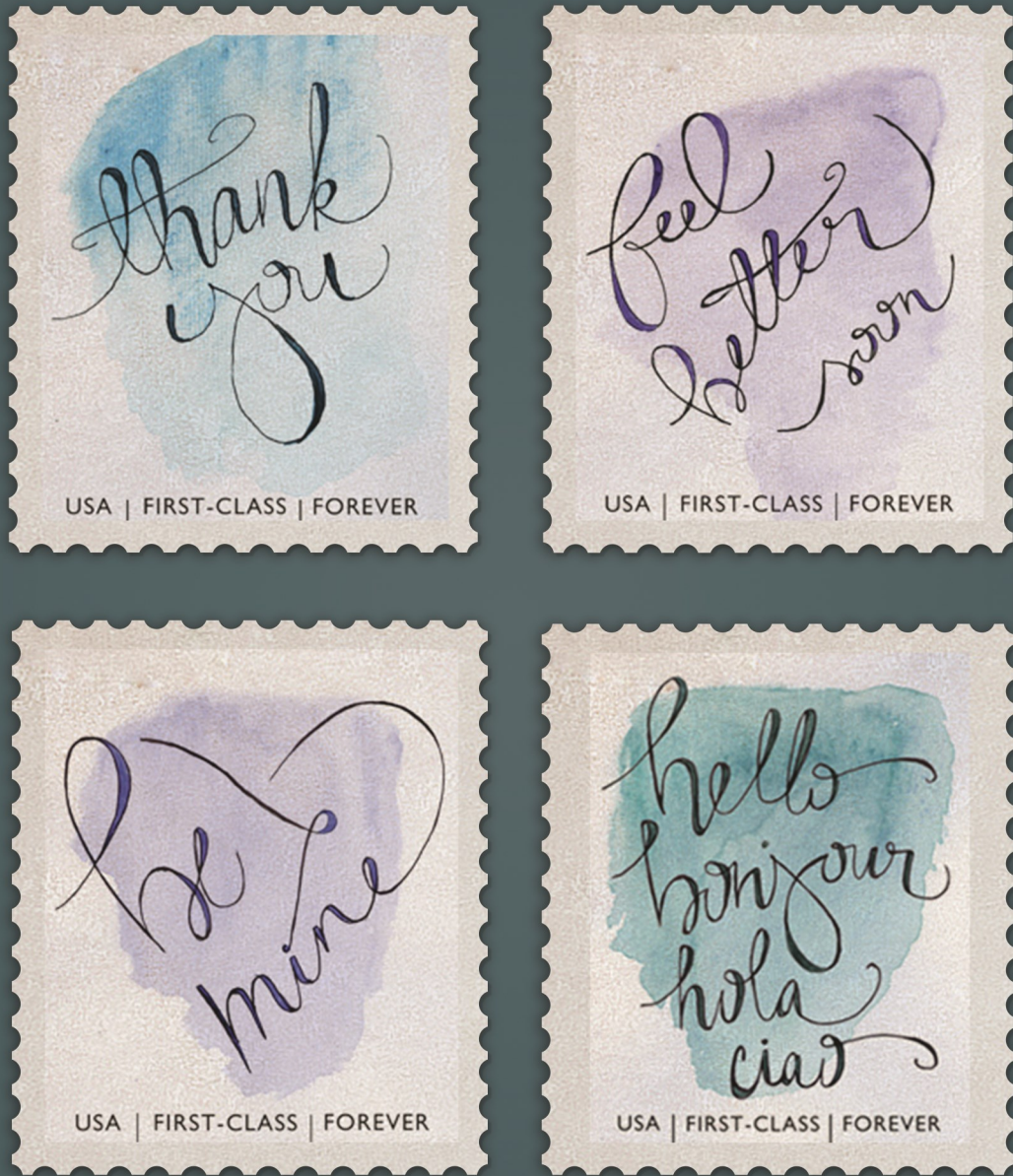
Figure 8: Forever Postage Stamp Set