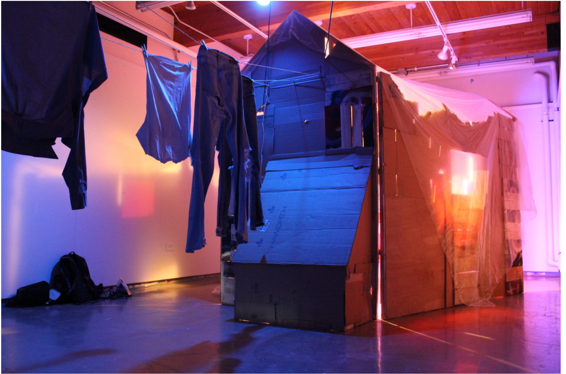
Figure 1: Best Kept Secrets