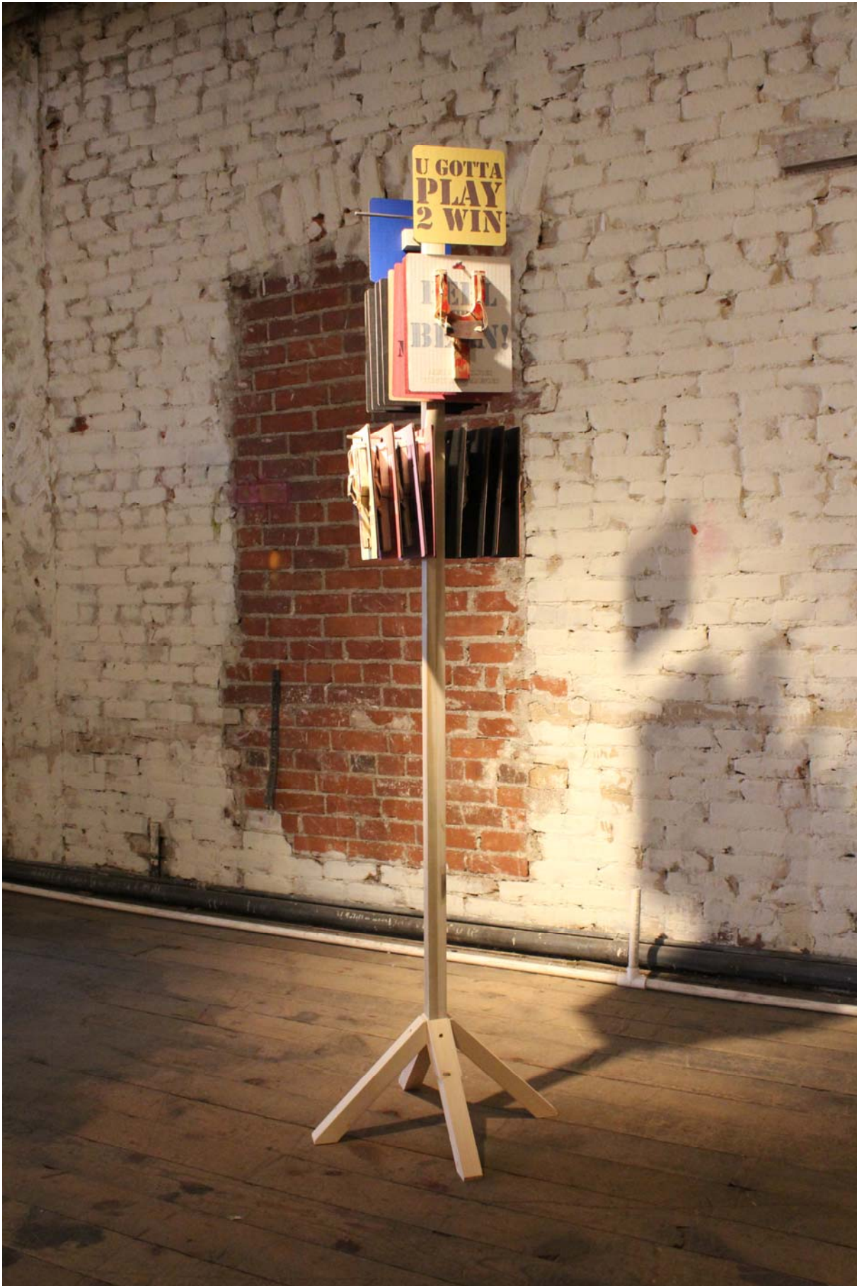
Figure 7: U Gotta Play 2 Win