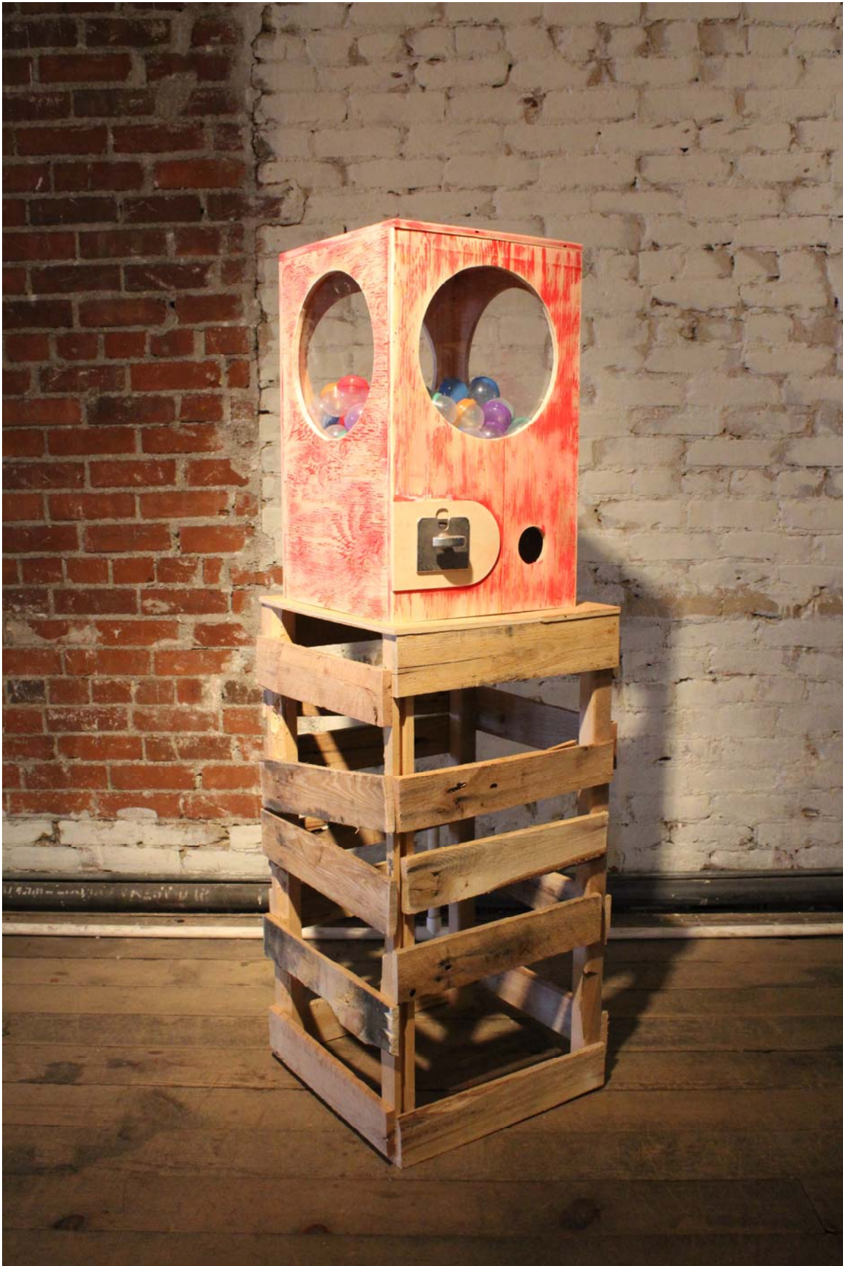
Figure 6: Lowbrow Distribution Method