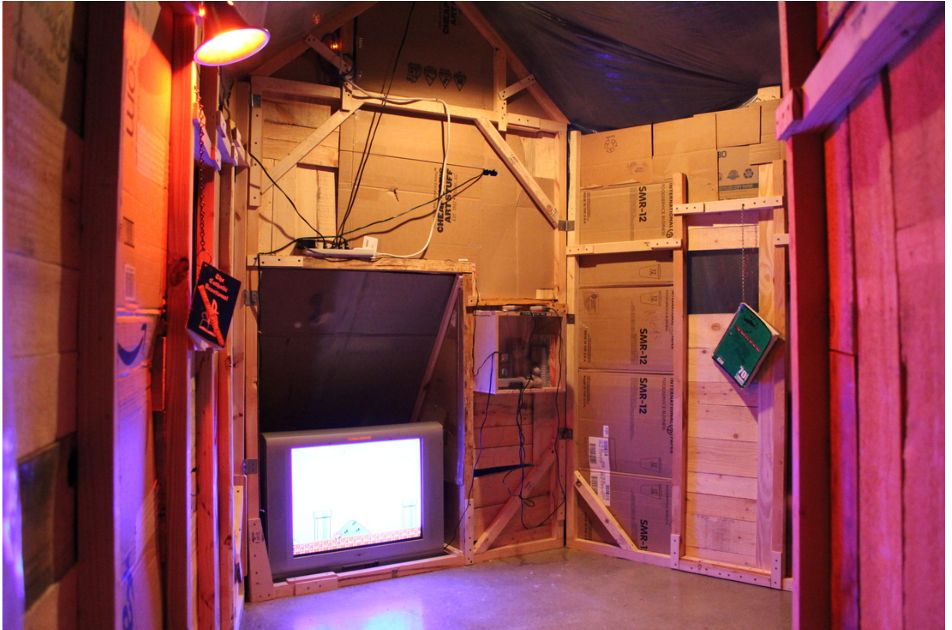
Figure 3: Best Kept Secrets (detail 2)