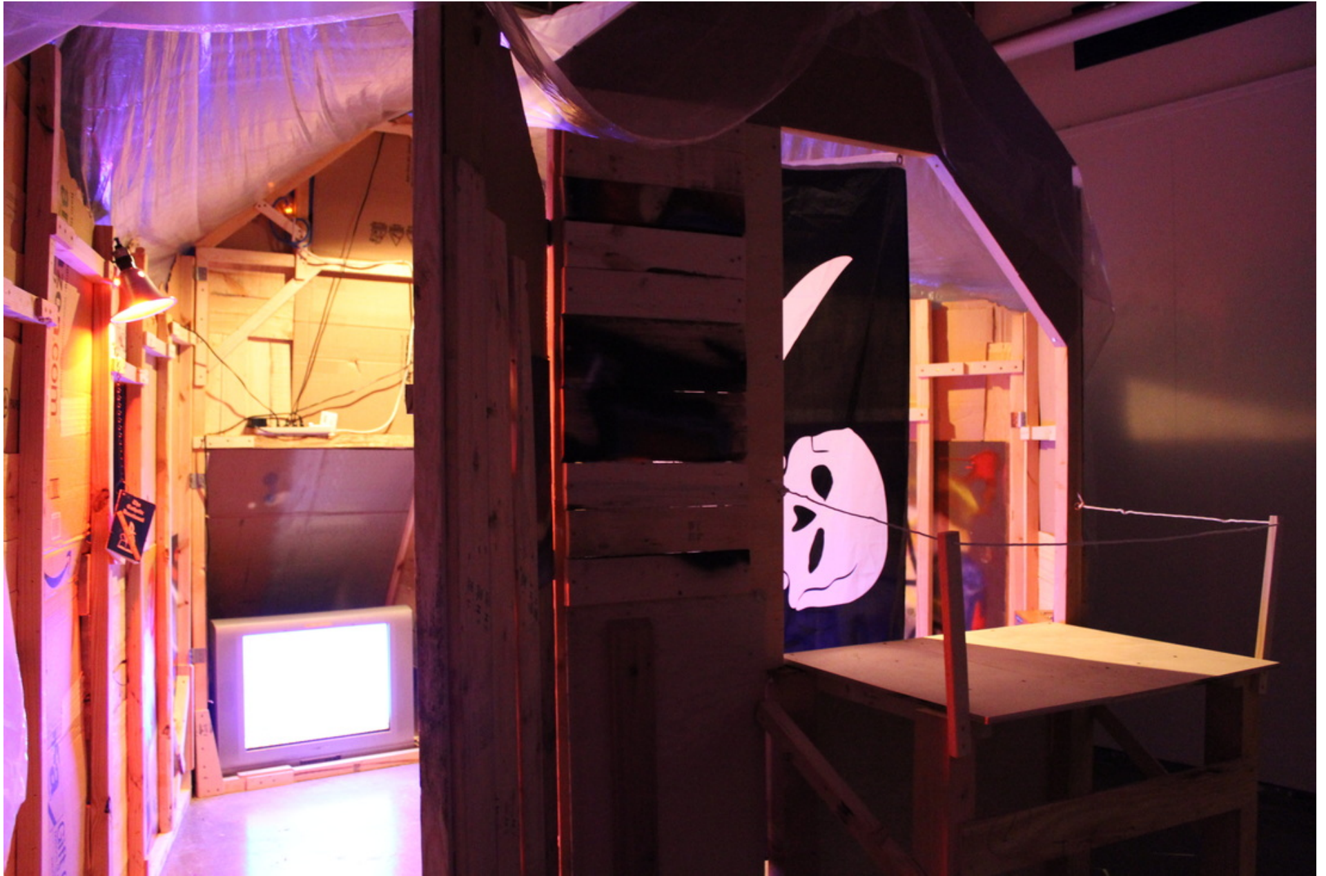
Figure 2: Best Kept Secrets (detail 1)