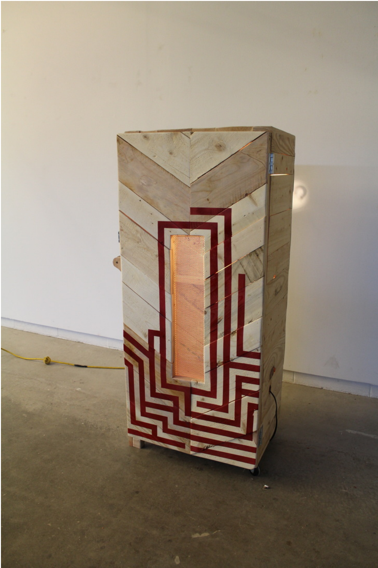
Figure 5: Odd Talker (detail 1)