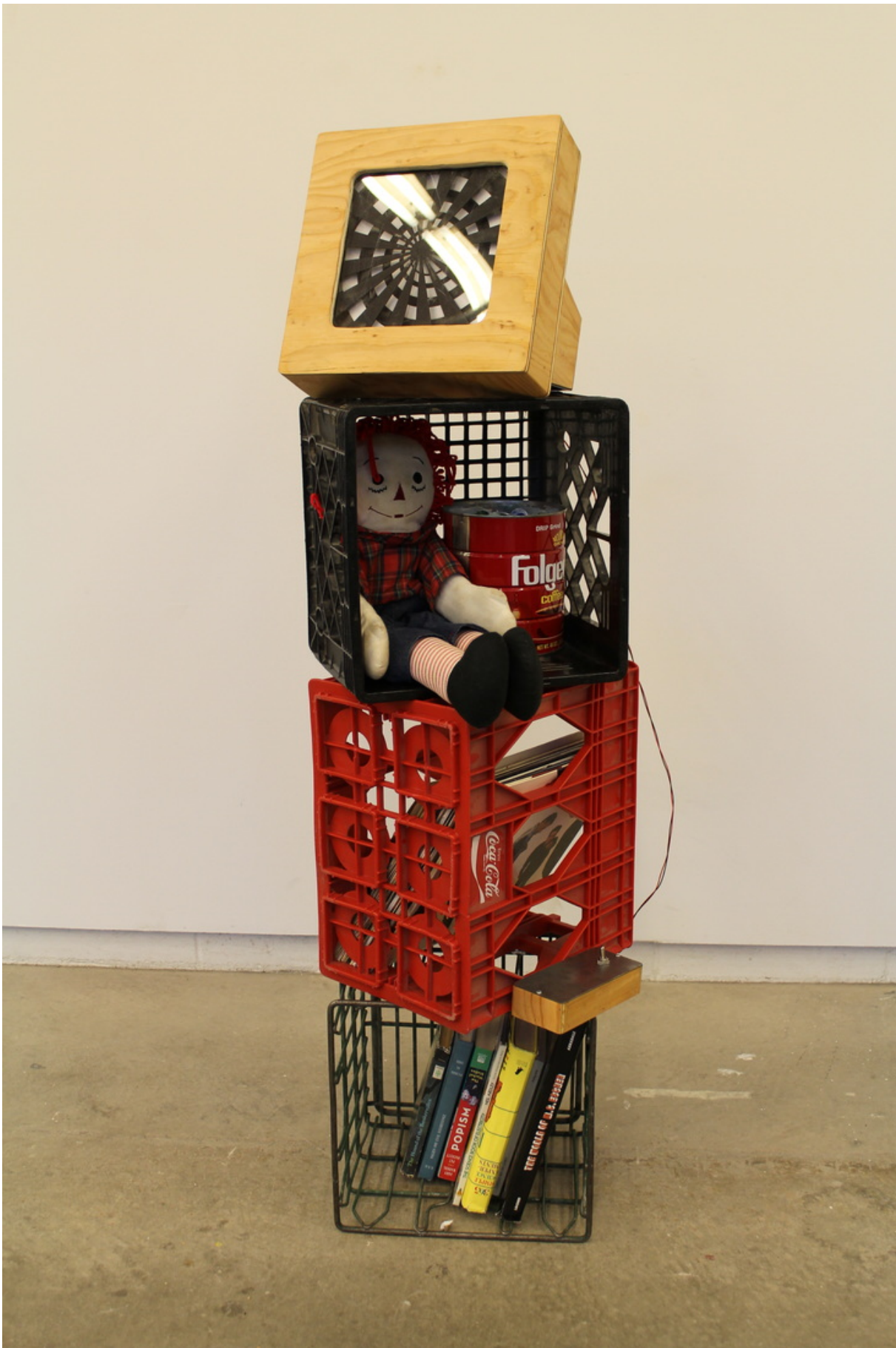
Figure 9: Hypno-TV