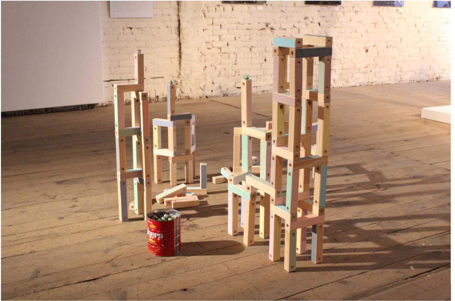
Figure 8: Builder's Block System