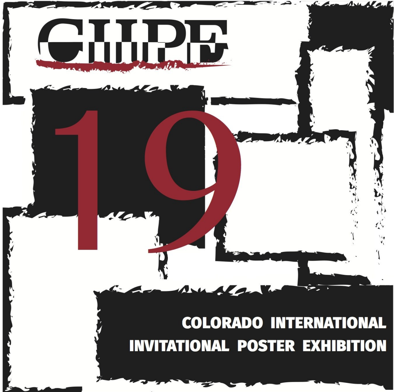
Figure 4: CIPE Catalog Cover.