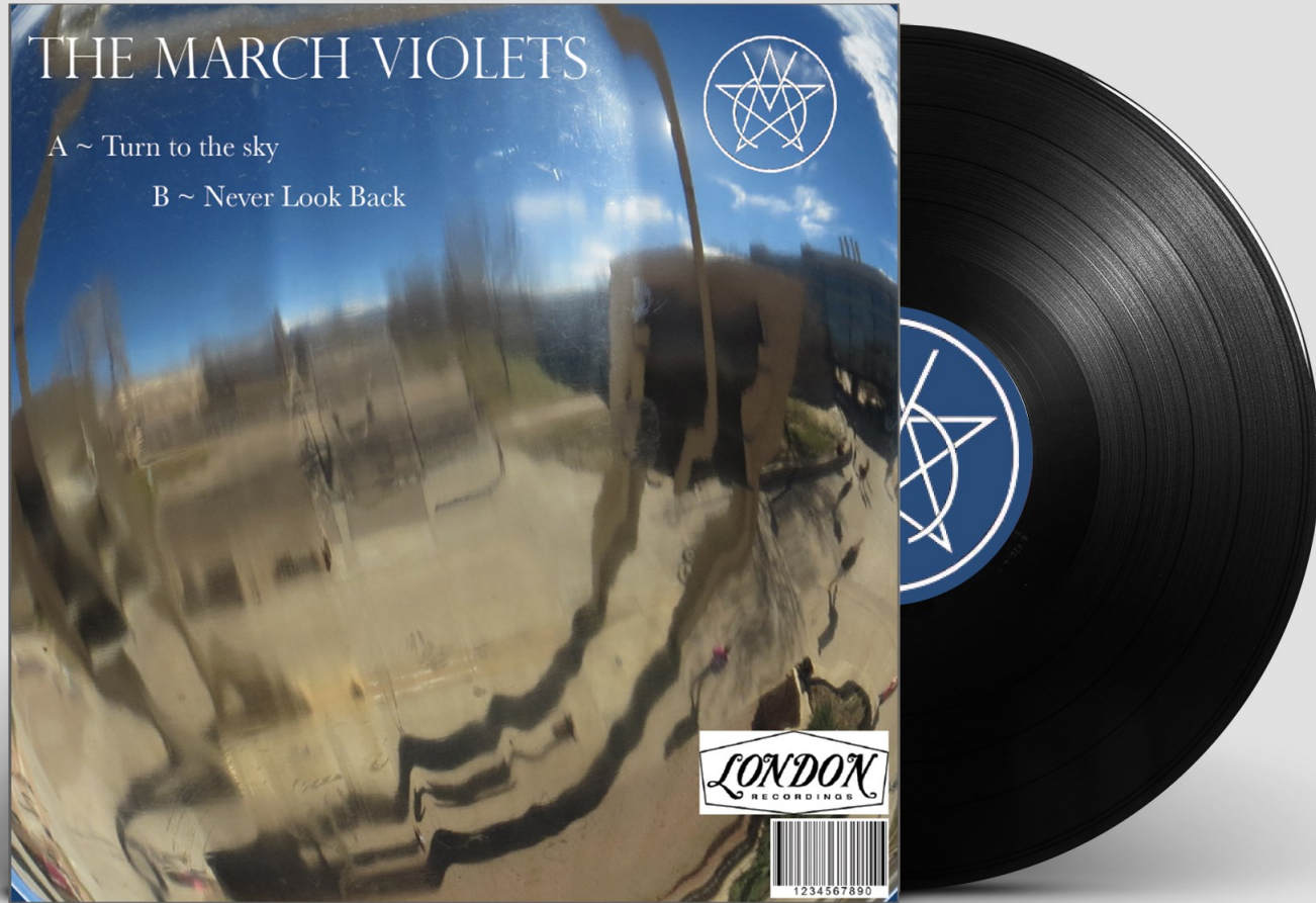
Figure 8: Vinyl Back Cover.