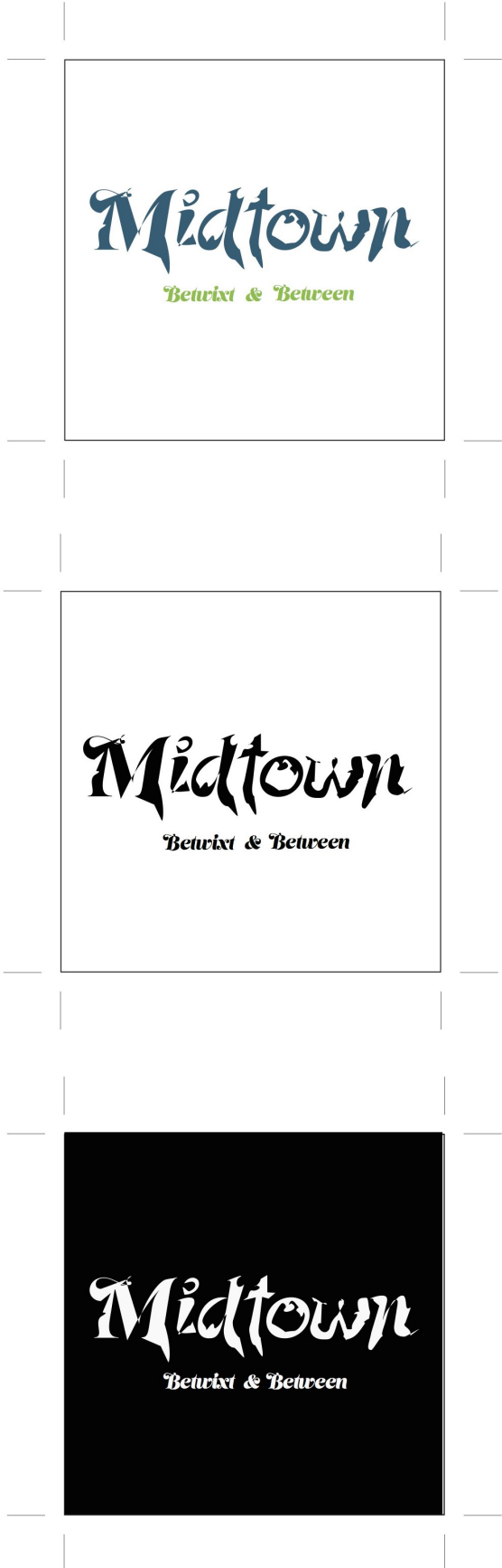
Figure 5: Midtown Logo.