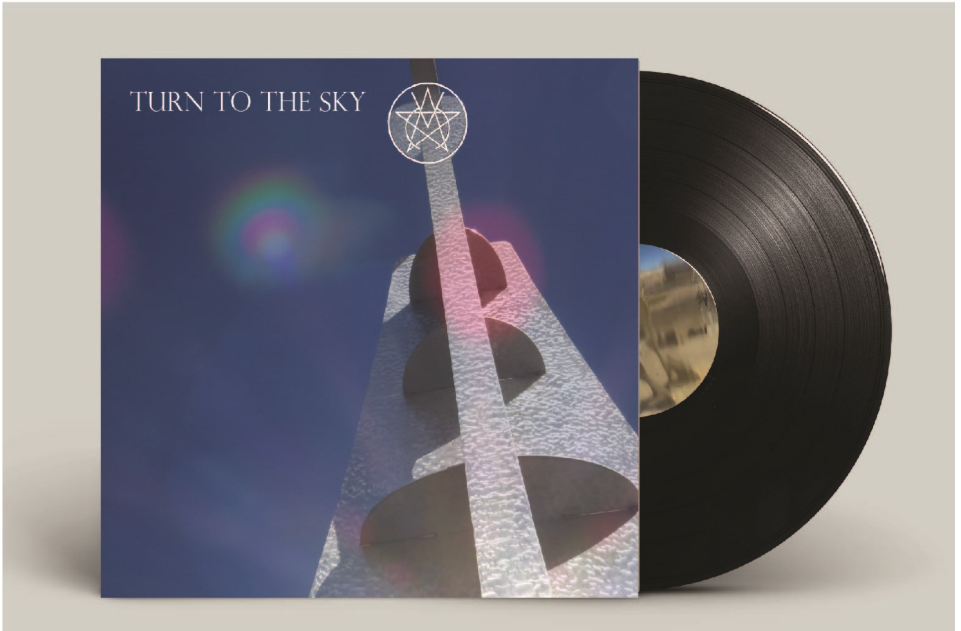
Figure 7: Vinyl Front Cover.