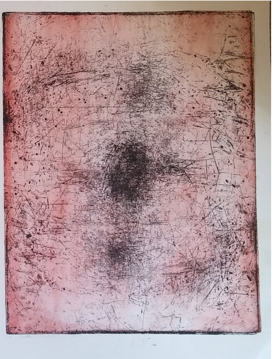
Figure 3: Inside & Out