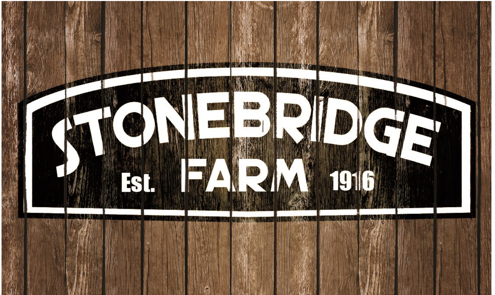
Figure 7: Stonebridge Signage