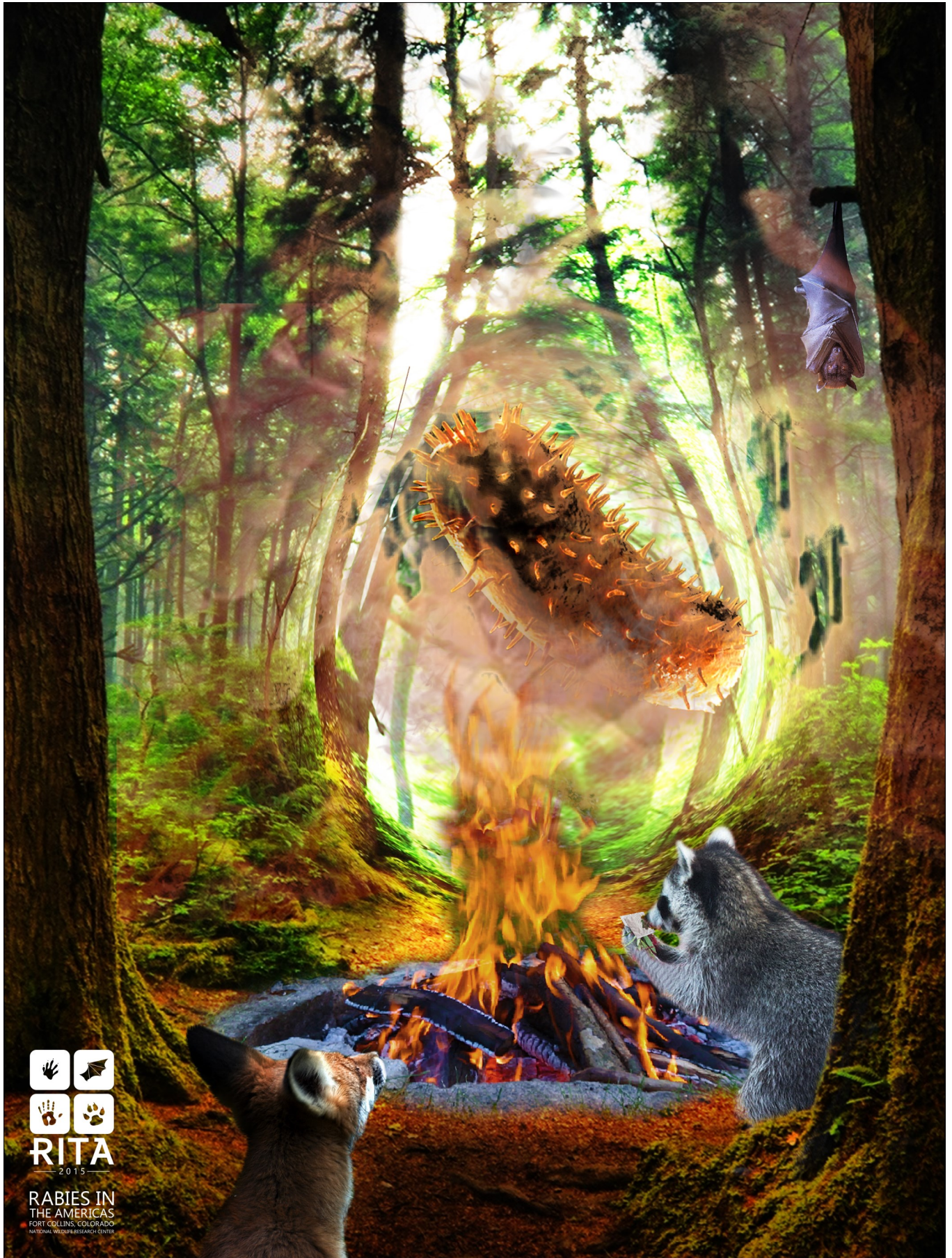
Figure 5: NWRC Conference Poster