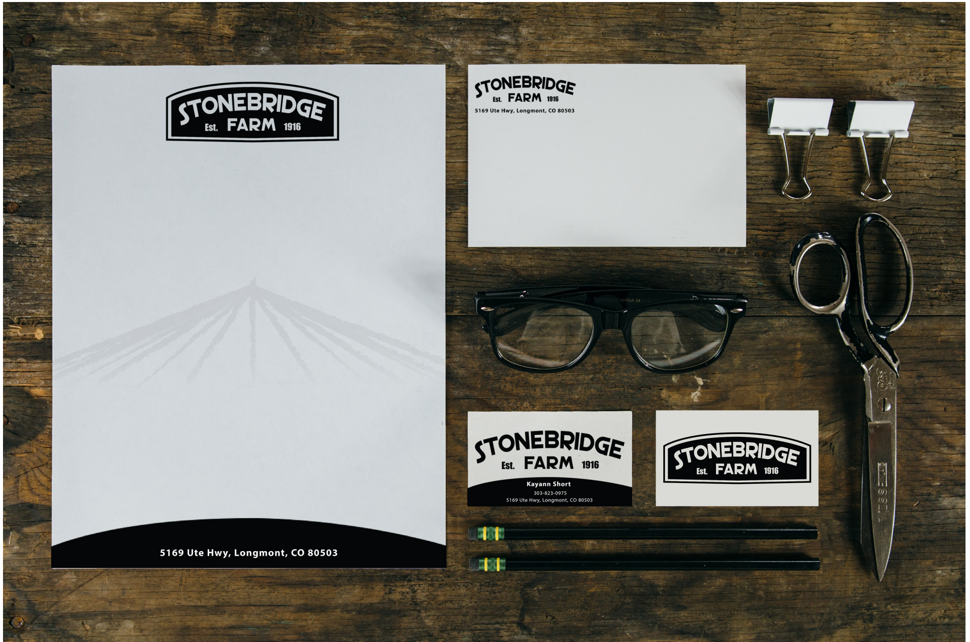
Figure 9: Stonebridge Stationery