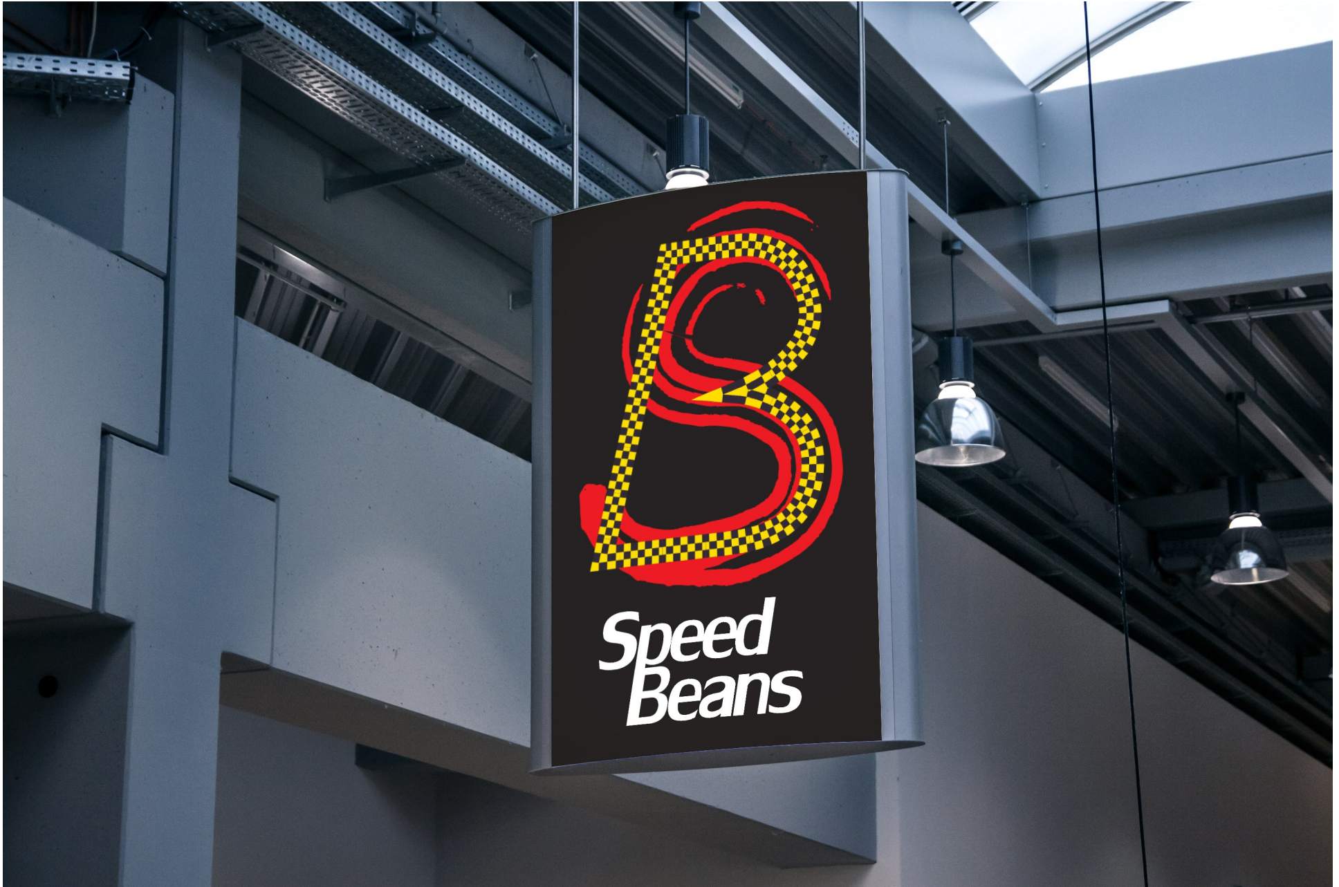
Figure 1: SpeedBeans Signage