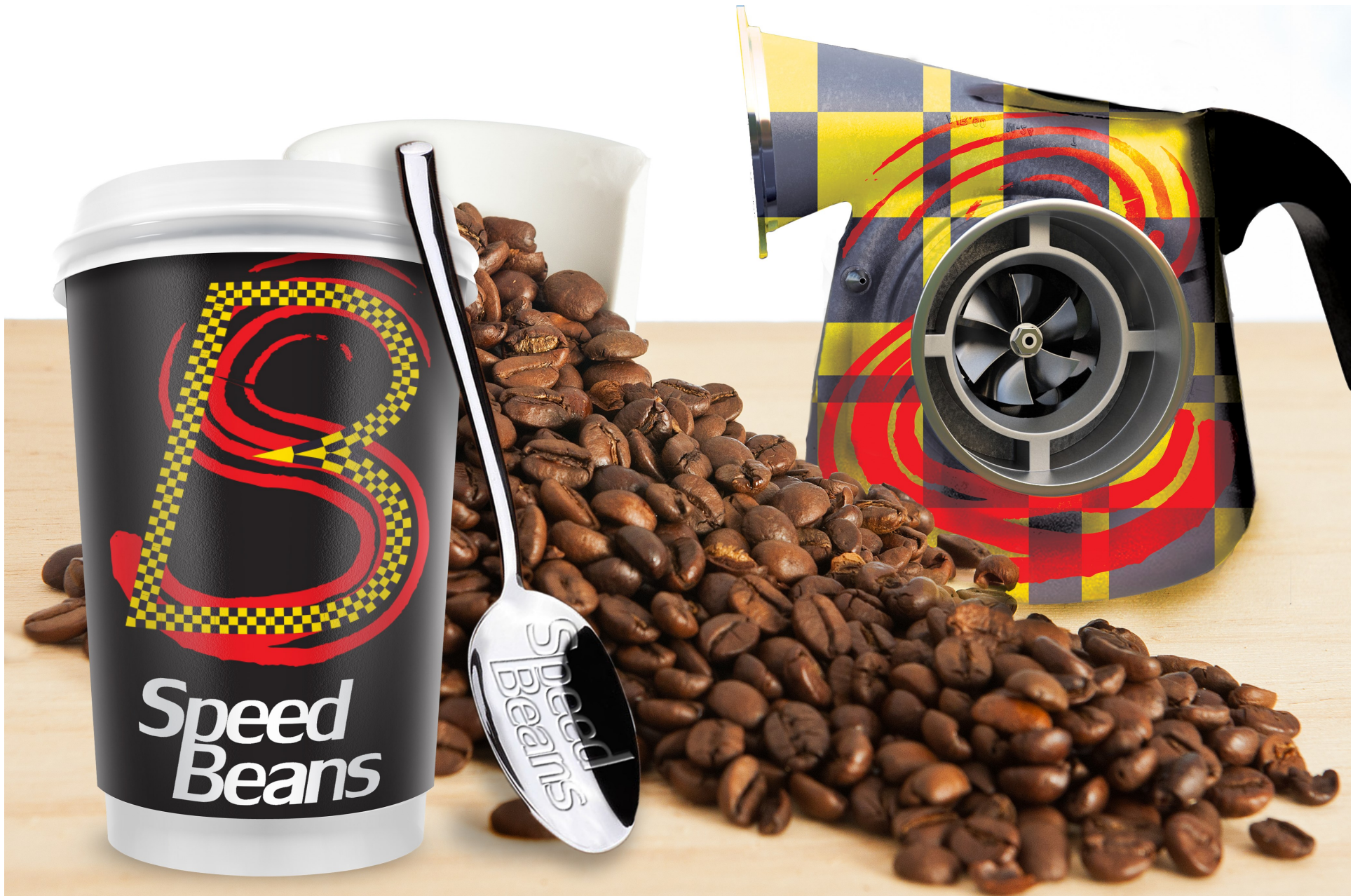
Figure 2: SpeedBeans Products