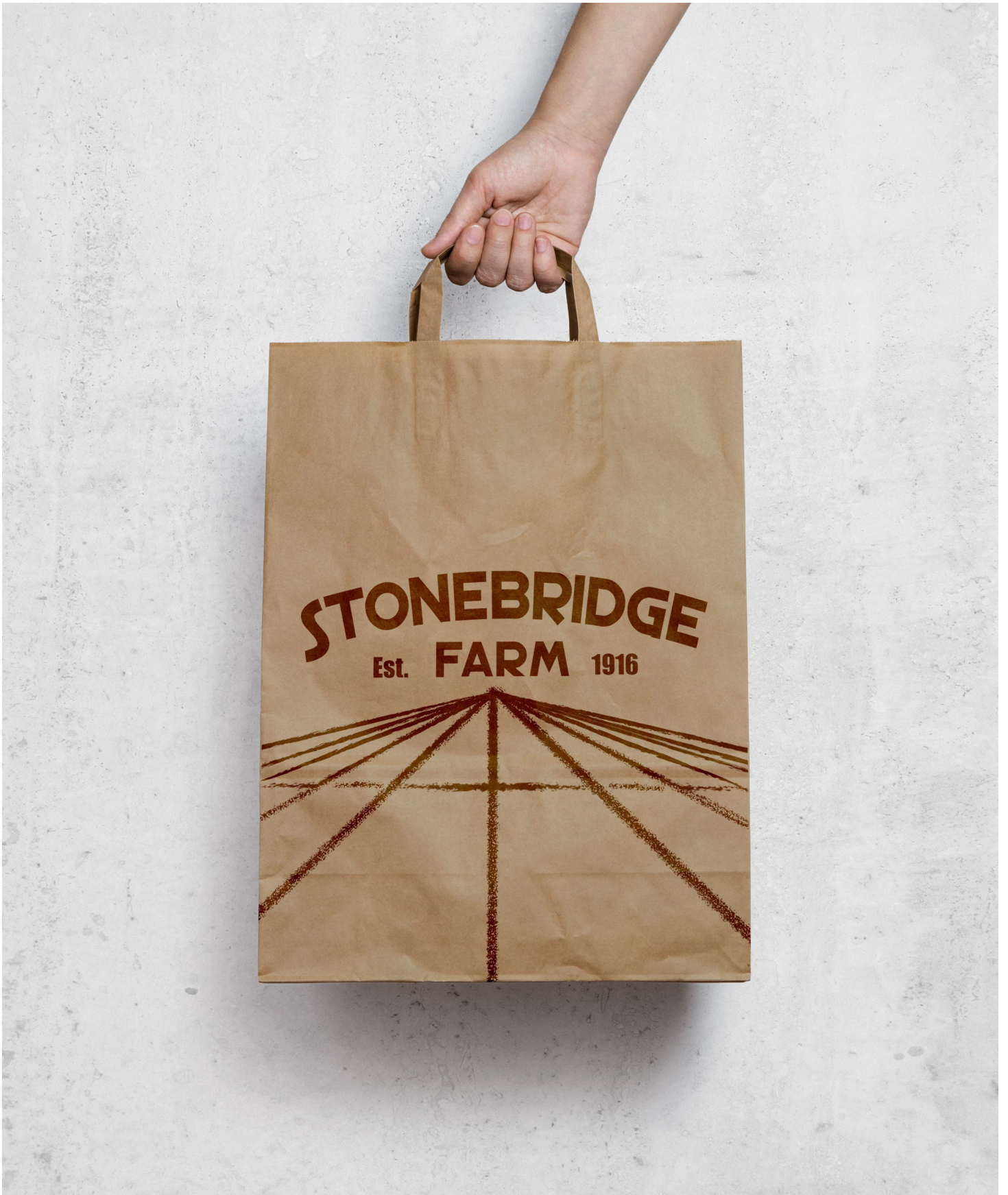
Figure 10: Stonebridge Produce Bag