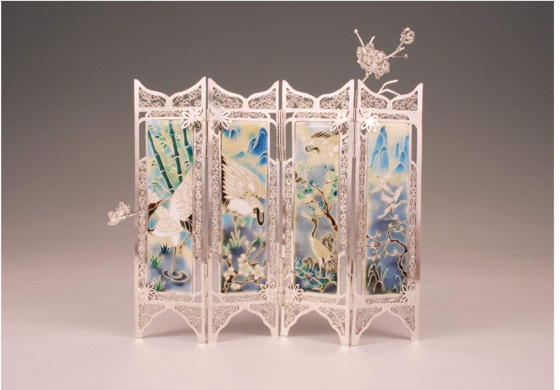
Figure 1: The Crane and Plum