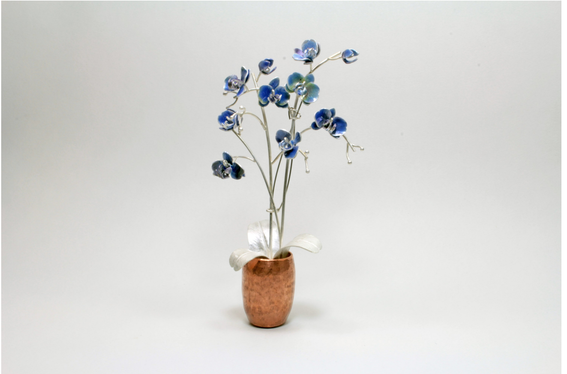
Figure 9: The Blue Memory 1