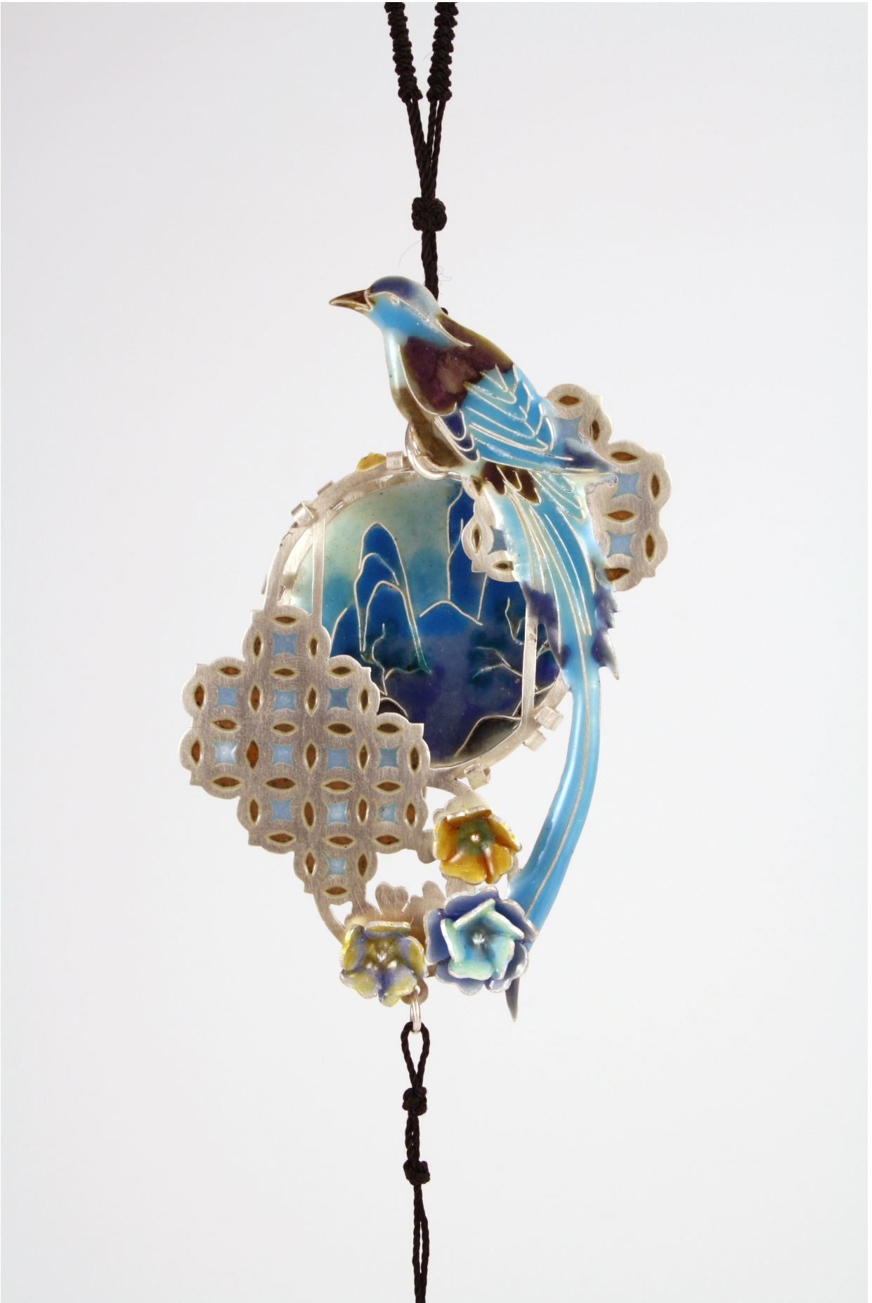
Figure 15: View of the Mountains with a Bird and Flowers (Detail)