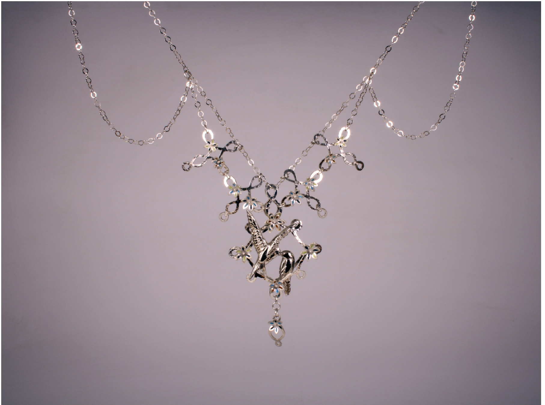
Figure 8: Going Back