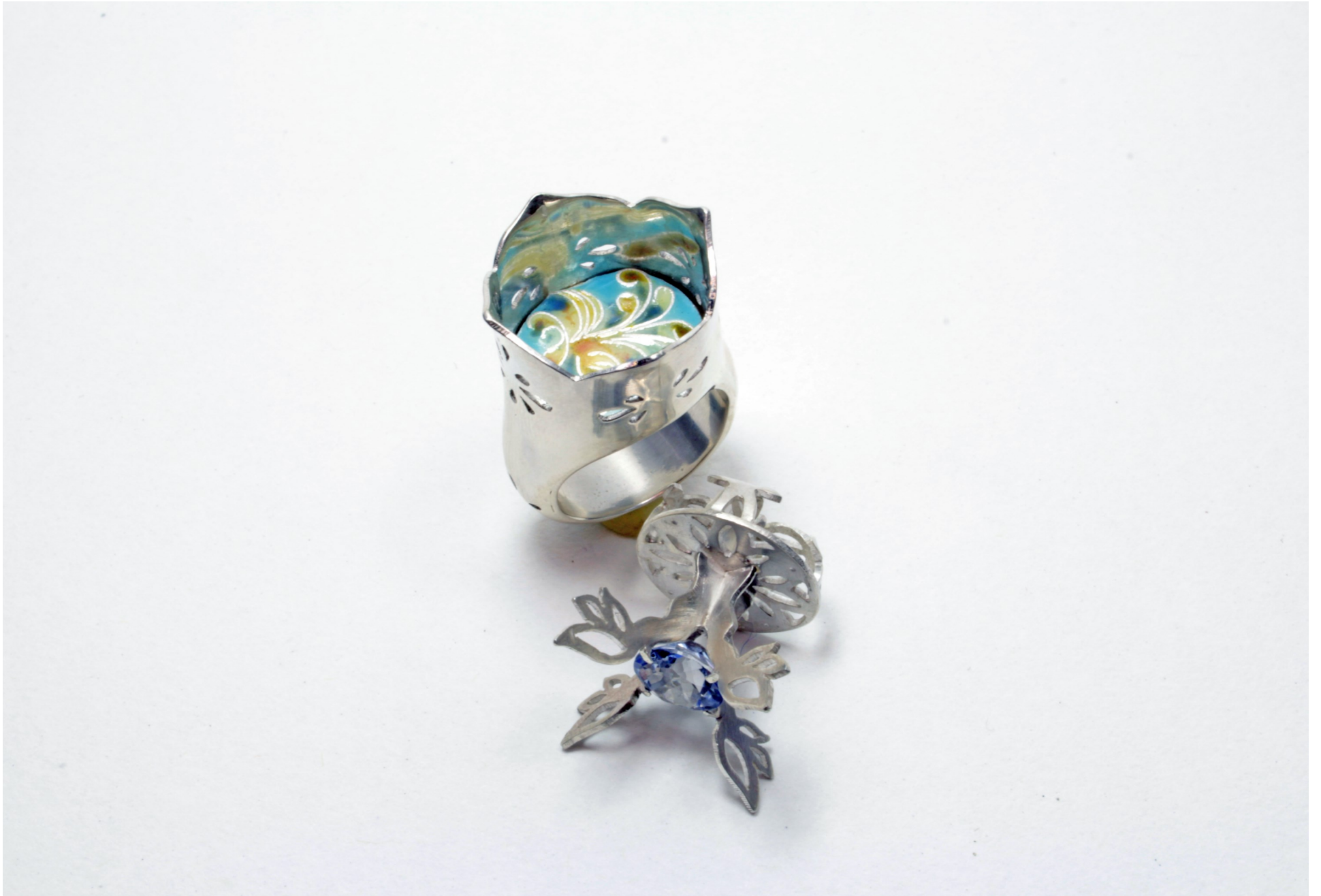
Figure 4: Waiting for Renascence (open)