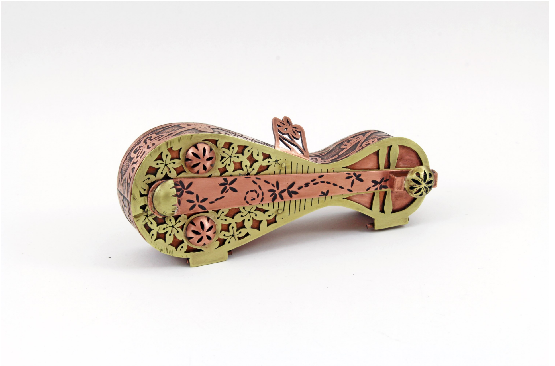
Figure 19: The Pipa Box