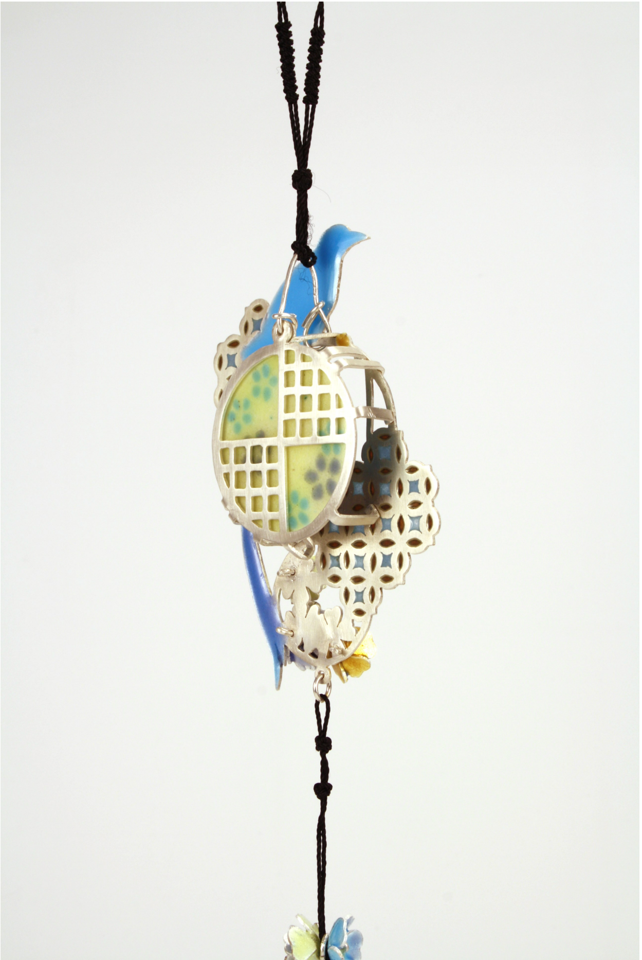
Figure 16: View of the Mountains with a Bird and Flowers (Back View)