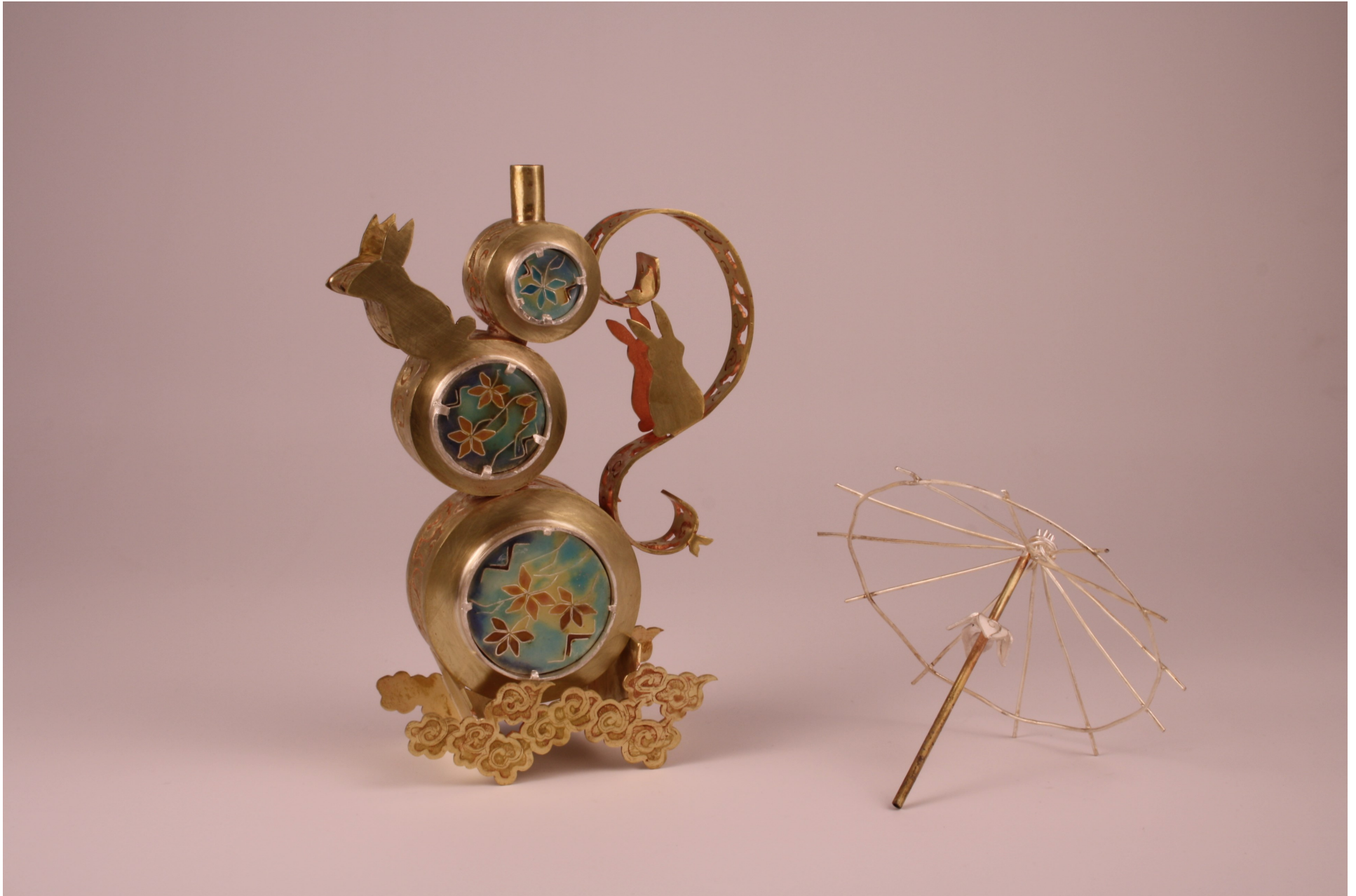
Figure 12: The Rabbit in the Moon Palace -2