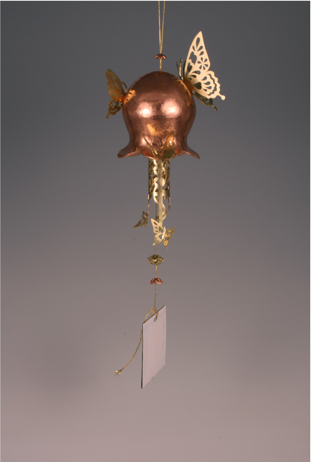
Figure 17: The blessing