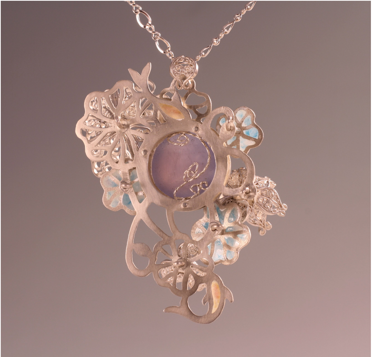
Figure 7: Heart of the Water (back view)