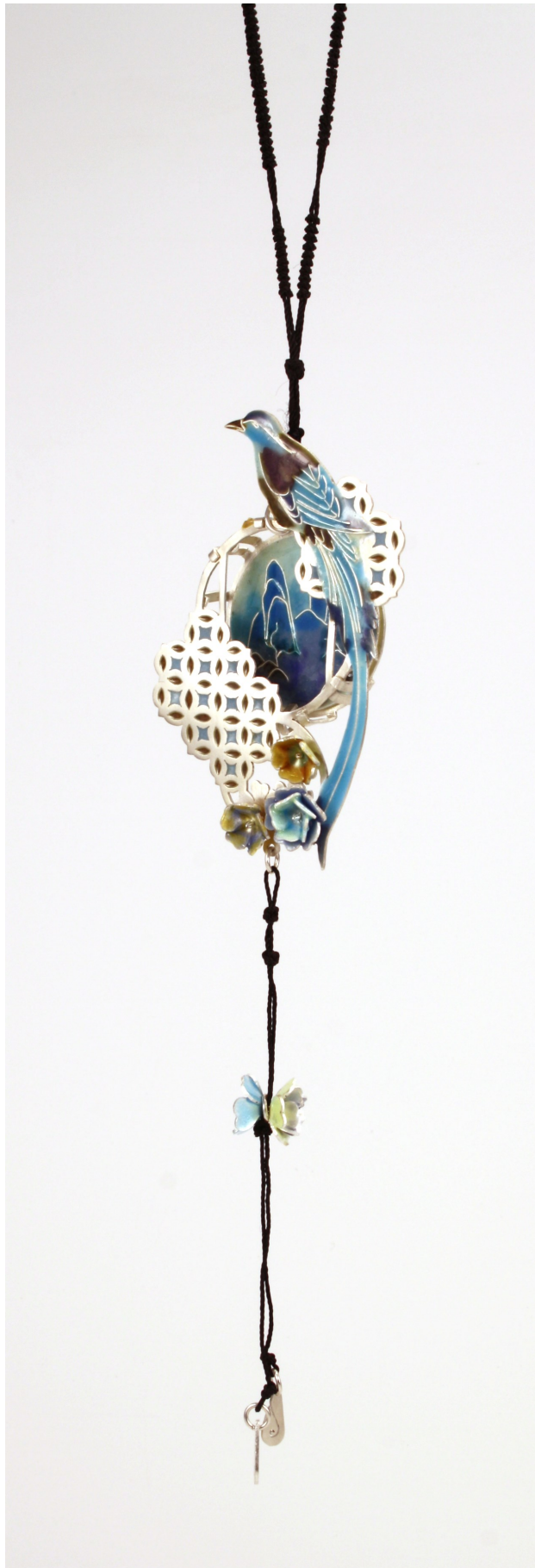
Figure 14: View of the Mountains with a Bird and Flowers