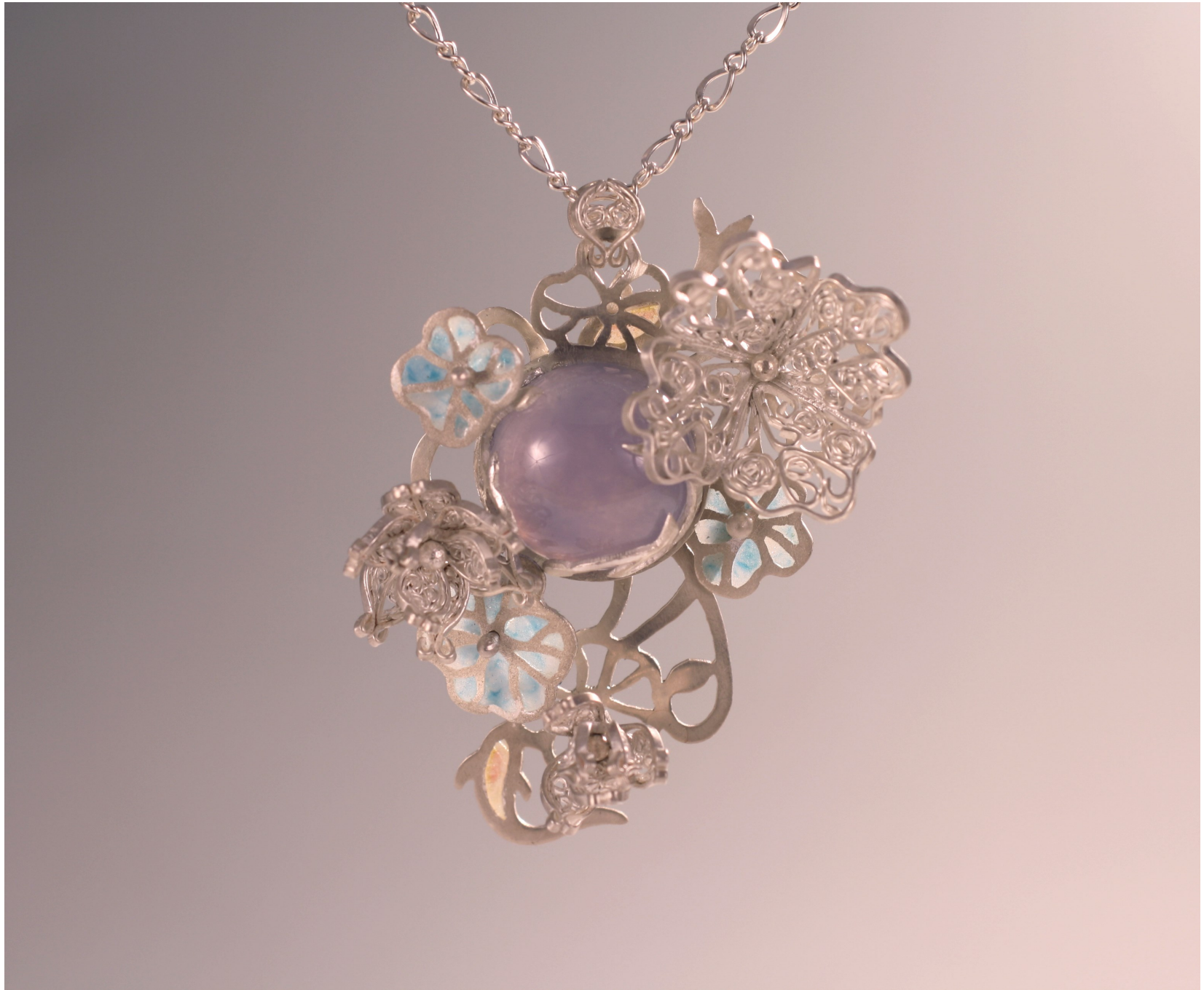
Figure 5: Heart of the Water (front view)