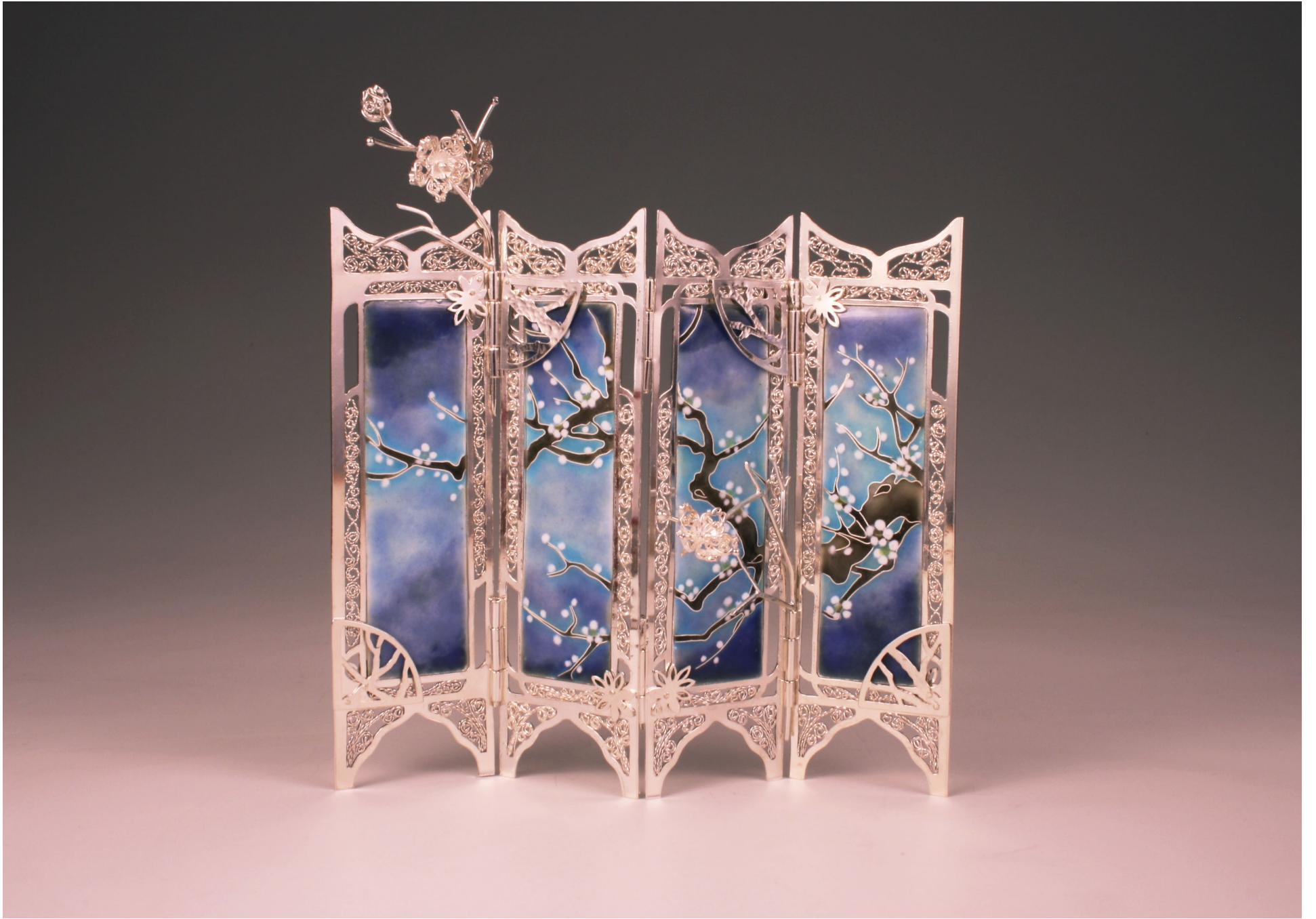
Figure 2: The Crane and Plum