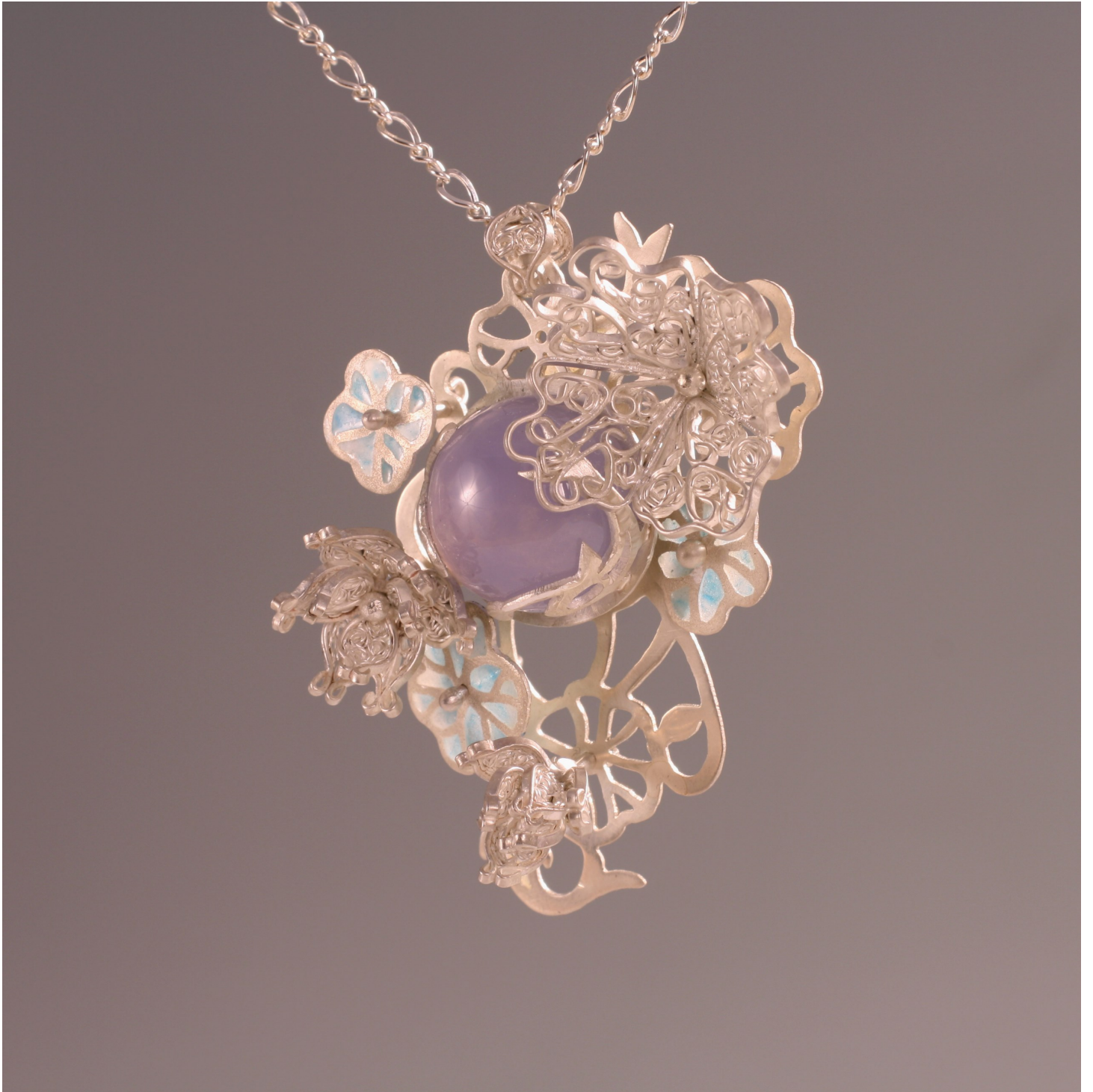
Figure 6: Heart of the Water (side view)