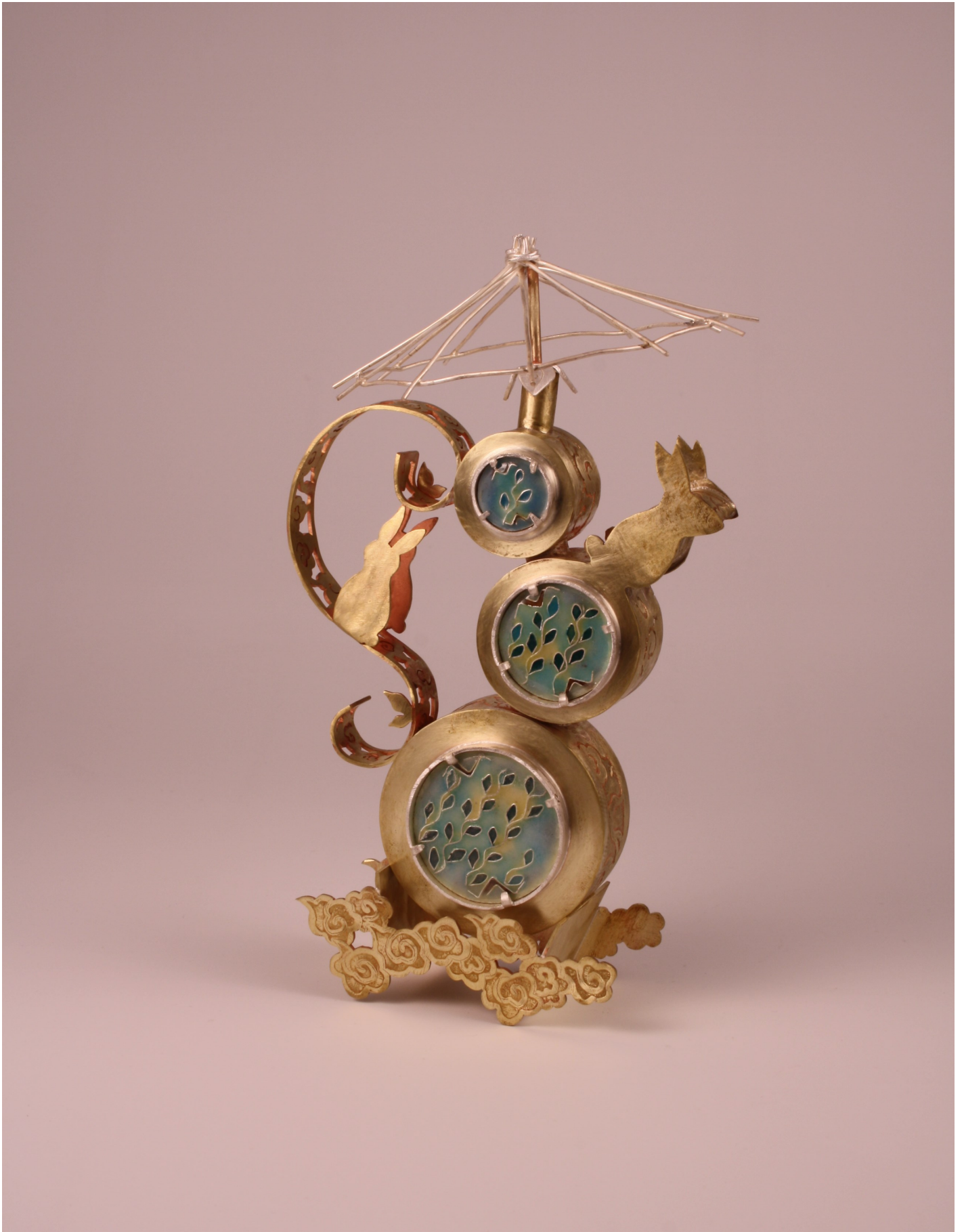
Figure 11: The Rabbit in the Moon Palace -1