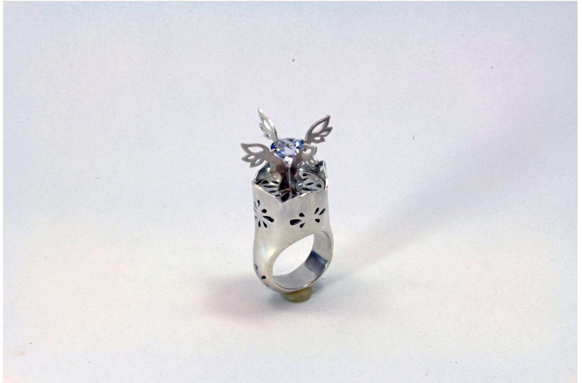
Figure 3: Waiting for Renascence (closed)