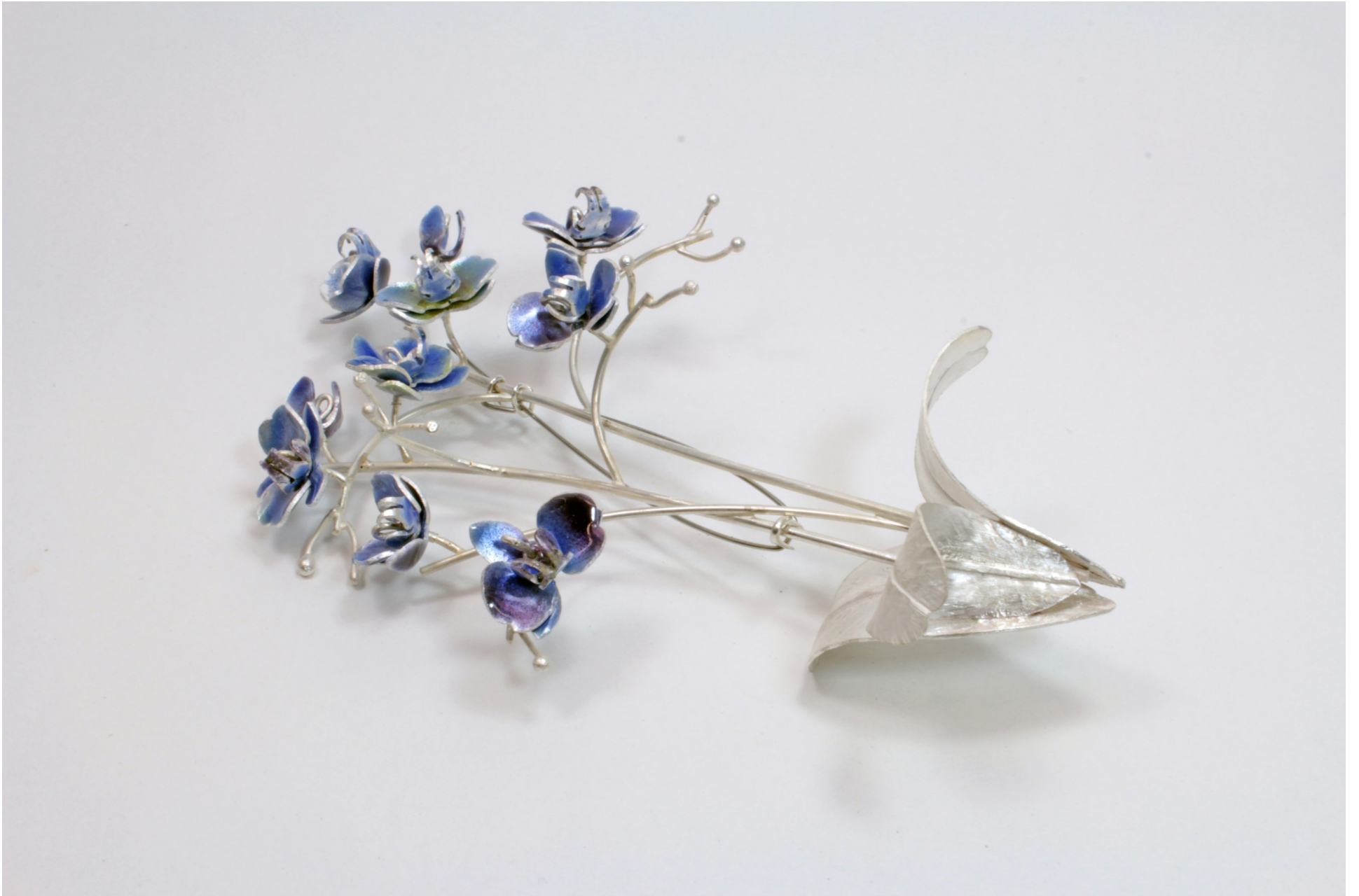
Figure 10: The Blue Memory 2