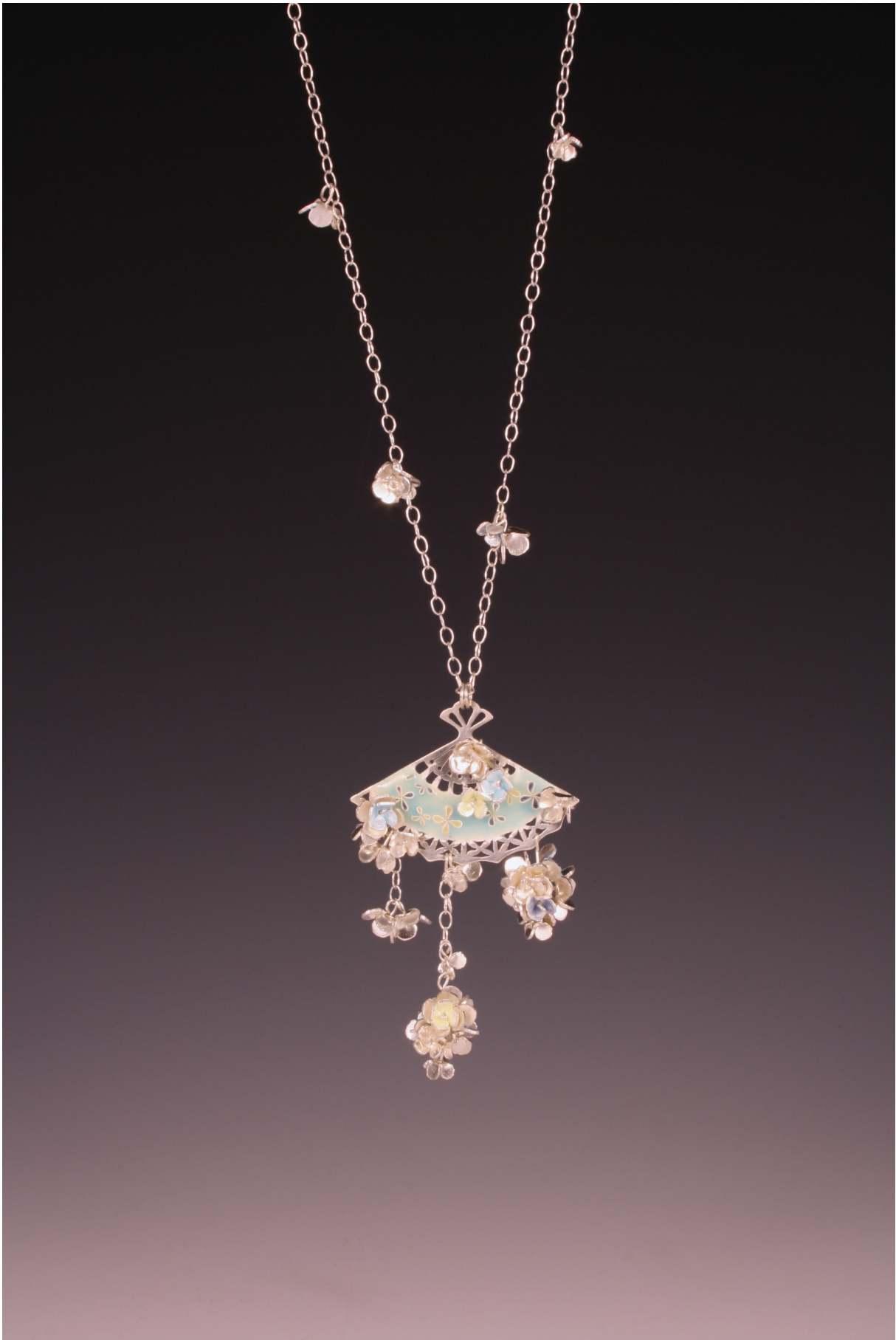
Figure 13: Coming True