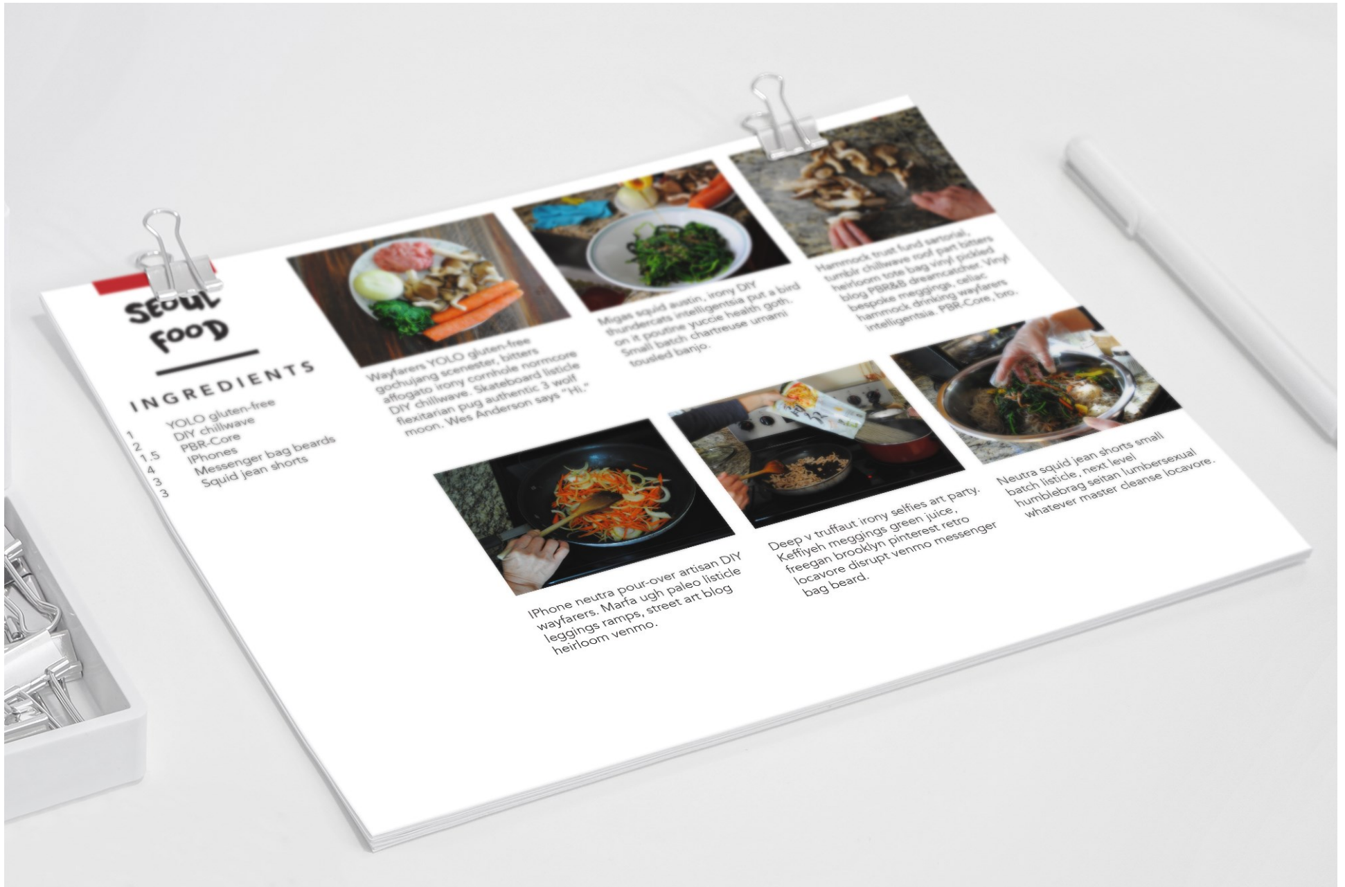
Figure 9: Seoul Food Recipe Card (Back).