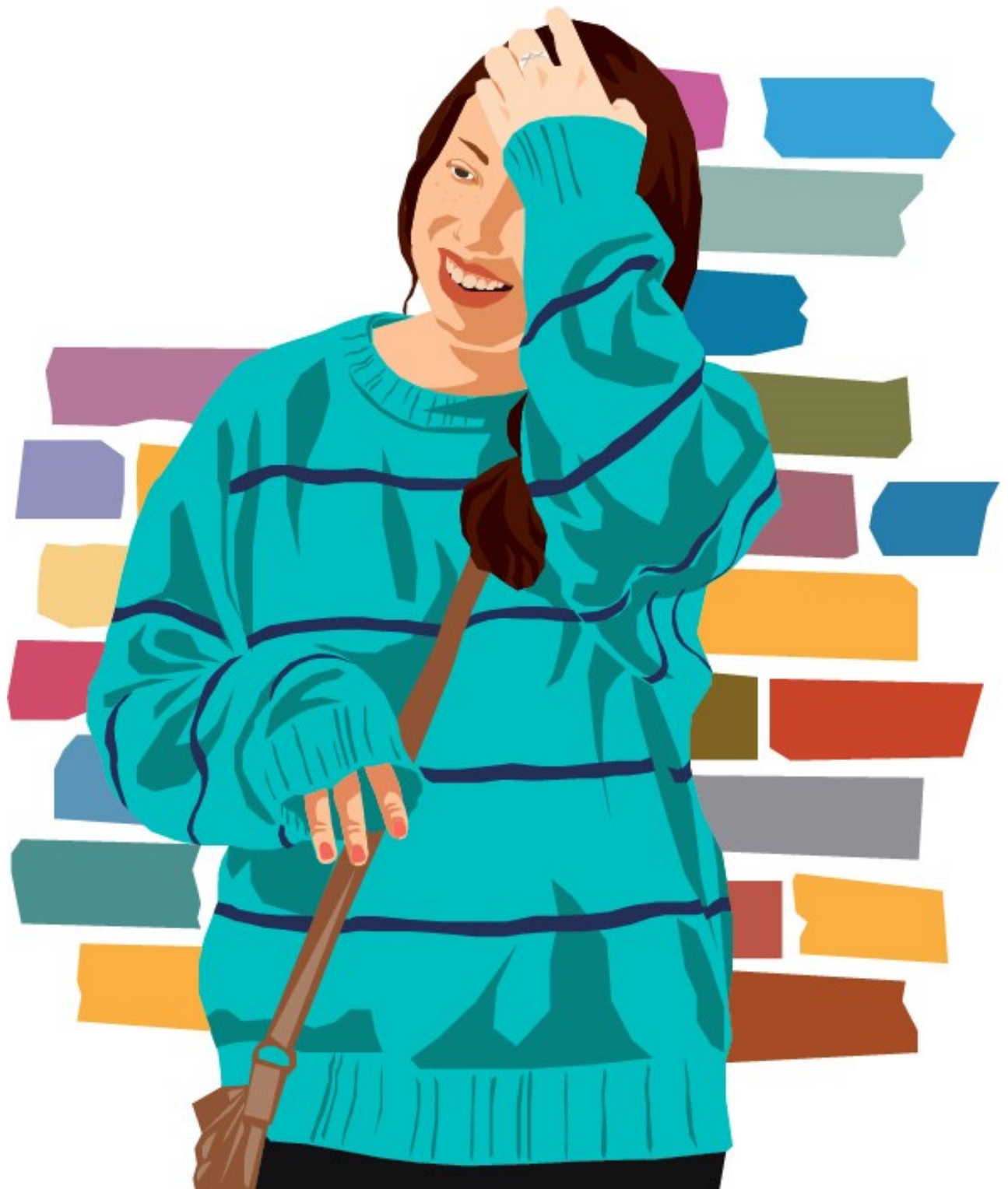
Figure 3: Vector Selfie.