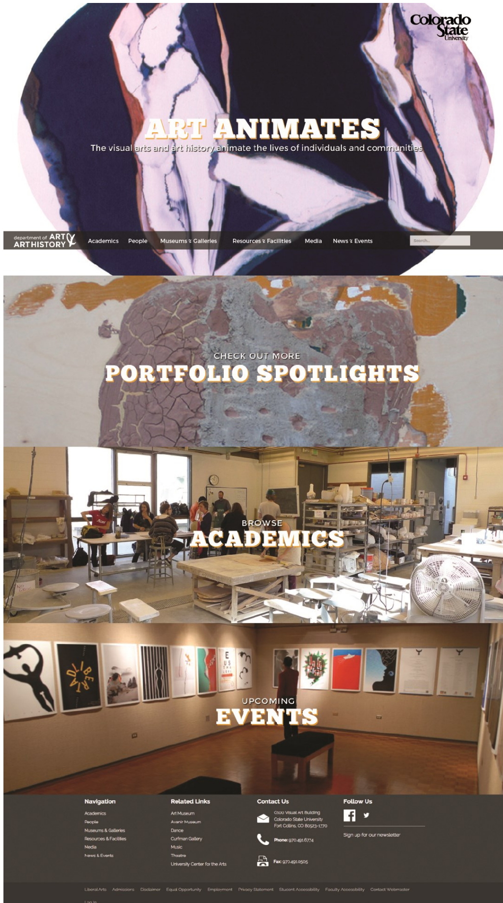
Figure 6: Art and Art History Website.