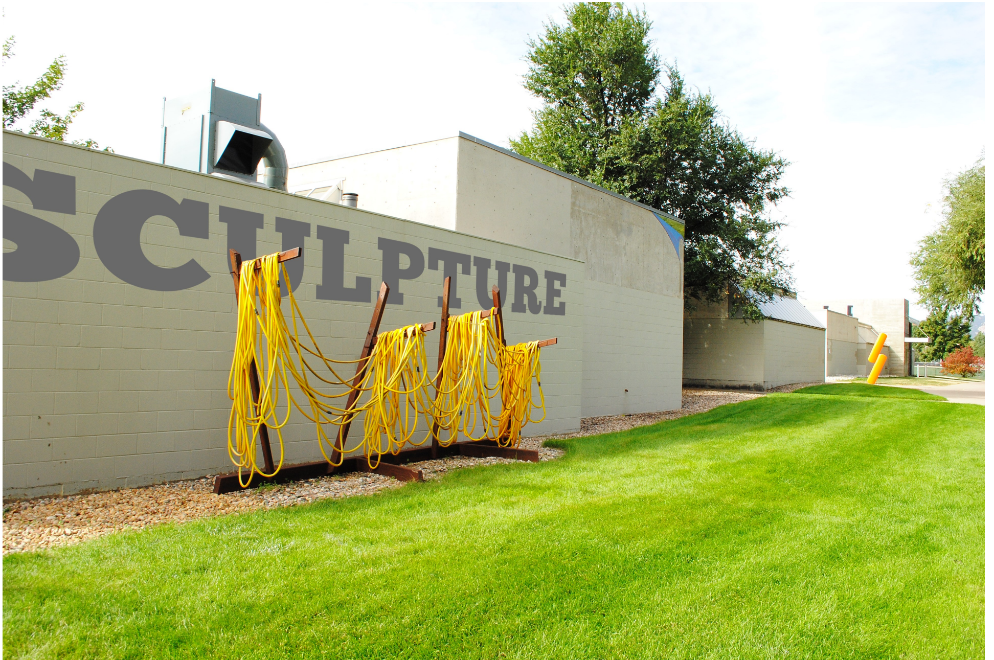
Figure 5: Sculpture Exterior.