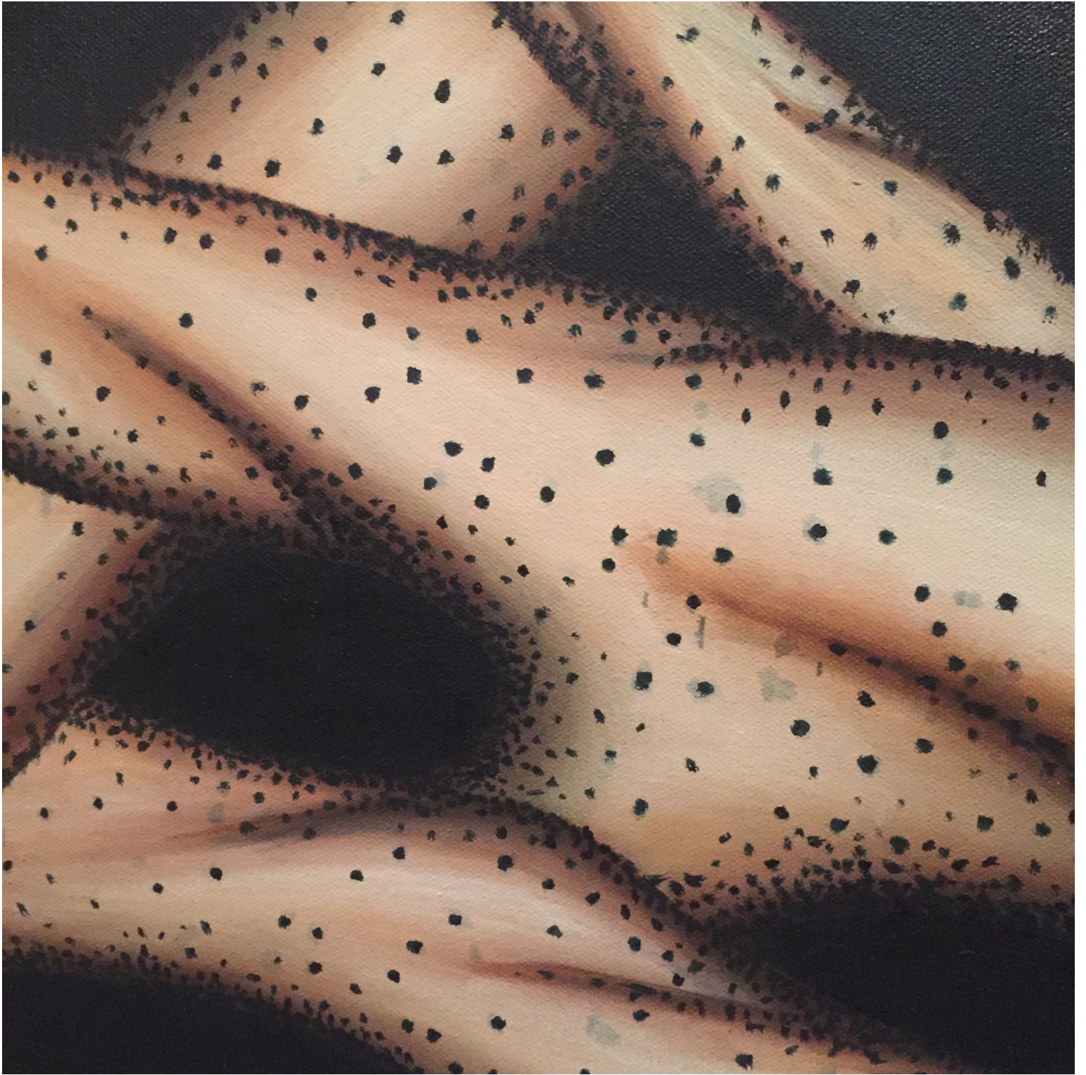
Figure 5: Roots of Nature (Detail)