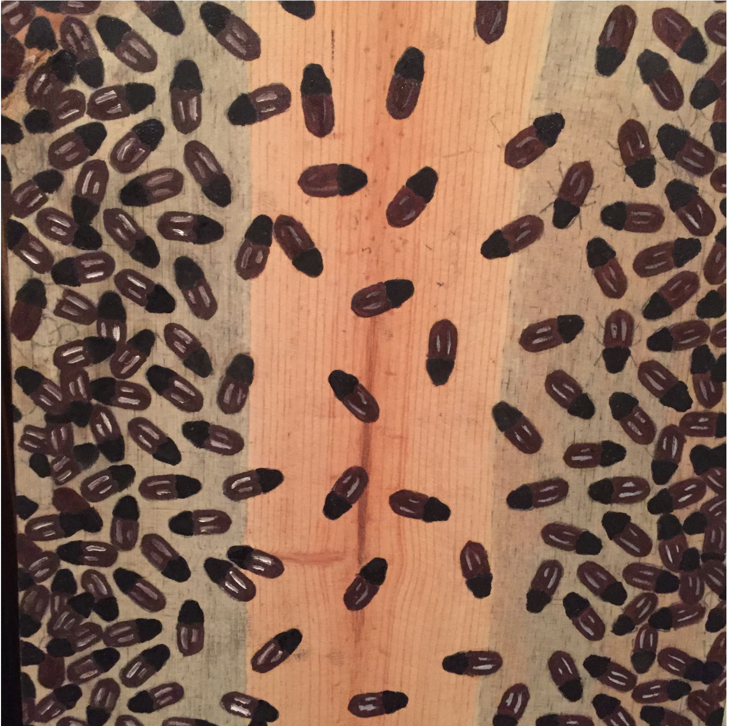
Figure 4: Mountain Pine Beetle