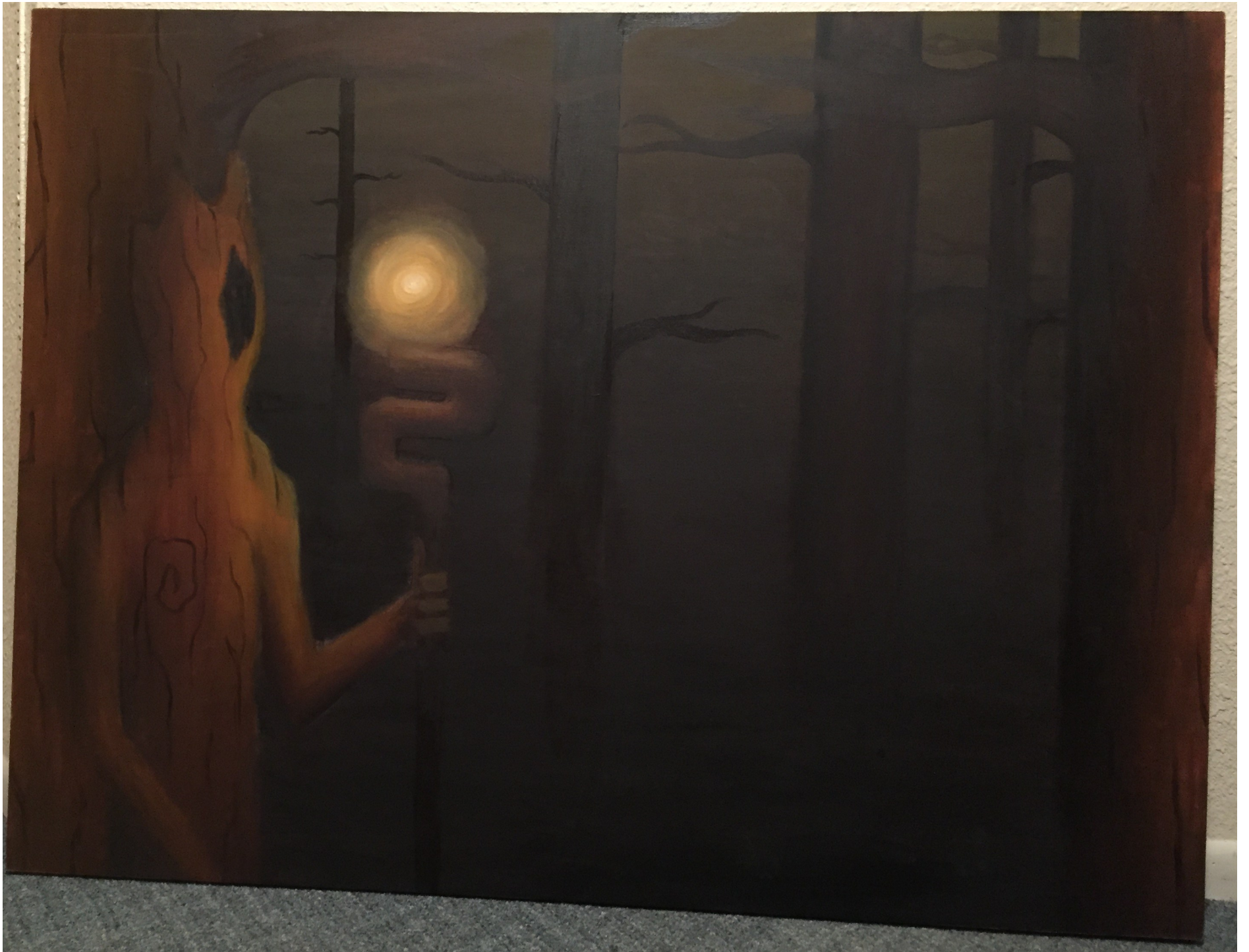
Figure 1: Light Within Darkness