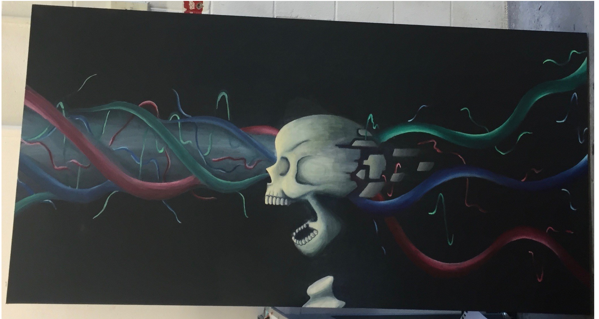
Figure 2: Musical Alteration