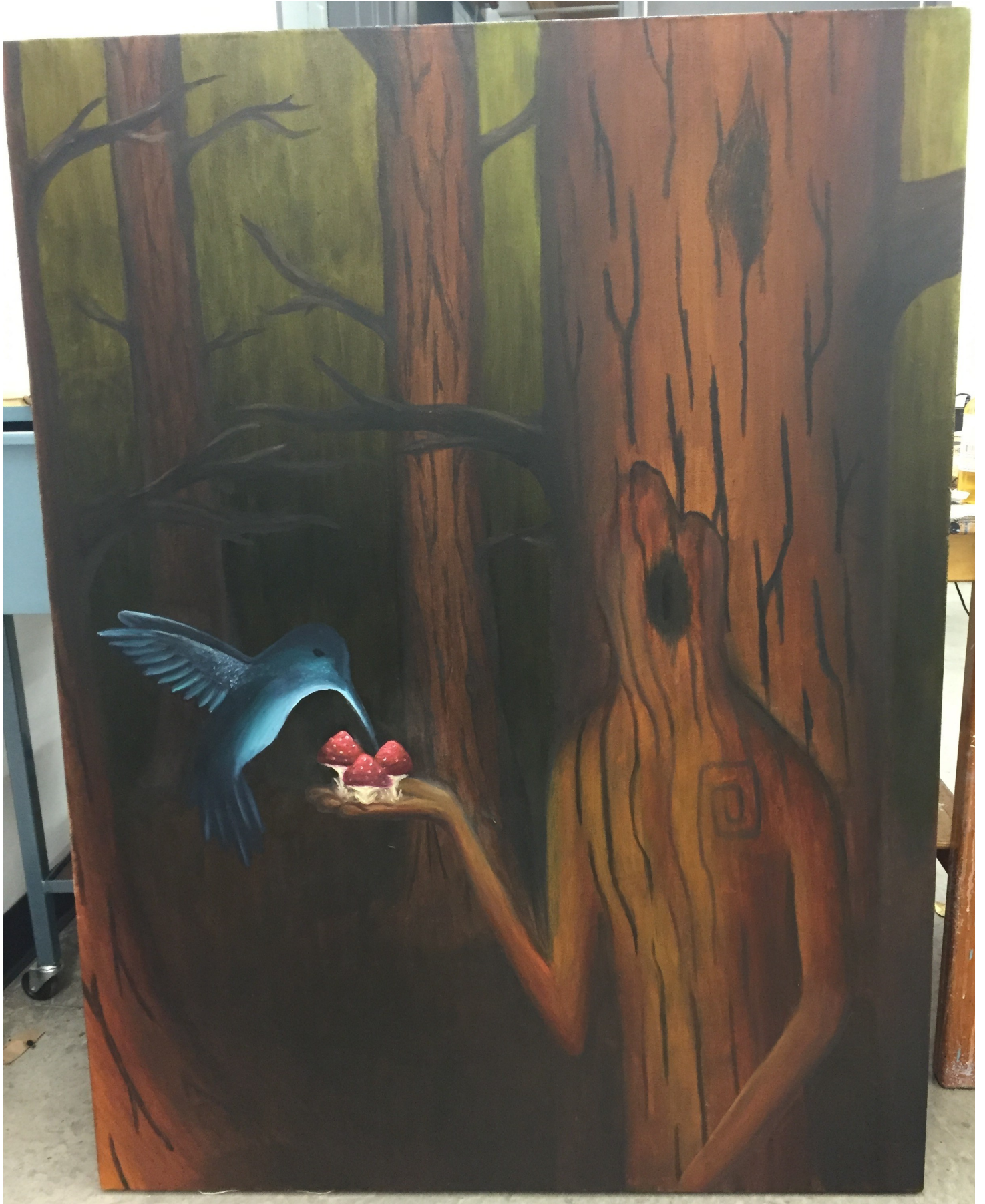
Figure 7: Sharing the Wealth