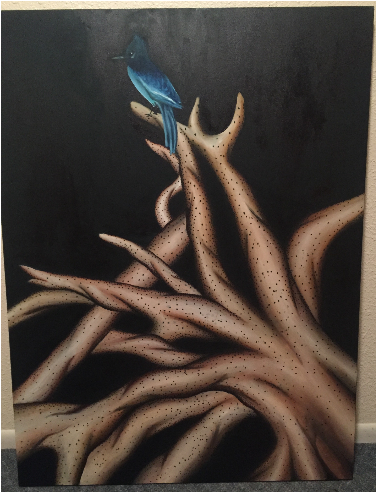
Figure 6: Roots of Nature