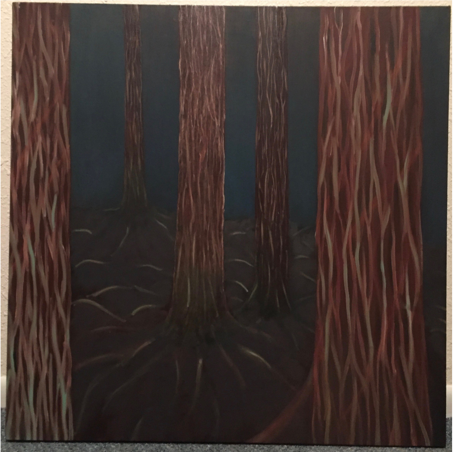
Figure 10: The Unknown