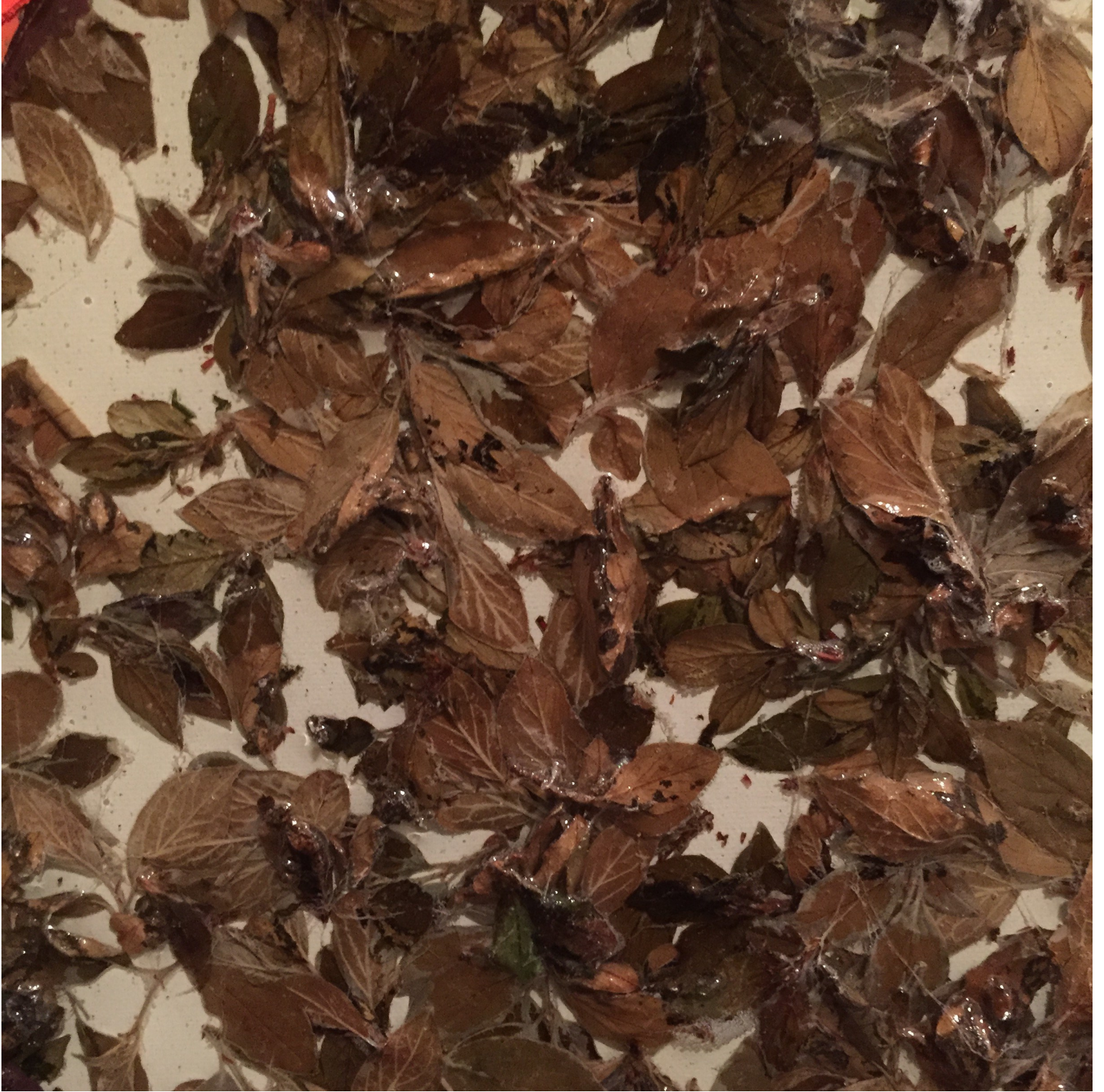
Figure 8: The Crossing of Two Forces (Detail)