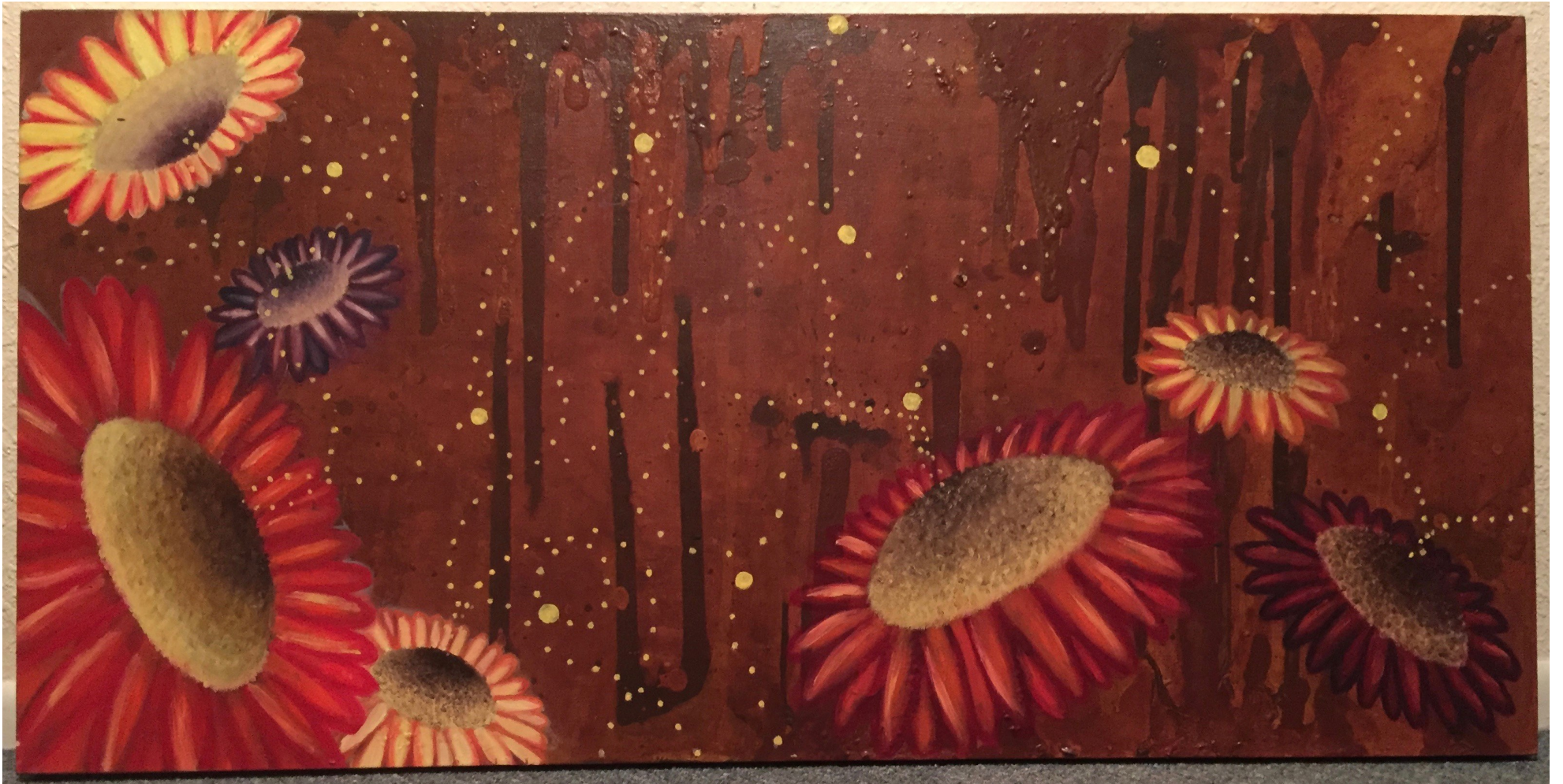
Figure 3: Pollination Field