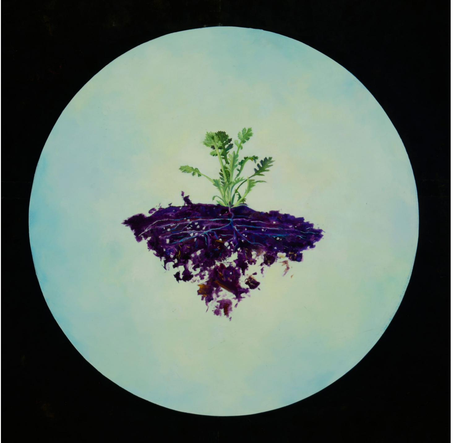
Figure 5: Elements