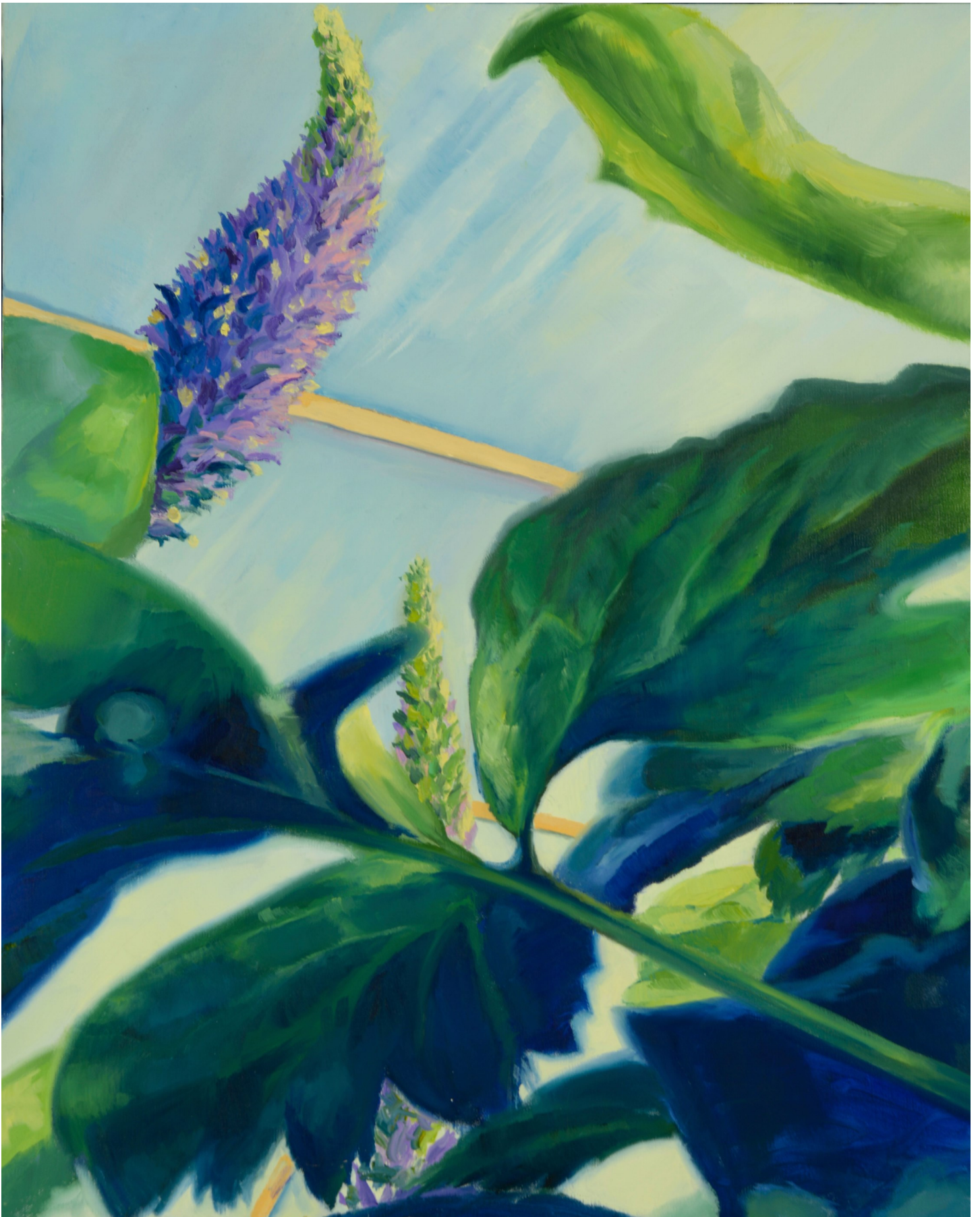
Figure 7: Victoria