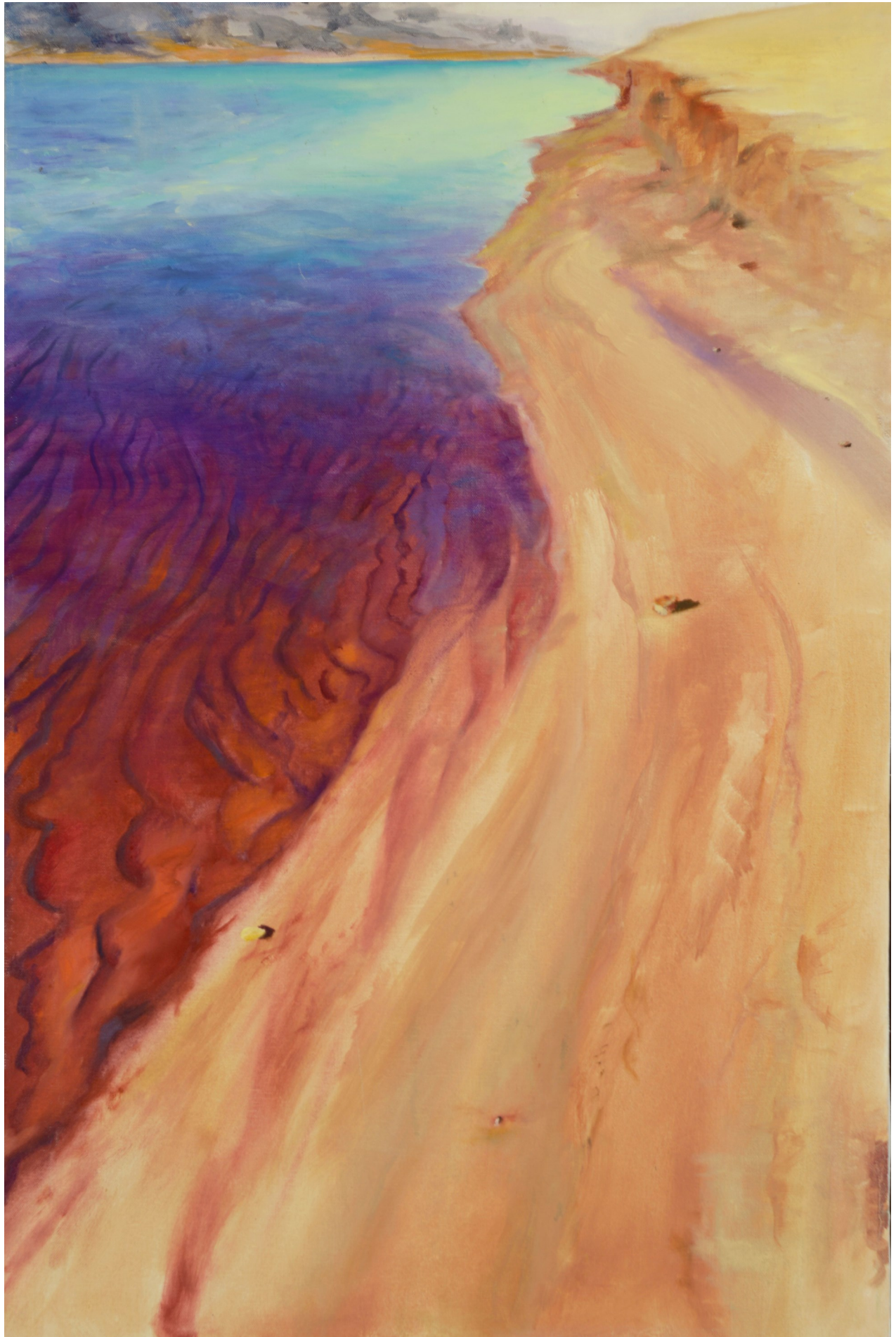
Figure 10: Ripples