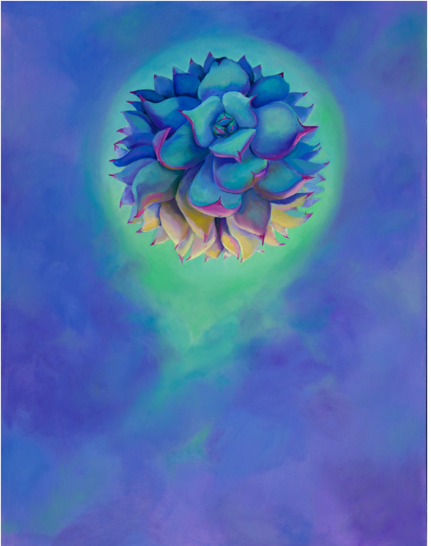
Figure 3: Moon Succulent