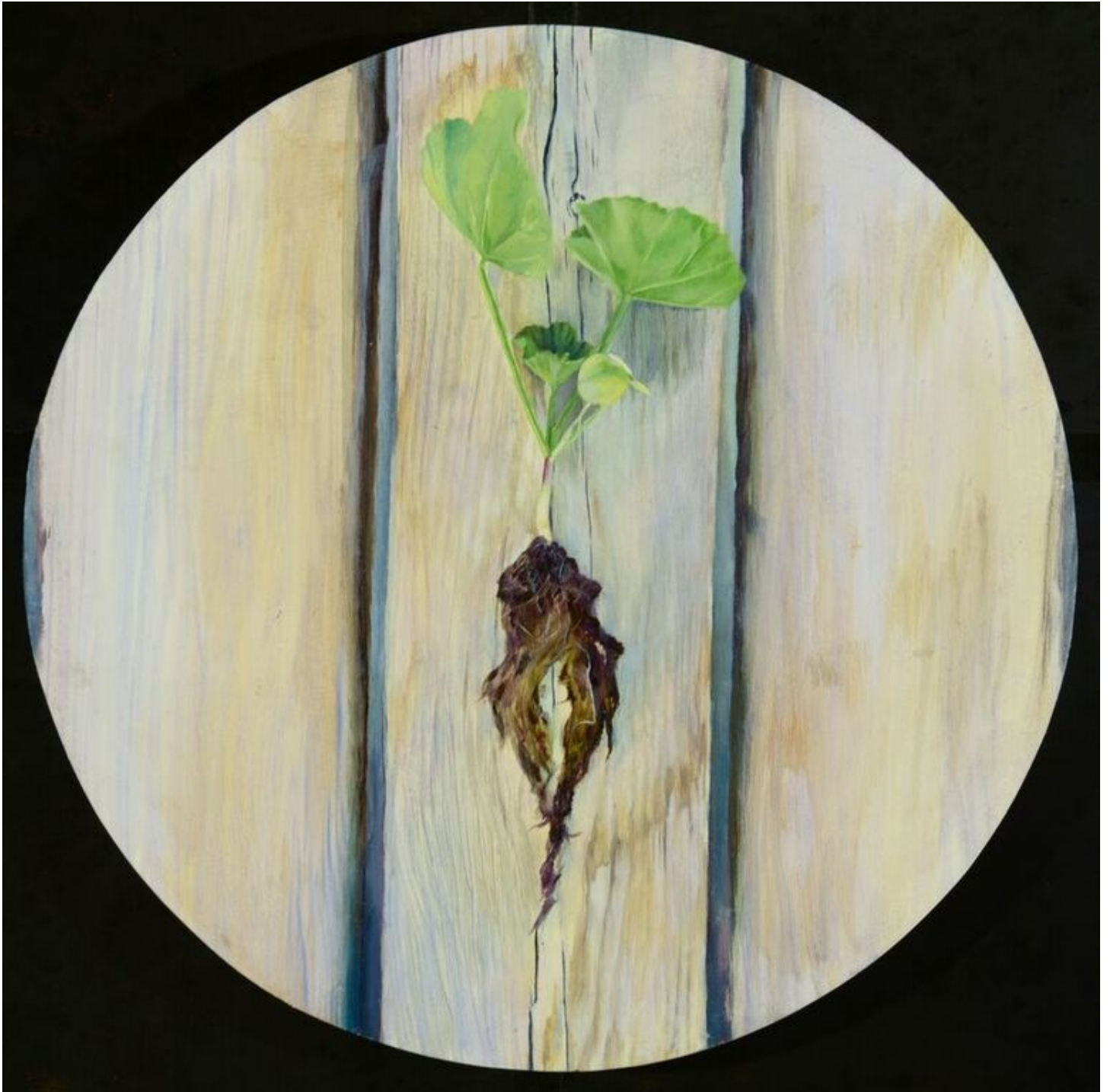
Figure 4: Seedling