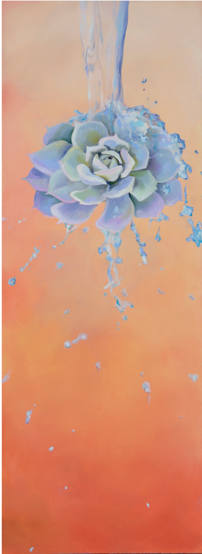
Figure 2: Purify