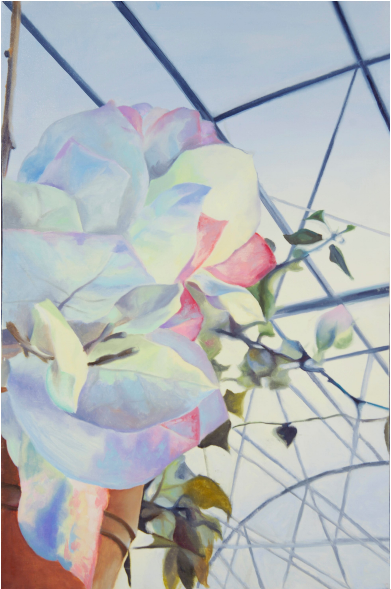
Figure 8: Bougainvillea