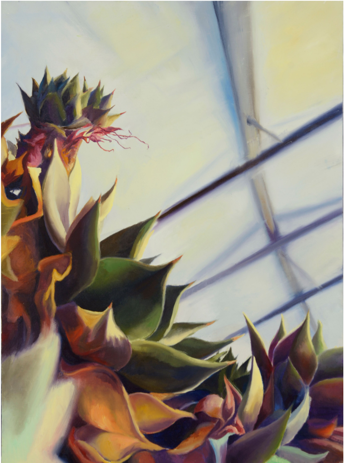
Figure 9: Hens and Chicks