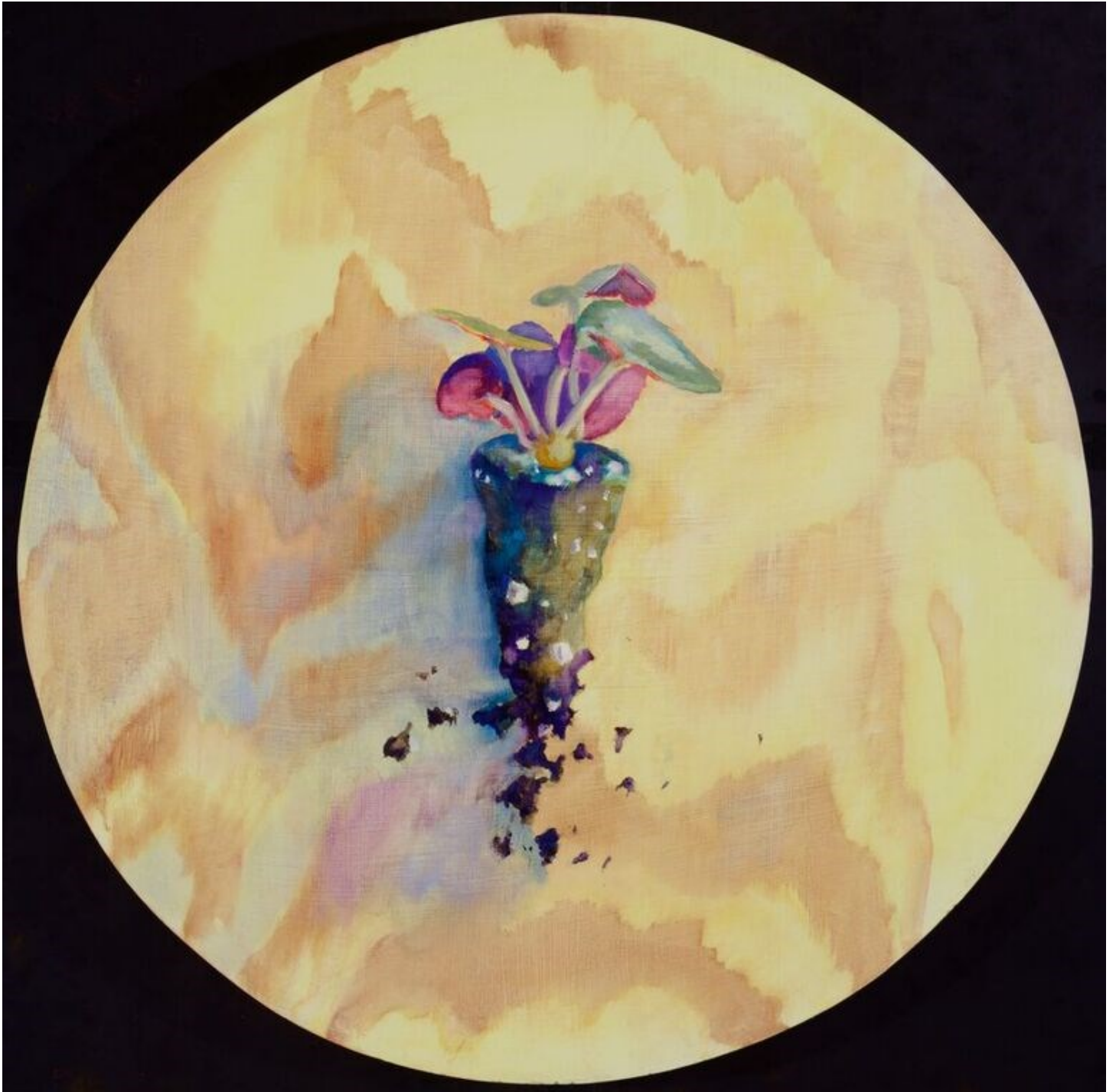
Figure 6: Cyclamen