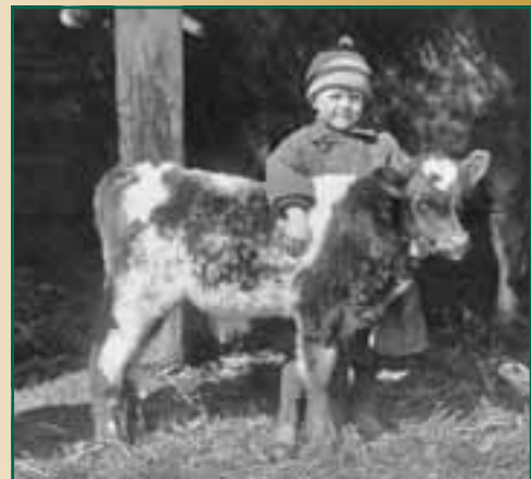
Child with Calf. From the Records of the Colorado Cooperative Extension. CSU Libraries Colorado Agricultural Archive.