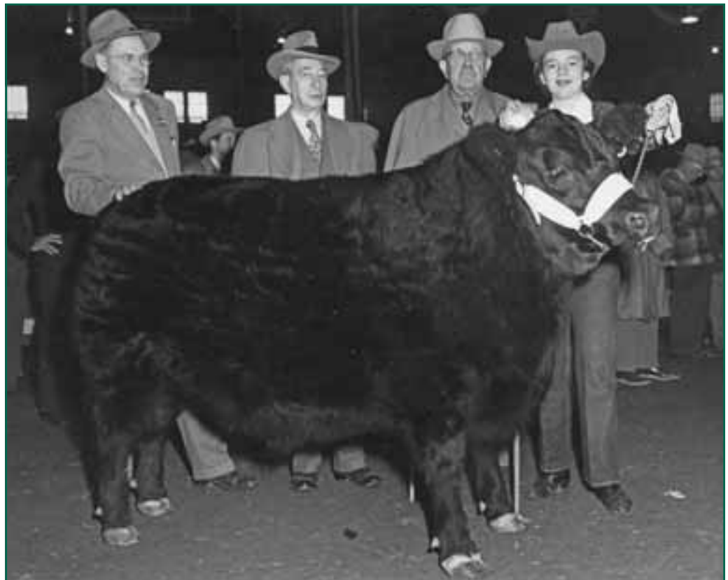
A participant and her award winning calf at the 1954 National Western Stock Show.

In fact, it is one of the Round-Up's many highlights that has long linked Colorado State University Cooperative Extension and the National Western Stock Show. The Catch-A-Calf Event began in conjunction with Extension in 1935, on a Tuesday evening when sixteen 4-H boys were put in the ring to catch ten calves. According to