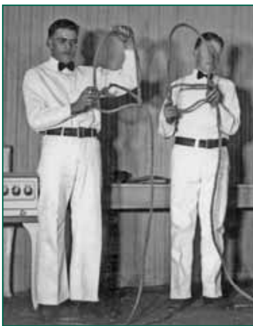
Agricultural team demonstrating “The Making of Rope for Ranch Use” at the 1936 National Western Stock Show. From the Records of the Colorado Cooperative Extension.

4-H and Cooperative Extension have continued to thrive in Colorado. So has the 4-H Round-Up and the Catch-A-Calf Contest. The event grew to be very popular in the years after it began in 1935 and in 1974, it was opened up to 4-H girls. Now, both boys and girls compete to catch one of forty