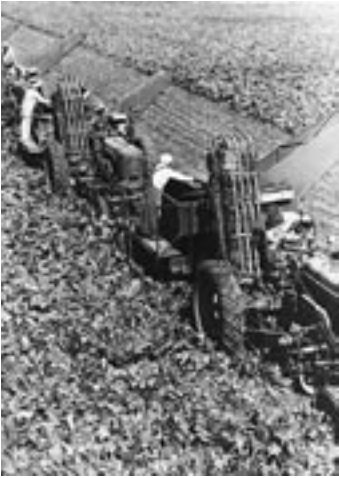
Photograph from the Germans from Russia Collection, illustrating the immigrant experience in Northern Colorado.