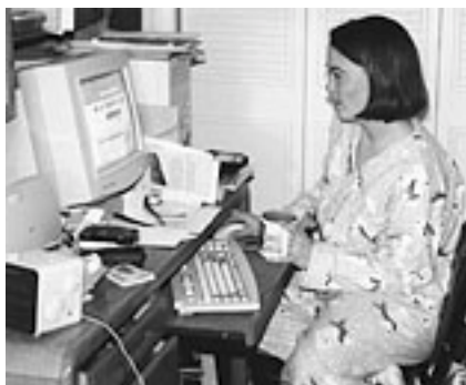
Night owl using Reserve.

Check out our new electronic Reserve options at http://lib.colostate.edu/reserve/ .