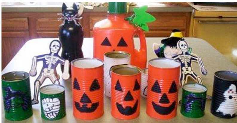
Sustainable decorations