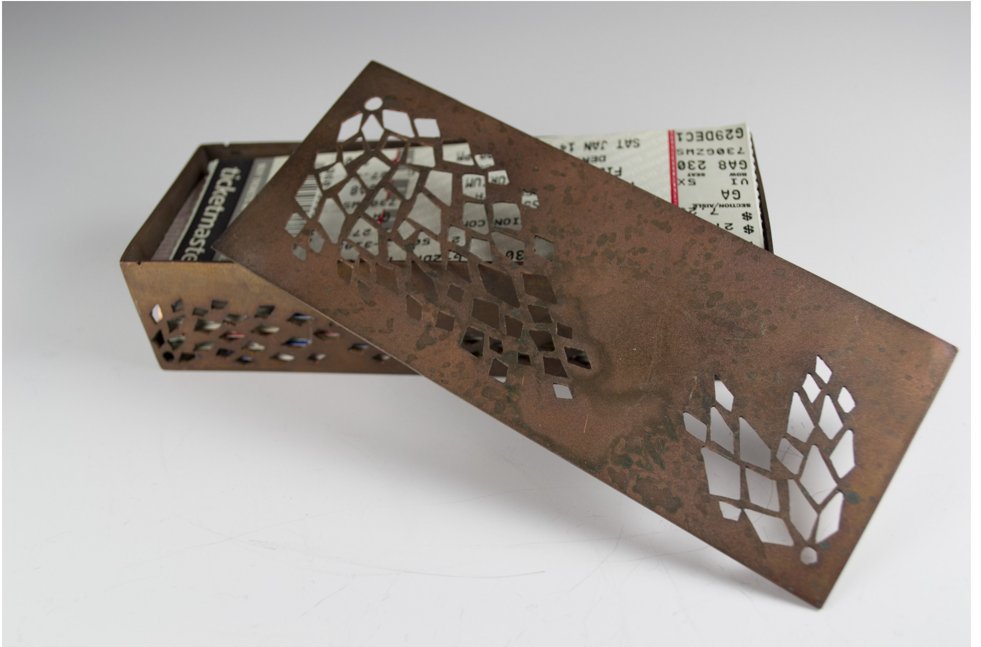
Figure 15: Reliquary