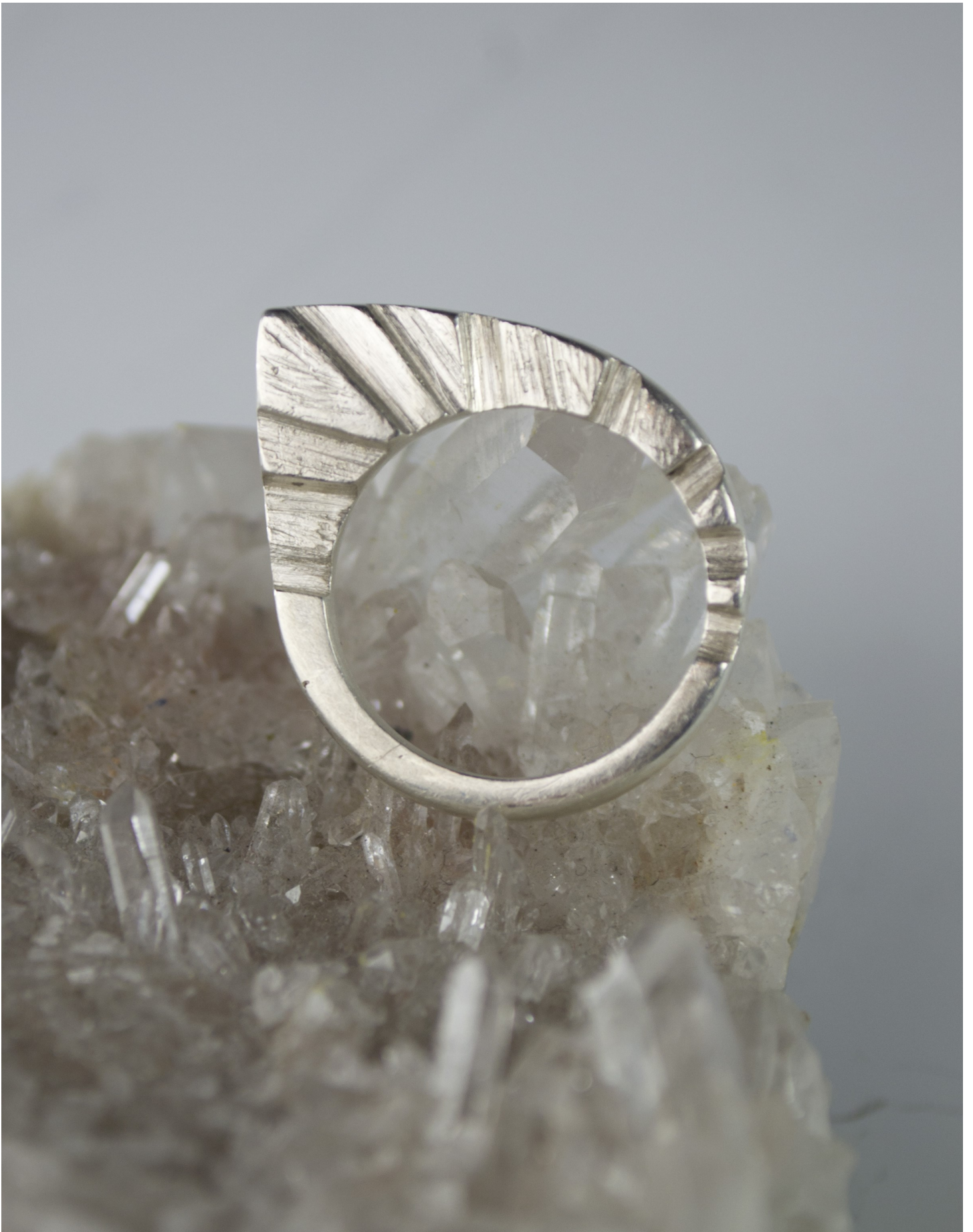
Figure 3: Ring Front