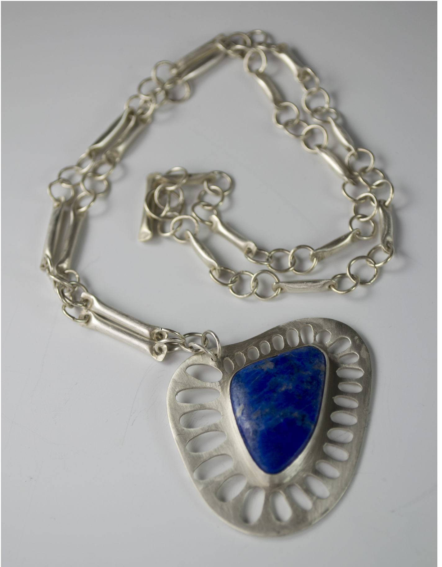
Figure 5: Emanating Truth