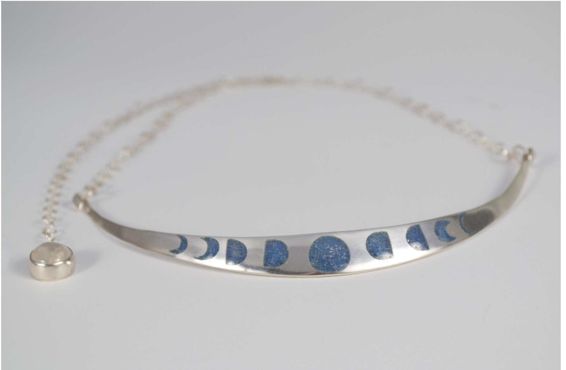
Figure 8: Moon-Phase