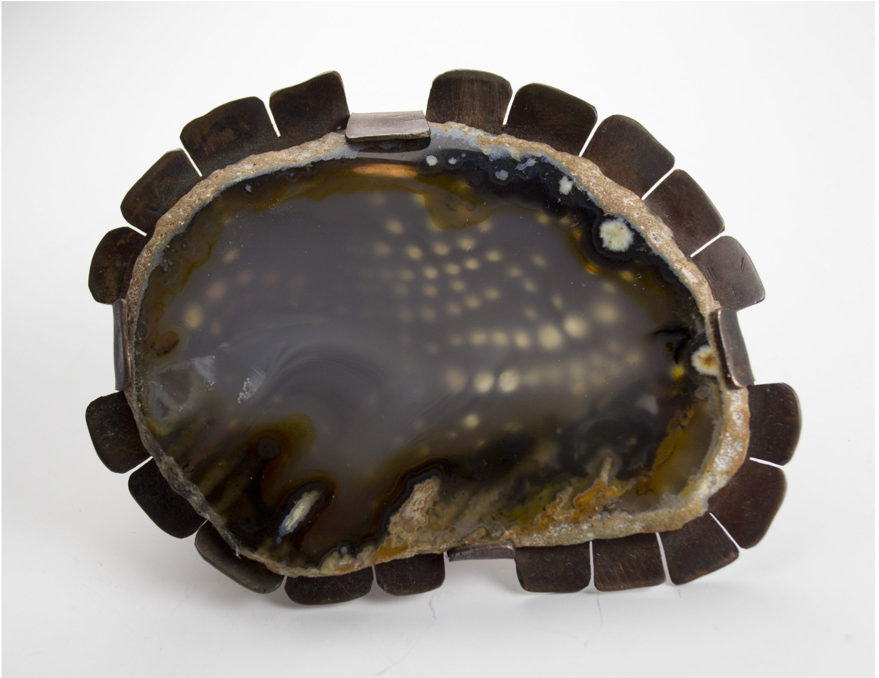
Figure 1: Agate Brooch