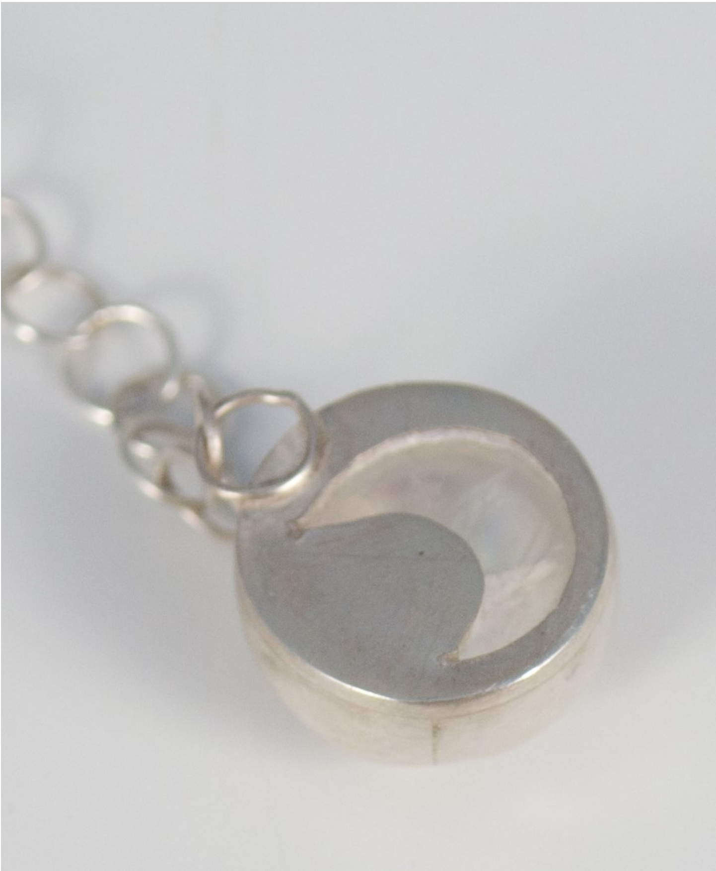
Figure 9: Moon-Phase Bezel Close-up