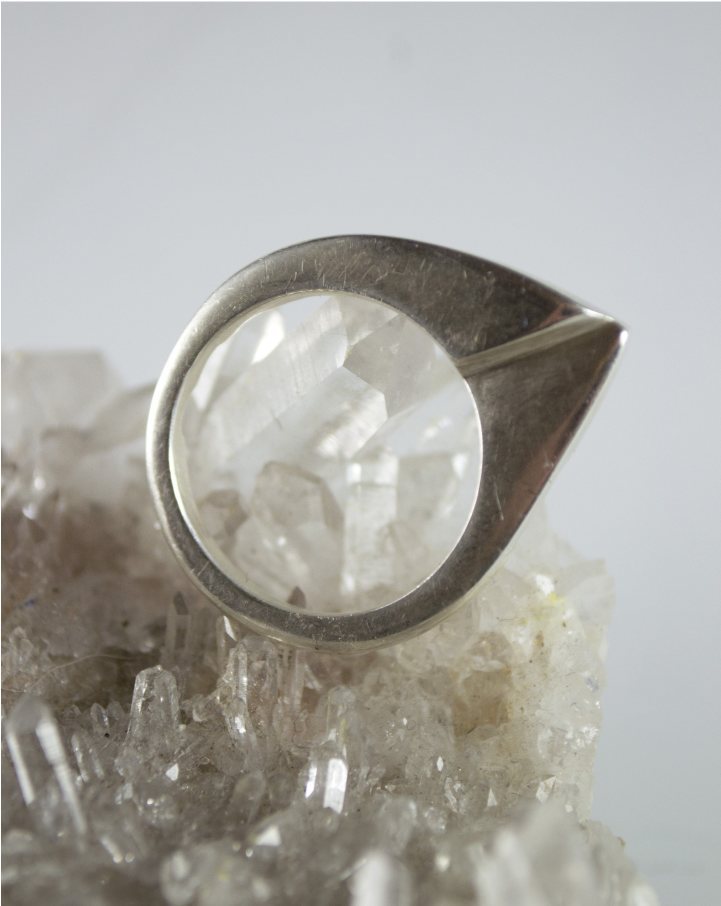
Figure 4: Ring Back