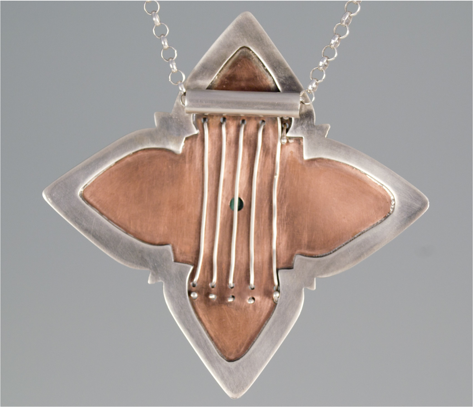
Figure 11: Mirror The Soul Back