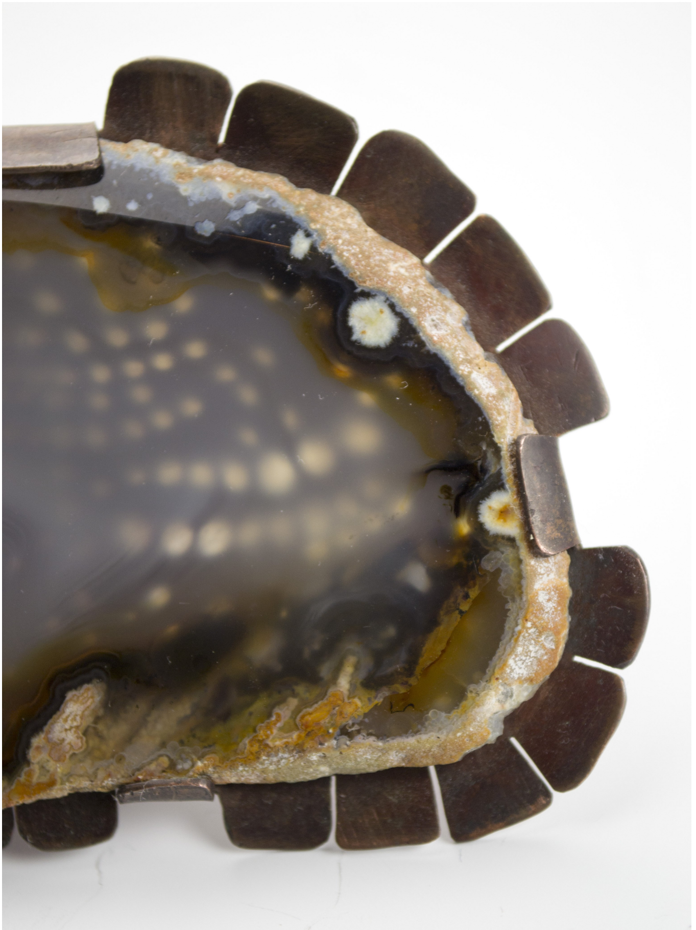
Figure 2: Agate Brooch Close-Up