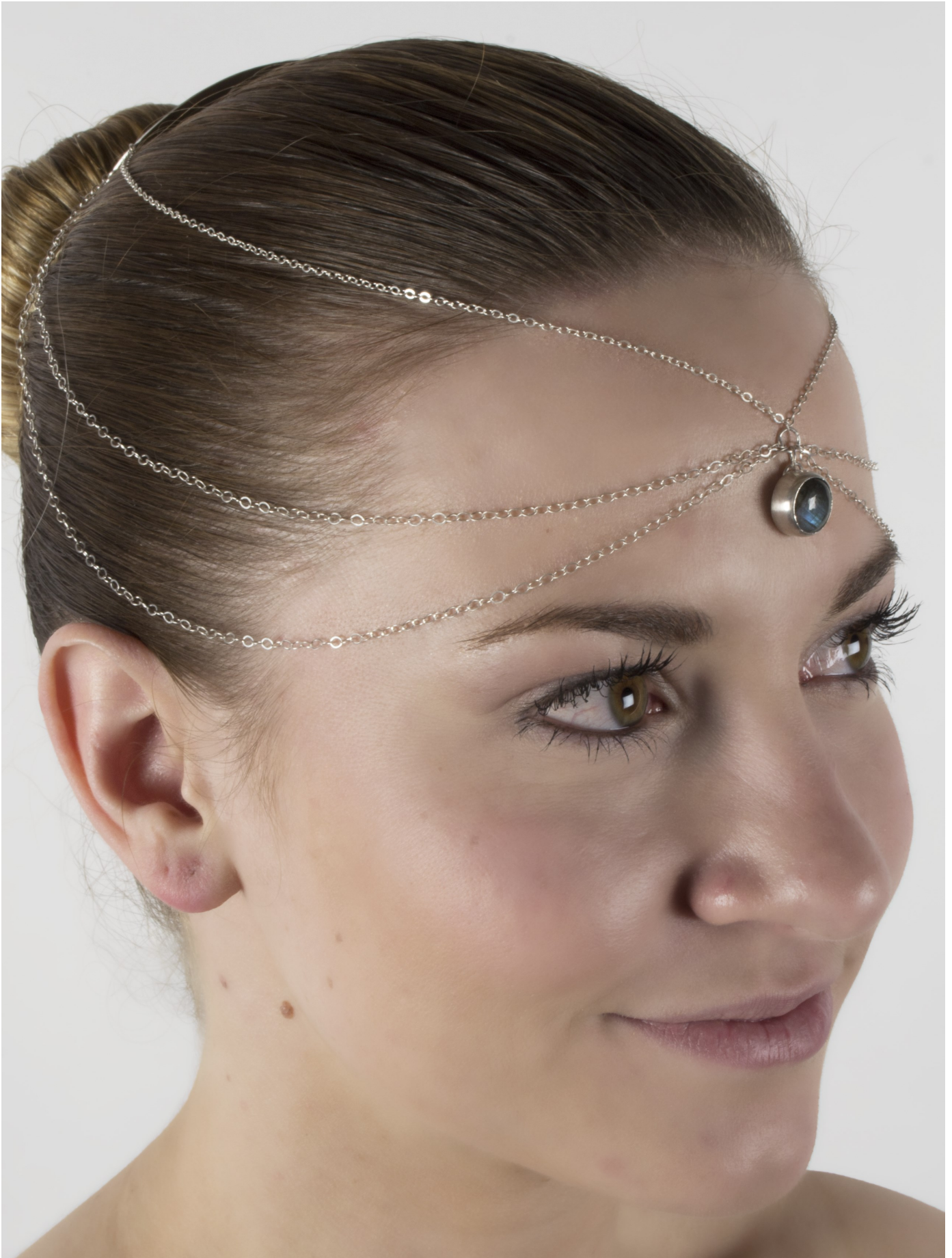
Figure 6: Awakening Introspection Front