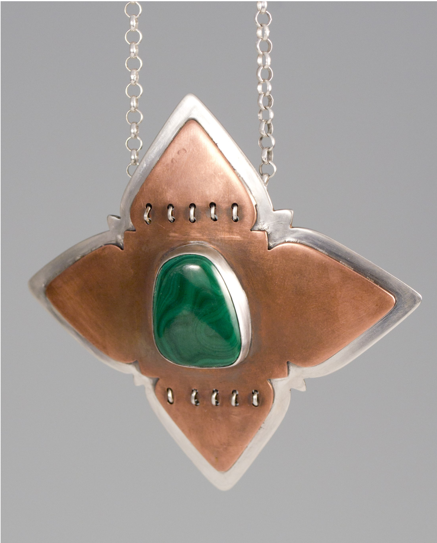
Figure 10: Mirror The Soul Front