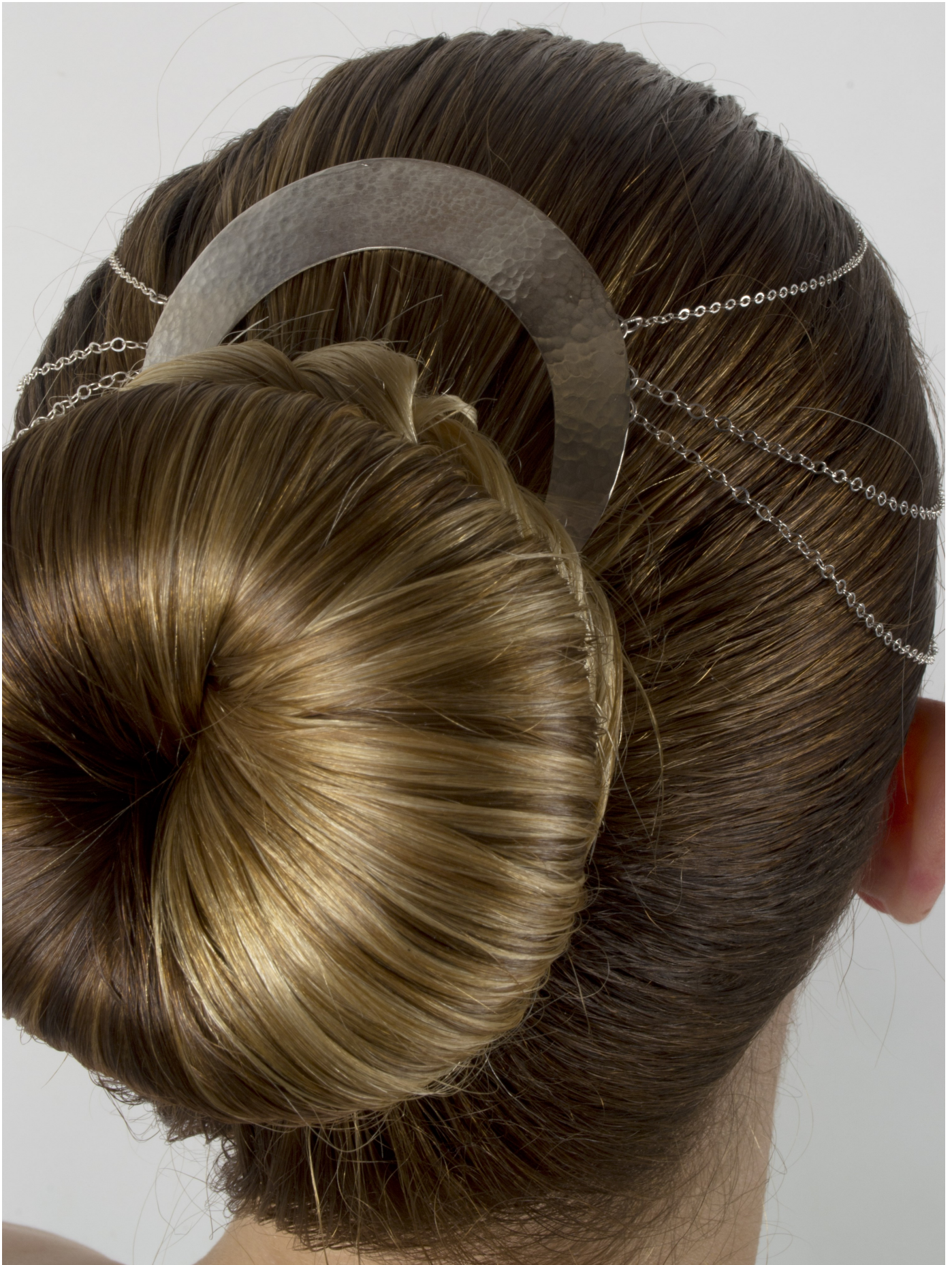
Figure 7: Awakening Introspection Back