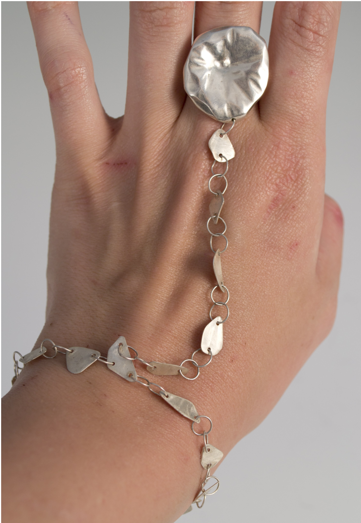
Figure 14: Connectic Ring