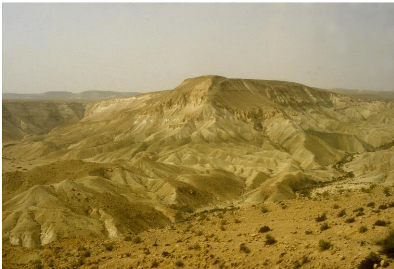
The Negev desert.

Words translated as "wilderness" occur nearly 300 times in the Bible. A formative Hebrew memory is the years of "wandering in the wilderness," mixing experiences of wild landscape, of searching for a promised land, and of encounters with God. The Pentateuch wandering takes place in the midbar , uninhabited land where humans are nomads. This common Hebrew word refers often to a wild field where domestic animals may be grazed and wild animals live, in contrast to cultivated land, hence, sometimes "the pastures of the wilderness" (Joel 1:19-20). Another word is arabah , steppe (Genesis 36:24), also translated as desert: "The land that was desolate [ midbar ] and impassable shall be glad, and the wilderness [ arabah ] shall rejoice" (Isaiah 35:1). Land that lies waste is chorbah , land without water is yeshimon .