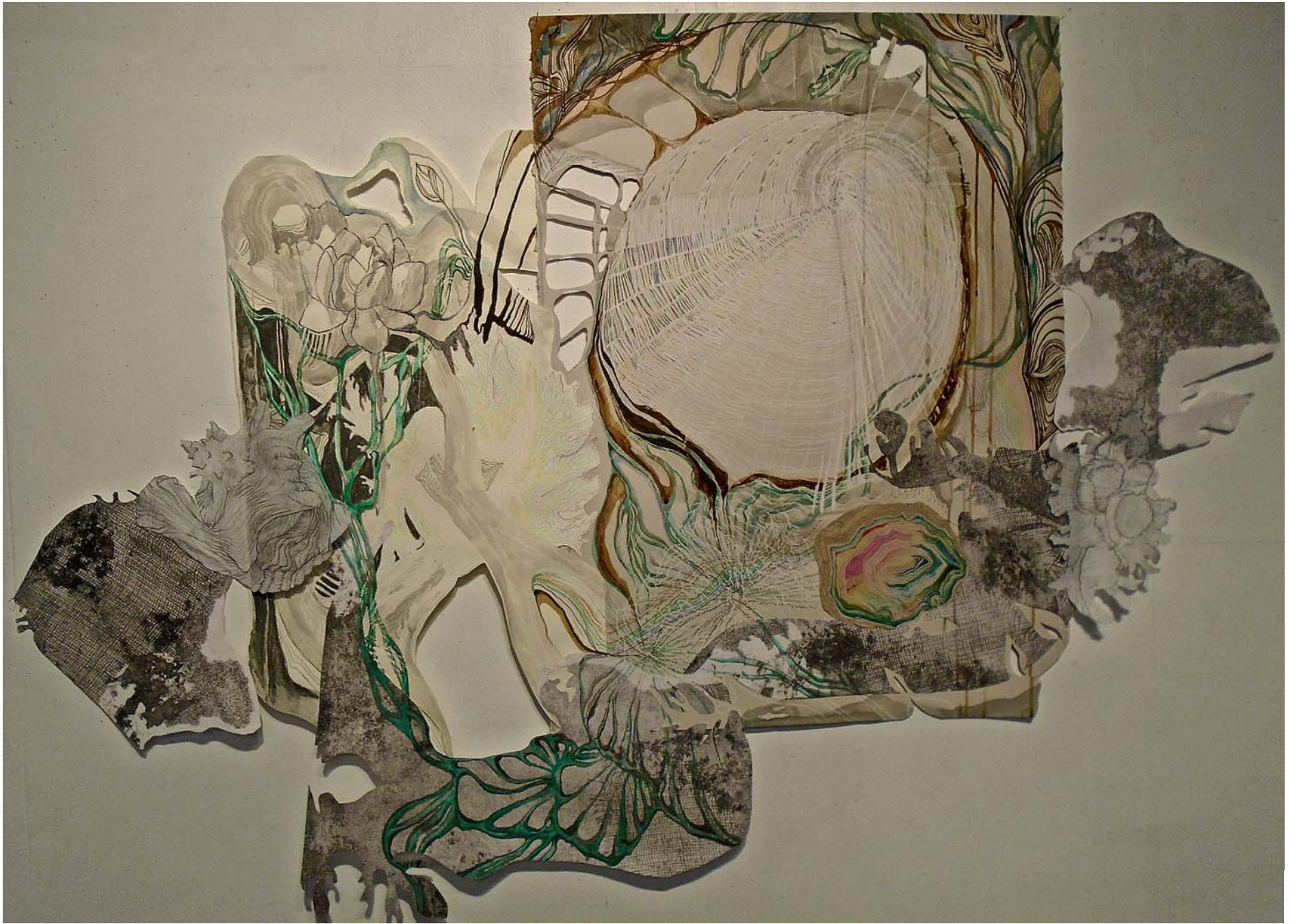
Figure 8: All Light All Sound.