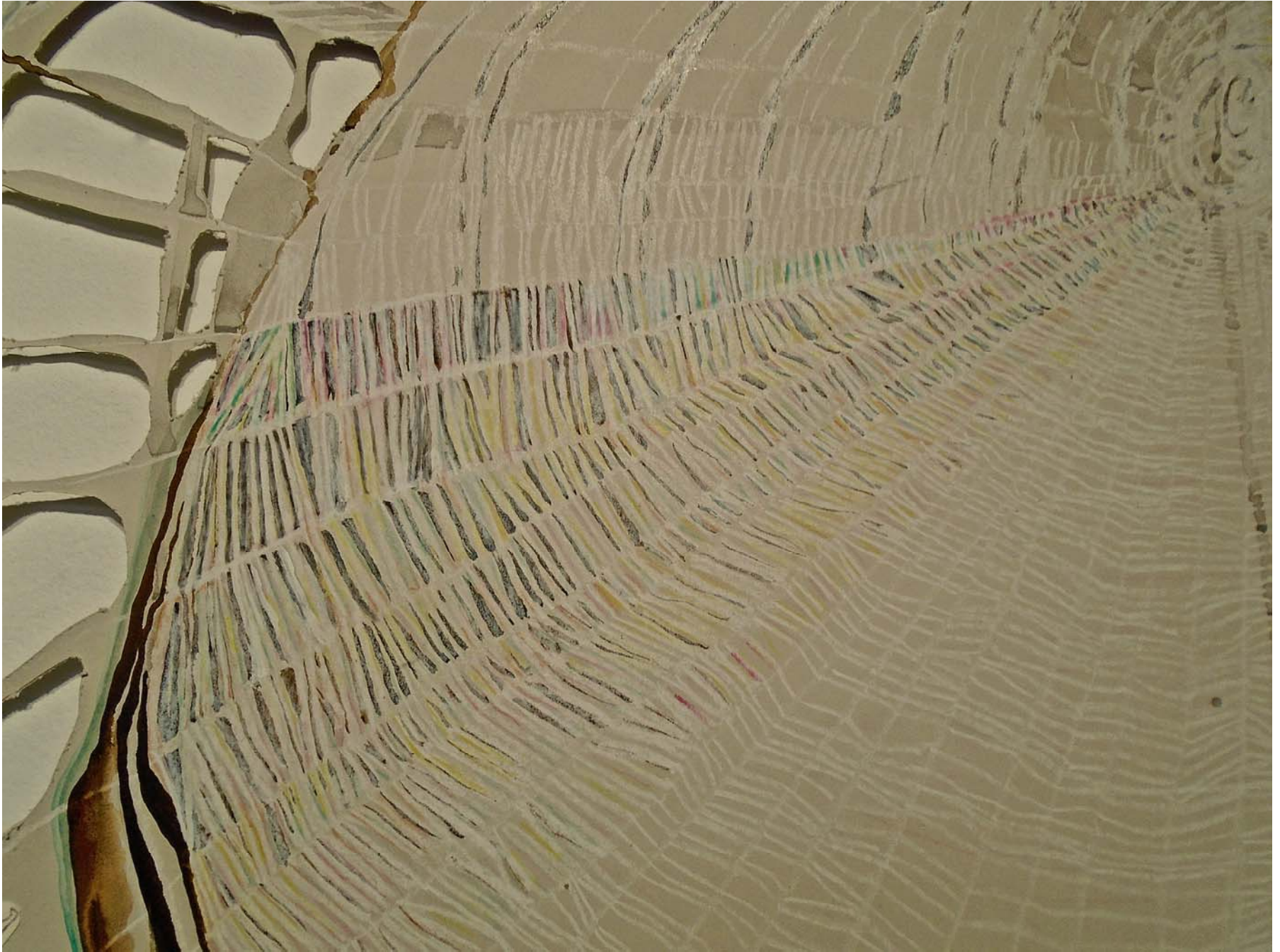
Figure 1: All Light All Sound-Detail.