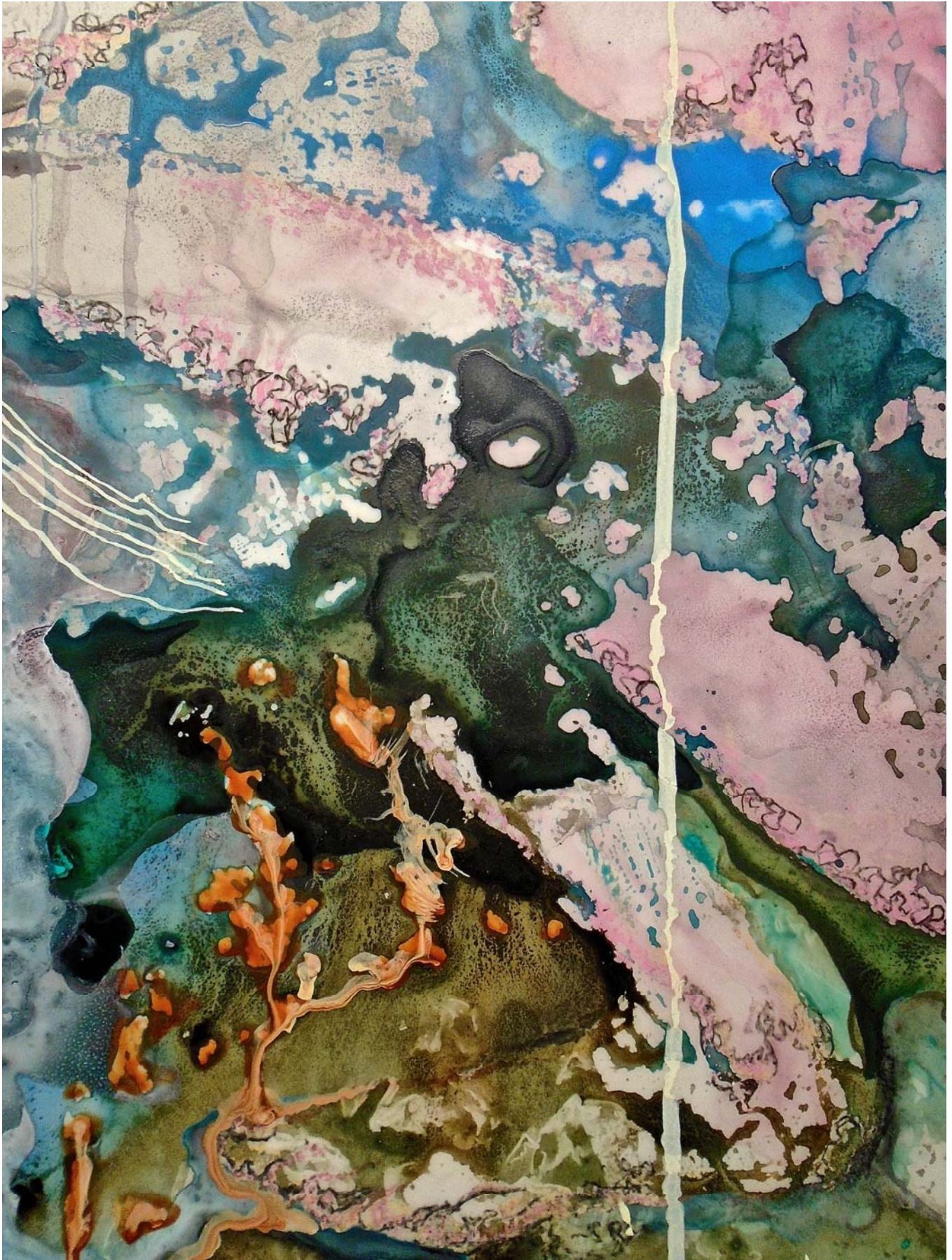
Figure 3: Birthmarks-Detail.