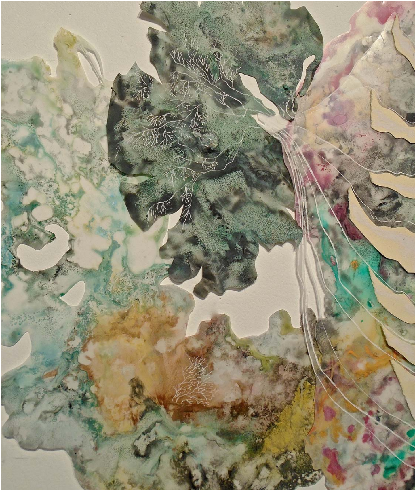
Figure 4: Dreams Can Swim-Detail.