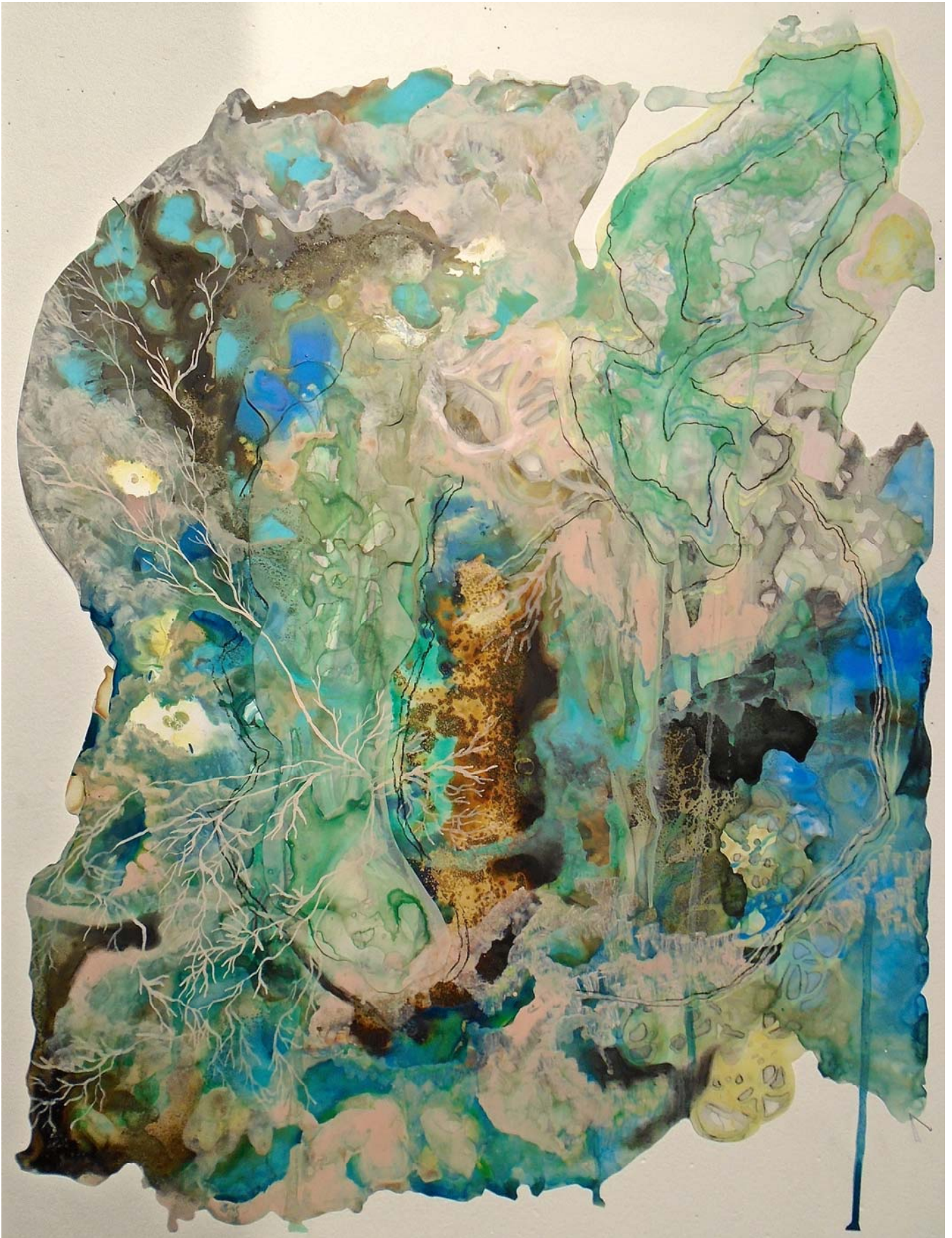
Figure 7: The Rain Told Me.