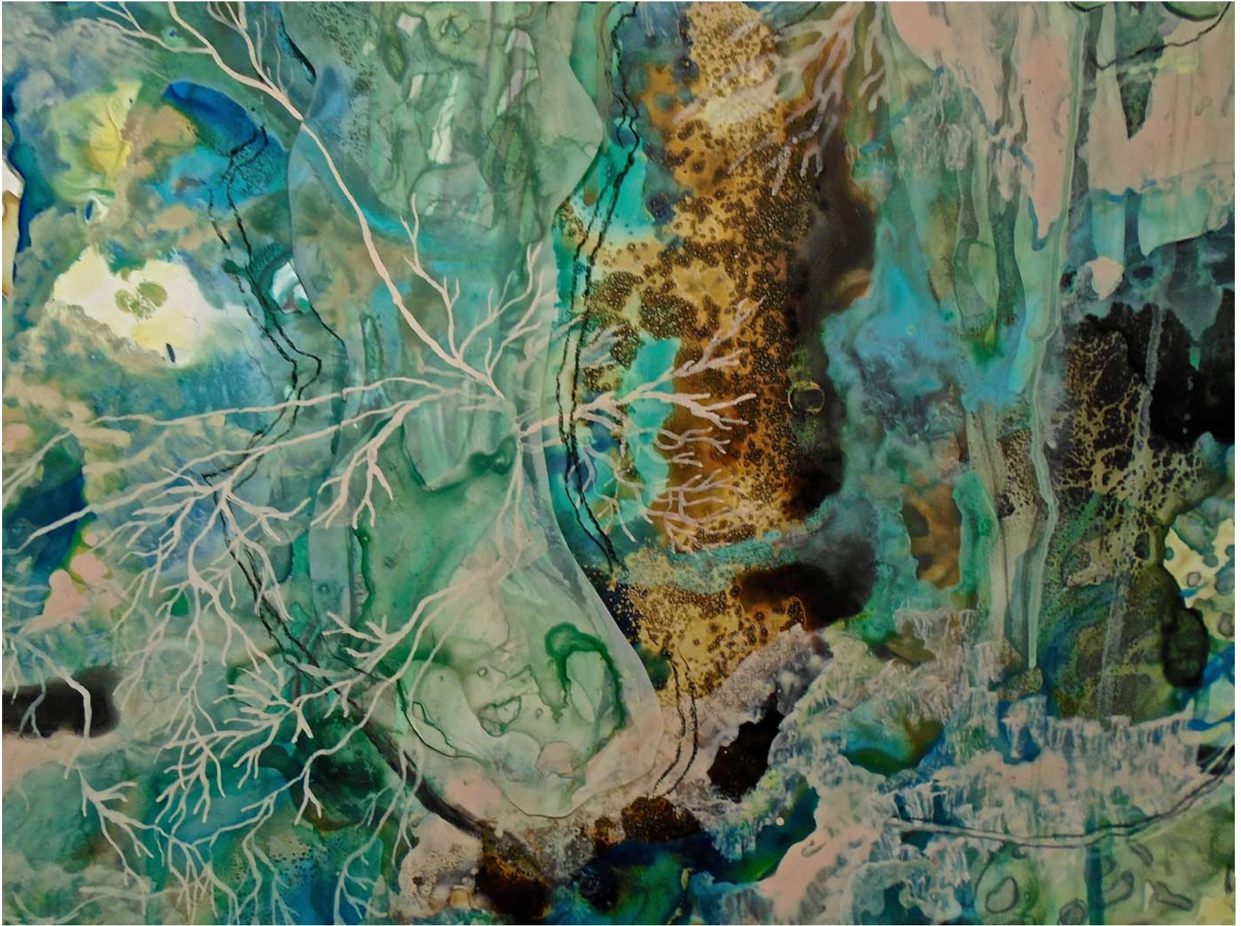
Figure 5: The Rain Told Me-Detail.