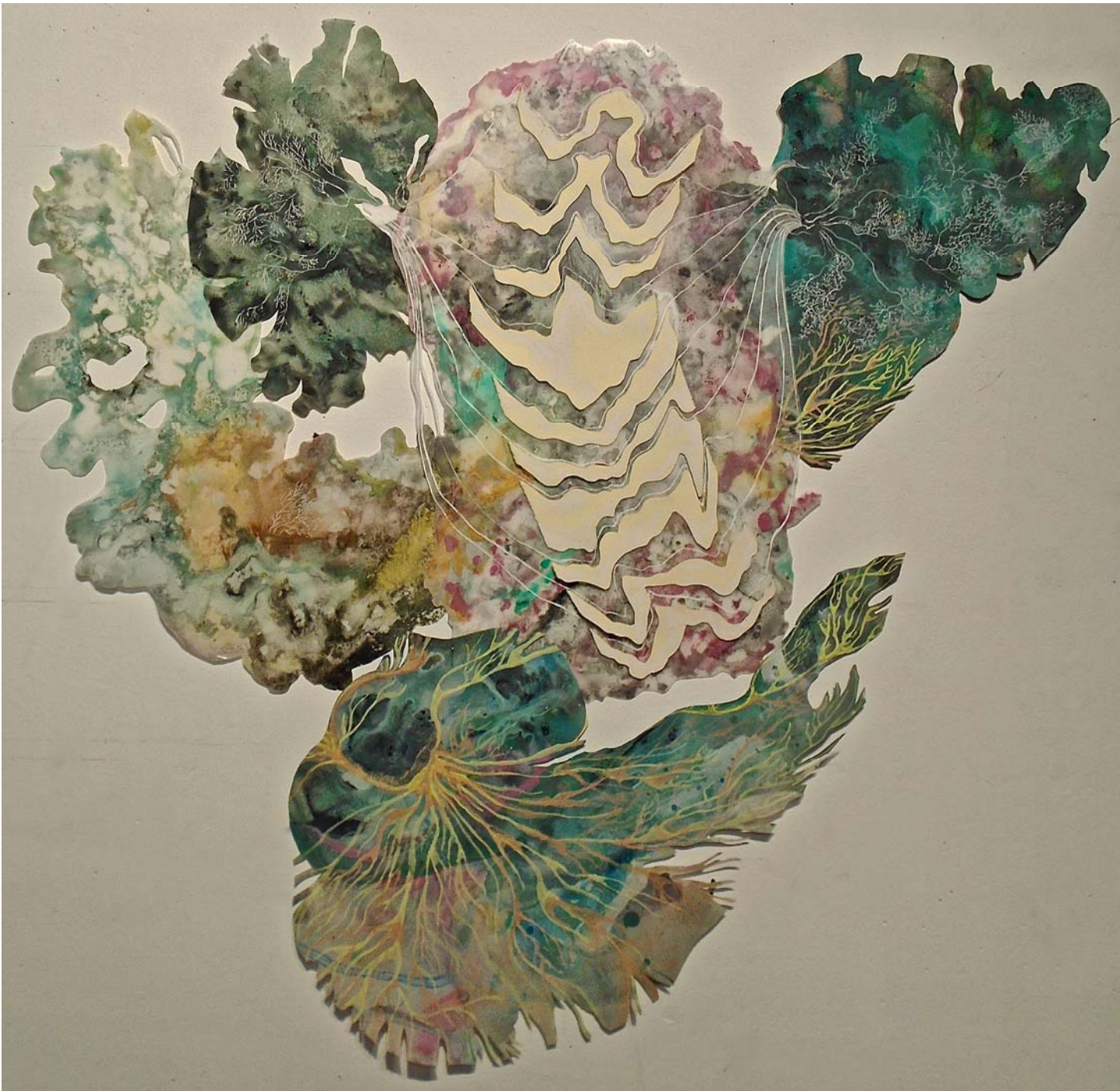
Figure 10: Dreams Can Swim.