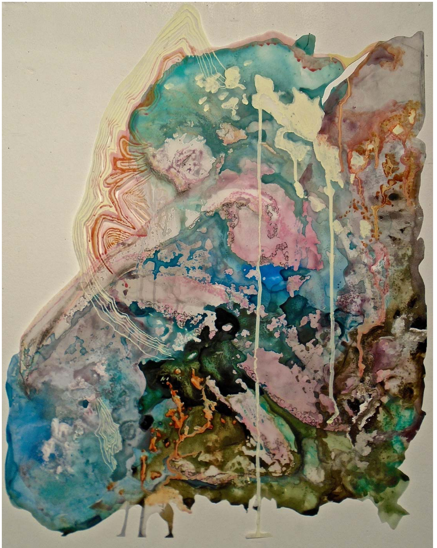
Figure 6: Birthmarks.