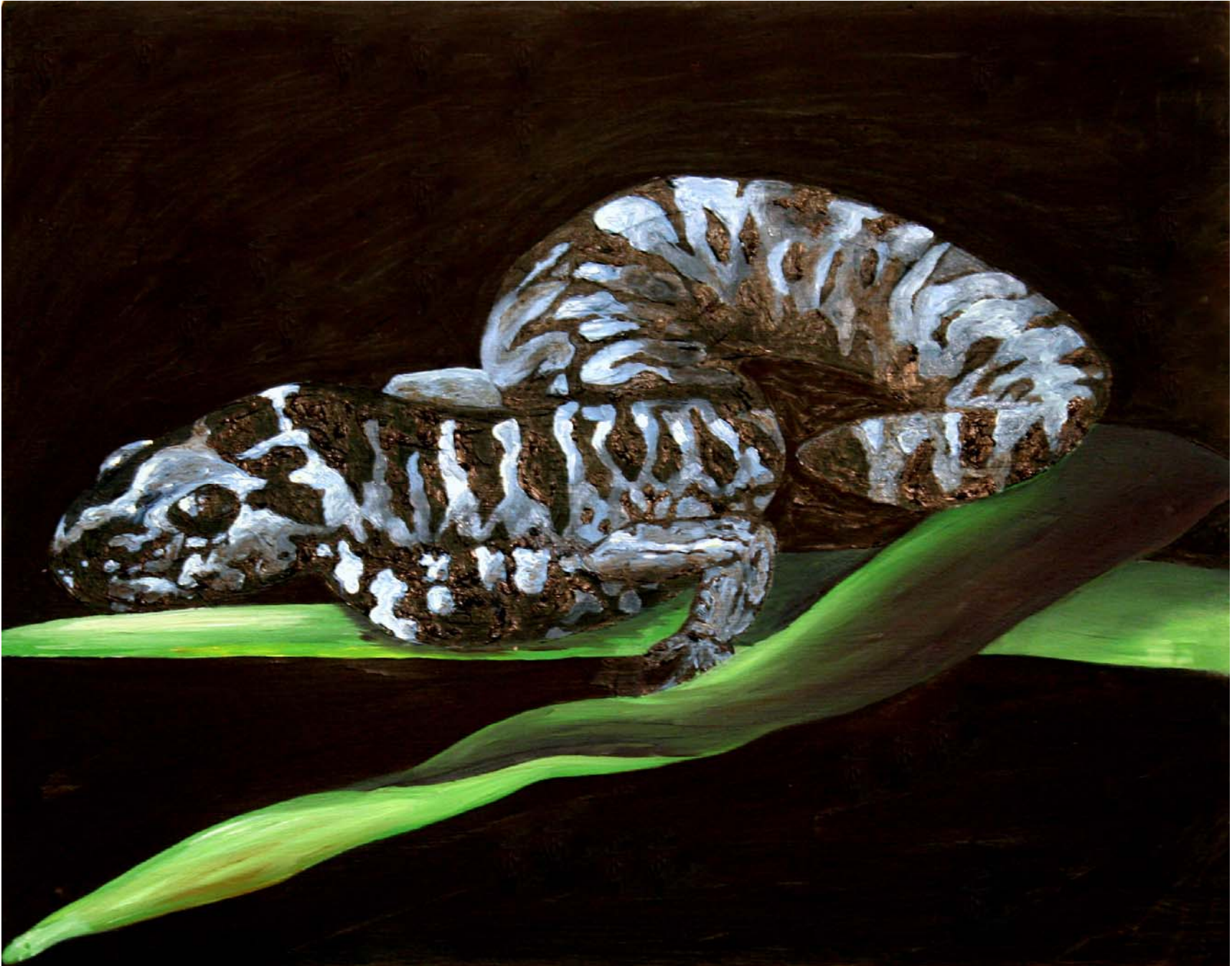
Figure 7: Reticulated Flatwoods Salamander, At Risk series.