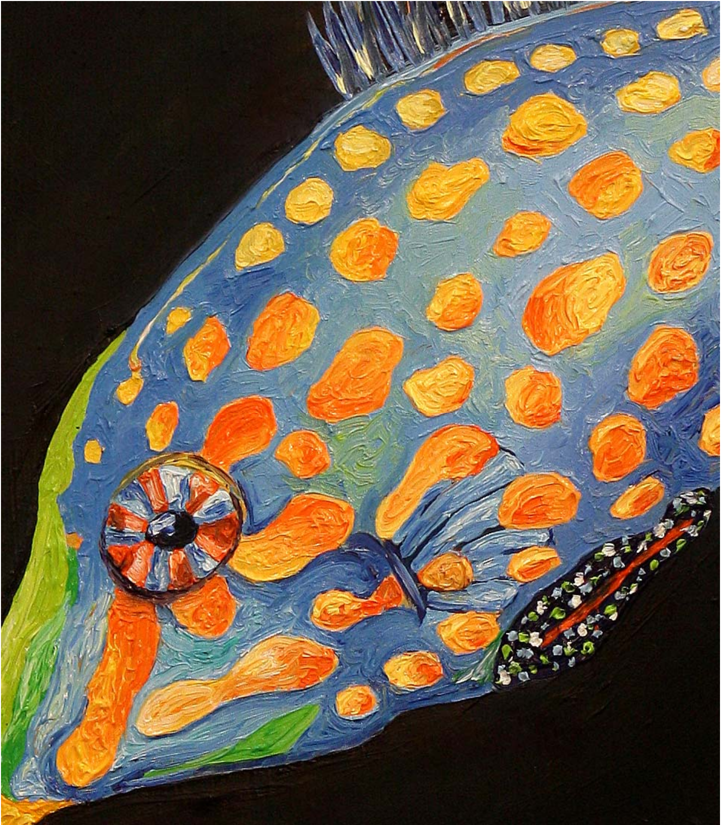
Figure 3: Orange Spotted Filefish, At Risk series, detail.