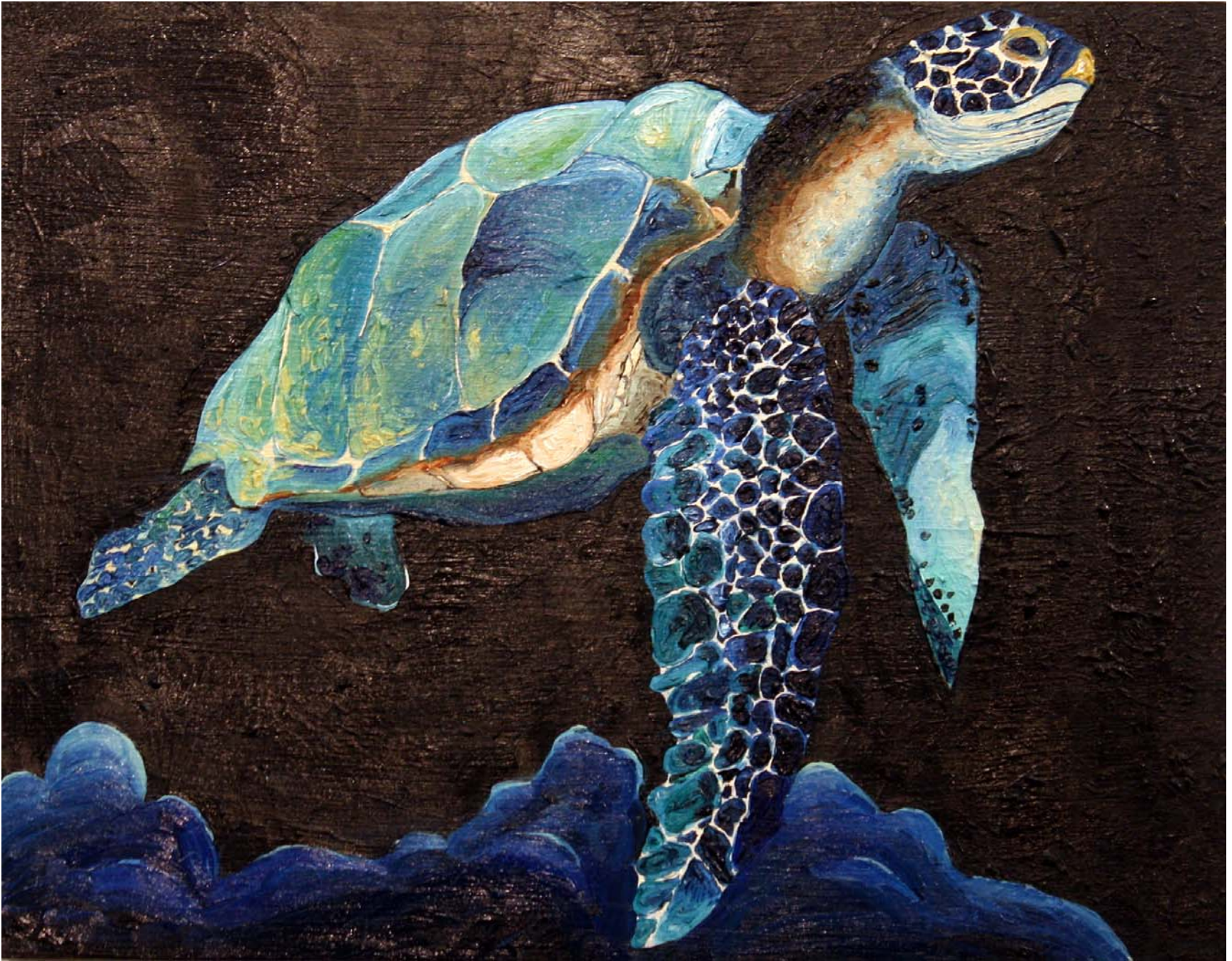
Figure 10: Green Sea Turtle, At Risk series.