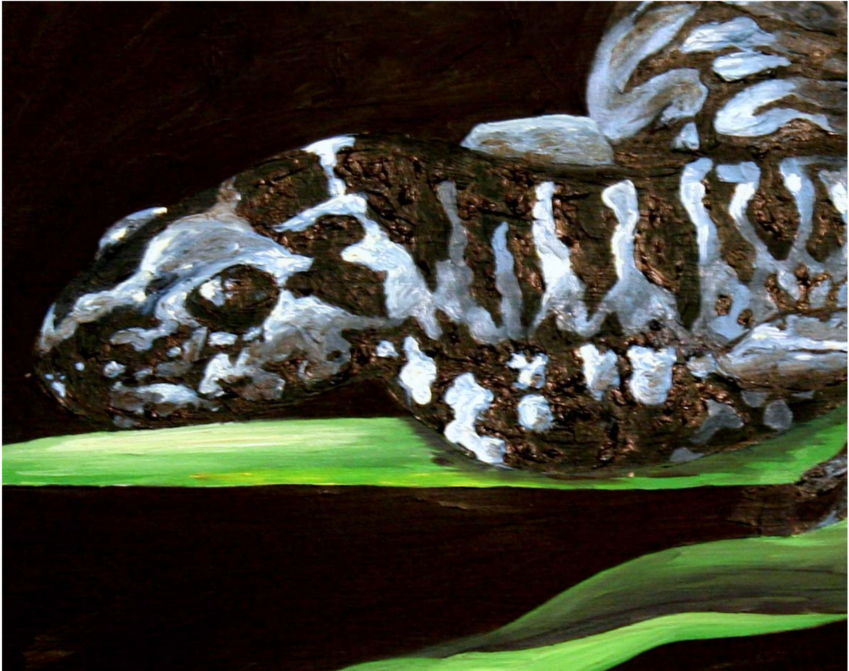
Figure 8: Reticulated Flatwoods Salamander, At Risk series, detail.