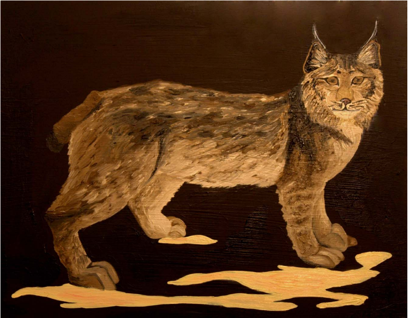
Figure 9: Canadian Lynx, At Risk series.