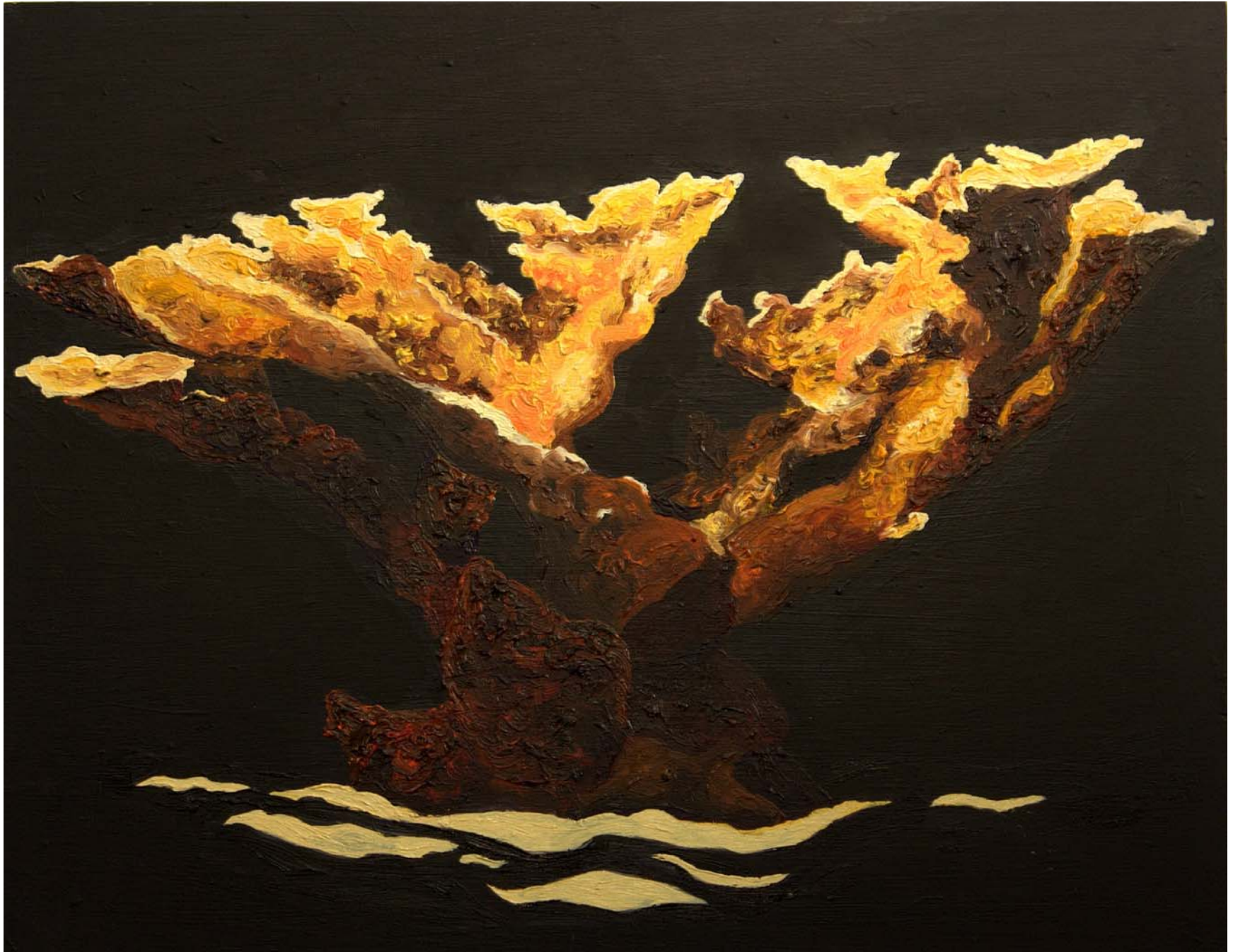
Figure 5: Elk Horn Coral, At Risk series.