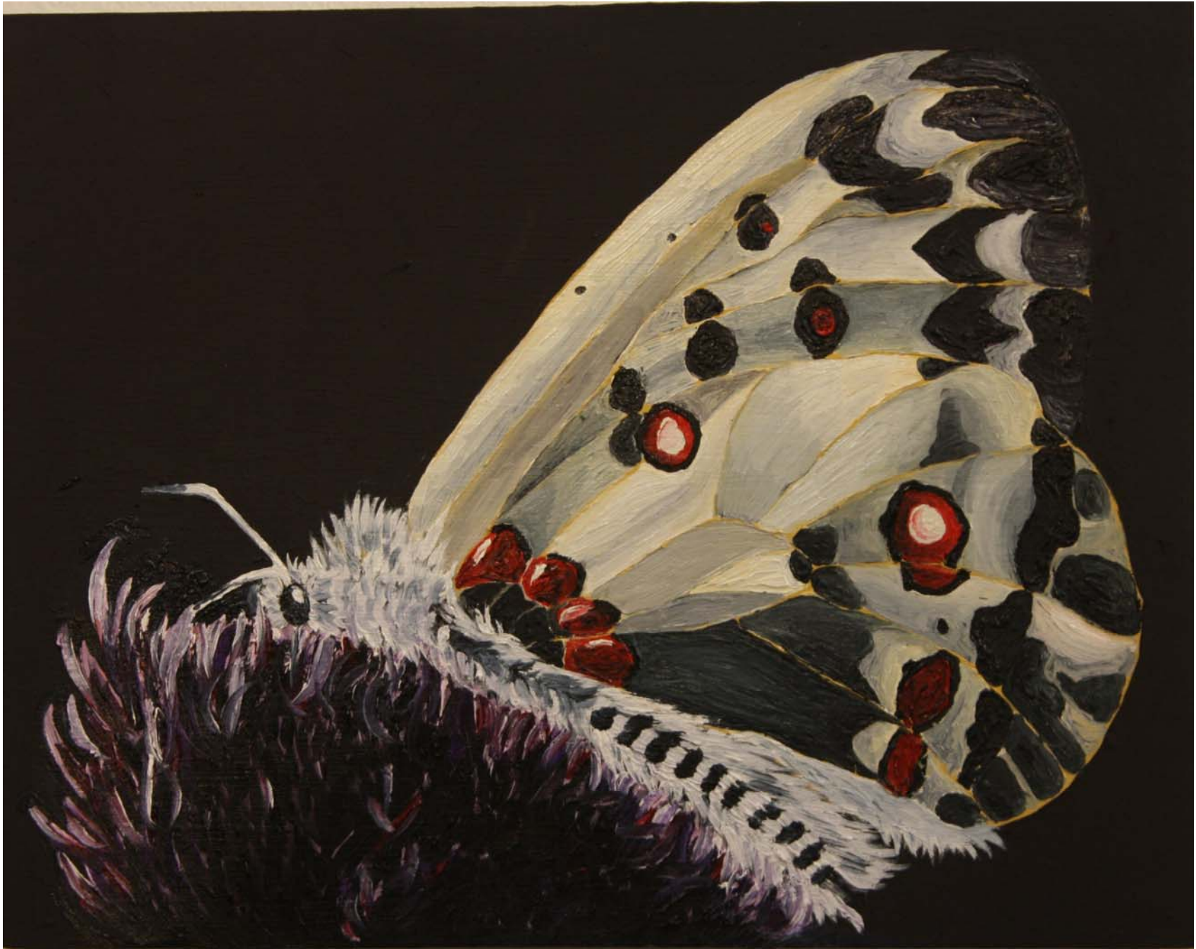
Figure 4: Apollo Butterfly, At Risk series.