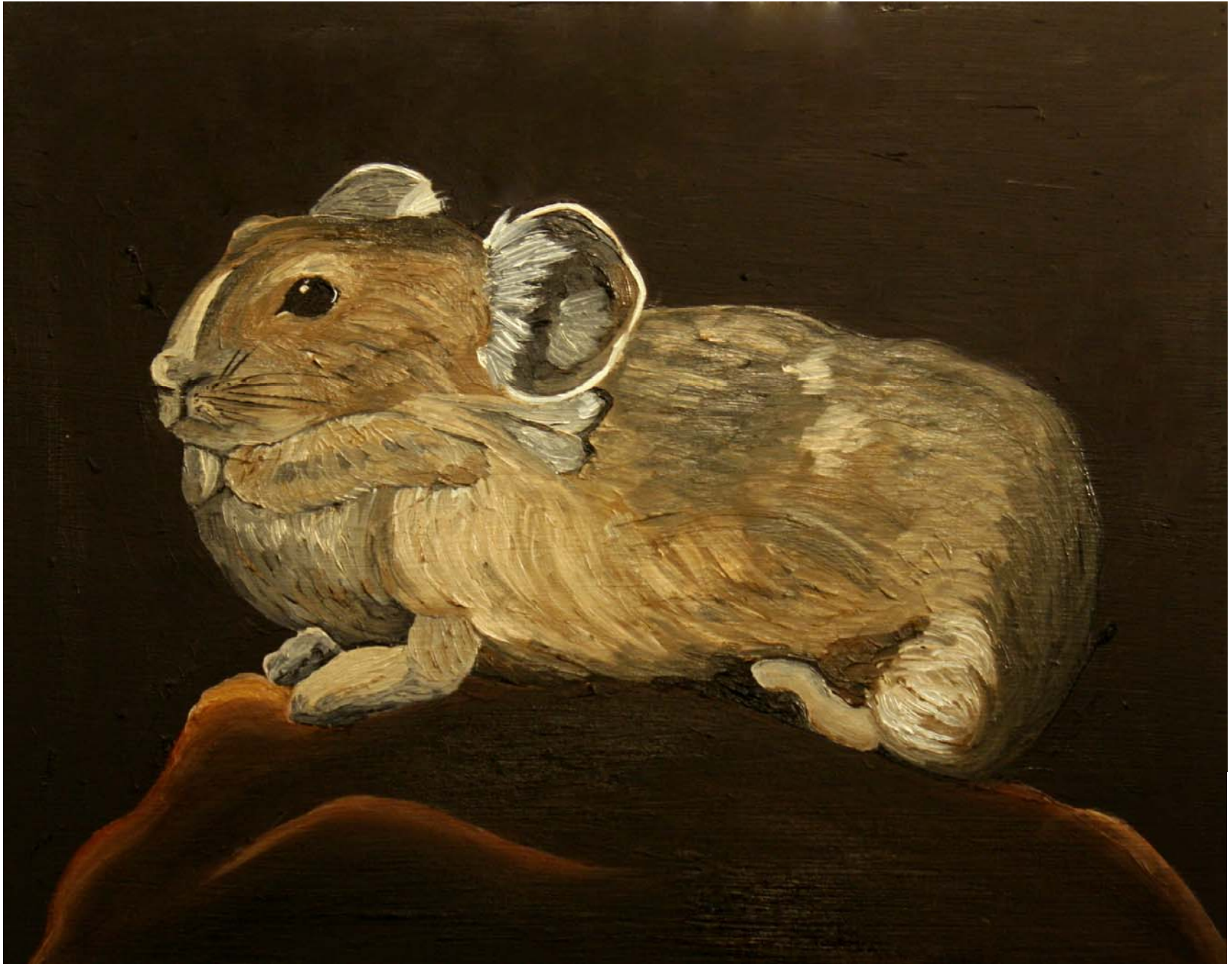
Figure 1: American Pika, At Risk series.