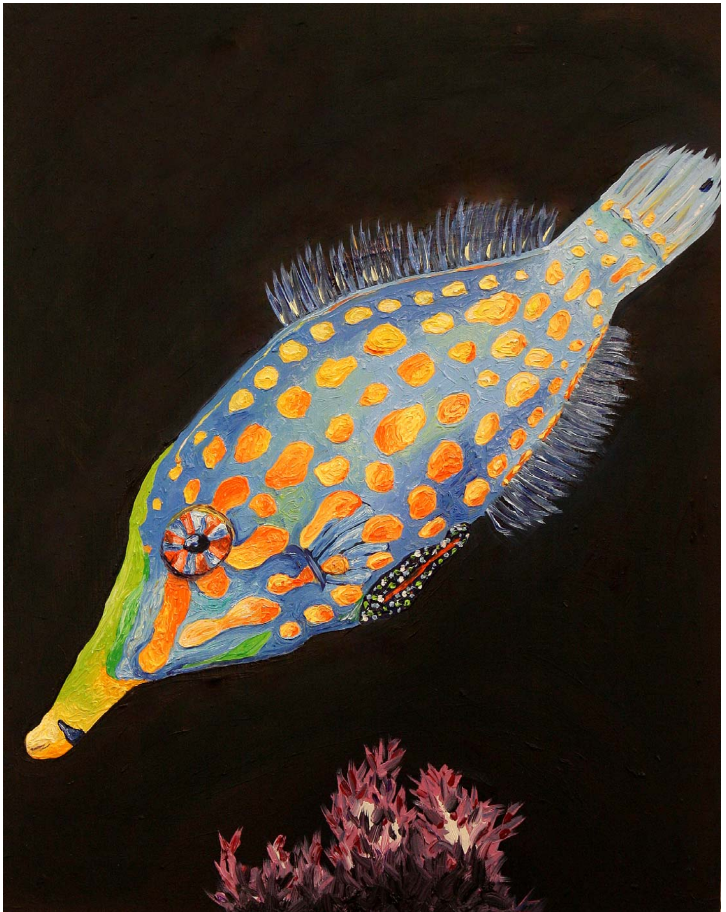
Figure 2: Orange Spotted Filefish, At Risk series.