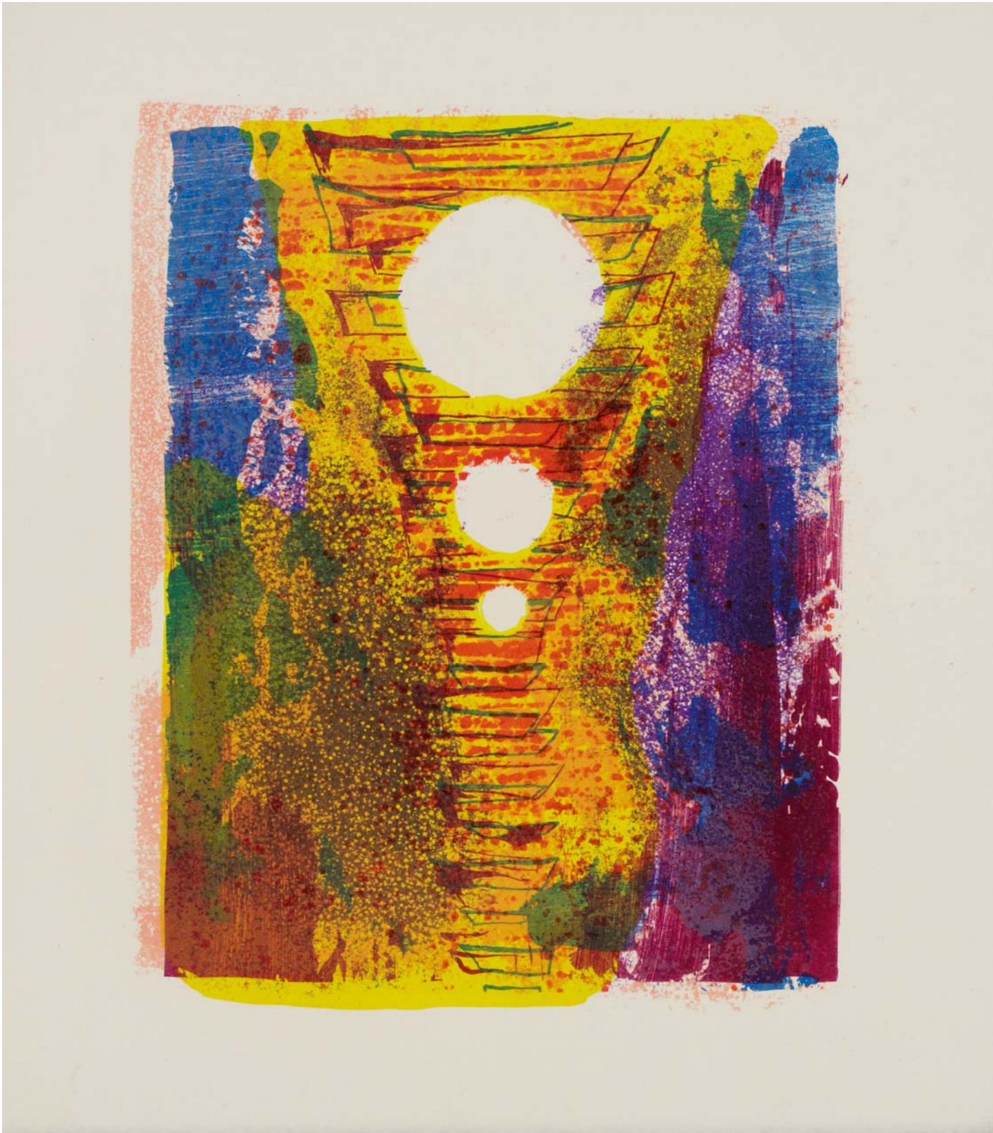
Figure 10: Quantifying Life.