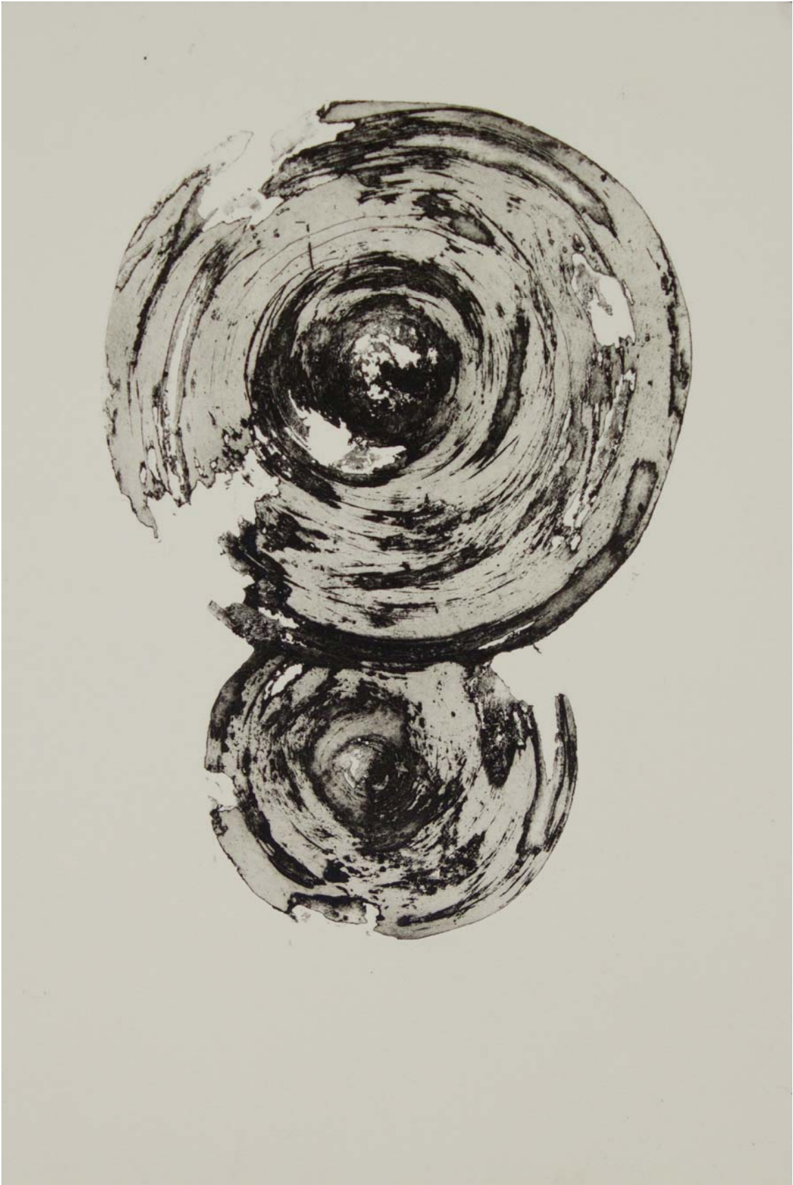
Figure 2: Deterioration of Two Cycles.