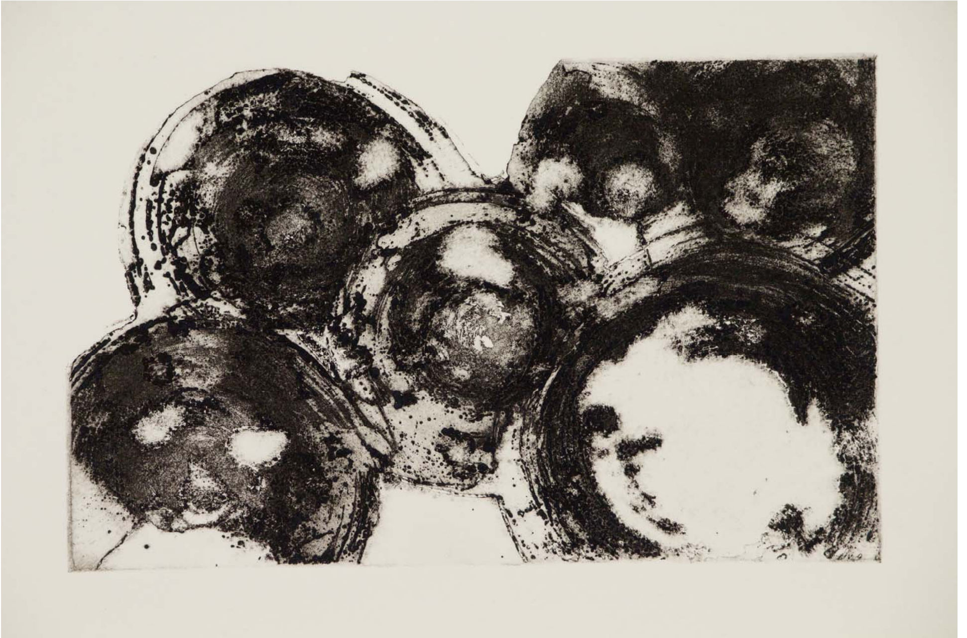
Figure 3: Deterioration Circles.