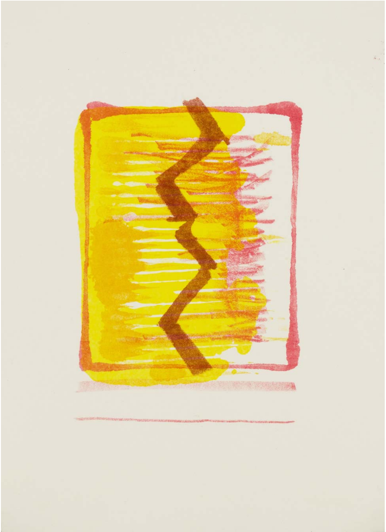
Figure 9: Missing the Adventure.