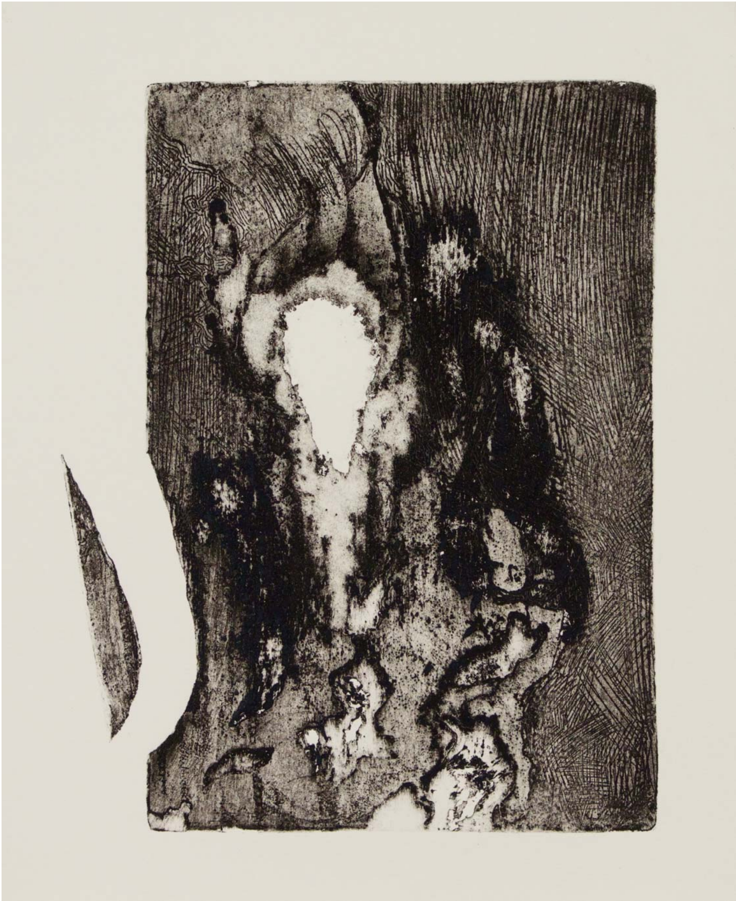
Figure 6: The Missing Piece.