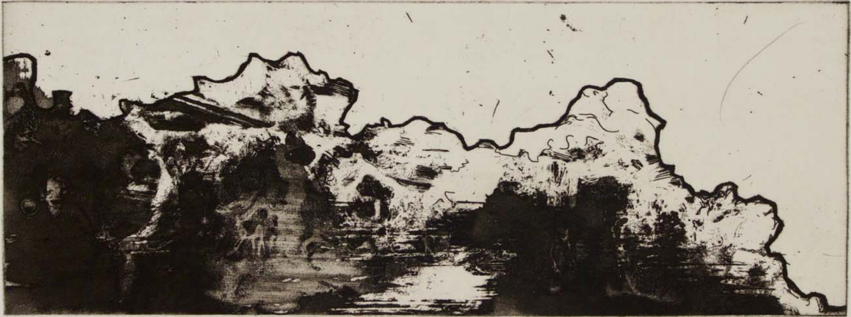
Figure 4: Natural Forces of Yes and No.