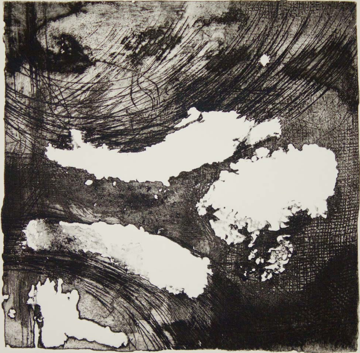
Figure 1: Deterioration Square.