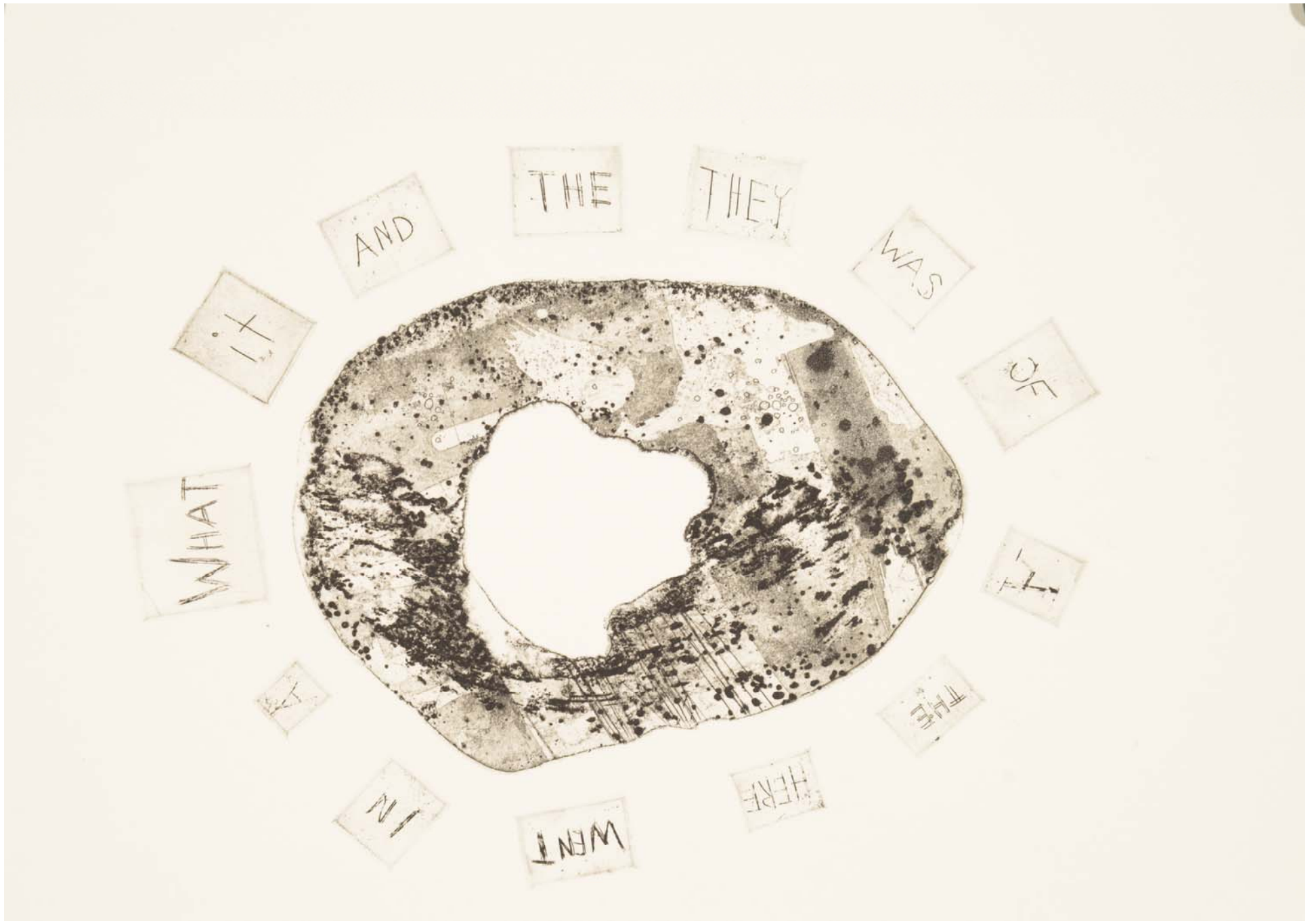
Figure 7: Talking in Circles.