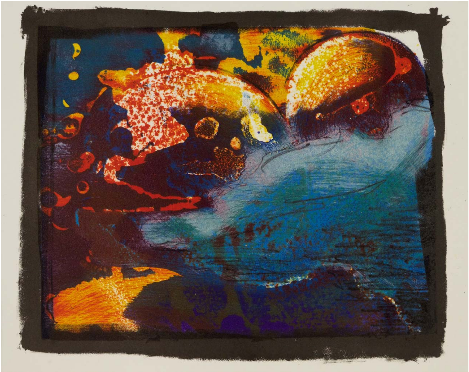
Figure 11: Cosmic.