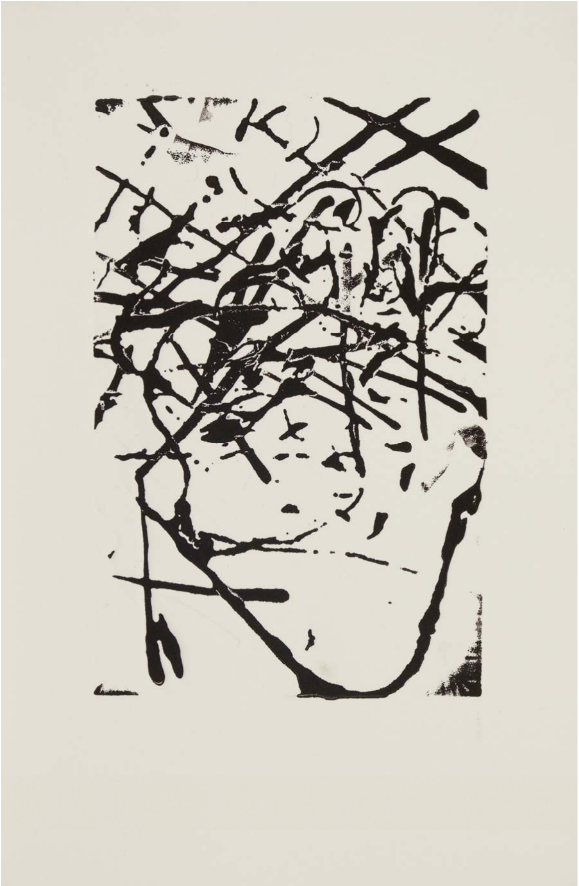
Figure 5: Linear Progression of Love.