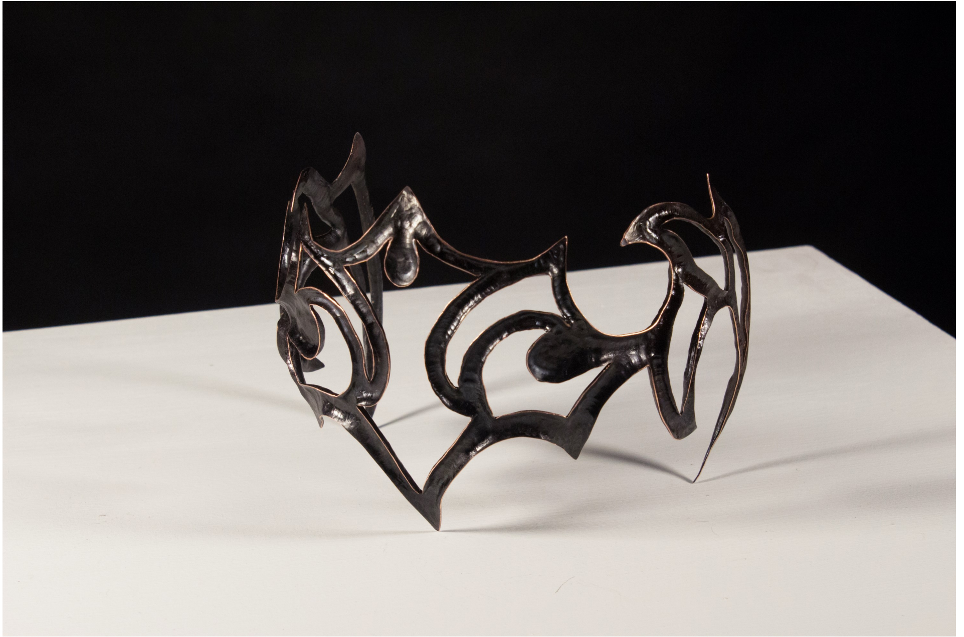
Figure 1: Fire.