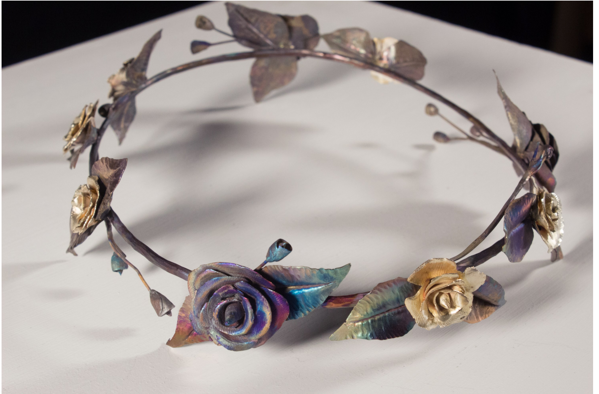
Figure 5: Flora.