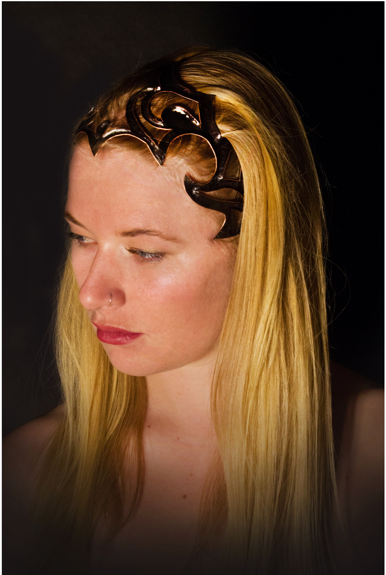
Figure 6: Fire modeled.