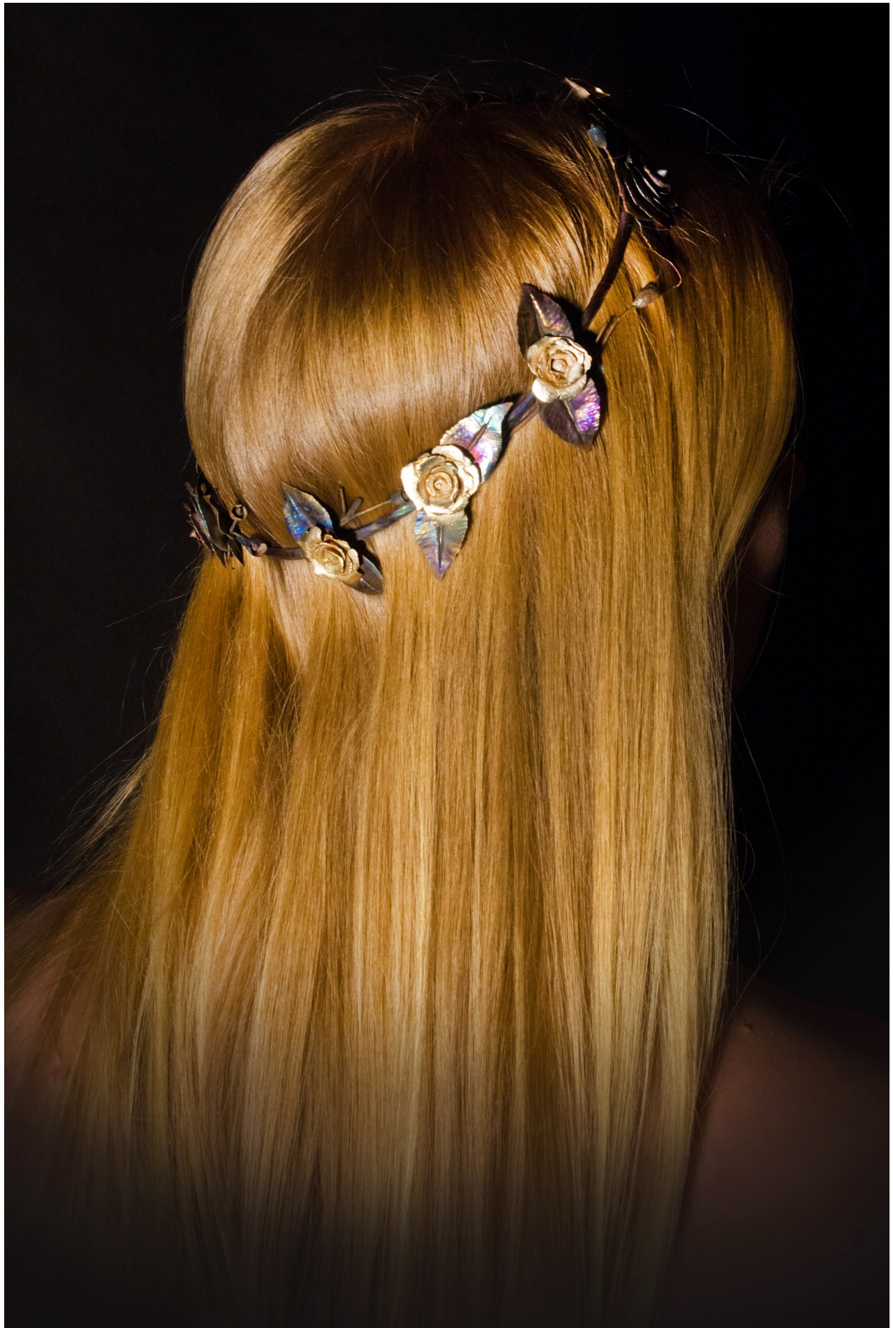
Figure 10: Flora Modeled.