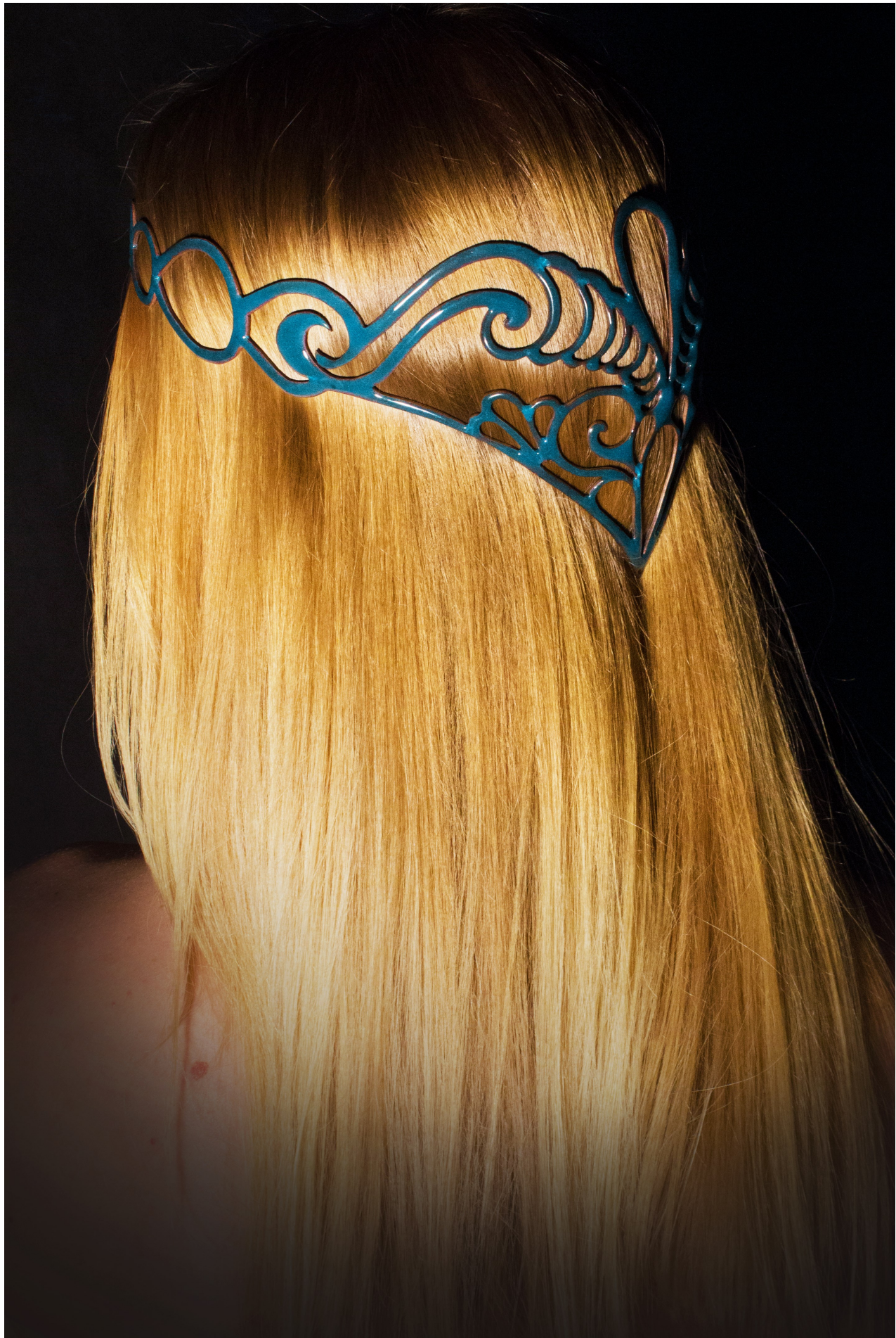
Figure 7: Water Modeled.