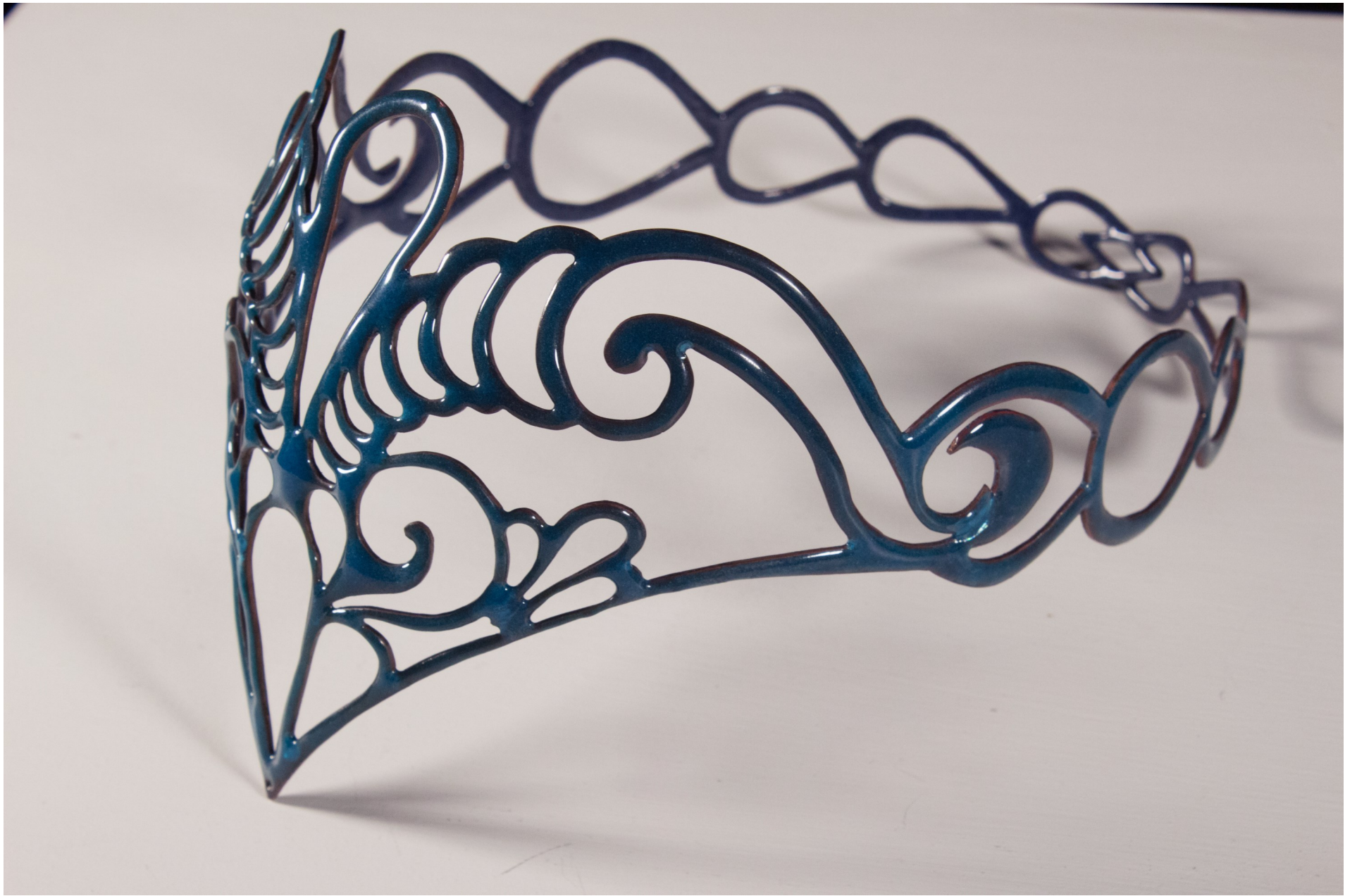
Figure 2: Water.