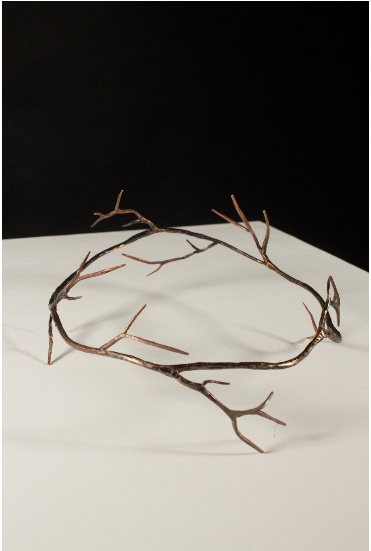
Figure 4: Earth.