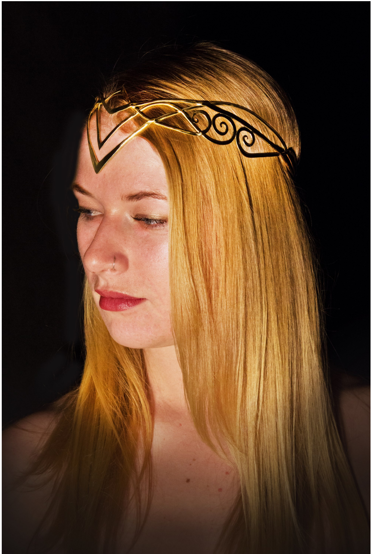
Figure 8: Wind Modeled.