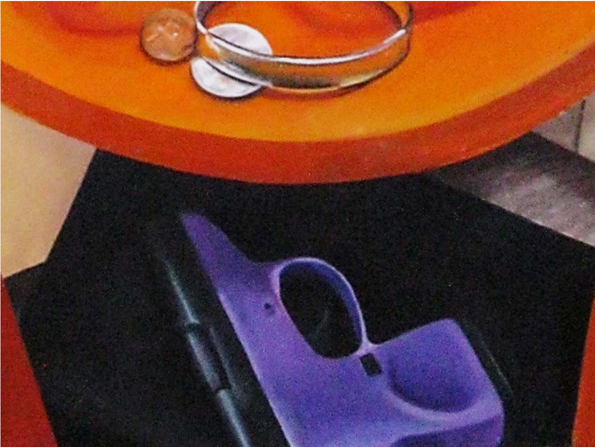
Figure 6: Intruders met with Deadly Force (detail).