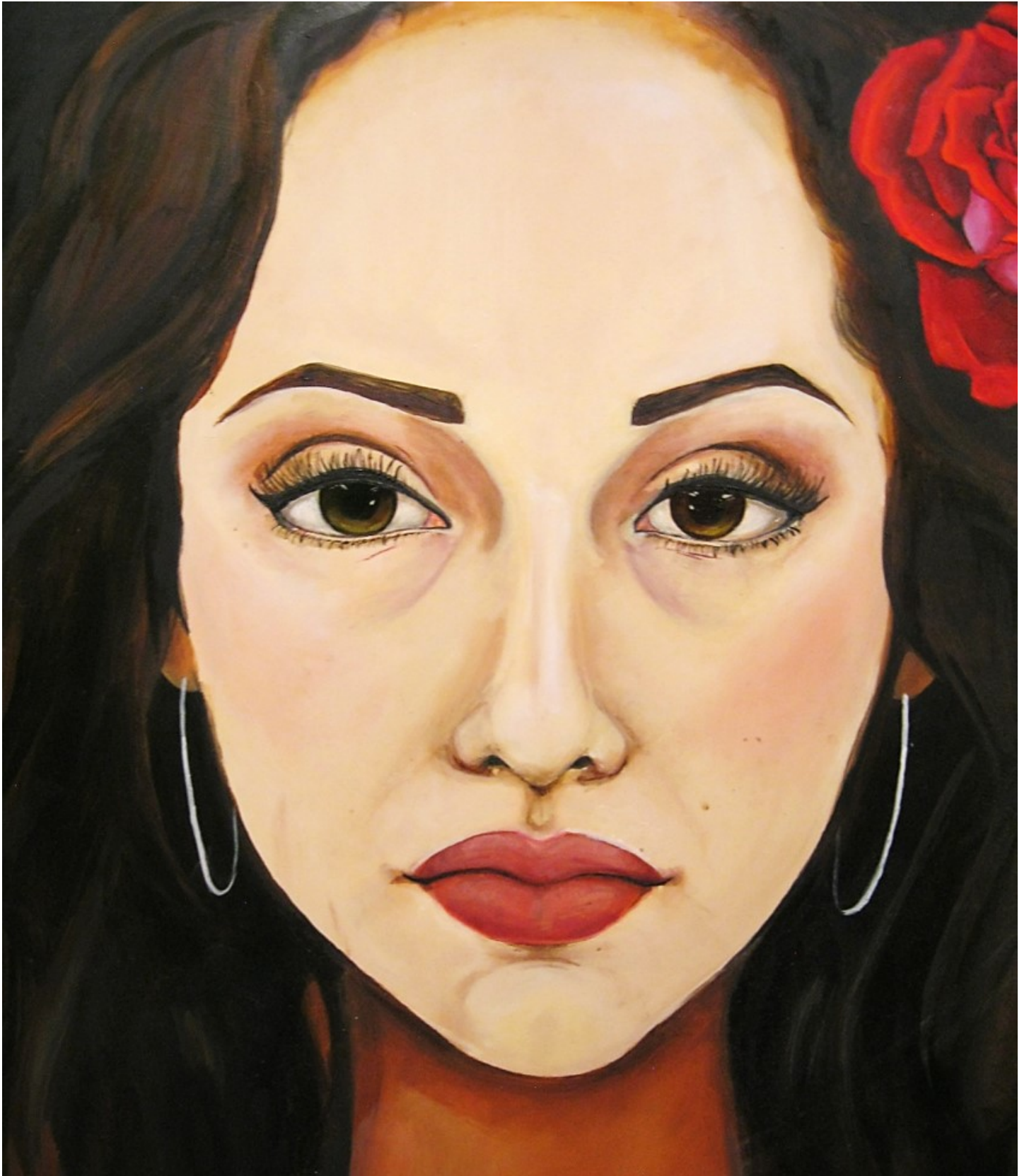
Figure 2: What are You (detail).