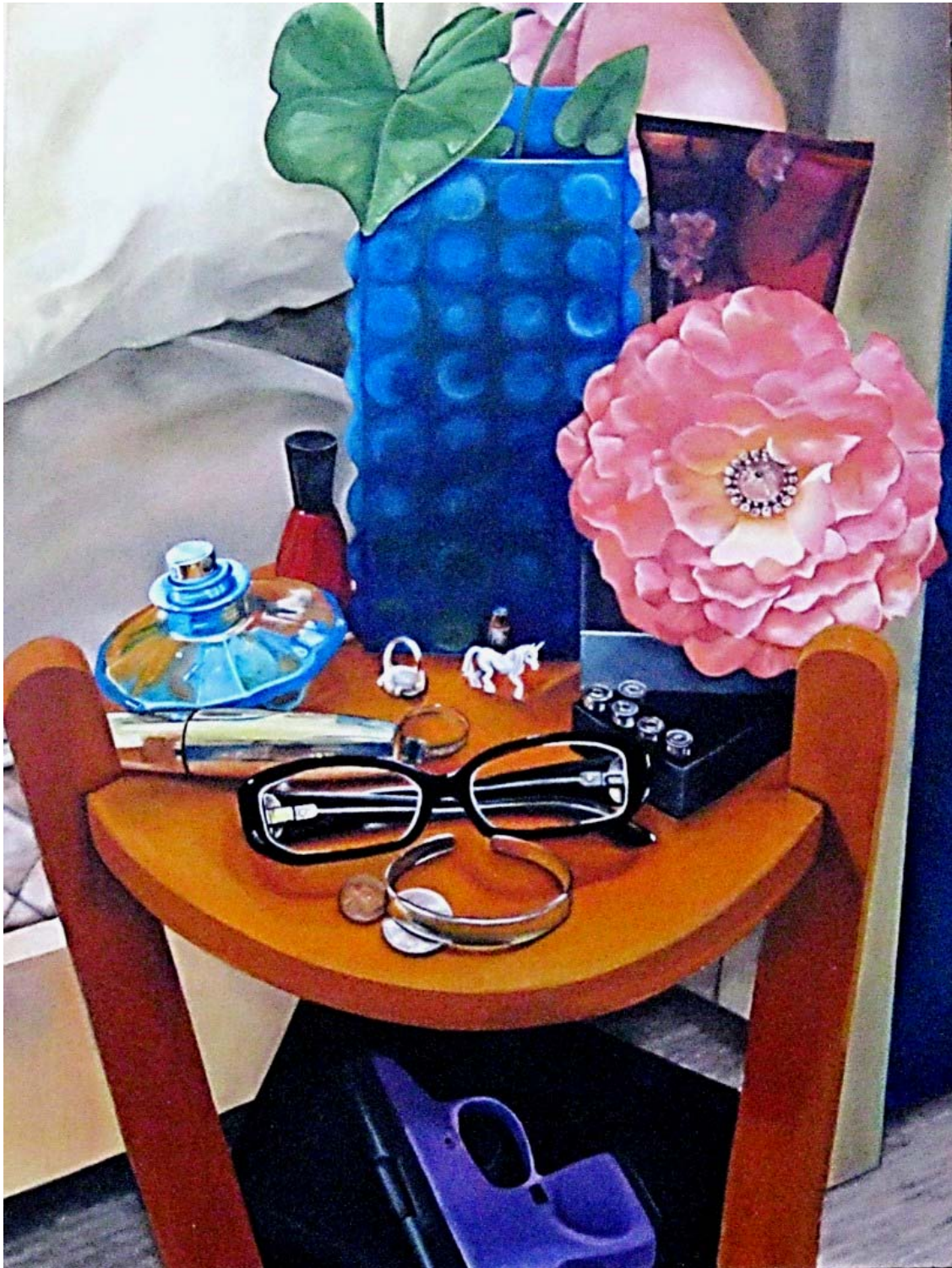
Figure 3: Intruders met with Deadly Force.