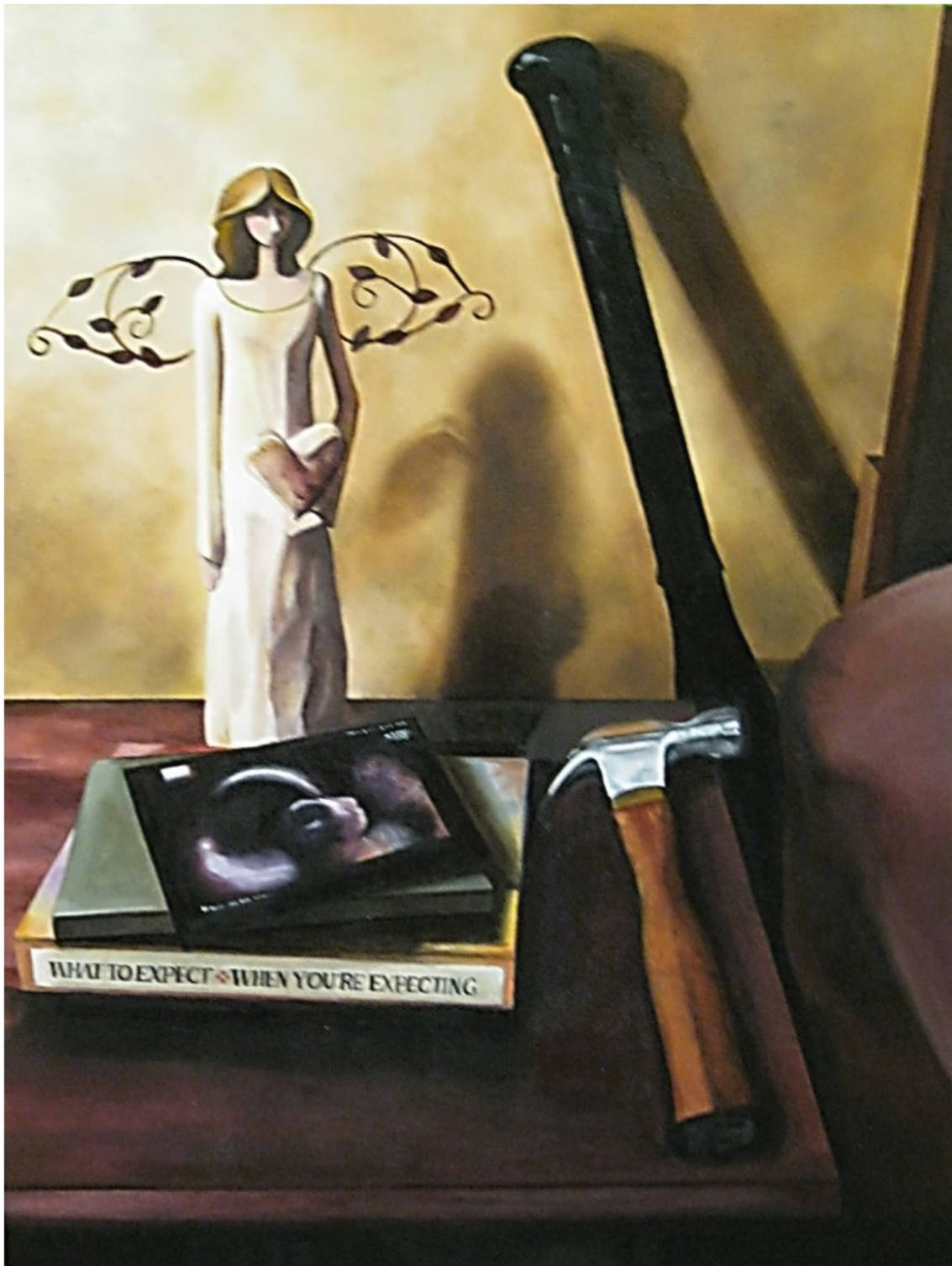
Figure 10: What to Expect.