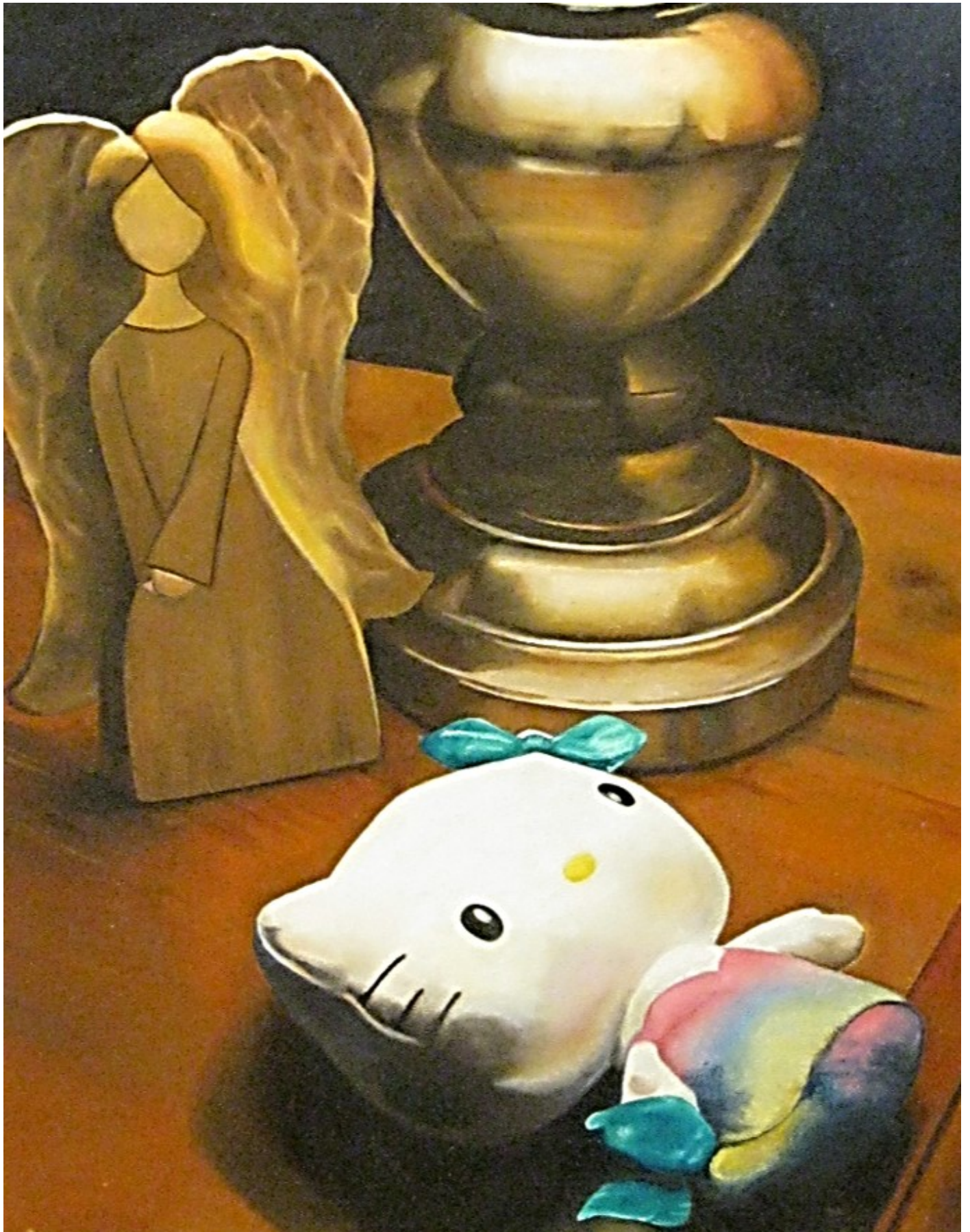
Figure 8: Your Daddy's Outta' Town (detail).