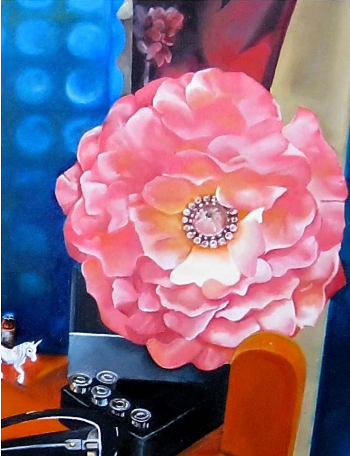
Figure 5: Intruders met with Deadly Force (detail).