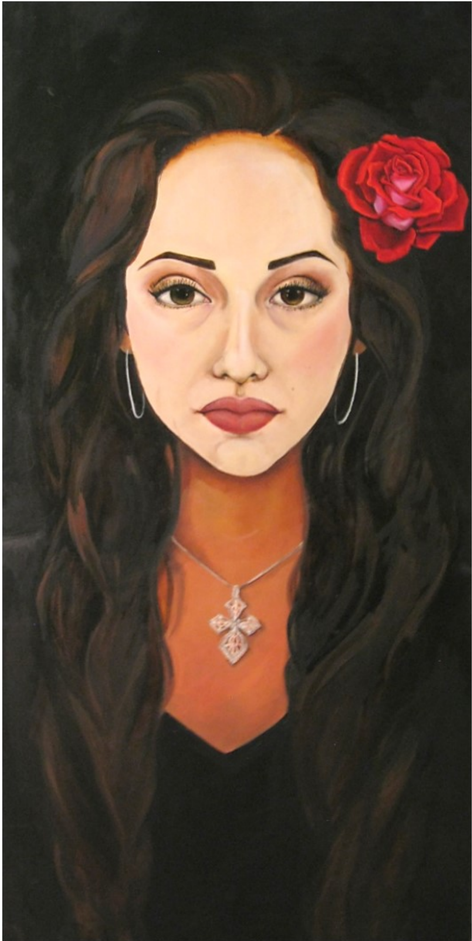
Figure 1: What are You.