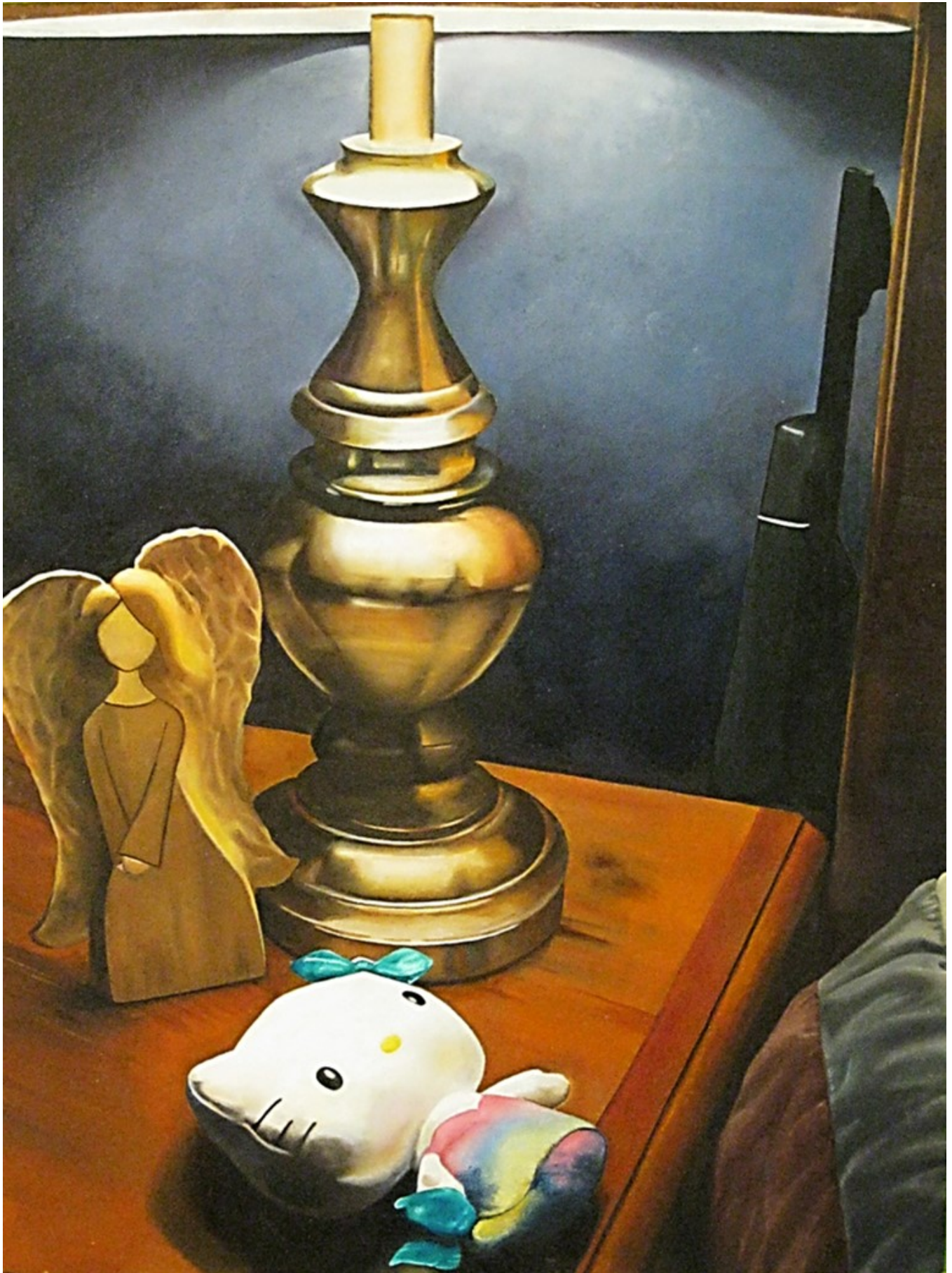
Figure 7: Your Daddy's Outta' Town.