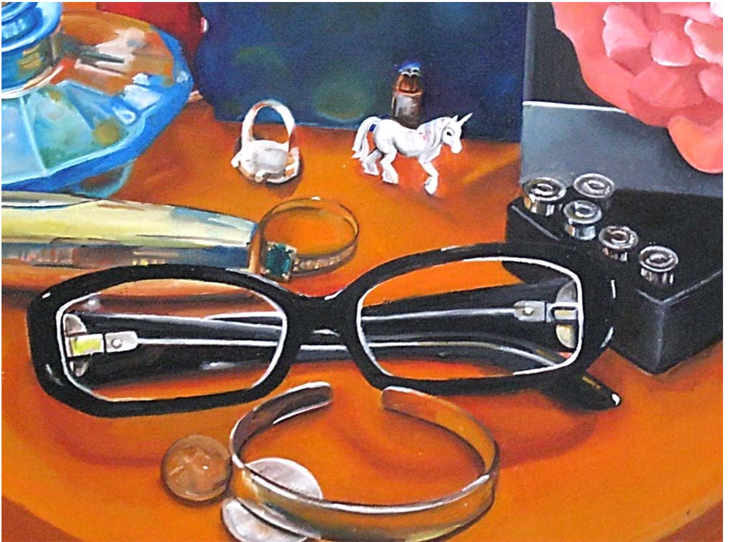
Figure 4: Intruders met with Deadly Force (detail).