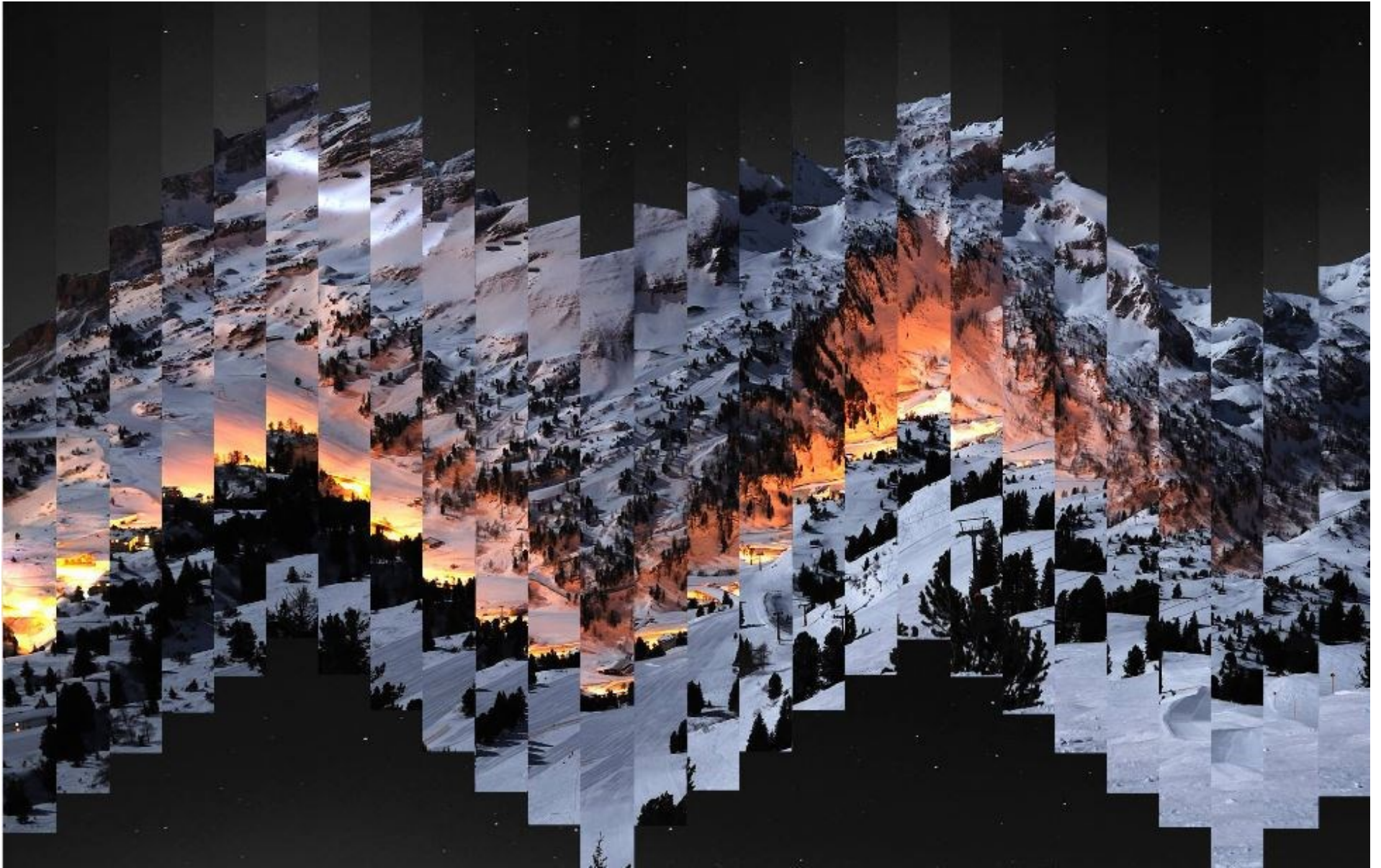
Figure 1: Mtn.