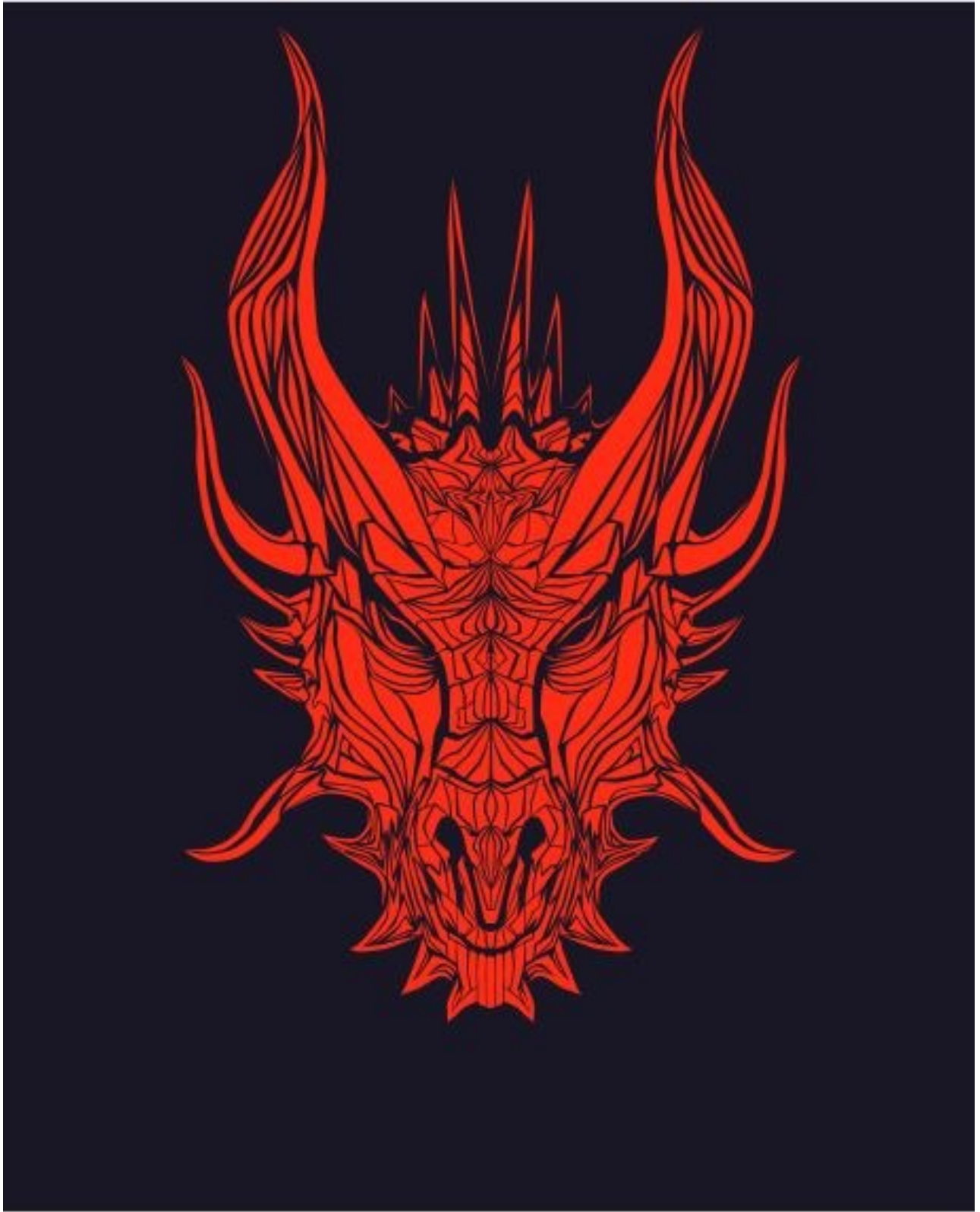
Figure 2: Dragon.