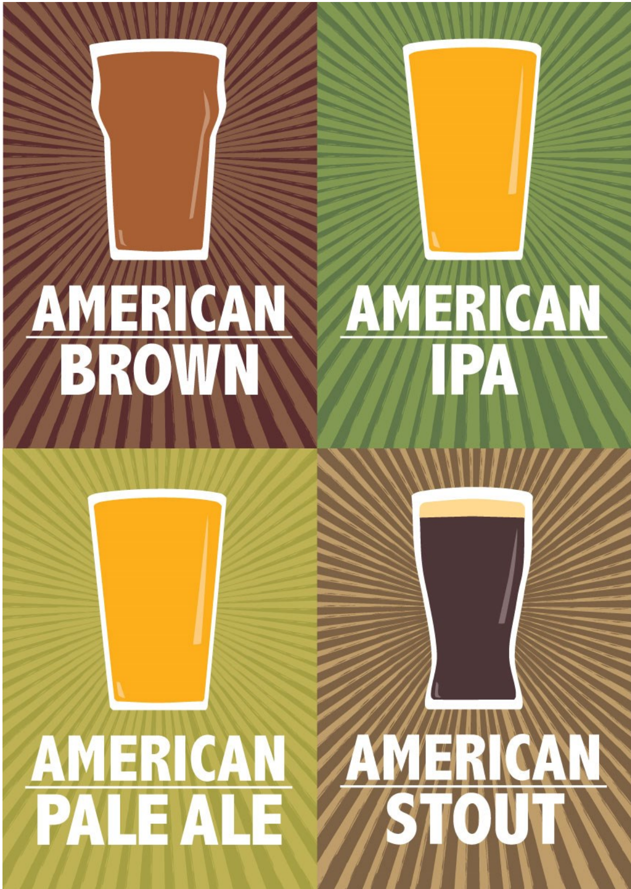
Figure 3: Beer Stamps.