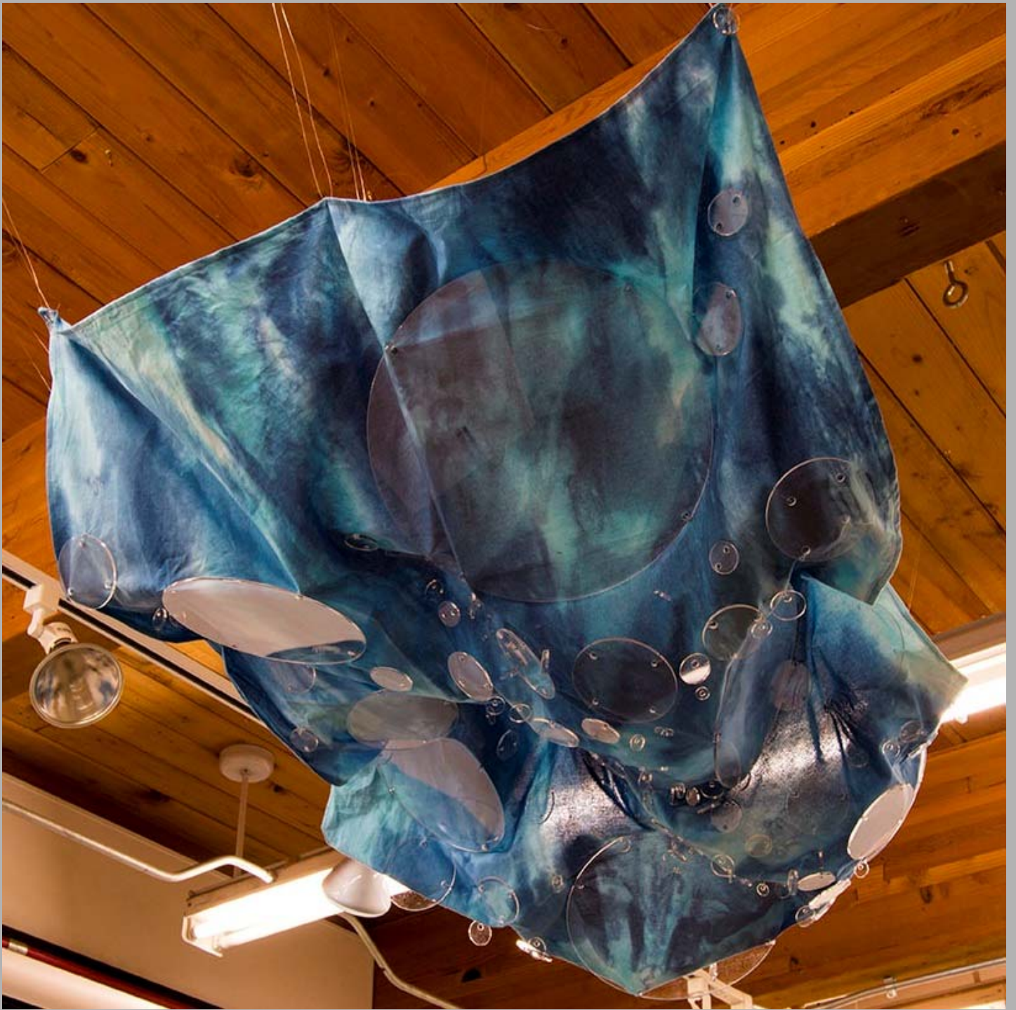
Figure 8: Mammals.