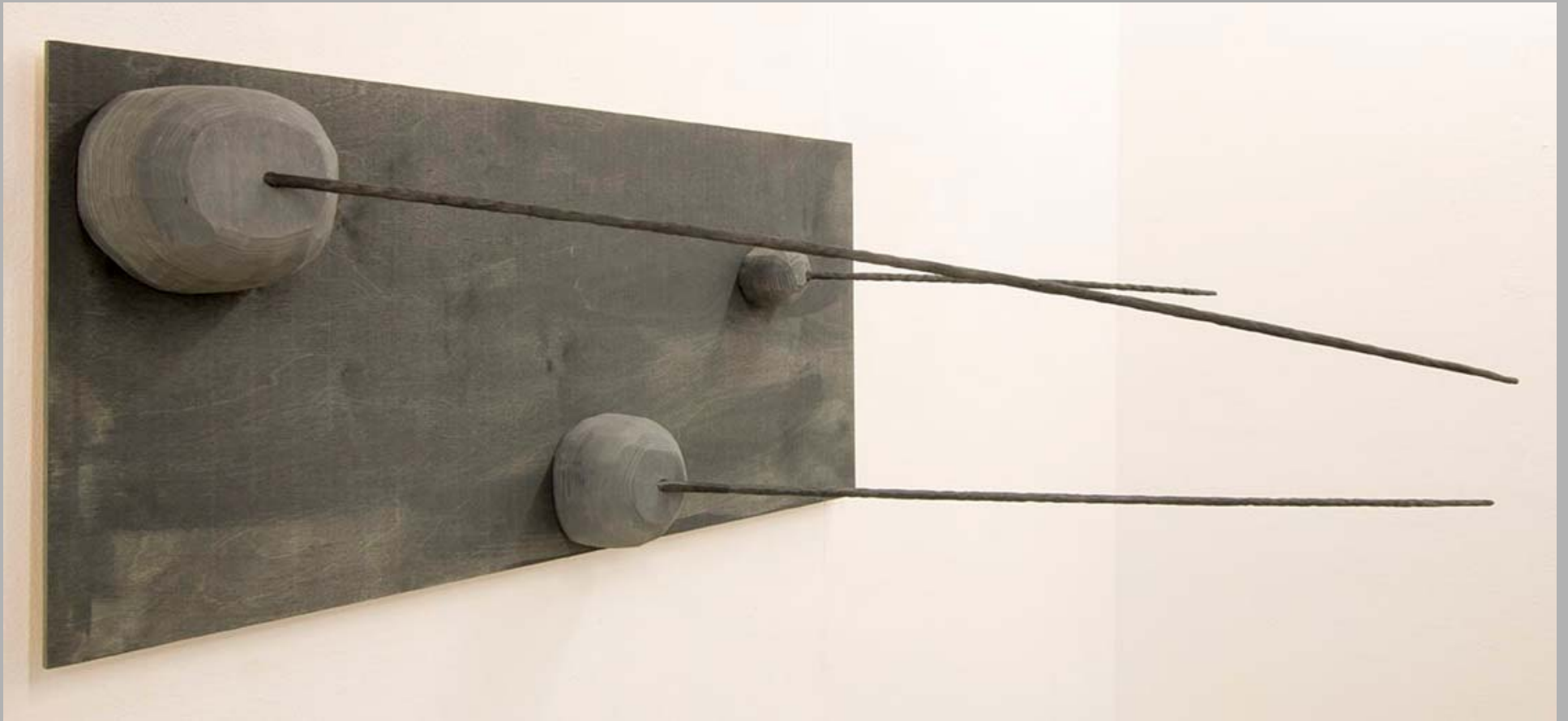
Figure 12: Leviathan Part 3.