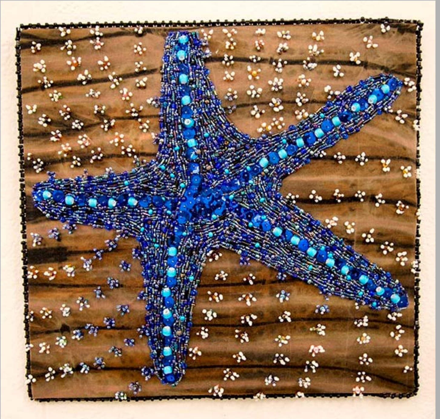
Figure 2: Sea Floor.