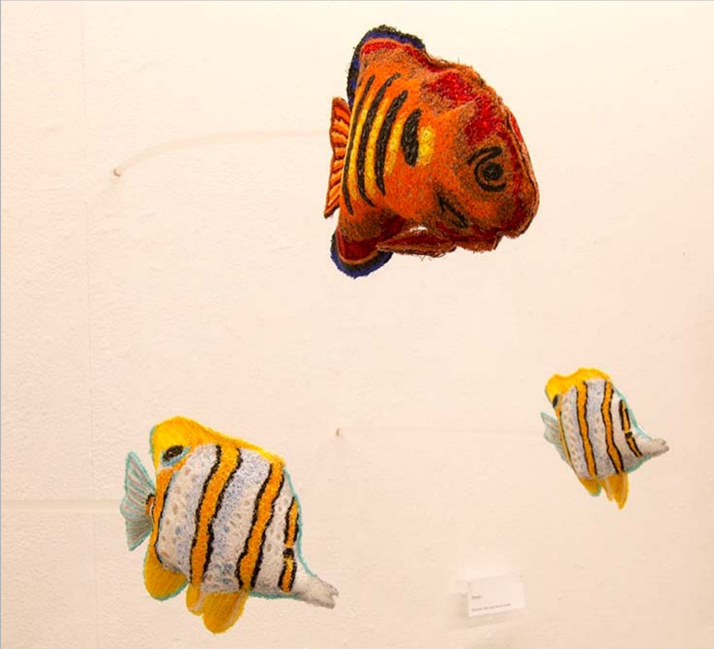
Figure 6: Escape.