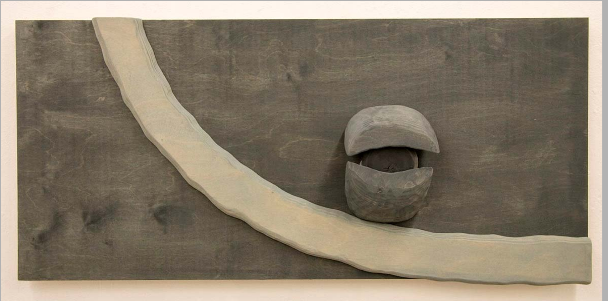
Figure 10: Leviathan Part 1.