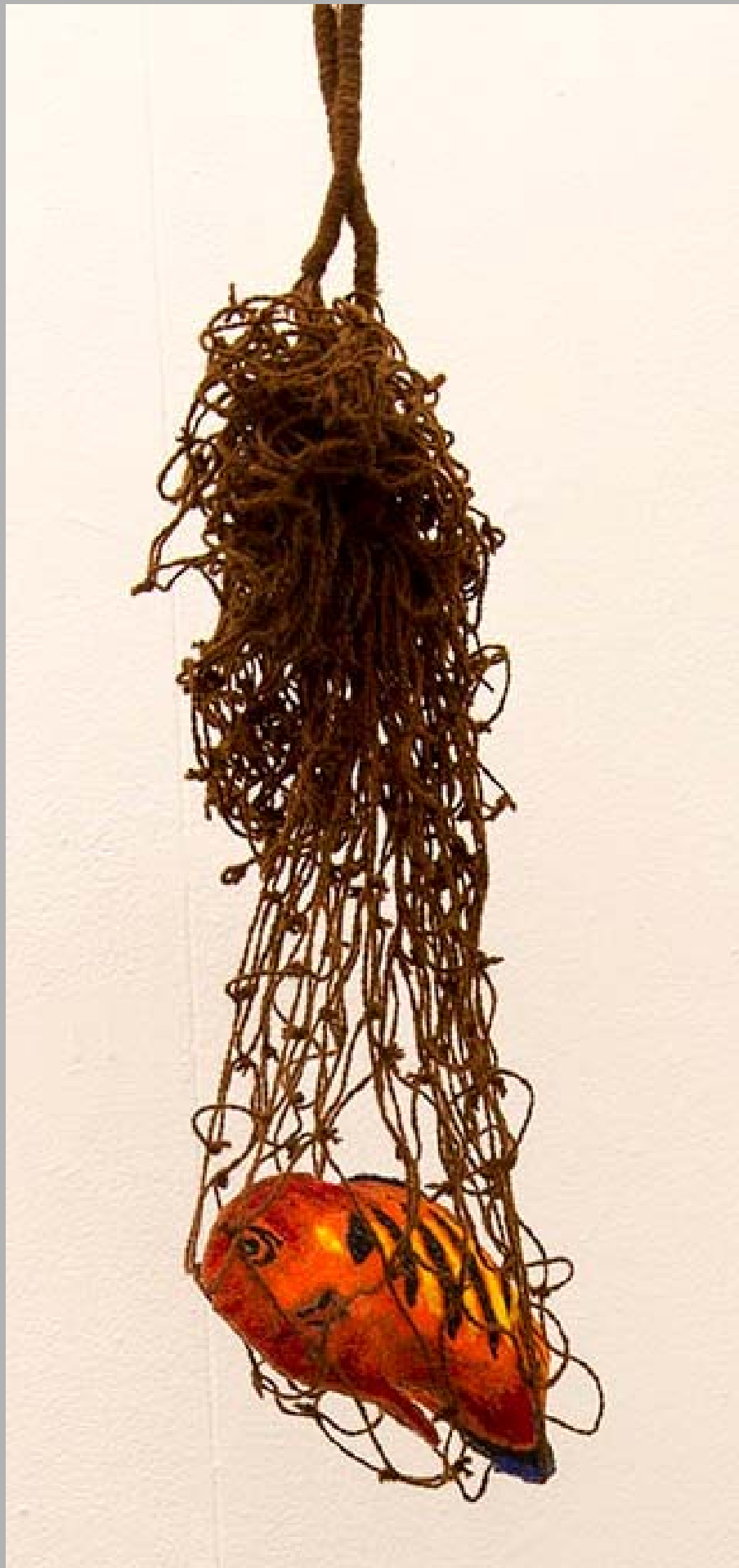
Figure 7: Fishnet.