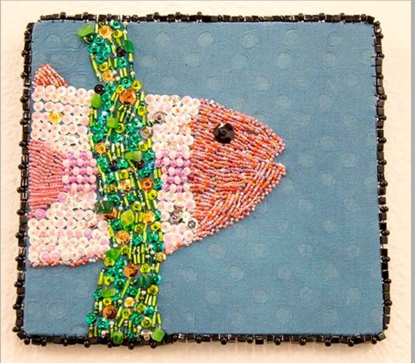
Figure 1: Aquarium.