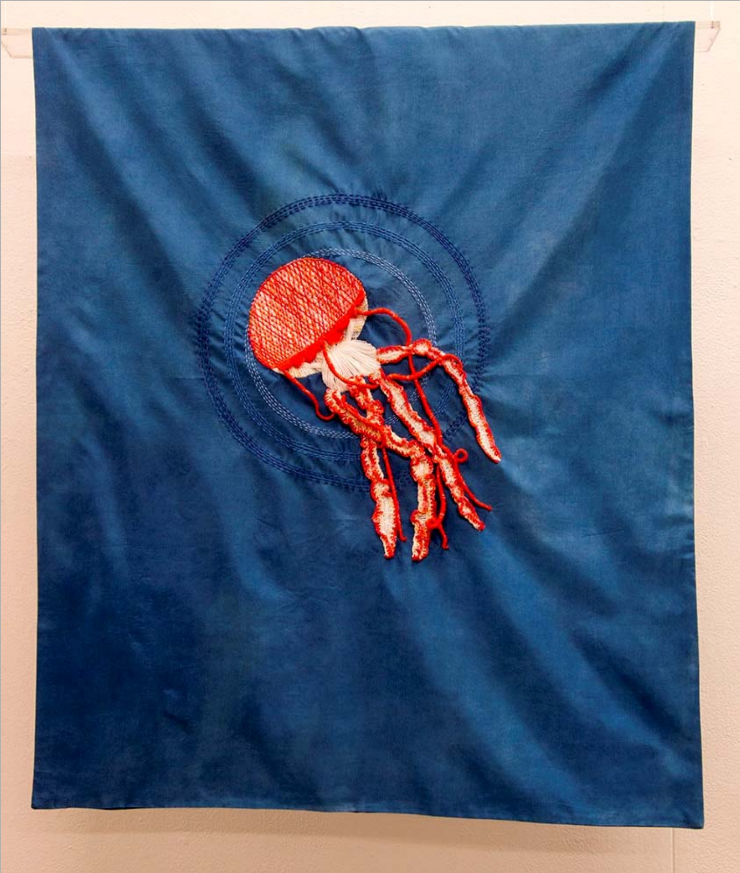
Figure 9: Survivor.