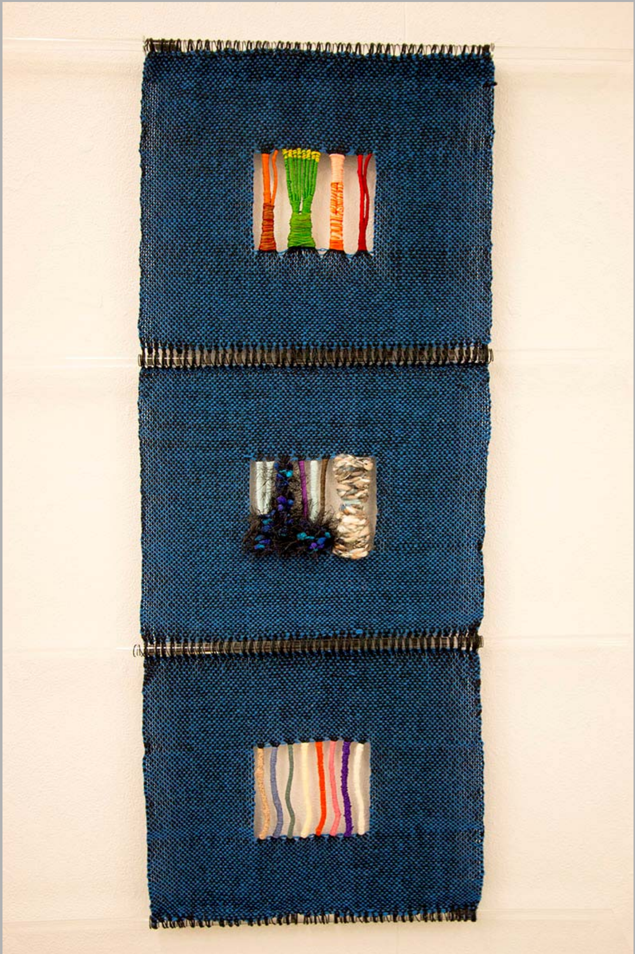
Figure 5: The Reef.