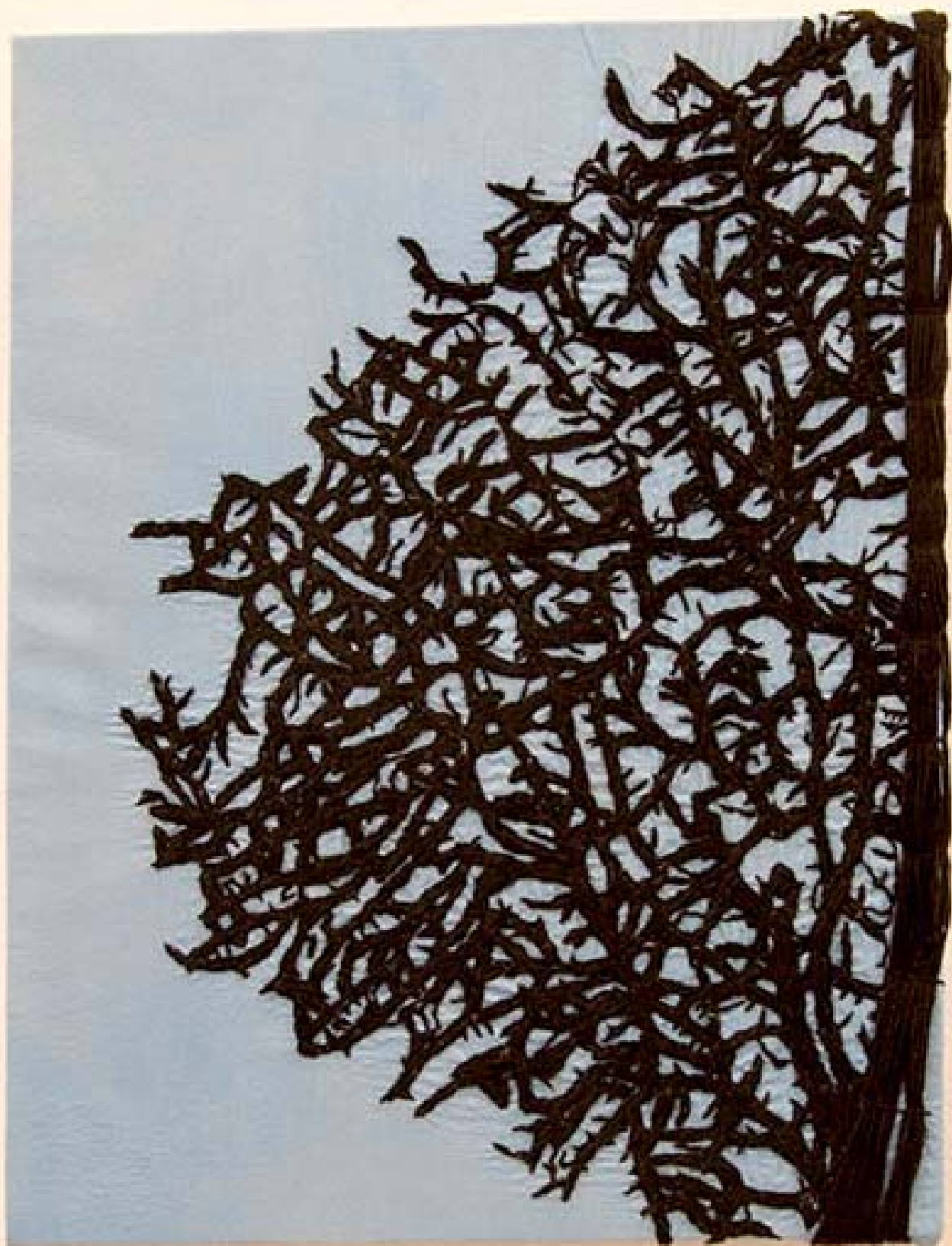
Figure 3: Fan Coral.