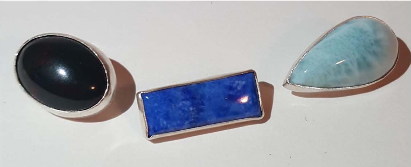
Figure 6: Recreational Chemical Pleasure Inducer (Stones).