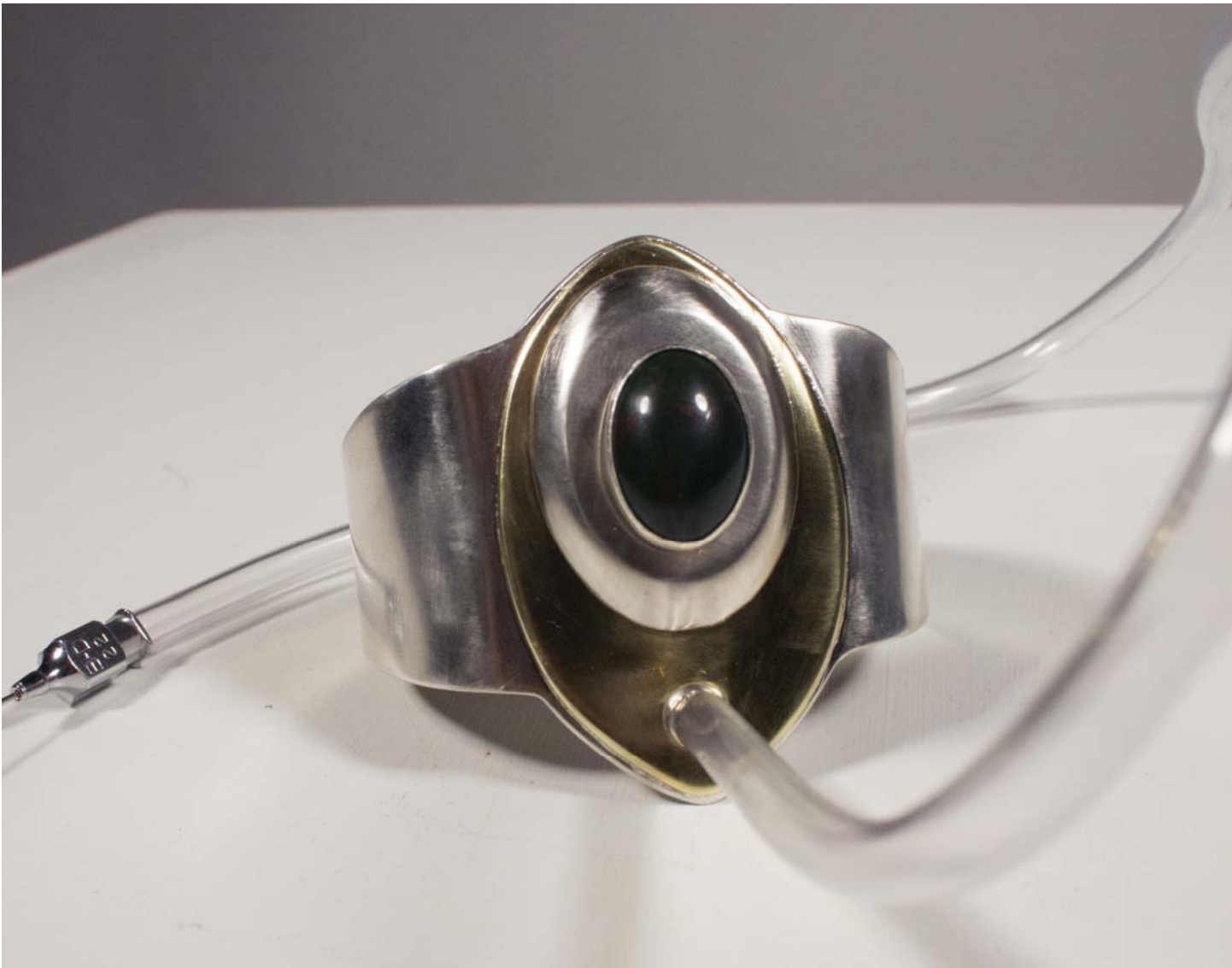
Figure 5: Recreational Chemical Pleasure Inducer (3).