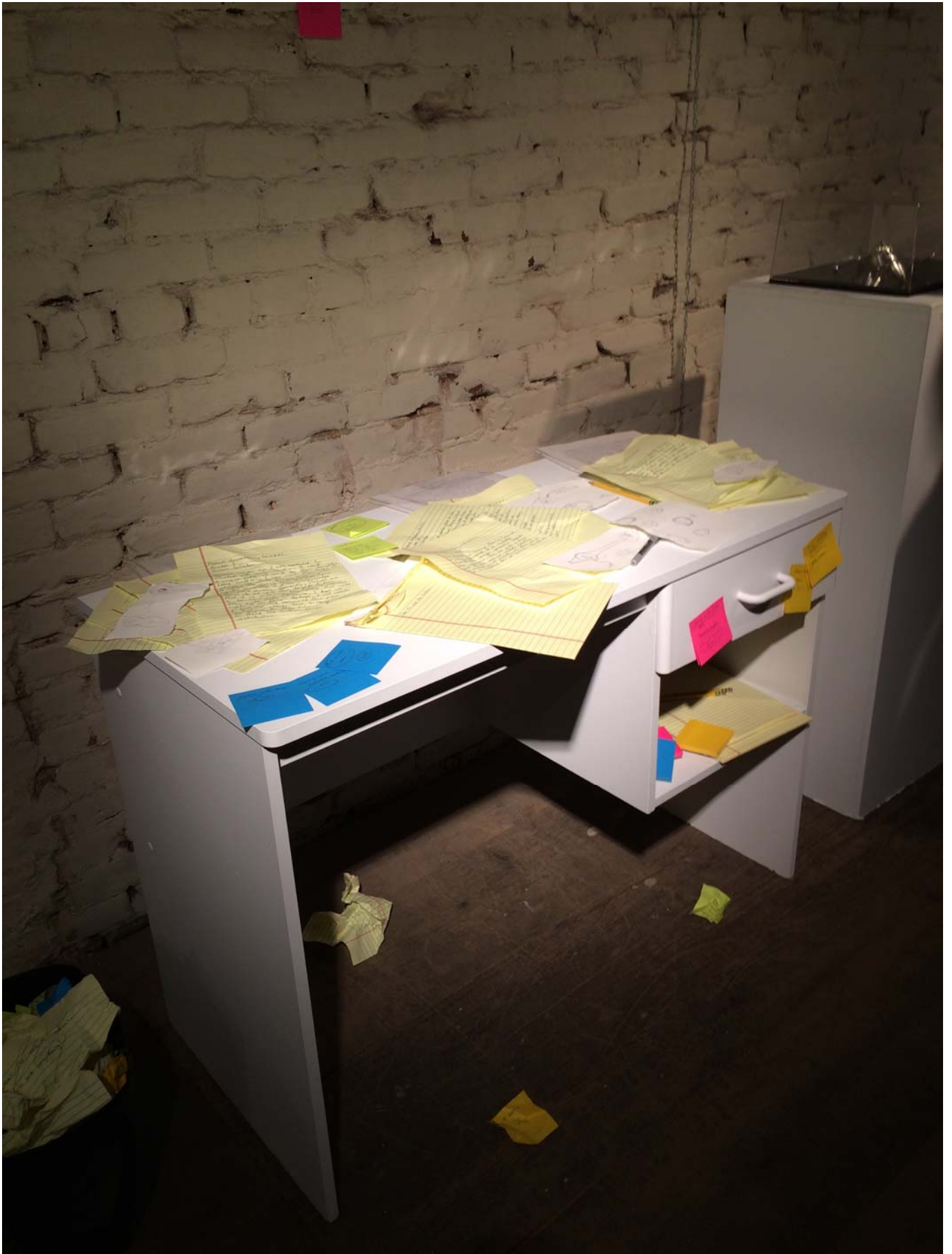
Figure 10: Simon Salvador's Desk.