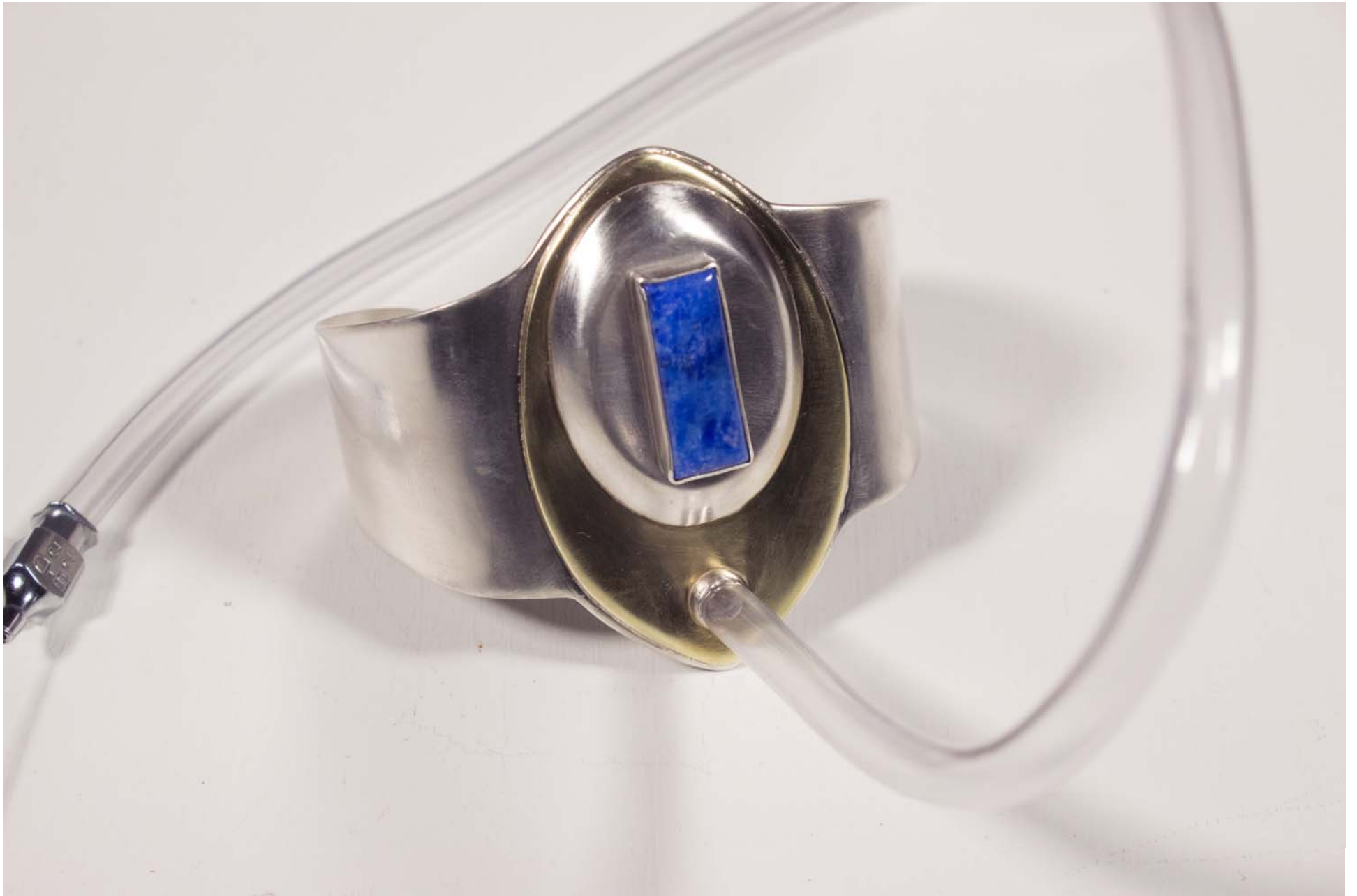
Figure 4: Recreational Chemical Pleasure Inducer (2).