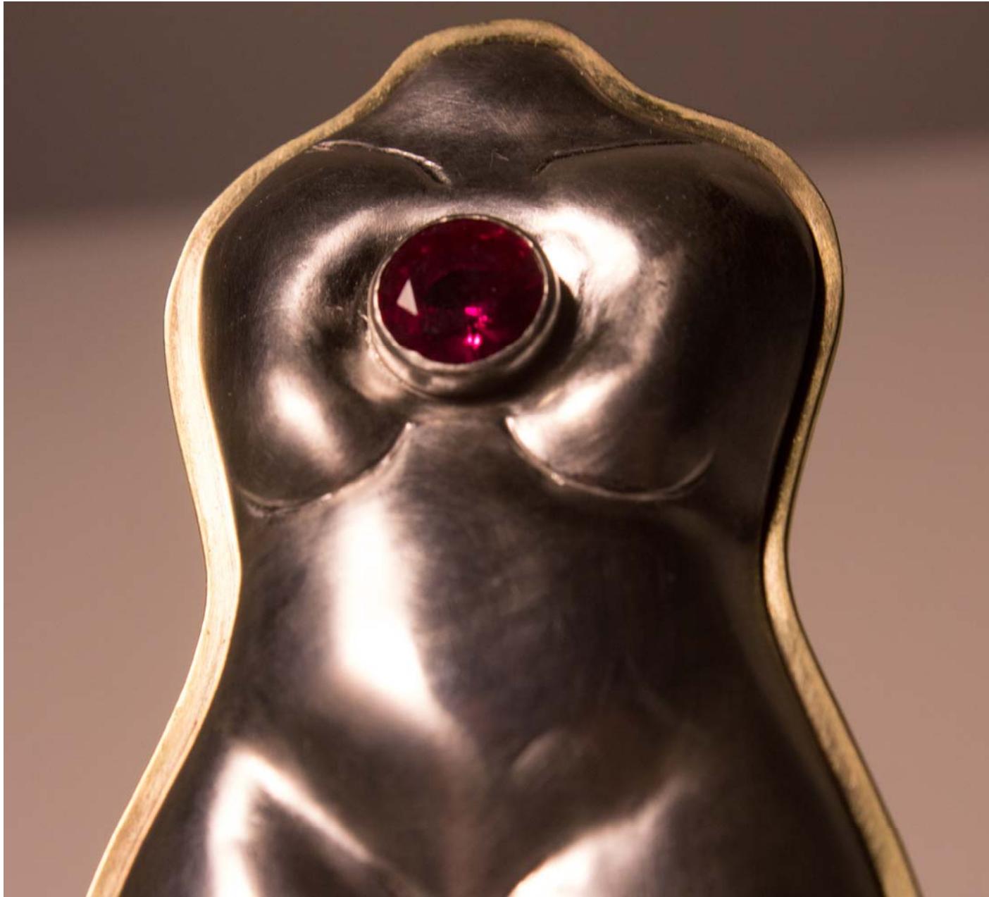
Figure 9: Uniquely You Body Enhancer (Detail).