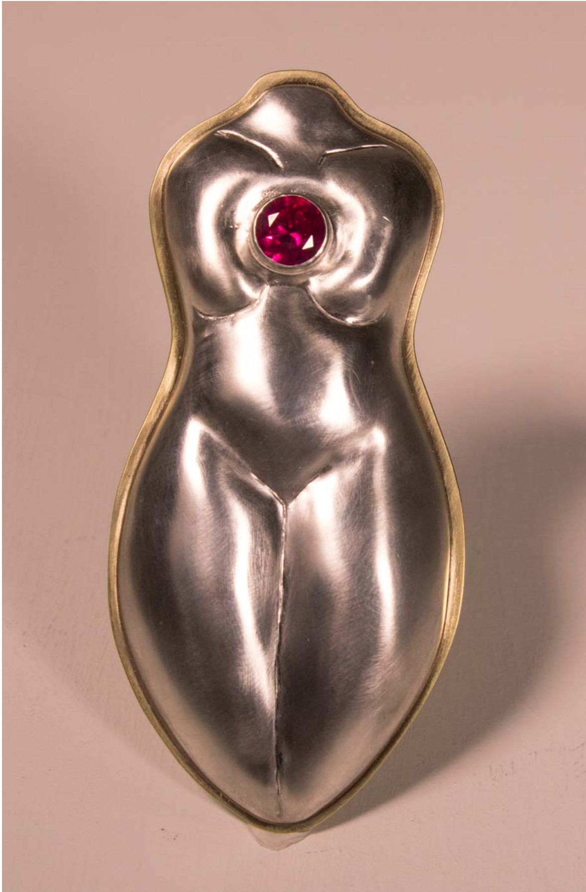
Figure 7: Uniquely You Body Enhancer (1).