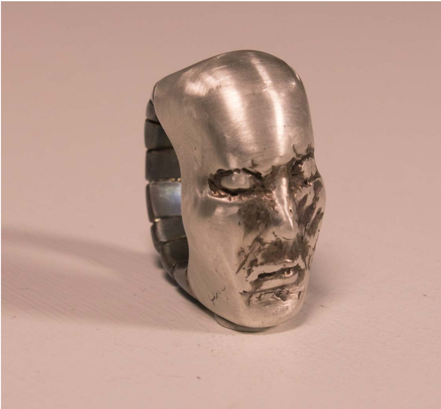
Figure 1: Travelling All Around Health Tracker (1).