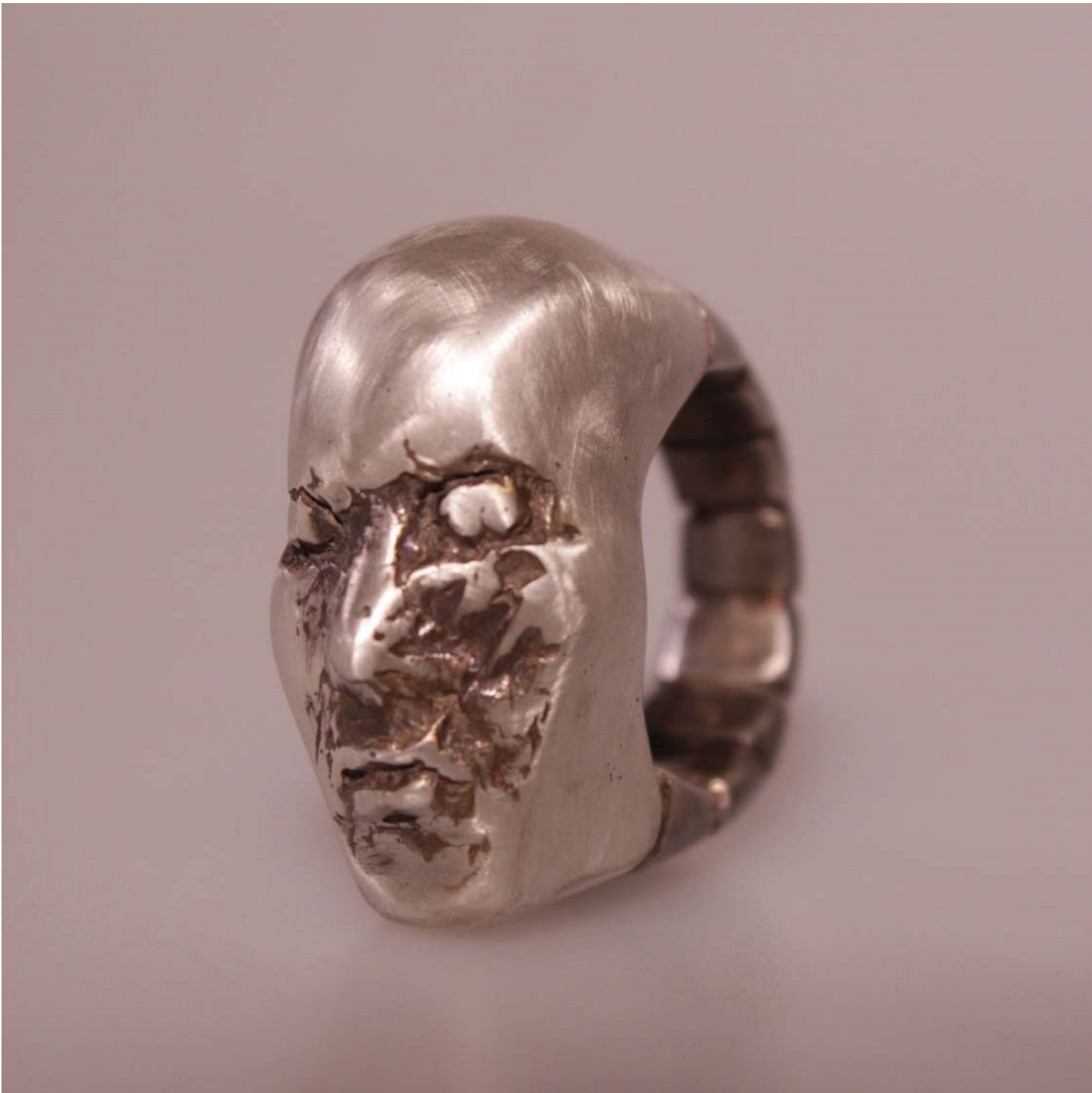
Figure 2: Travelling All Around Health Tracker (2).