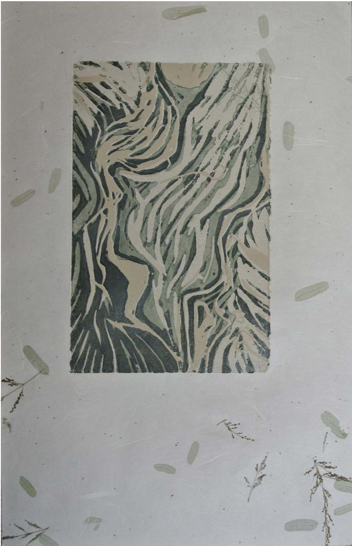
Figure 1: Window 1.