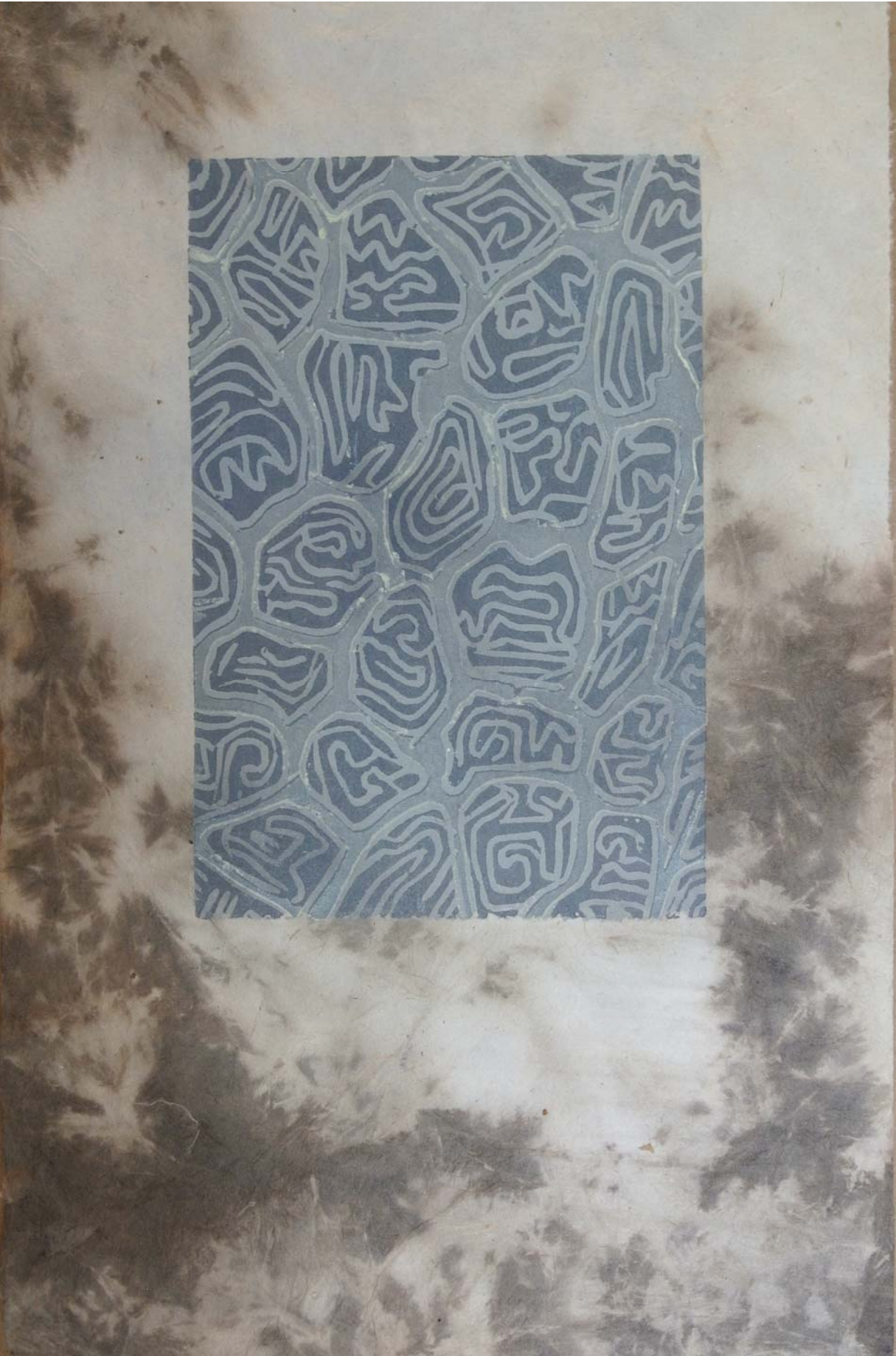
Figure 9: Window 9.