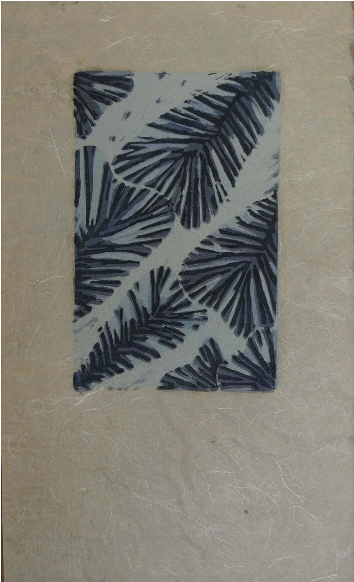
Figure 3: Window 3.