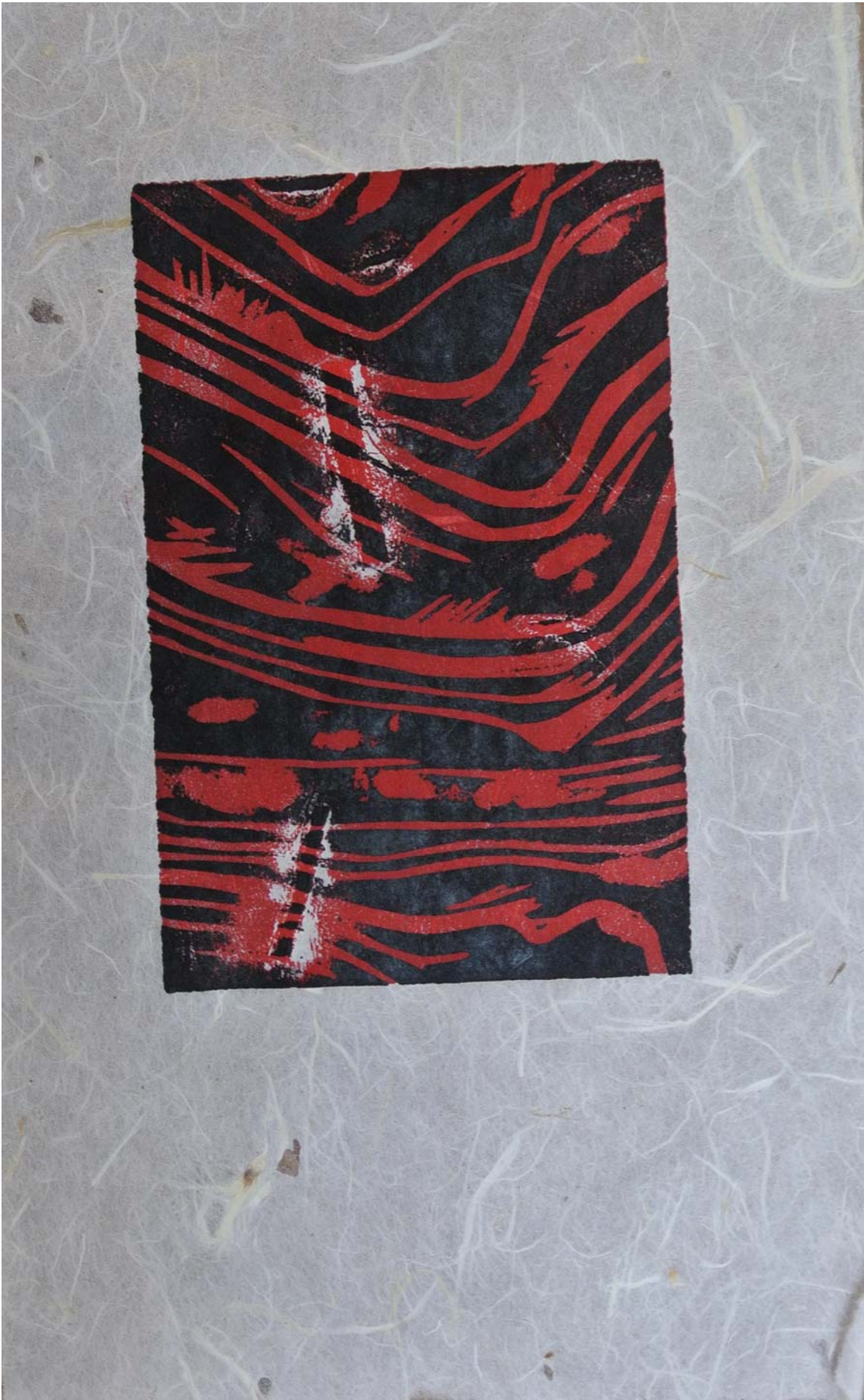
Figure 11: Window 11.