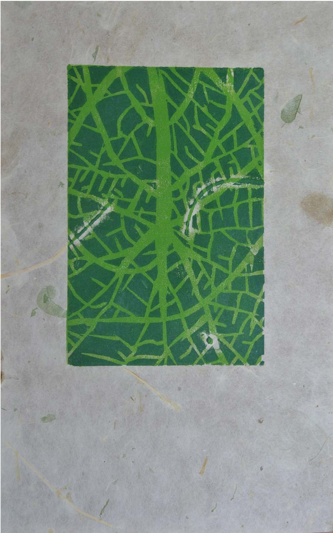
Figure 8: Window 8.