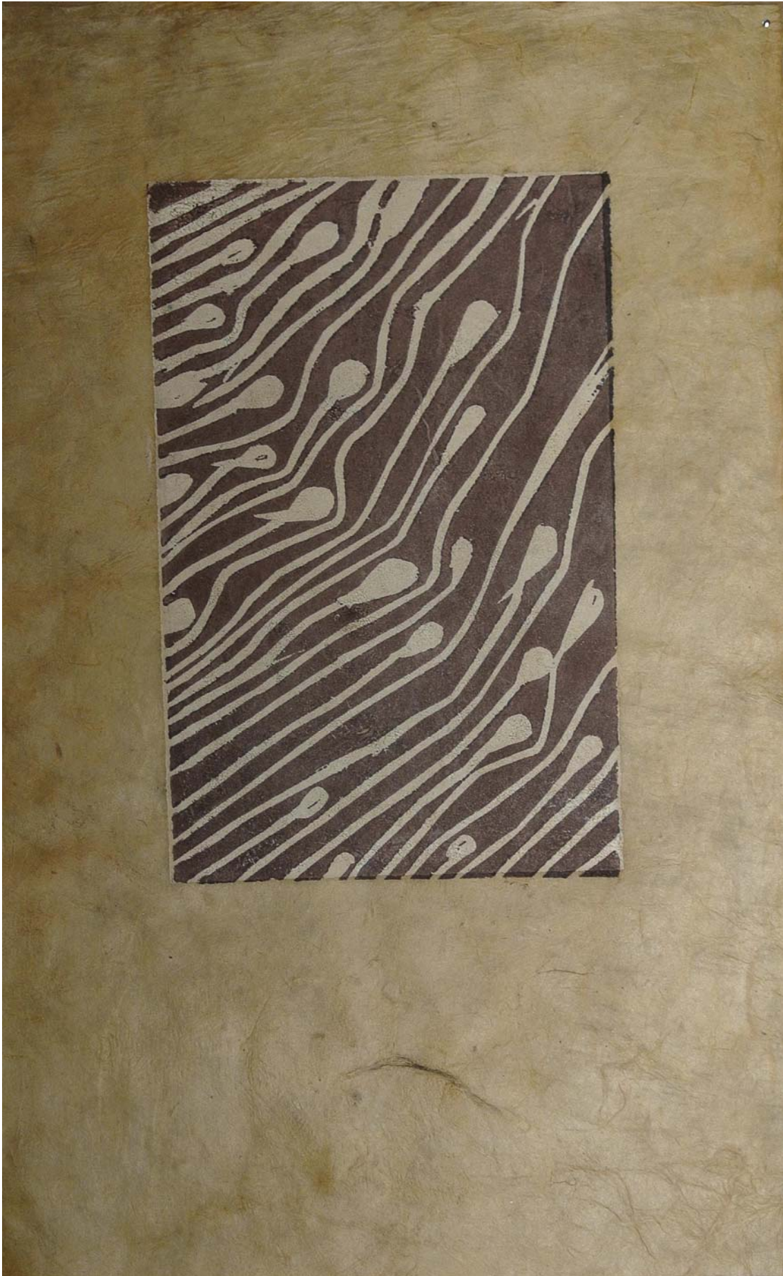
Figure 12: Window 12.