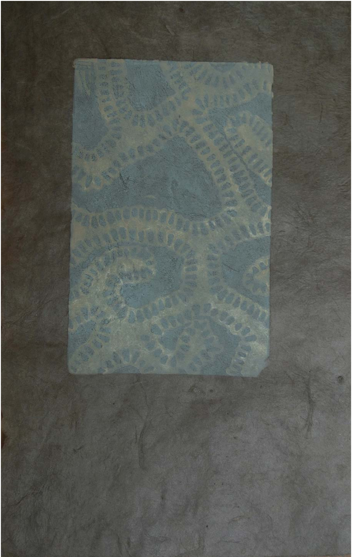
Figure 5: Window 5.