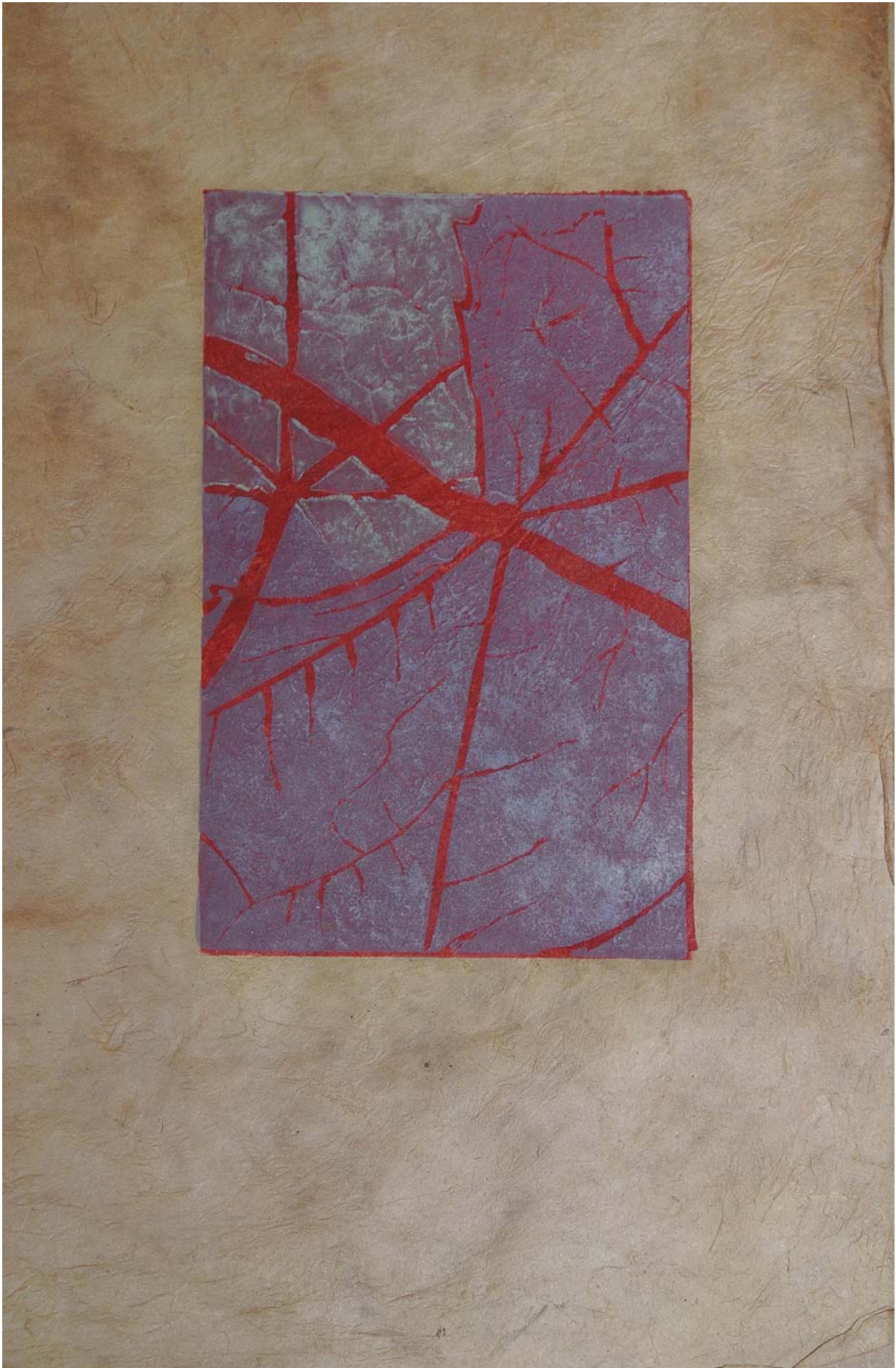
Figure 7: Window 7.