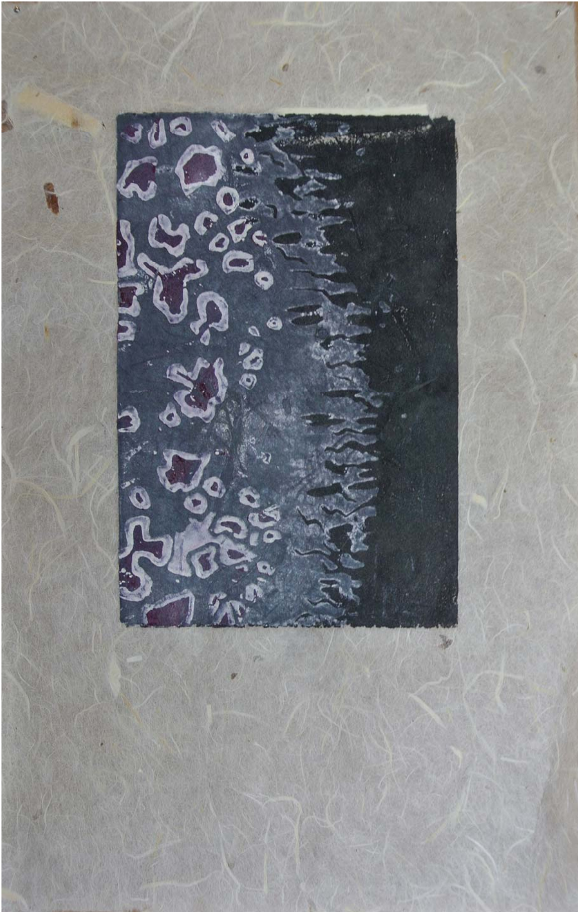
Figure 10: Window 10.