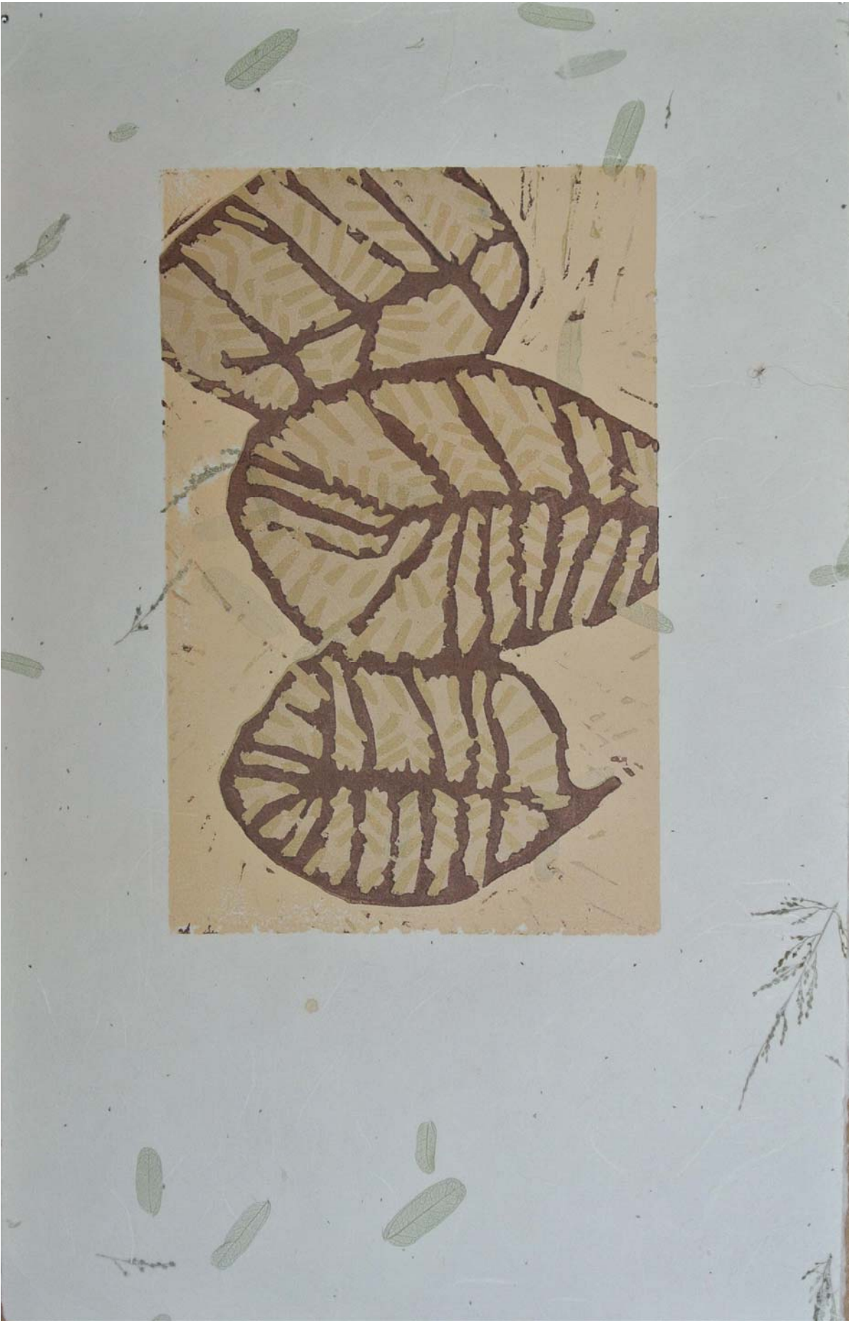
Figure 6: Window 6.