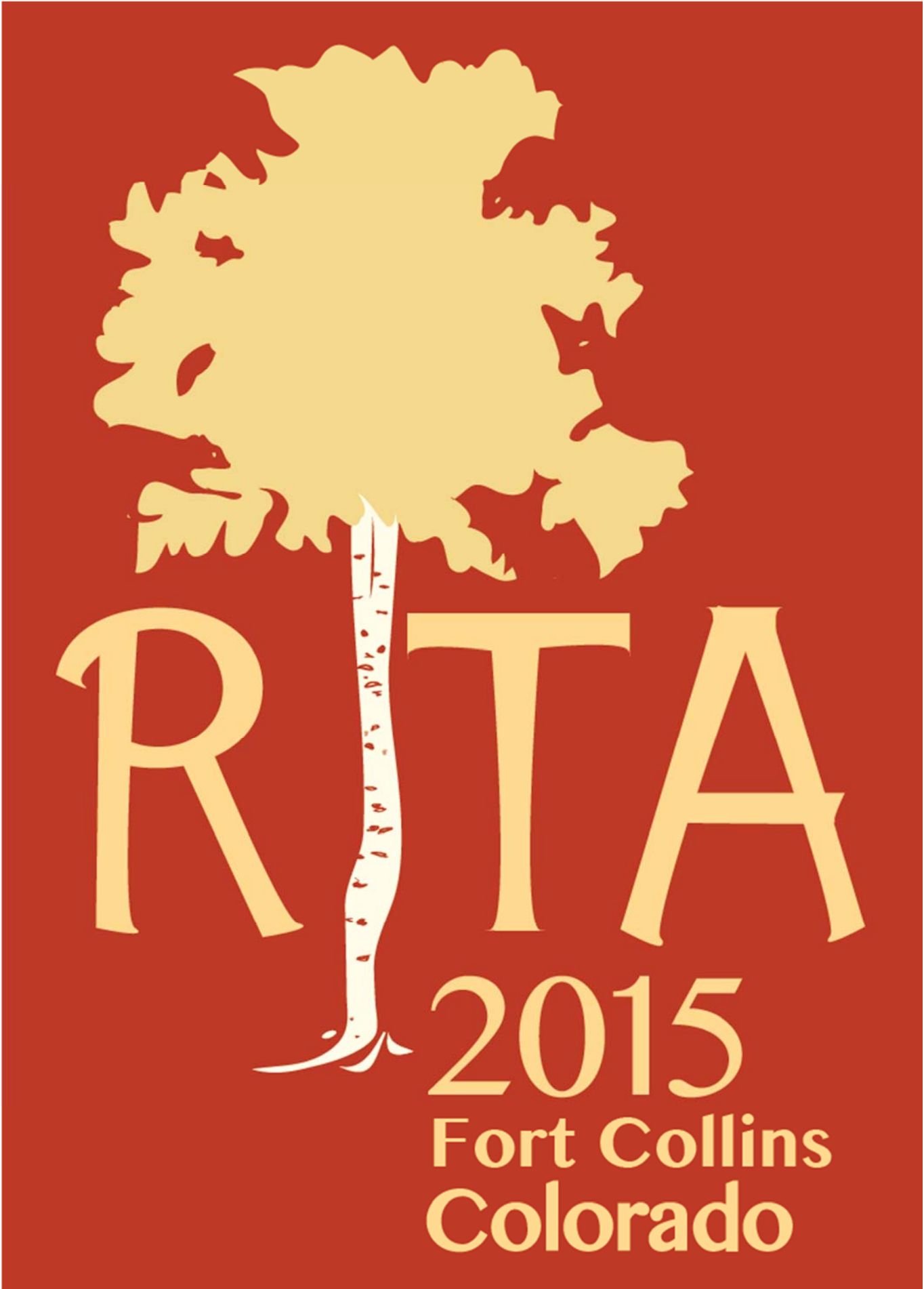
Figure 7: Rita Logo.