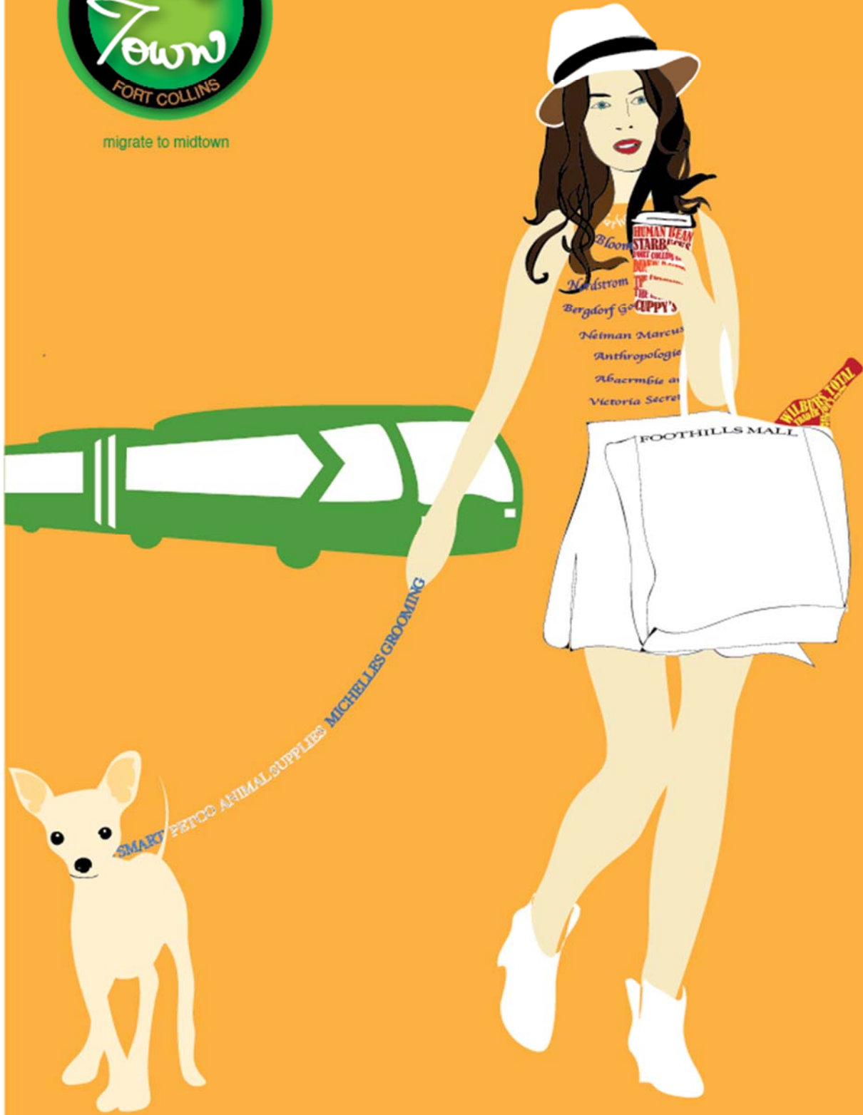
Figure 4: Midtown Poster #1.