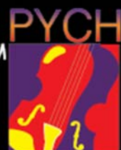
Figure 6: Off the Hook Poster.