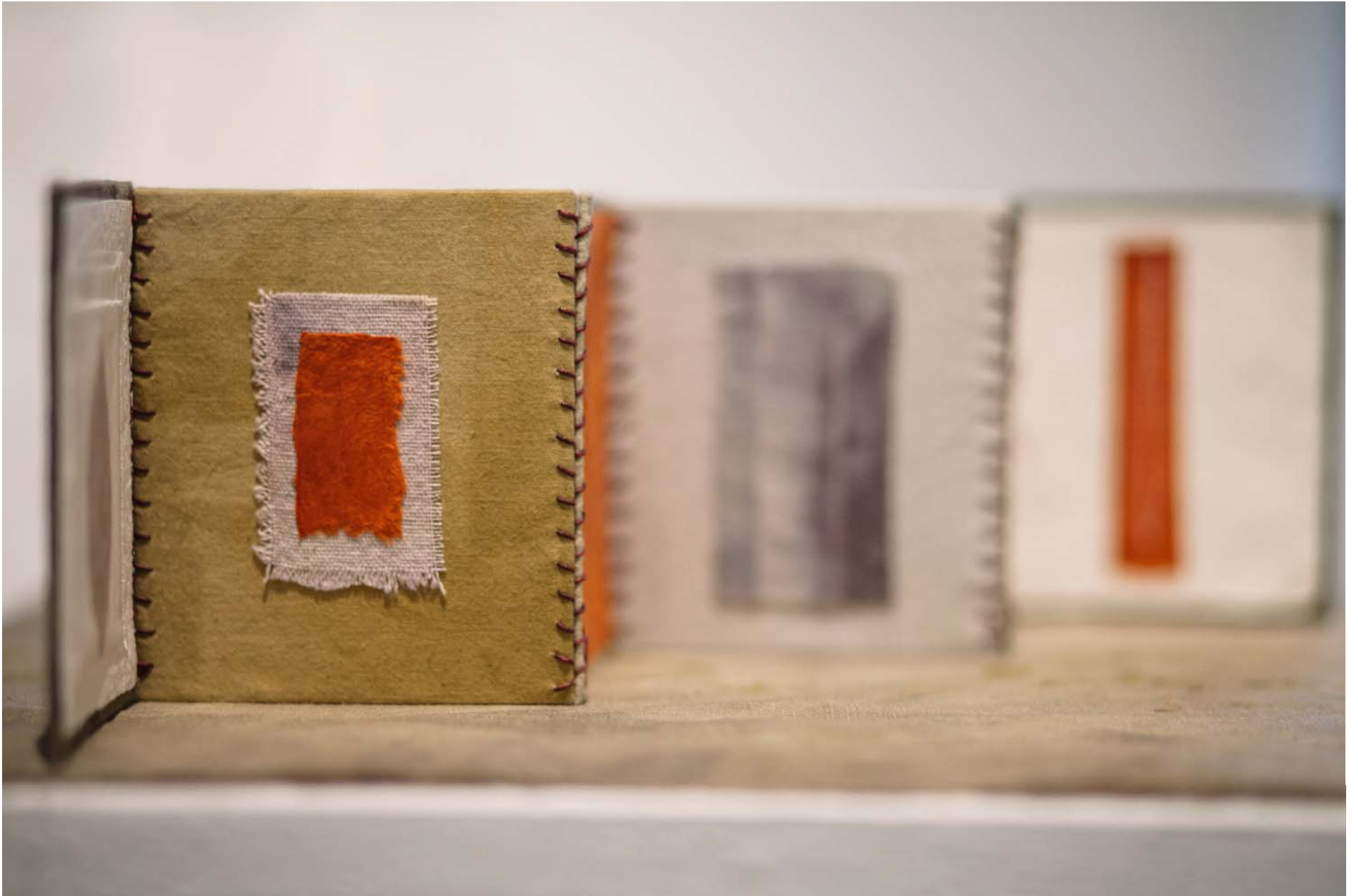
Figure 9: Soft Earth Memory Vessel, detail.