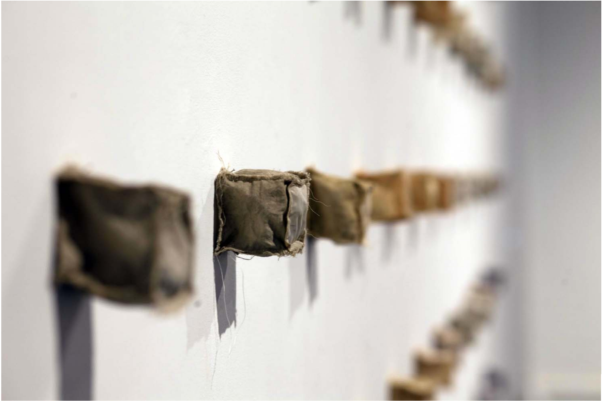
Figure 2: Sixty-Fives Times Softness Was Read as Frailty and Structure Was Seen as Strength, detail.