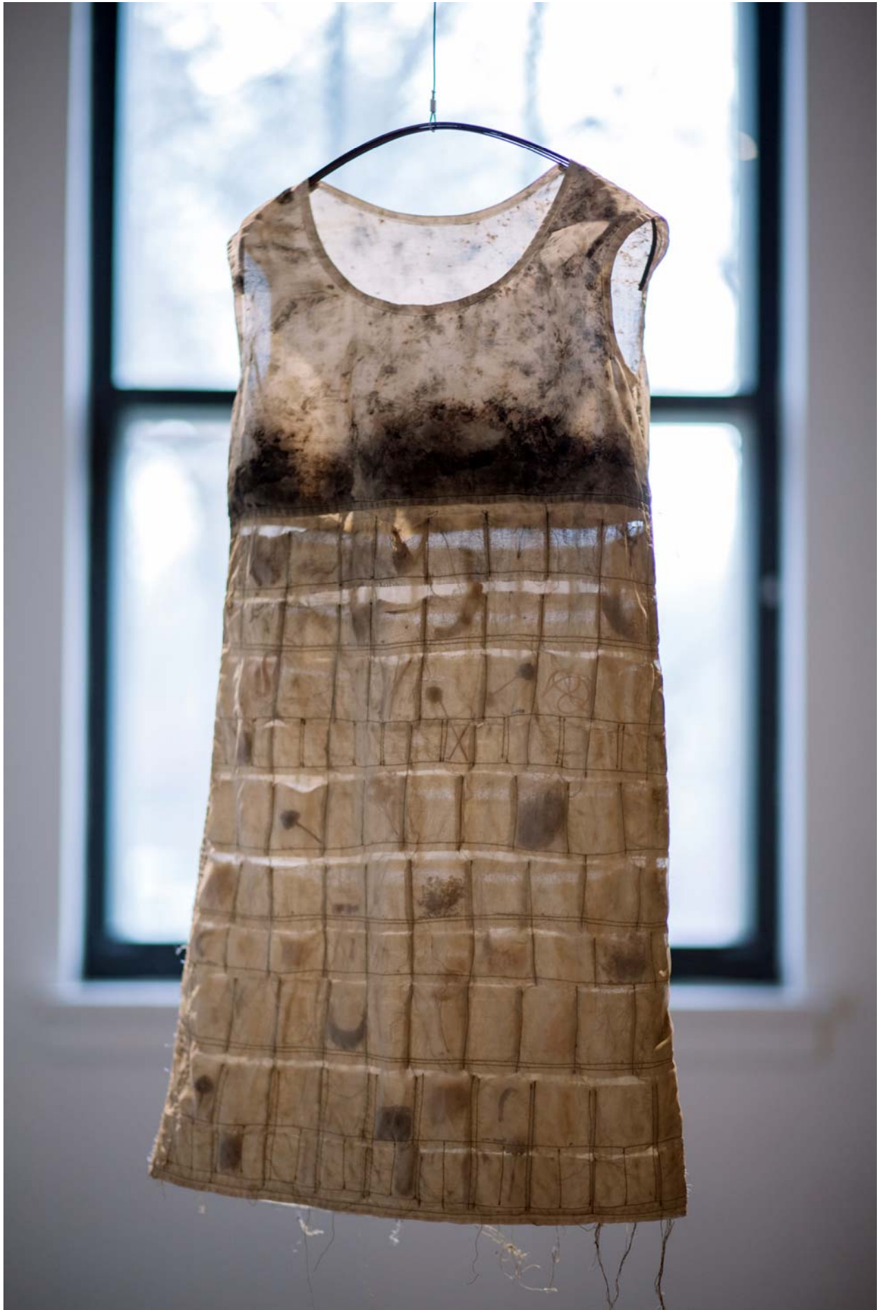
Figure 4: Letting Go of Holding On.