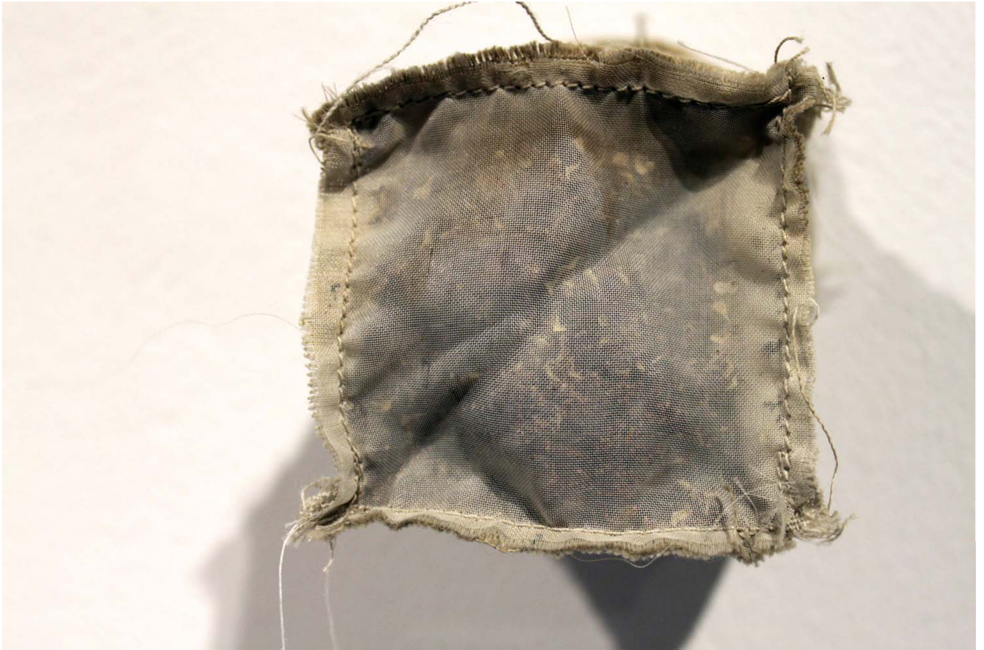
Figure 3: Sixty-Fives Times Softness Was Read as Frailty and Structure Was Seen as Strength, detail.