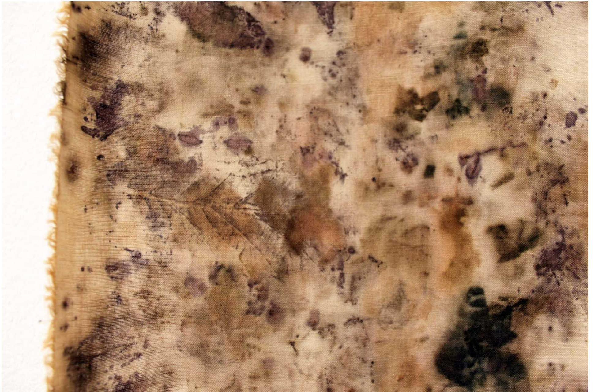
Figure 14: Eco-Print Scarf Series, Fall Scarf, detail.