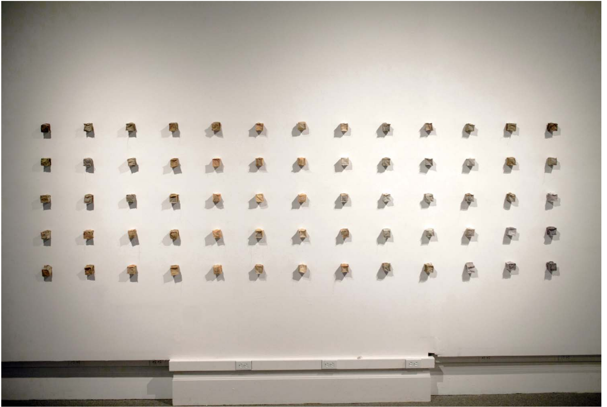
Figure 1: Sixty-Fives Times Softness Was Read as Frailty and Structure Was Seen as Strength.