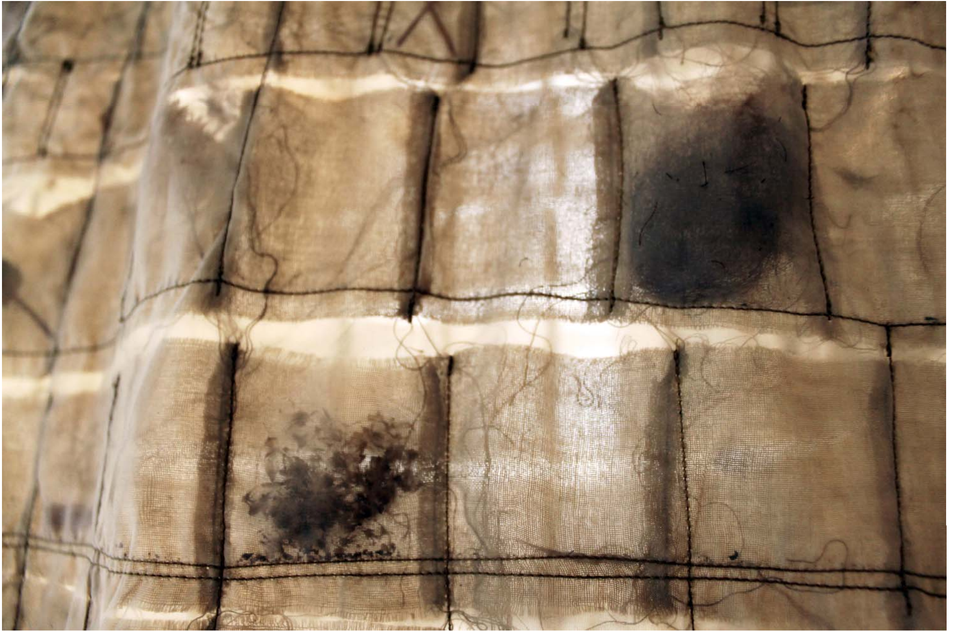
Figure 6: Letting Go of Holding On, detail.