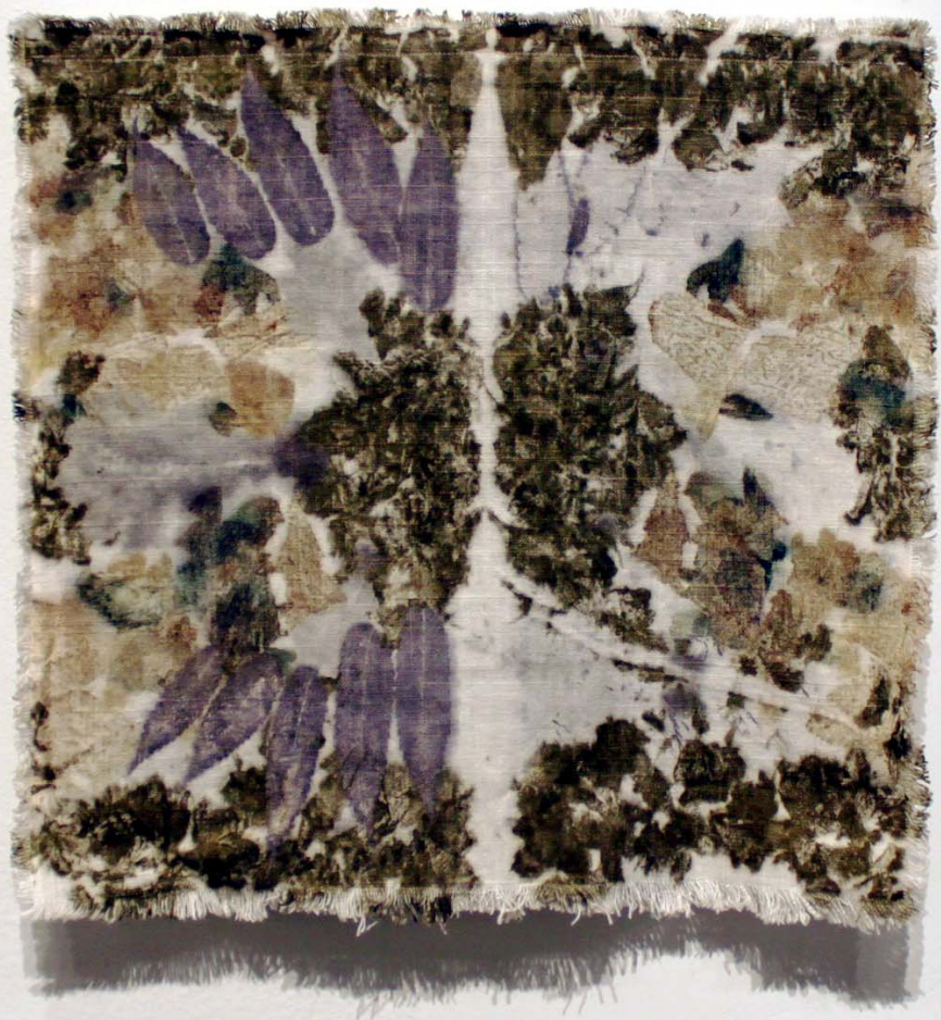
Figure 11: Vestige of A Fleeting Season: Retreat.