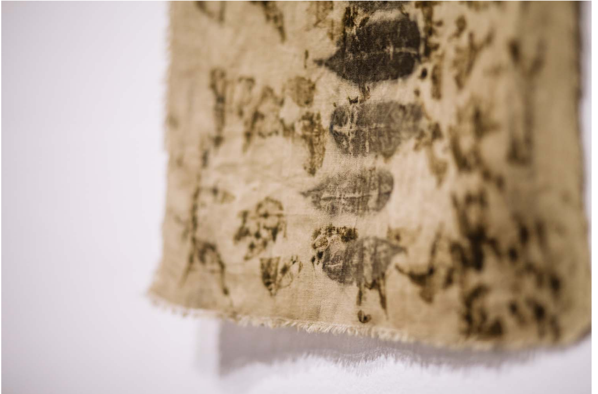
Figure 15: Eco-Print Scarf Series, Summer Scarf, detail.