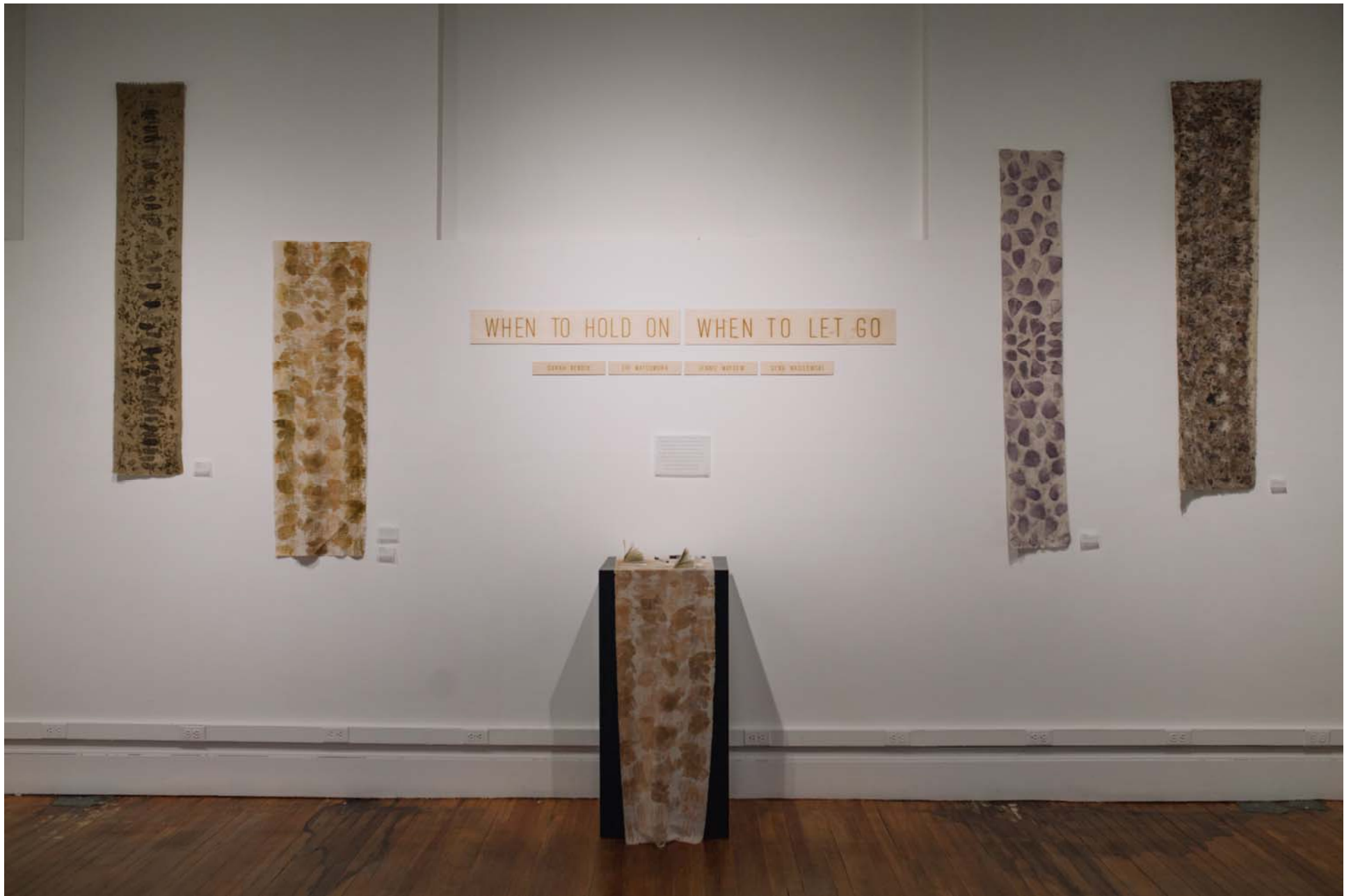
Figure 13: Eco-Print Scarf Series.