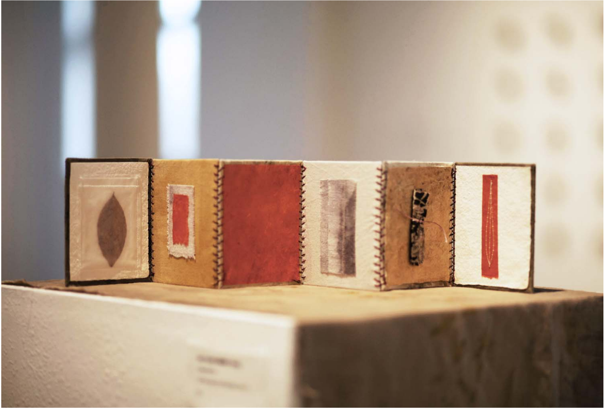
Figure 7: Soft Earth Memory Vessel.