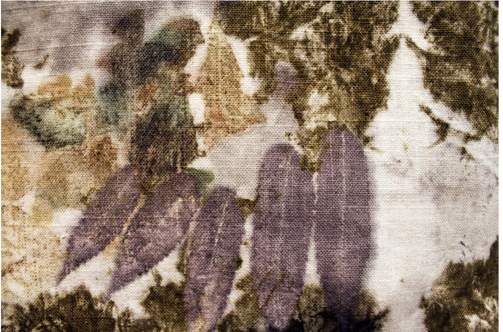
Figure 10: Vestige of A Fleeting Season: Retreat, detail.