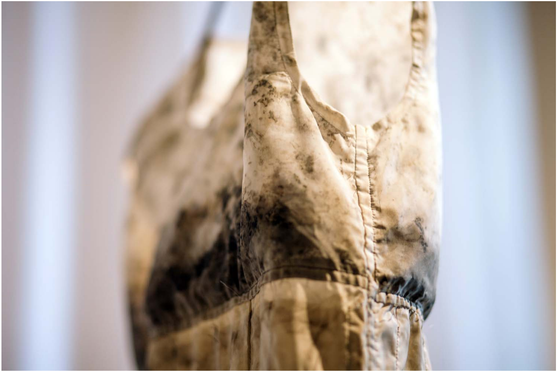
Figure 5: Letting Go of Holding On, detail.