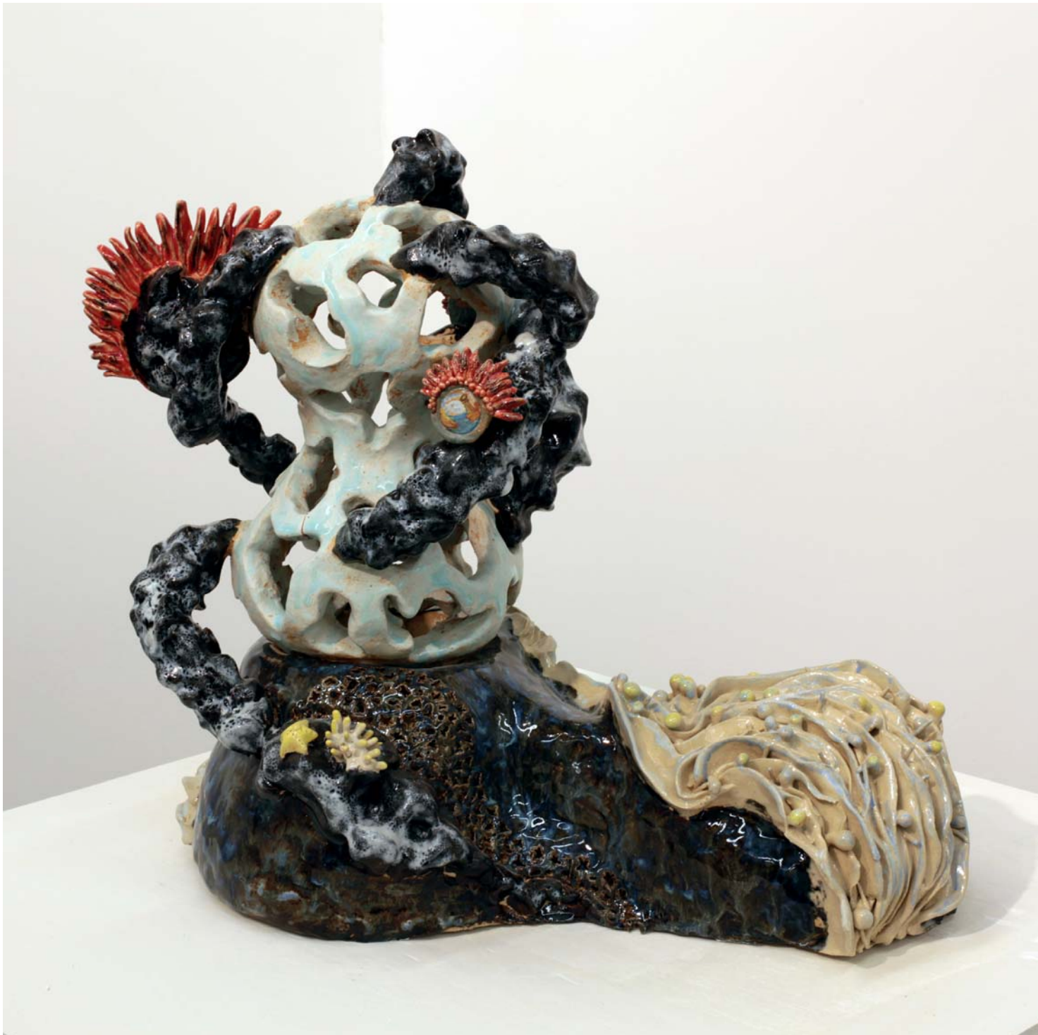
Figure 6: Pathways to a Coral Reefality, back view.