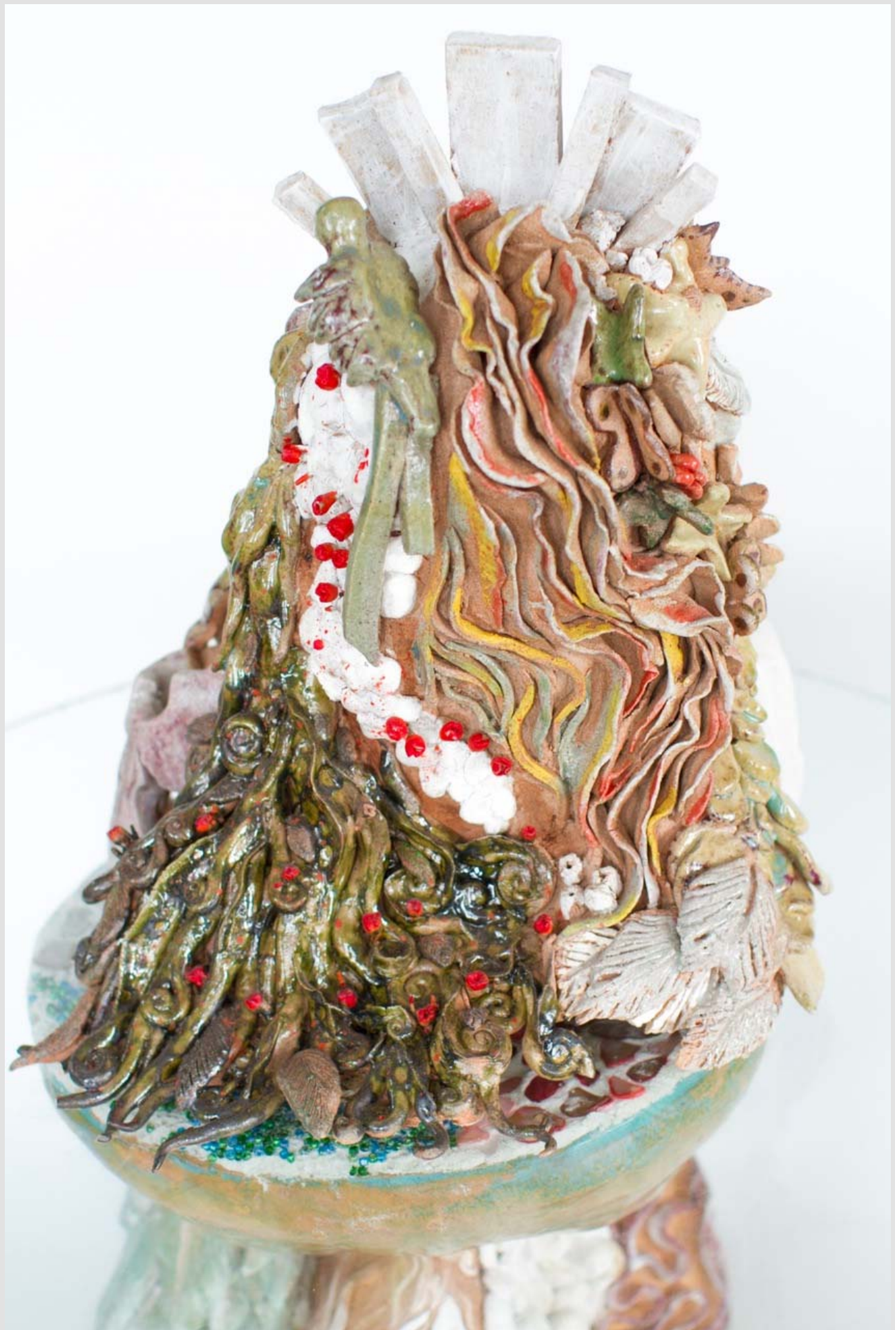
Figure 10: The Fifth Element, detail.