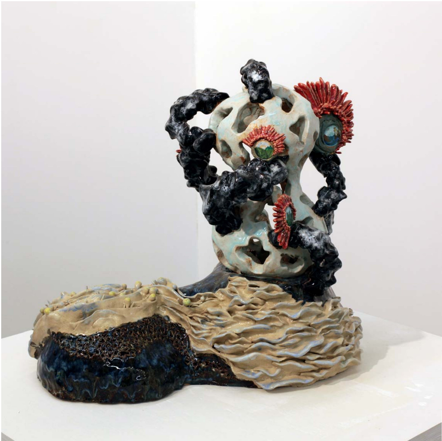
Figure 5: Pathways to a Coral Reefality, front view.