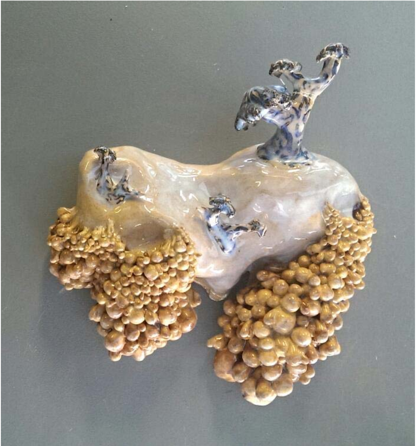
Figure 3: Mountainscape, detail.