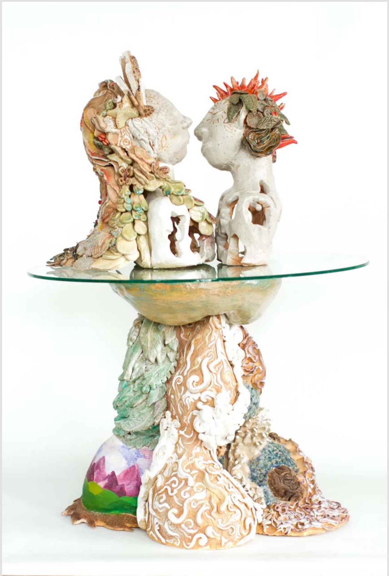
Figure 8: The Fifth Element.