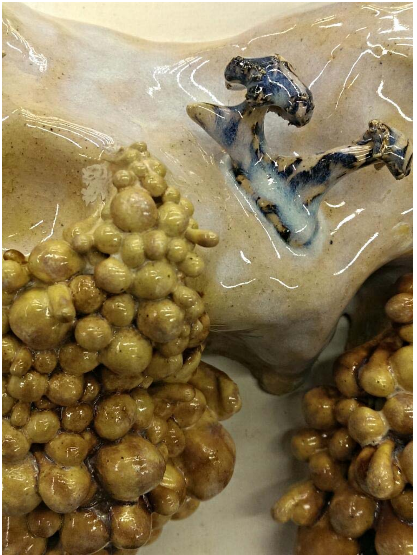
Figure 4: Mountainscape, detail.