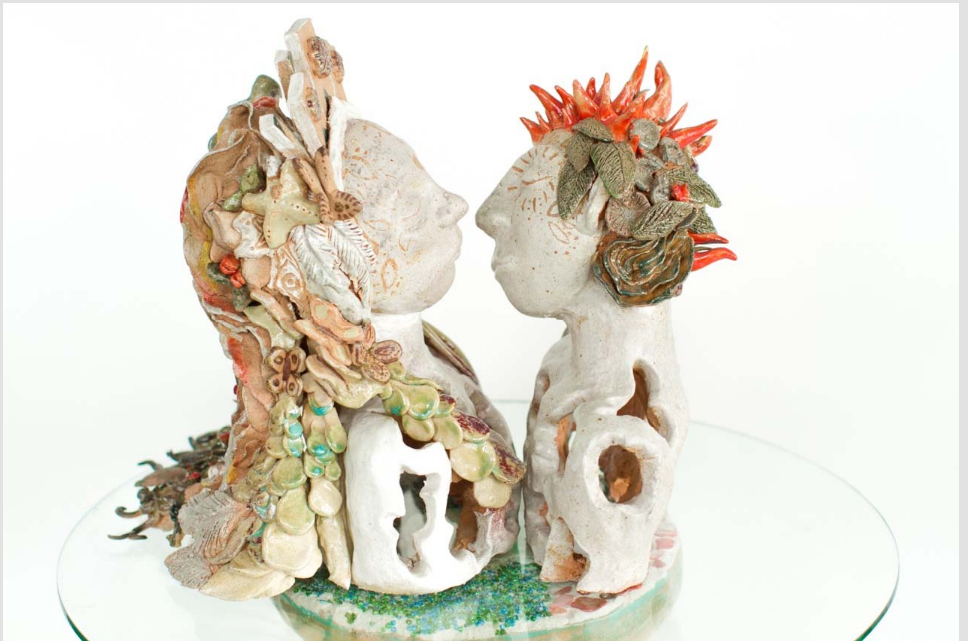
Figure 9: The Fifth Element, detail.