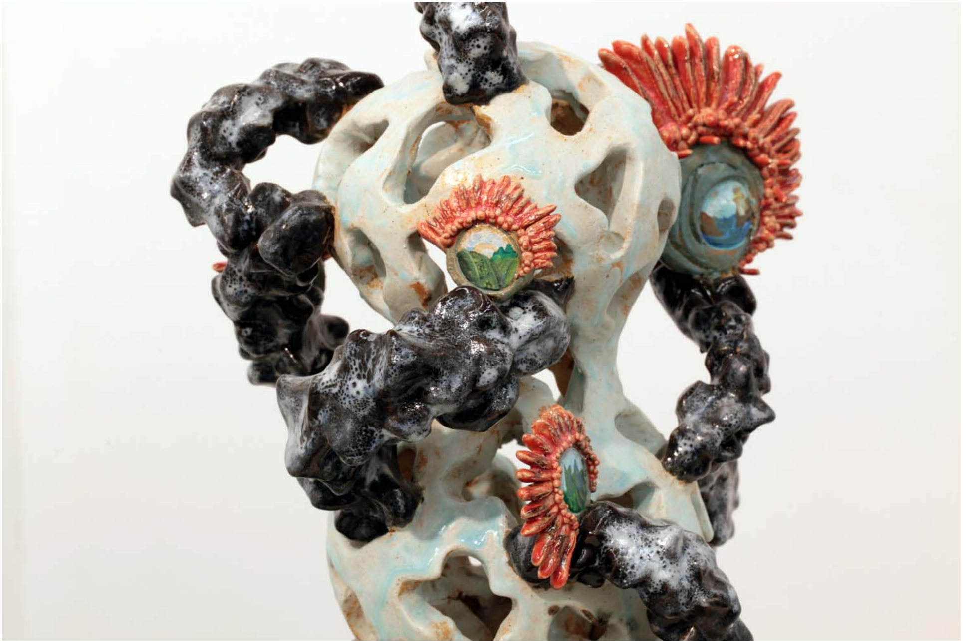
Figure 7: Pathways to a Coral Reef, detail.