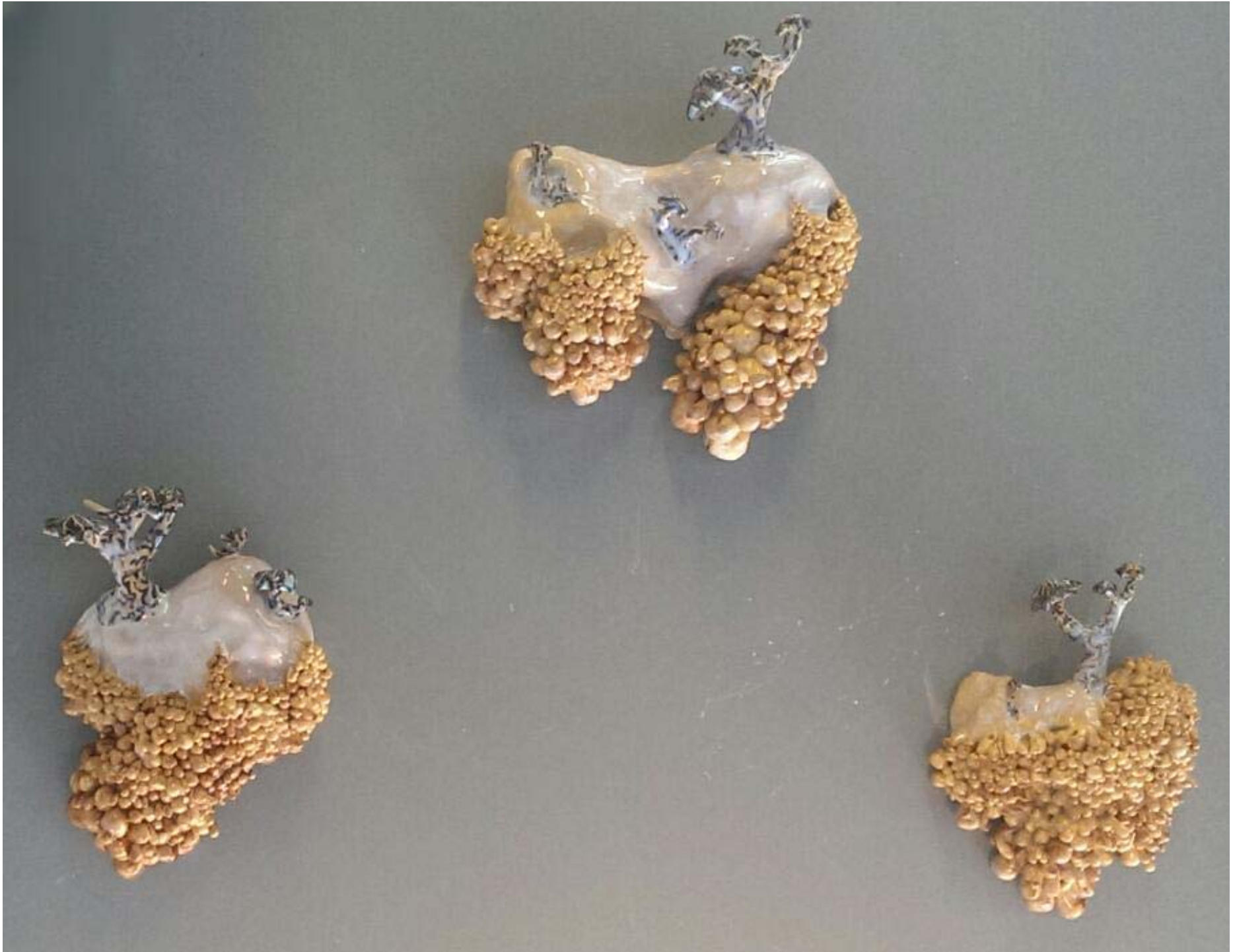
Figure 1: Mountainscape.