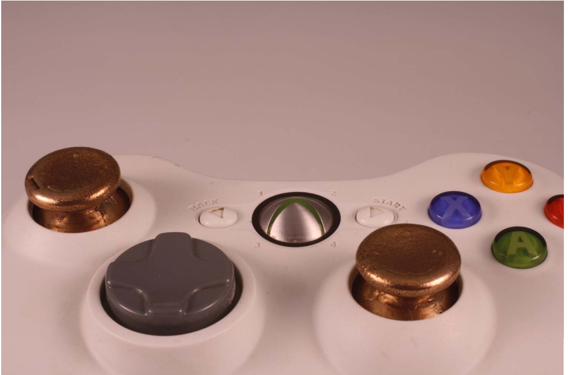
Figure 8: Brass Thumb Sticks - Detail.