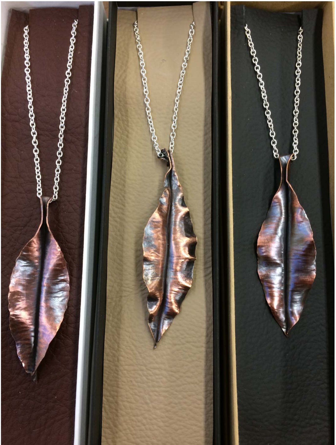
Figure 12: Copper Leaf Collection.