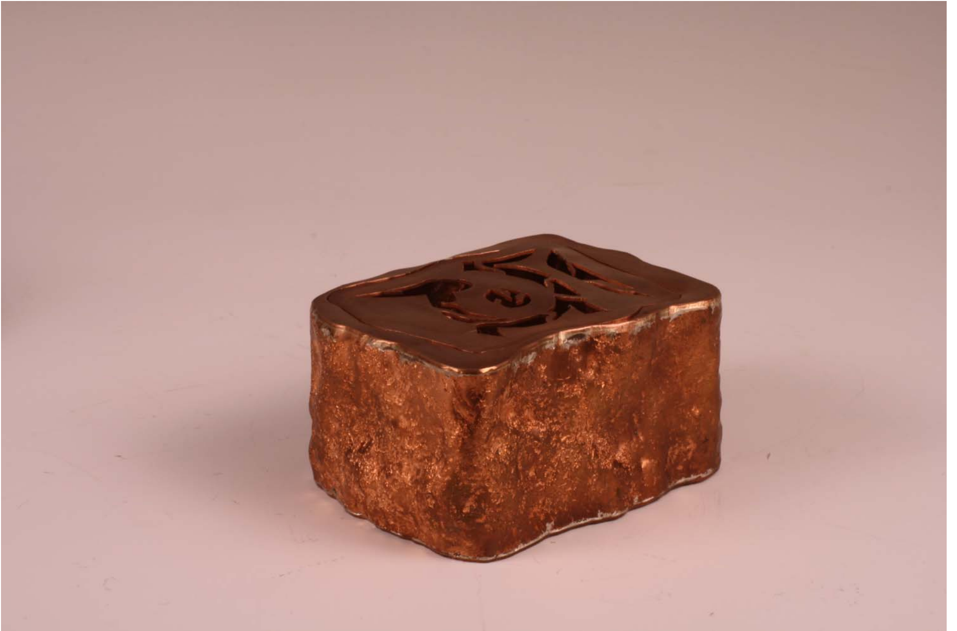
Figure 1: Rock Box.