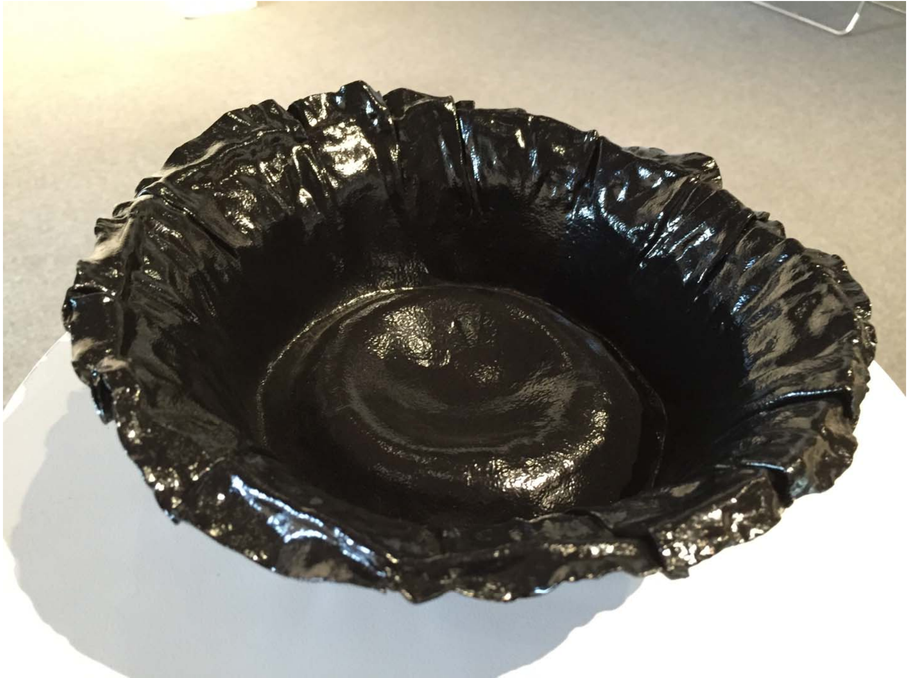
Figure 23: Distrot Bowl.