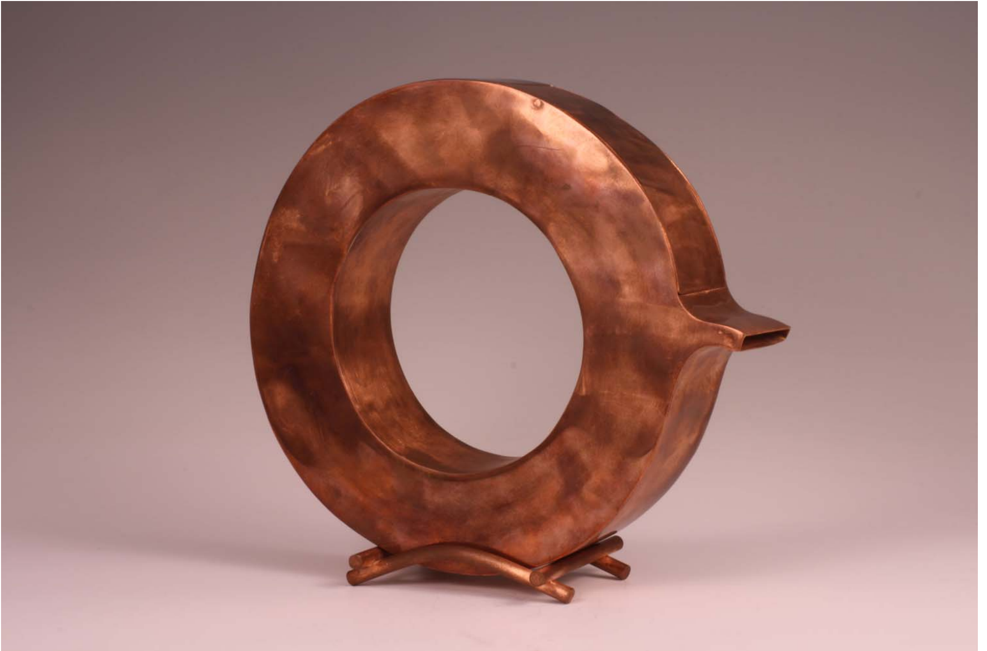
Figure 4: Copper Teapot.