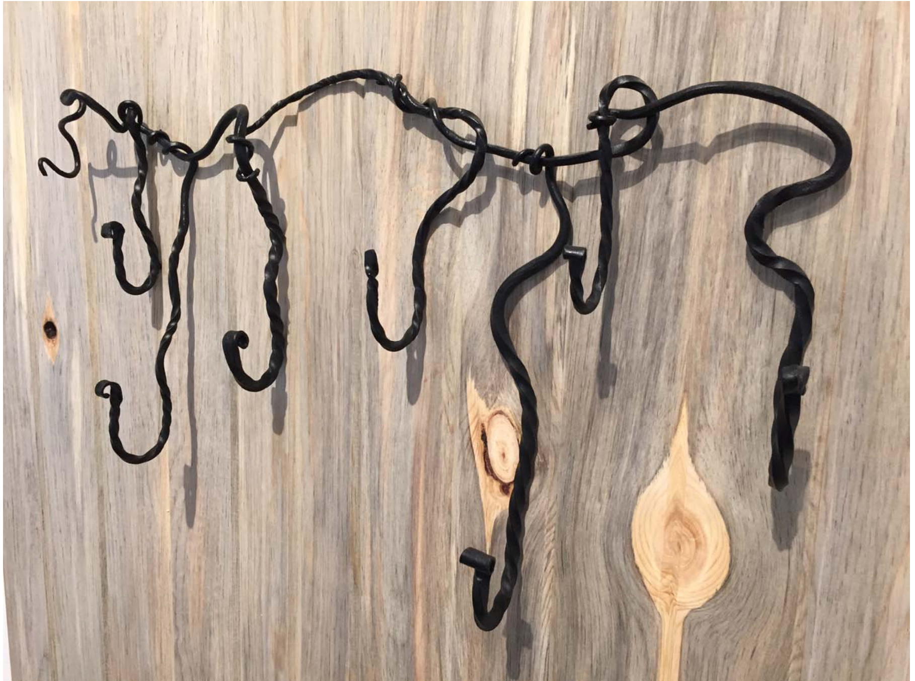
Figure 16: Forged Vine Hooks-detail.