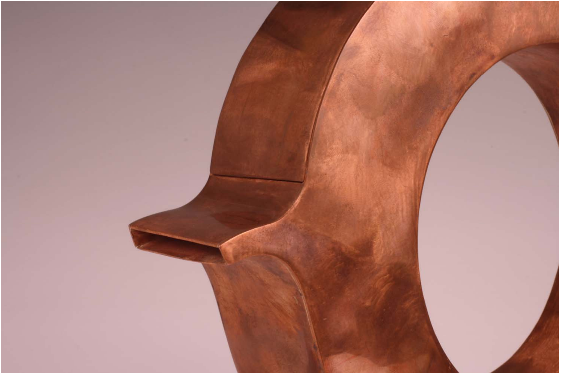
Figure 6: Copper Teapot - Detail 2.