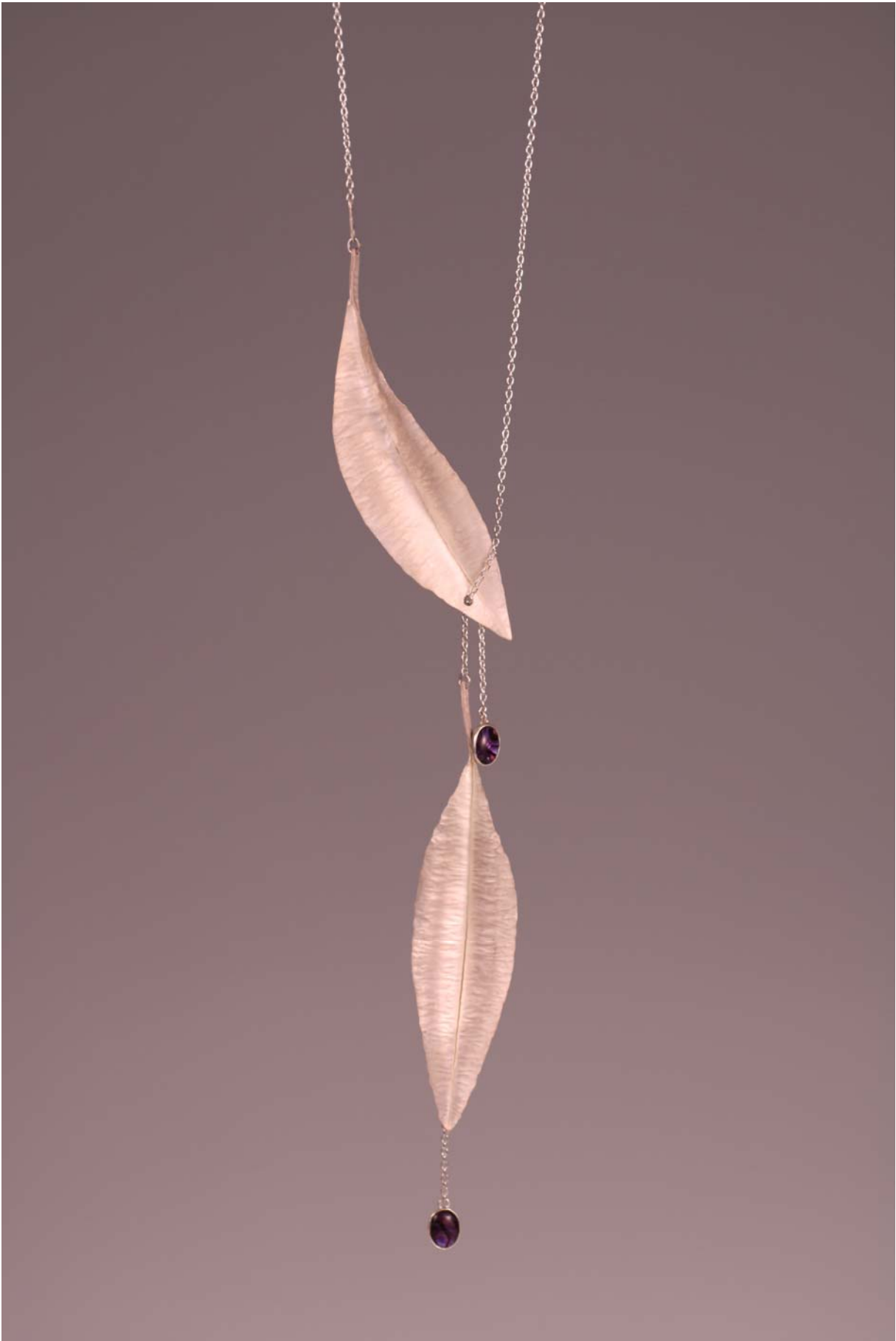
Figure 11: Snowy Leaves.