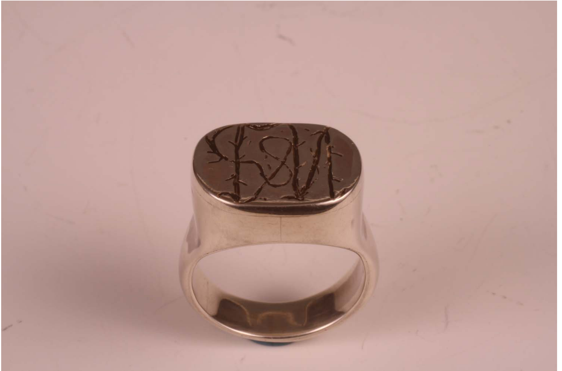
Figure 13: Wedding Invitation Signet Ring.