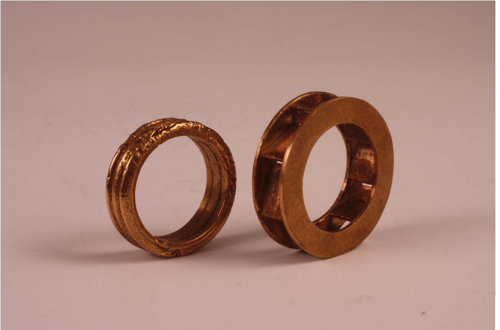
Figure 9: Casted rings.