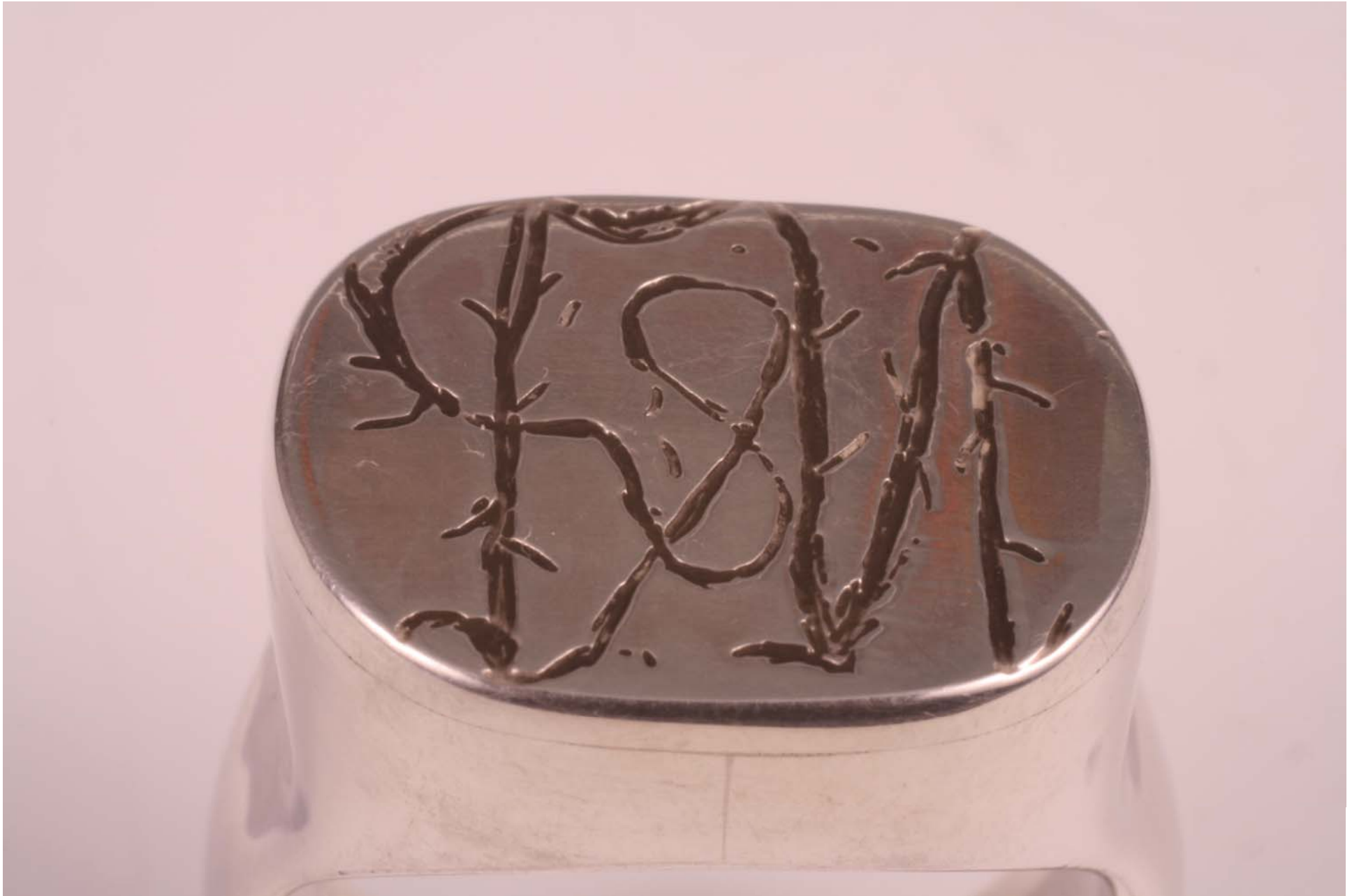
Figure 14: Wedding Invitation Signet Ring-detail.