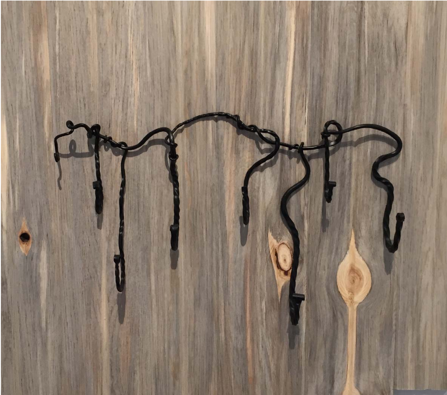
Figure 15: Forged Vine Hooks.