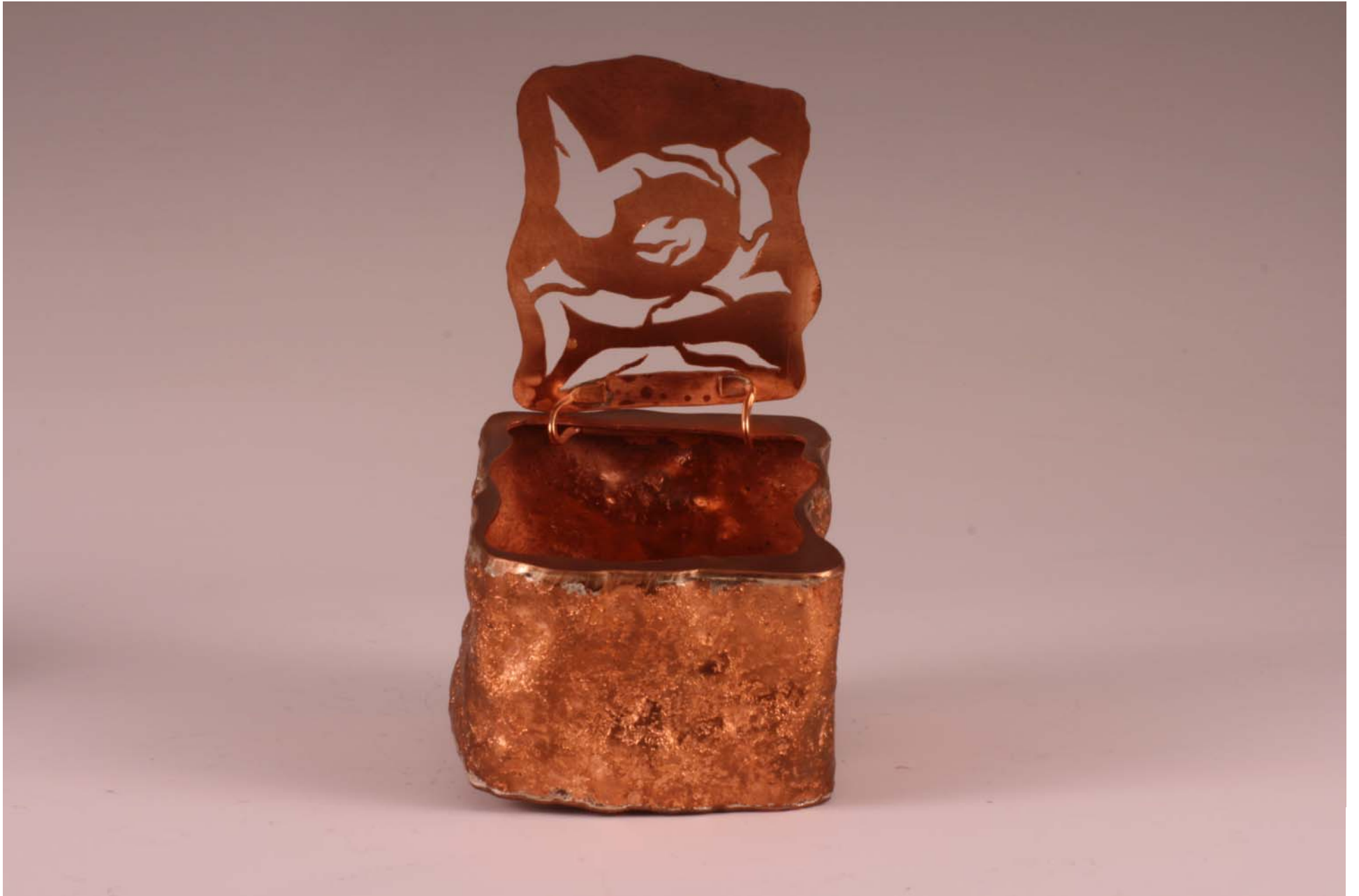
Figure 2: Rock Box-detail.