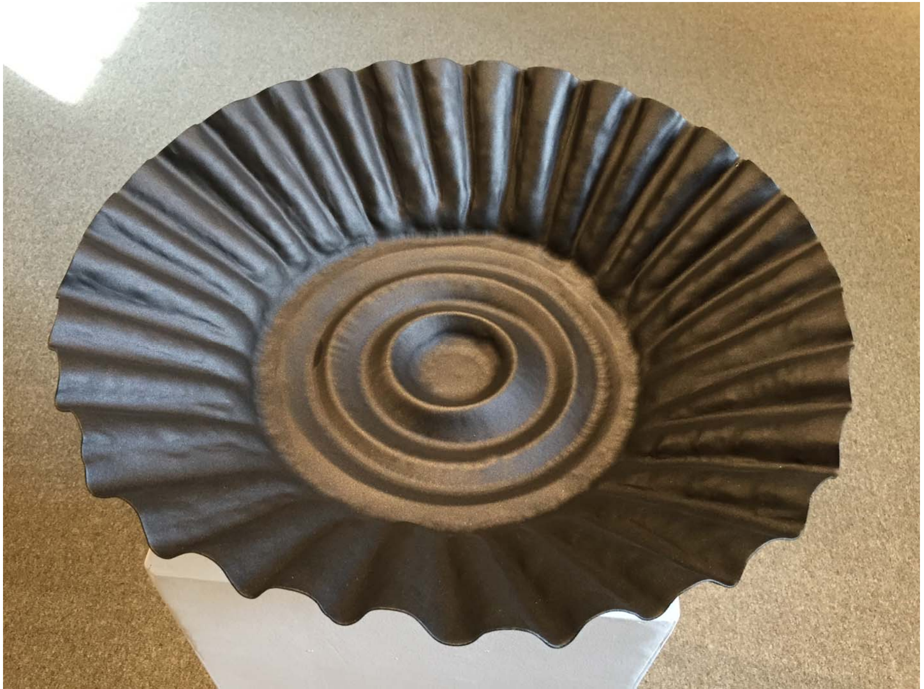
Figure 21: Water Drop.