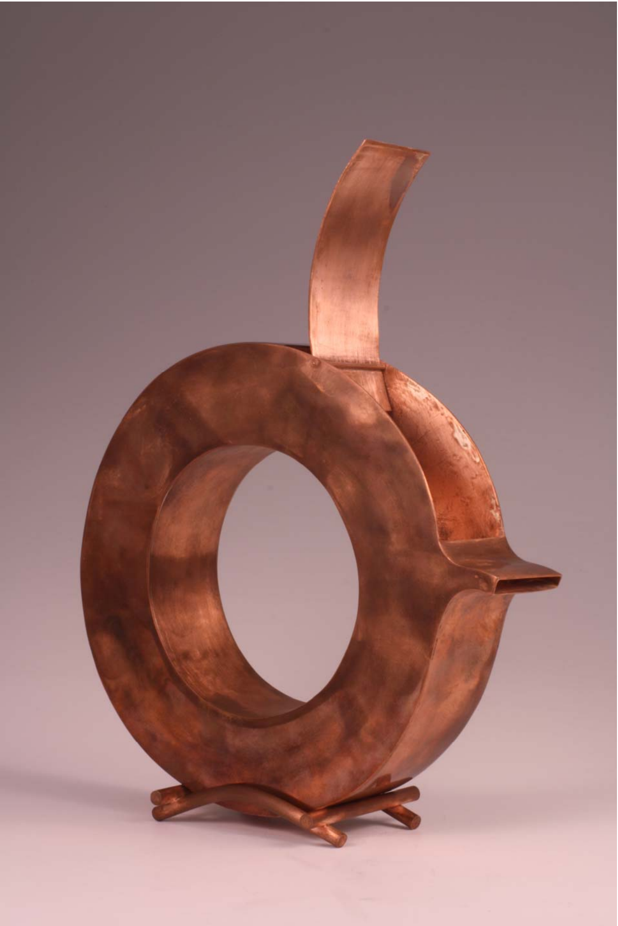
Figure 5: Copper Teapot - Detail.