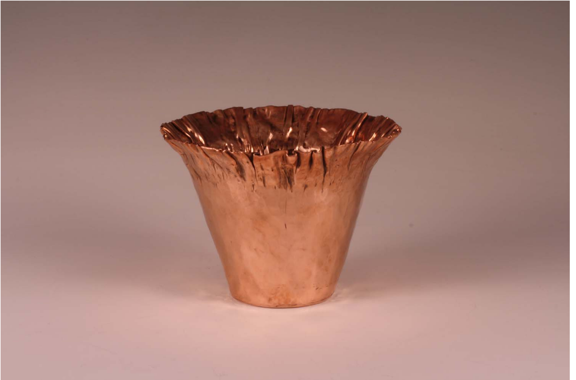
Figure 17: Stress Relief.