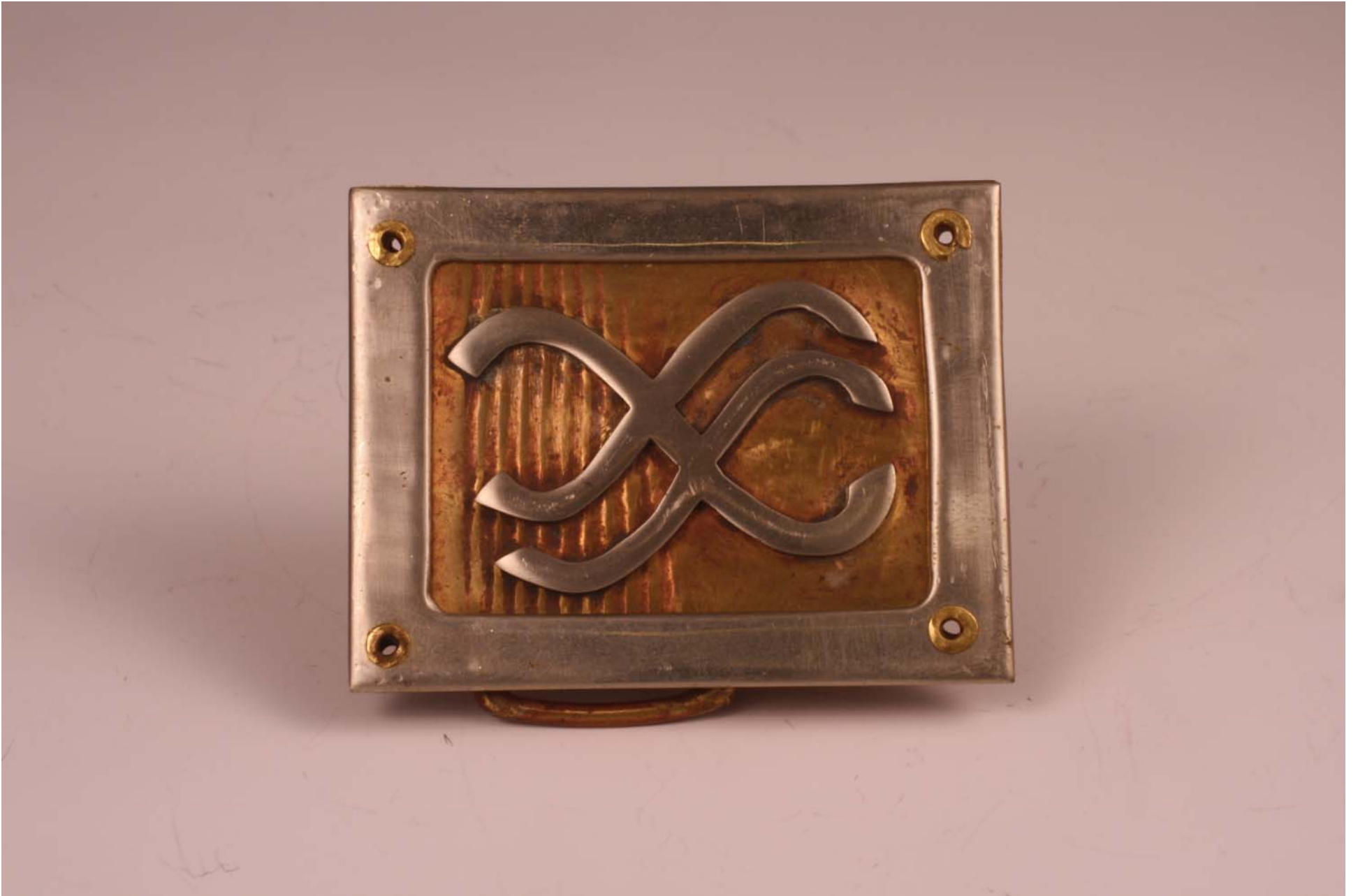
Figure 3: Rustic Country Buckle.