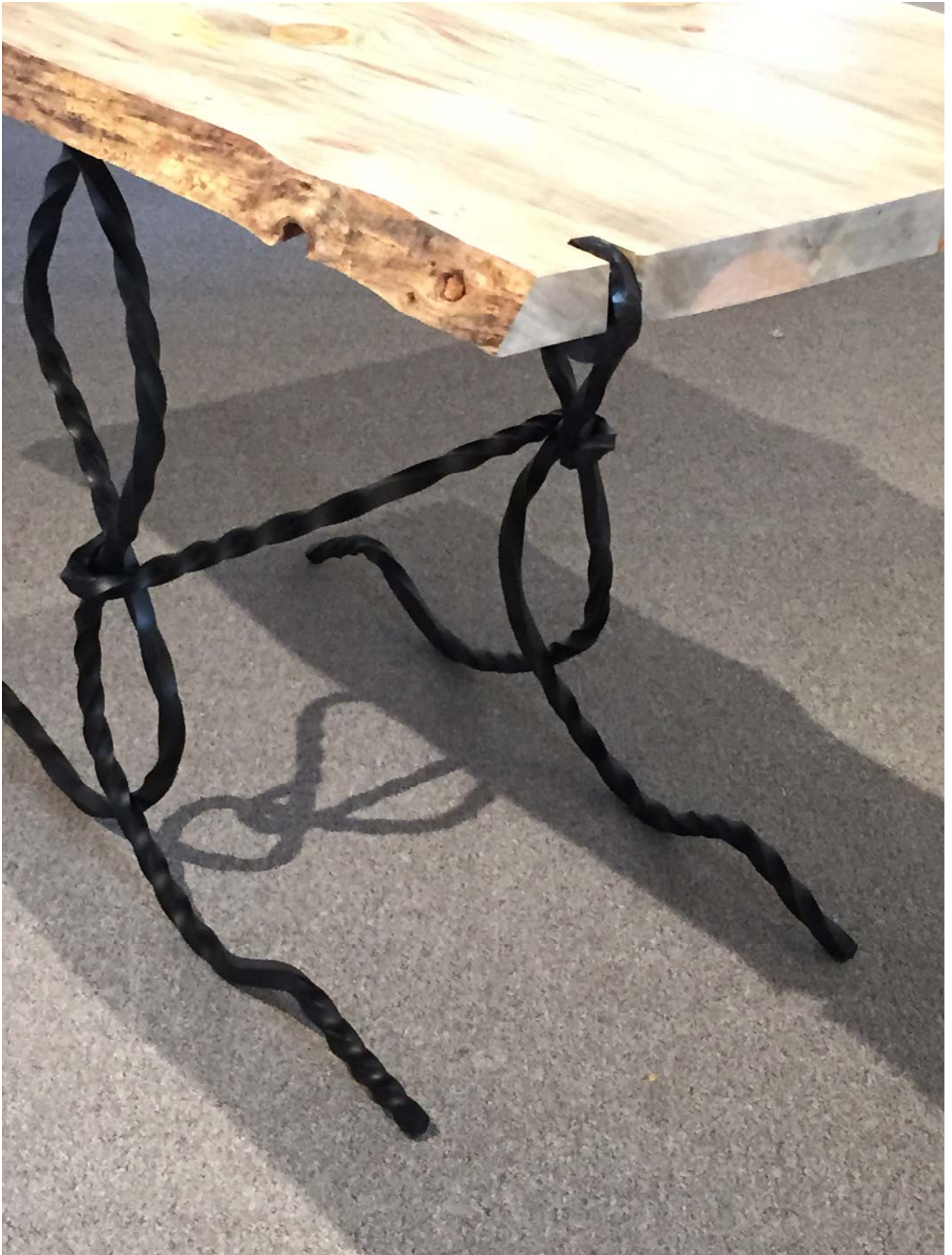
Figure 20: Forbidden Blue - Detail.