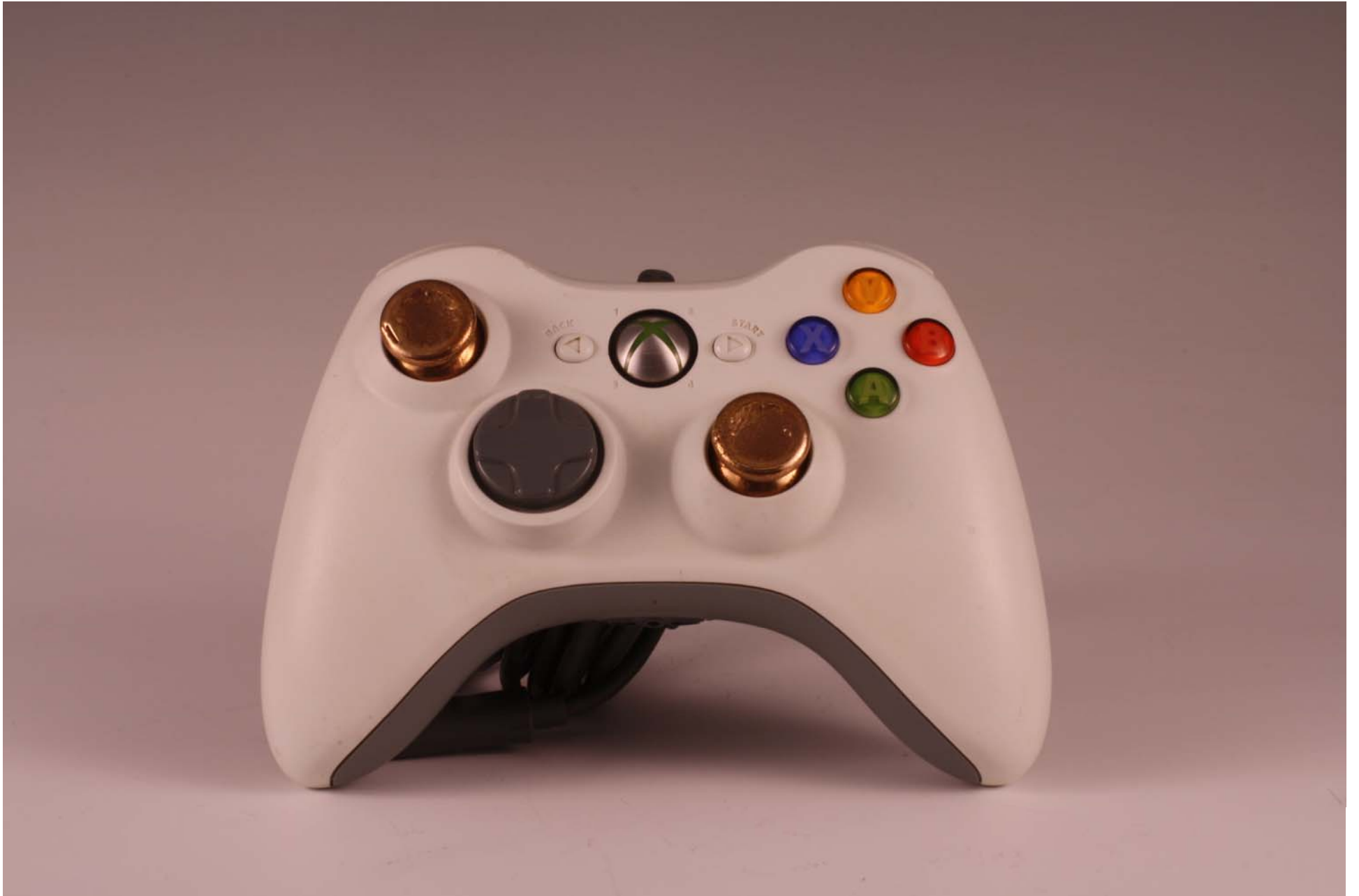
Figure 7: Brass Thumb Sticks.