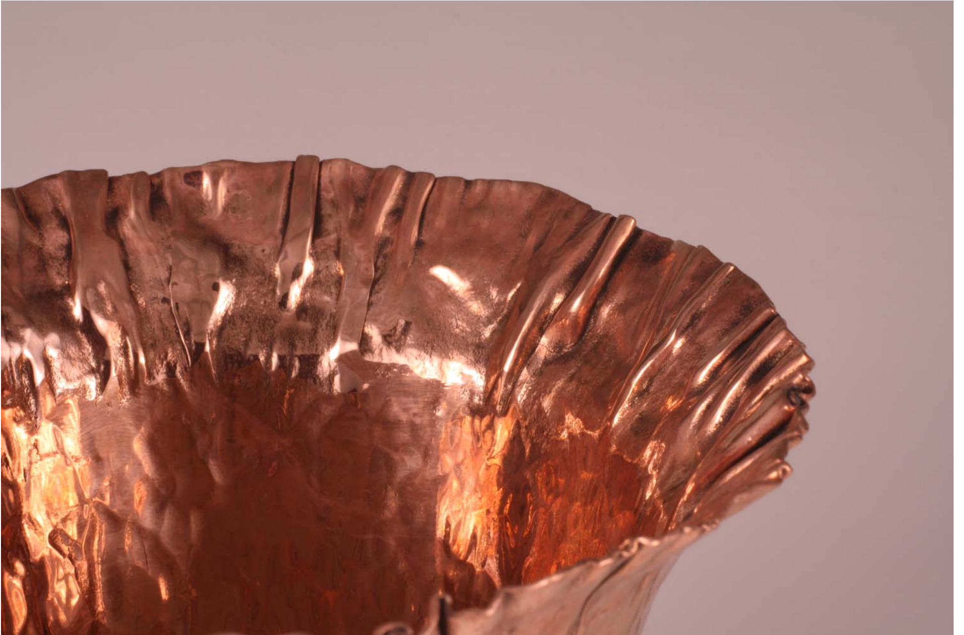
Figure 18: Stress Relief-detail.