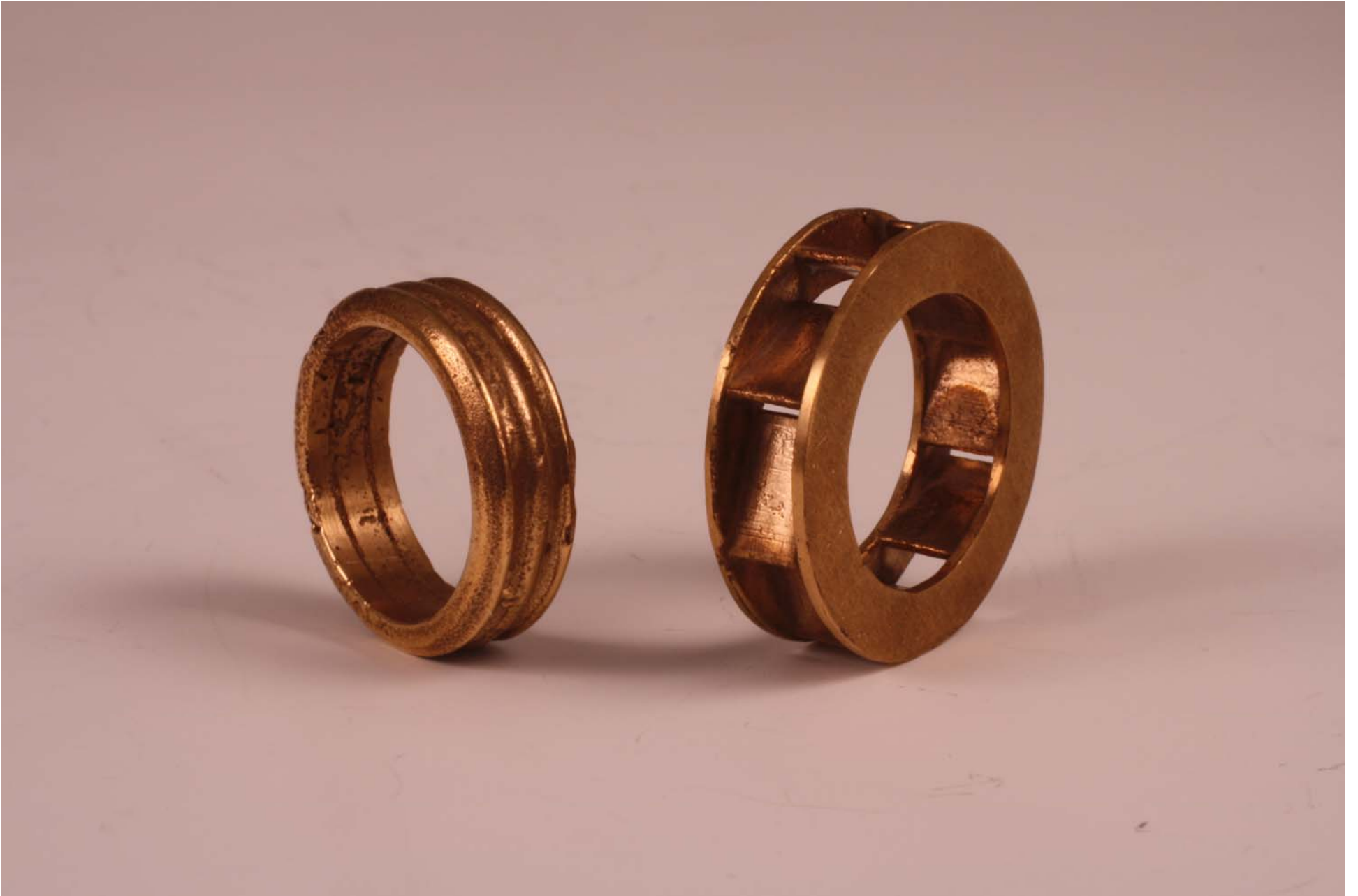
Figure 10: Casted rings - Detail.