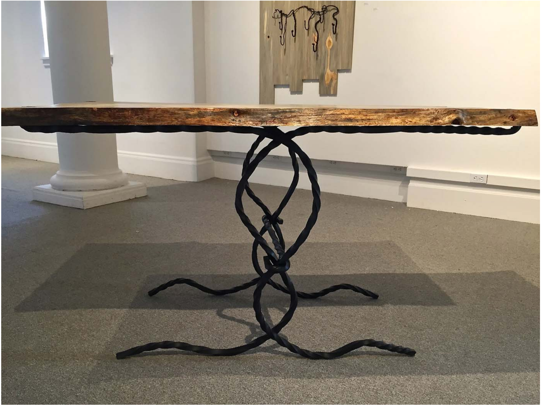
Figure 19: Forbidden Blue.