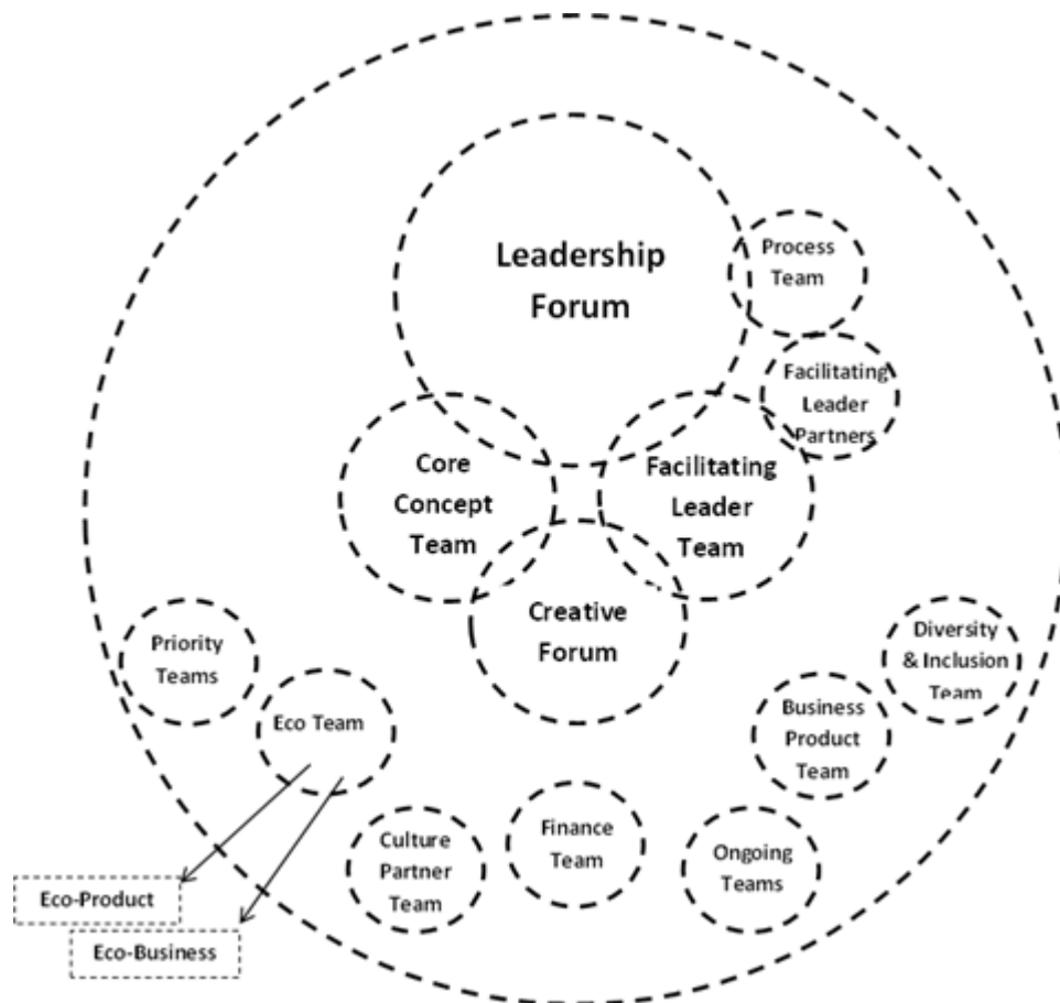
Figure 2. Eco-Team as a Part of the Cross Functional Leadership System

We don’t dictate from the top down. Rather, we look for critical mass around issues and move into them that way. That is how our cross-functional teams support business initiatives and also engage people around issues that interest them. (Joy)