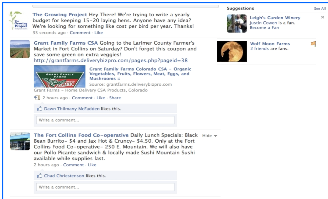
Figure 1: Screenshot of a Facebook Newsfeed

The screen shot included in Figure 1 shows a typical newsfeed from Facebook where the user can read direct news from The Growing Project, Grant Family Farms, and the Fort Collins Food Co-operative, and see that friends have become fans of Leigh’s Garden Winery and Wolf Moon Farms. These newsfeeds allow friends and customers to directly and indirectly share what is going on in their lives, the businesses they are supporting, and the events they attend—all without any pressured marketing tactics that might be unwelcome in their network.