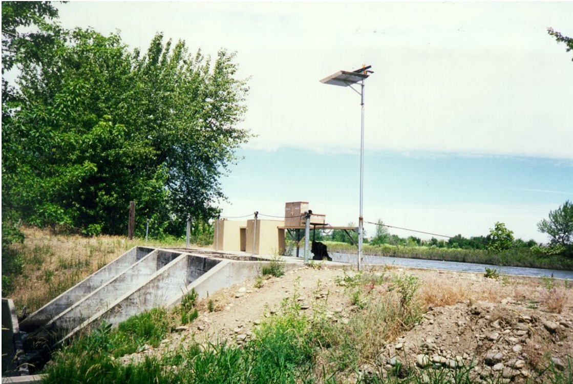
Figure 6. Seven Mile Slough Headworks Structure

The following year, the NDC and other water users on the Seven Mile Slough tackled the problem of excess tailwater at the downstream end of the Slough. Before the 1999 season, the NDC automated two of the three radial gates on the control structure at the head of the Slough (Figure 6). A 30-ft wide ramp flume was constructed in the channel below the control structure to assure accurate flow measurement (Figure 7). The NDC also took steps to regulate inflows to the Slough from the Government Drain. A Langemann overshoot gate was installed at the Barrels site to control water levels in the Drain and regulate diversions into the Slough. Another ramp flume was constructed to measure these diverted flows. The overshoot design of the control gate permits measurement of the remaining drain flows. Additionally, a second Langemann gate was installed at the last diversion on the Slough to automatically control upstream water levels and to measure flows passing back to the river (Figure 8). Cell phone telemetry permitted the NDC and the watermaster to accurately measure and control the flows in the Slough.