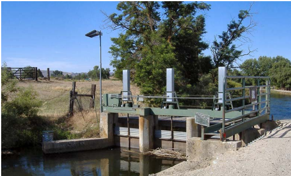
Figure 2. Farmers Cooperative Automated "Squeeze Gate" Structure

The hand cranks on each of the three gate operators were replaced with a 30:1 chain drive and connected to a 1/10-horsepower 12-volt DC gearmotor. Power for the motors was supplied by a 30-watt solar panel and 2 deep-cycle batteries. Water level sensors were placed in the canal upstream and downstream of the structure. The system was controlled by a Campbell Scientific CR10 data logger. The data logger was connected via modem to an existing telephone line that was buried beside the canal. The site was programmed to maintain a desired downstream water level which was correlated with the canal's gauging station another half-mile downstream of the control structure. The controller was accessed either on-site or by telephone using a laptop or desktop computer and Campbell Scientific's PC208 software. Installation took approximately five days. Figure 2 shows the Squeeze Gate structure following SCADA installation.