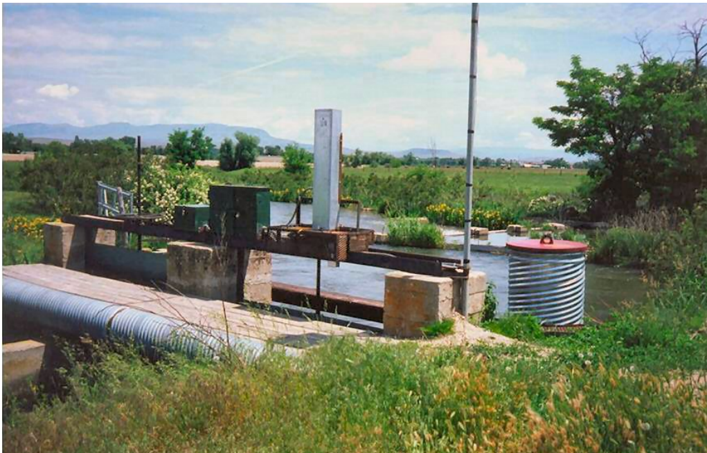
Figure 5. Noble Ditch headworks structure

To improve the measurement accuracy on their main canal, the NDC constructed a ramp flume at the head of the Noble Ditch in 1997. Following the 1997 irrigation season, the NDC worked to automate the Noble Ditch headworks, using similar technology as the Farmers Cooperative. Utilizing financial and technical assistance from Reclamation's Snake River and Provo Area Offices, NDC automated one of the two slide gates at the head of the ditch (Figure 5). The site was solar powered and had cell phone telemetry. Flows were measured at the downstream ramp flume.