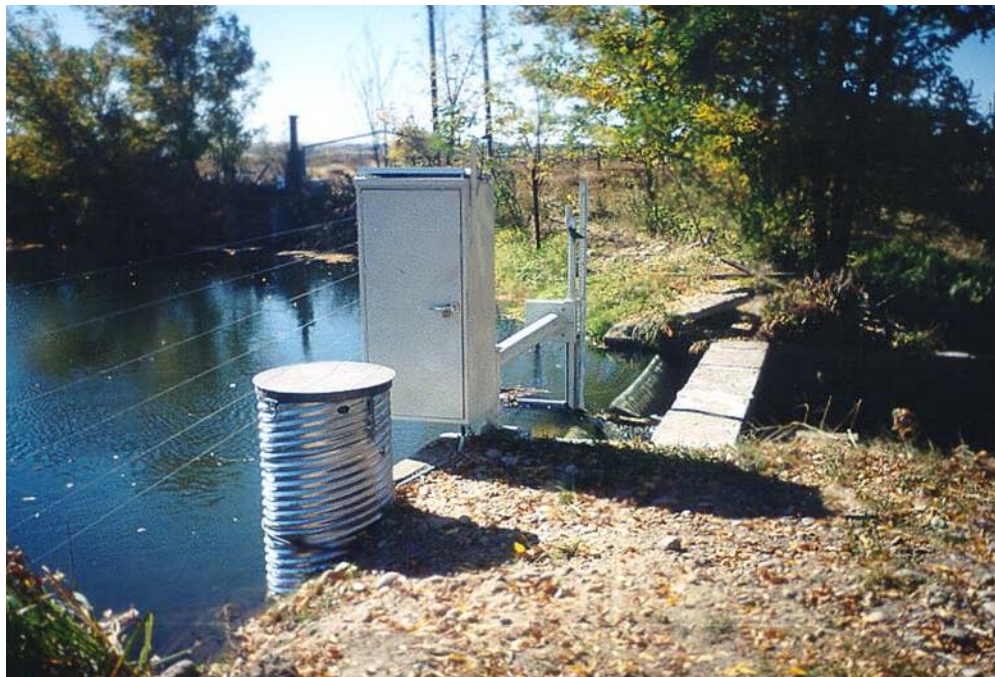
Figure 8. Langemann Gate at the last diversion on the Seven Mile Slough.

These projects significantly enhanced the efficiency of the operations by reducing flow fluctuations and operational spills (Figure 9). The work done on the Seven Mile Slough demonstrated how relatively simple and inexpensive technologies could be used to improve water management in the Payette Valley. It also demonstrated how multiple entities could pull together to accomplish common objectives.