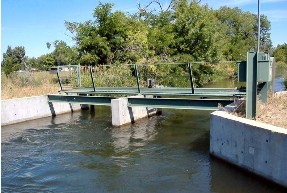
Figure 4. Automated check structure on the Farmers Cooperative Canal. Structure utilizes check boards (left) and automated overshoot gate (right) to control water levels.

Water measurement and accounting improvements – Idaho water laws require that all irrigation diversions must have some type of measurement to allow the Department of Water Resources monitor water use and assure compliance with state water rights. The state watermaster for each river basin is charged with measuring and recording water use data to determine an accurate accounting of irrigation diversions. Most of the Payette diversions were originally measured using rated canal sections which needed frequent calibration to maintain accuracy. Typically, the watermaster would only be able to visit each site once or twice a week to measure and record flows. In order to provide more accurate measurement of their diversions, several canal companies in the basin have replaced existing rated sections with ramp flumes. Since 1998, nine rated sections, ranging in capacity from 3 to 300 cfs, have been replaced by ramp flumes. At several sites, flow data from recently constructed ramp flumes is used as input for automated diversions.