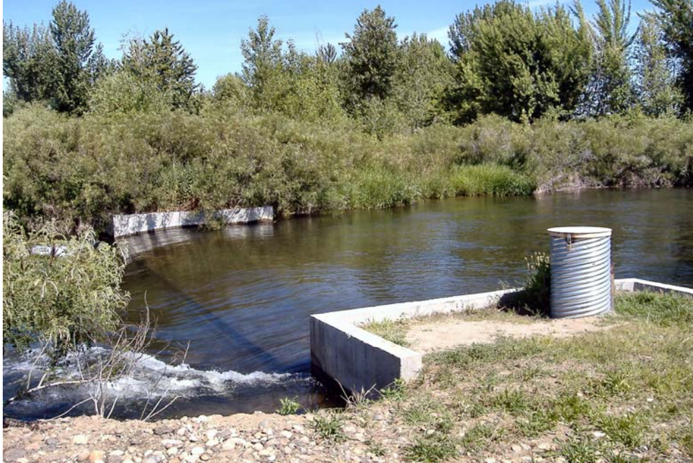
Figure 7. Ramp flume at the head of the Seven Mile Slough