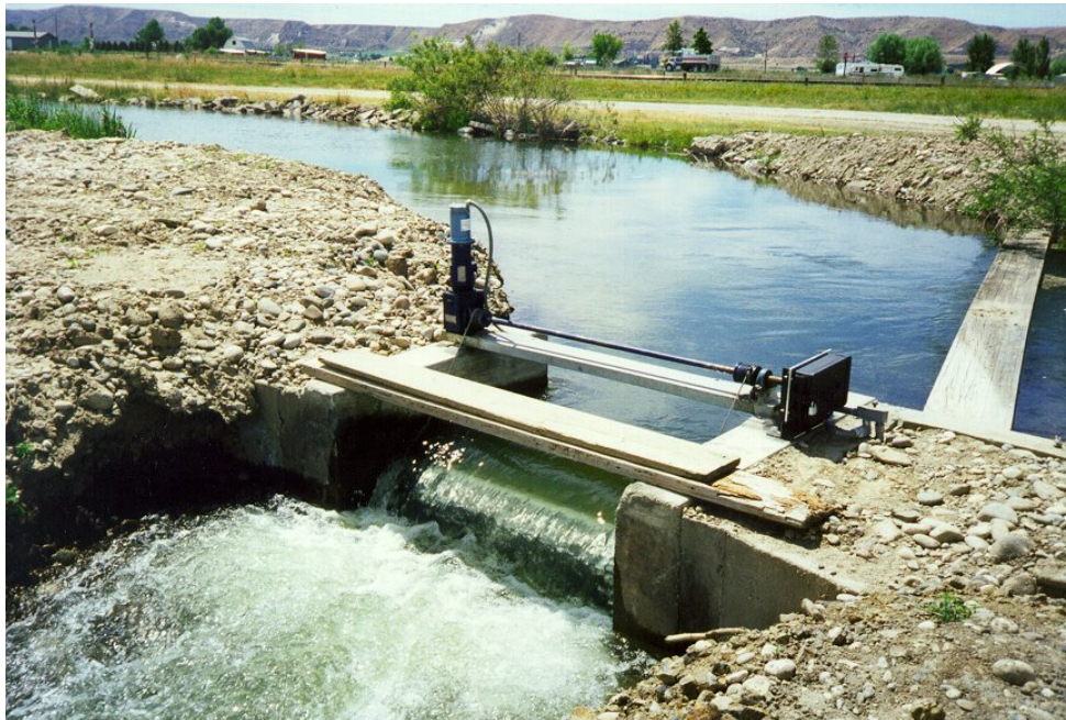
Figure 3. Automated Armtec gate regulates the Reed Ditch diversion

The success of the Squeeze Gate project led to other similar projects in the Payette Valley. Prior to the 1998 irrigation season, the Reed Ditch constructed a ramp flume at the head of its 50-cfs canal and replaced a check board regulating structure with an automated Armtec overshot gate (Figure 3). This site also used a CR10 controller but utilized analog cellular telephone telemetry. Also, following the 1998 season, the Lake Reservoir Company used the same technology to facilitate remote operation of three 12-ft wide radial gates at Lardo Dam in McCall, Idaho. This site, which regulates the outlet of Payette Lake, is approximately 100 miles from the Company's office in Payette, ID.