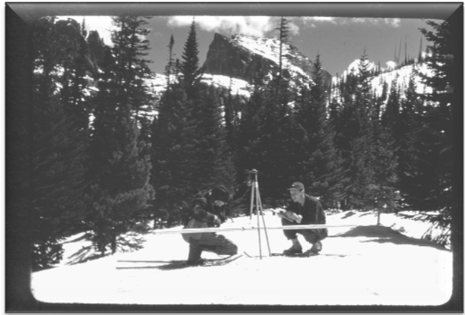
Ralph Parshall and Paul Ginter sampling snow, Bear Lake, Estes Park.

The compilation of this bibliography began by selecting subject headings for the widest possible range of water topics. These headings were taken from the Library of Congress Subject Headings list, which is used for book cataloging by libraries. Since the intent was to search a library database, it only made sense to use terms which matched the cataloging records. The resulting list ran to approximately 250 terms which were used in searching, combined with a truncated form of "Colorado" (Colo*) in order to limit results more specifically to the topic. An additional list of approximately 120 geographic or proper names (individuals and organizations) was also used.