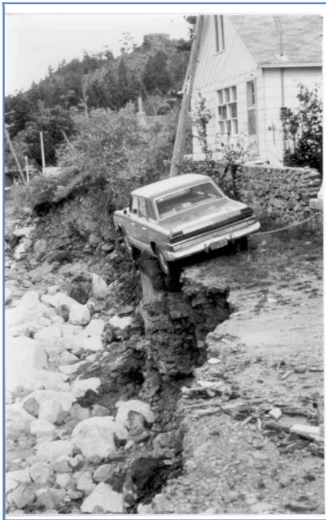
Damage caused by July 1976 flood of Big Thompson Canyon.