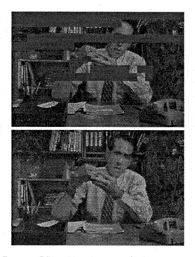
Figure 3: Effect of lost ATM cells (top) and motioncompensated reconstruction from adjacent frames (bottom).

and analyze such cardiac video sequences.